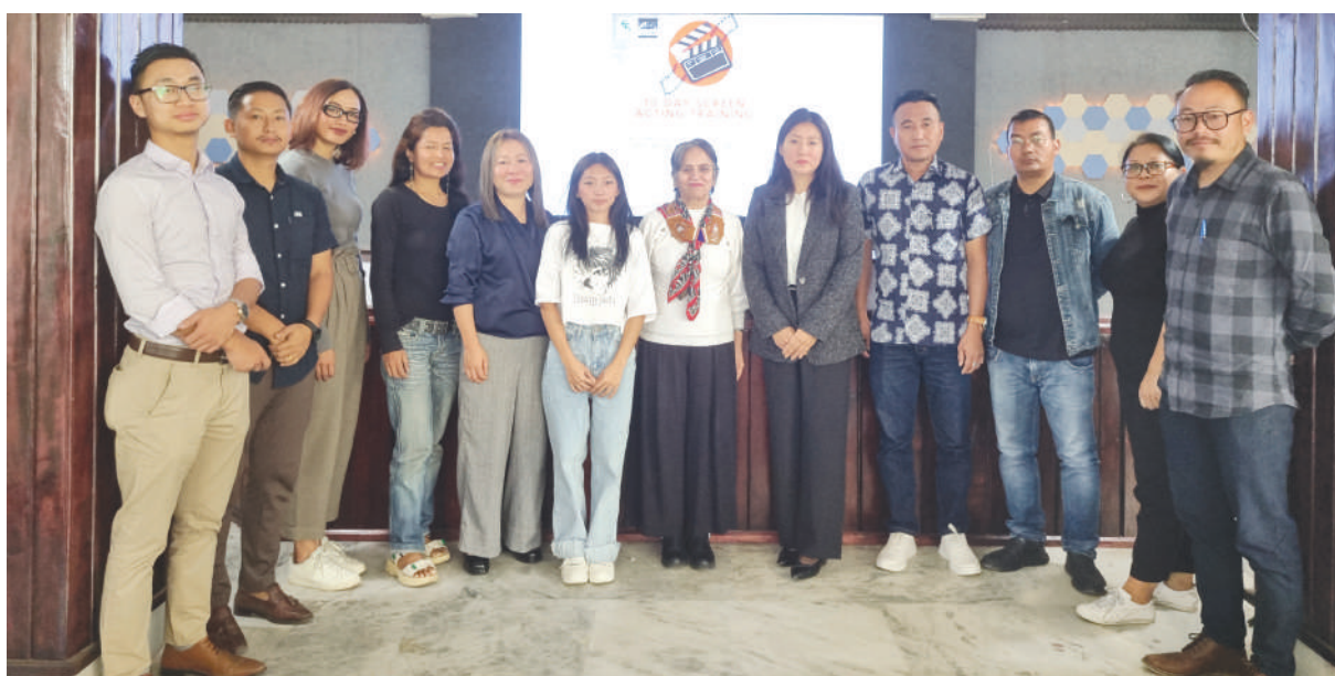
The Department in collaboration with the Film & Television Institute of India (FTII) conducted a free of cost 10 Day training in Screen Acting from 30 th October - 10 th November 2023, as part of the Azadi Ka Amrit Mahotsav. The Department also organized the 4 th Nagaland Film Festival under the theme "Frames of Harmony" in collaboration with FAN and the Ministry of Information & Broadcasting, Government of India on 7 th and 8 th December 2023 at RCEMPA, Jotsoma. Films from Nagaland, the North East, the rest of India and countries including Germany, France and Sri Lanka were screened.