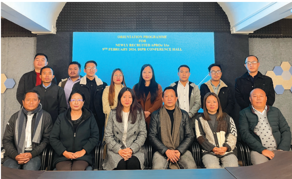
Orientation Programme for newly recruited APROs/IAs at DIPR Conference Hall on 9 th February 2024.