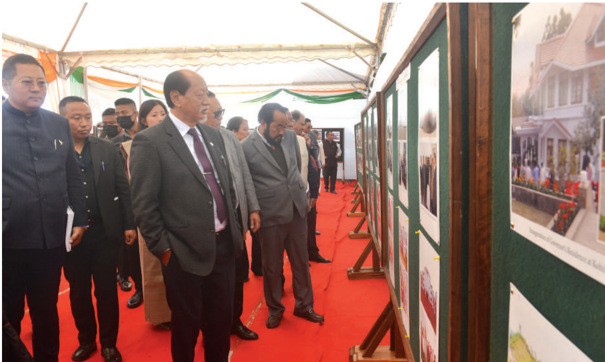
Chief Minister, Nagaland Neiphiu Rio witnessing the Photography Exhibition organized by the Department of Information & Public Relations on the theme "Nagaland at 60" during the Statehood Day 2023.