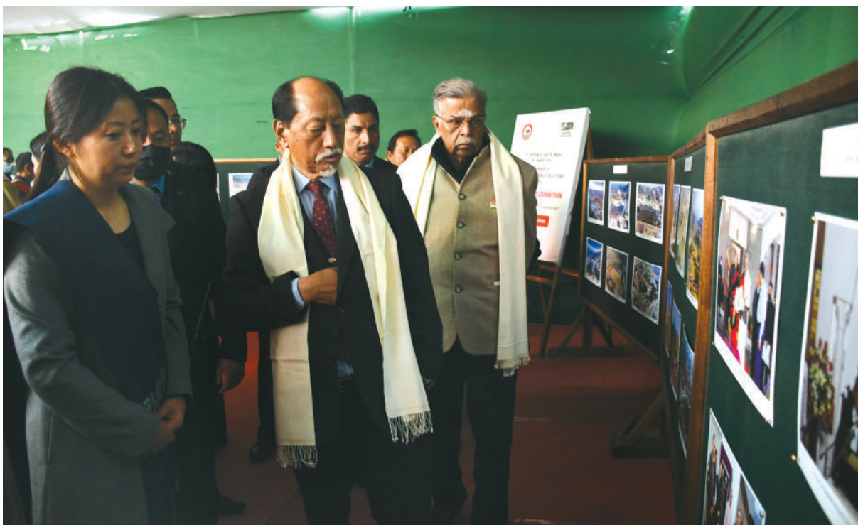
Governor, Nagaland, La. Ganesan, Chief Minister, Neiphiu Rio visiting the Photography Exhibition organized by the Department of Information & Public Relations on the theme "Journey of Nagaland through the lens" during the Republic Day 2024.