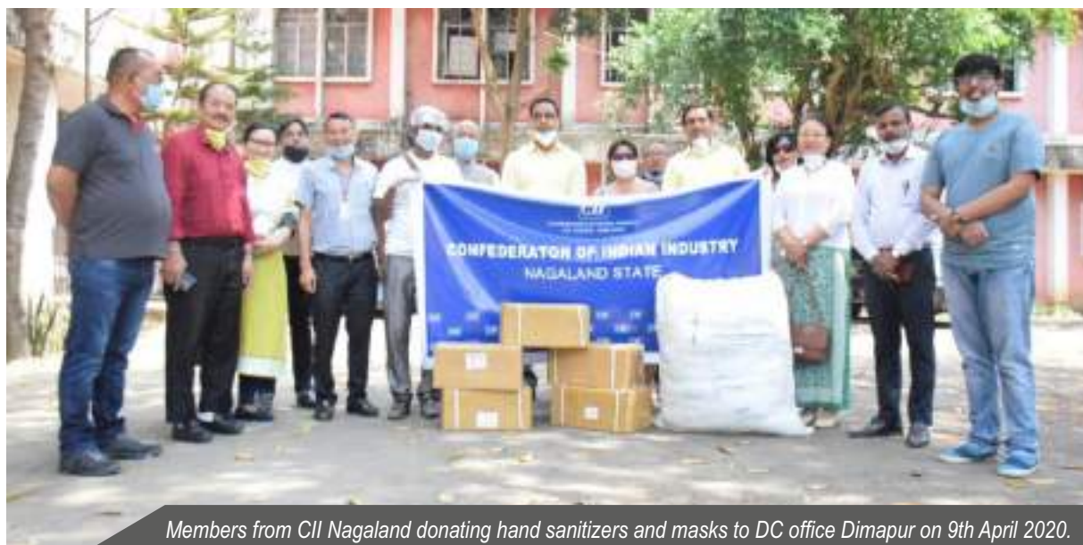
Members from CII Nagaland donating hand sanitizers and masks to DC office Dimapur on 9th April 2020.