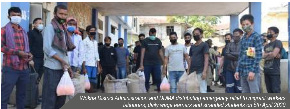
Wokha District Administration and DDMA distributing emergency relief to migrant workers, labourers, daily wage earners and stranded students on 5th April 2020.

Wokha District Administration and Disaster Management Authority (DDMA), distributed emergency relief like rice and pulses to migrant workers/labourers, and daily wage earners whose livelihood income have been affected by the lockdown in the wake of the COVID-19 outbreak.