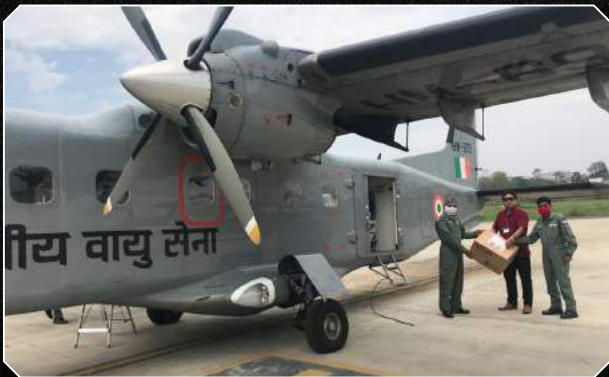
IAF officials handing over Rapid Testing Kits to District Nodal Officer for Covid-19 Dimapur at Dimapur Airport on 19th April 2020.