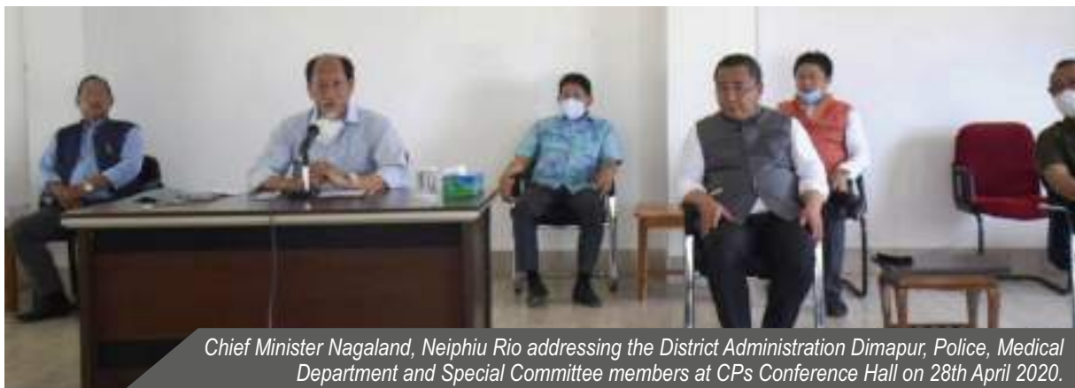
Chief Minister Nagaland, Neiphiu Rio addressing the District Administration Dimapur, Police, Medical Department and Special Committee members at CPs Conference Hall on 28th April 2020.

The NMC is committed to extend all support to the Government in this fight against the Covid-19 and looking forward for more participation.