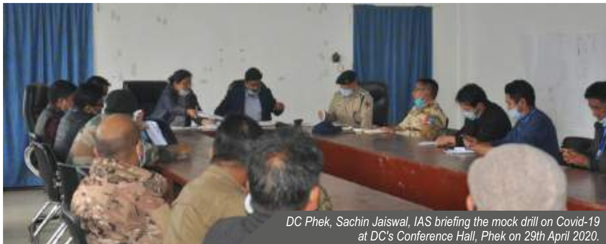
DC Phek, Sachin Jaiswal, IAS briefing the mock drill on Covid-19 at DC's Conference Hall, Phek on 29th April 2020.