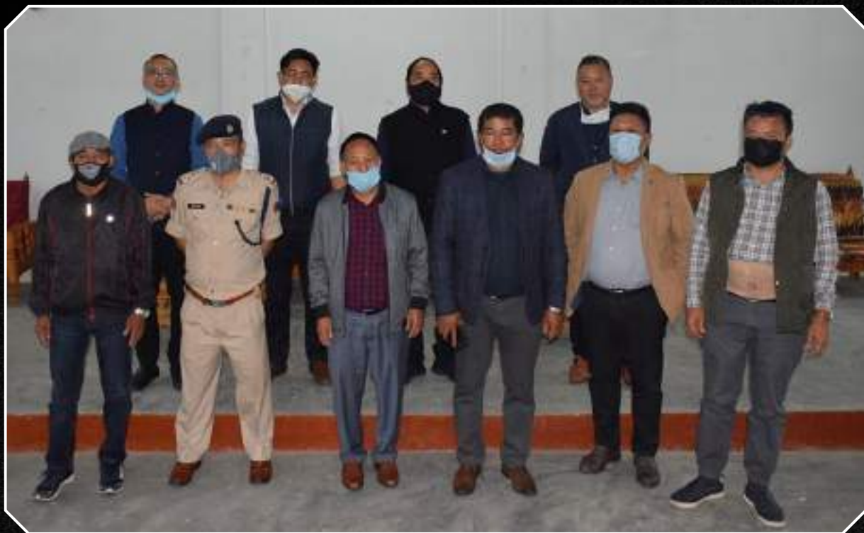
Legislators from Wokha district led by Dy. Chief Minister, Home, Road & Bridges, Y. Patton visited Ralan area to check the preparedness level on 25th April 2020.