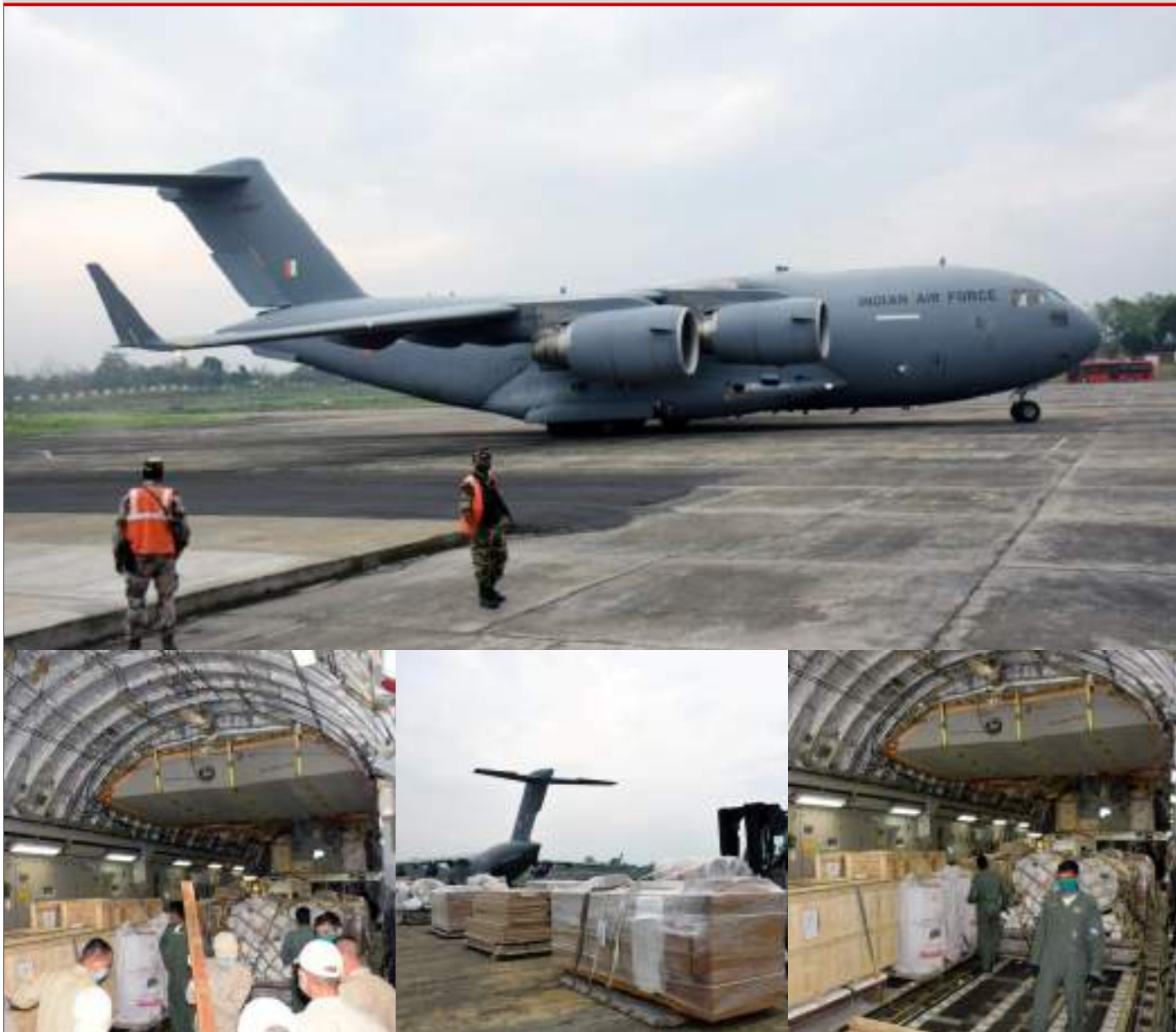
Equipment for setting up BSL-3 at NHAK Kohima arrives at Dimapur Airport by a special flight of IAF C-17 Globemaster on 16th April 2020.