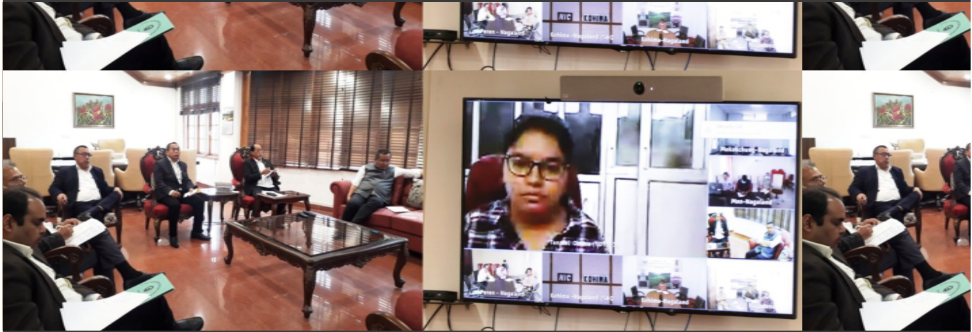
CM Nagaland, Neiphiu Rio, Cabinet Ministers and other senior government officials interacting with DCs, SPs and CMOs in the districts with regard to Covid-19 through Video Conferencing at CM's Official Residence on 2nd April 2020.