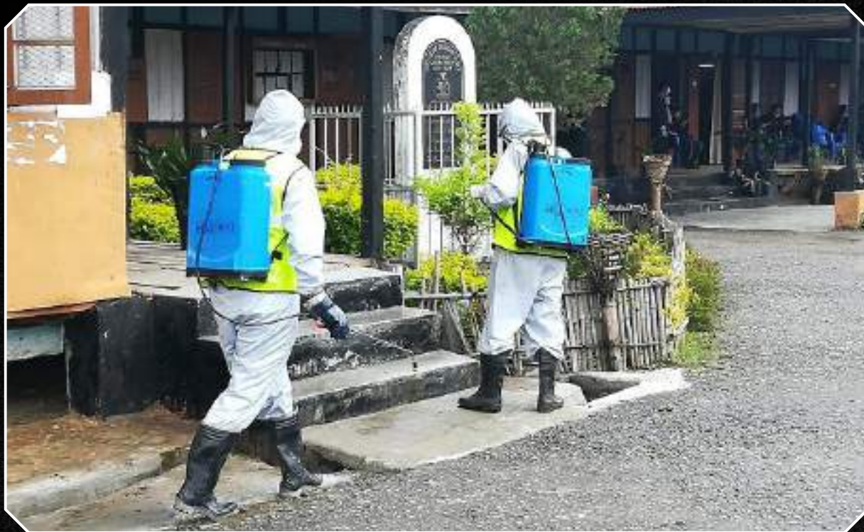
With the initiative of the Tuensang Town Council (TTC), sanitation workers spraying and sanitizing the town area due to Covid-19 pandemic.