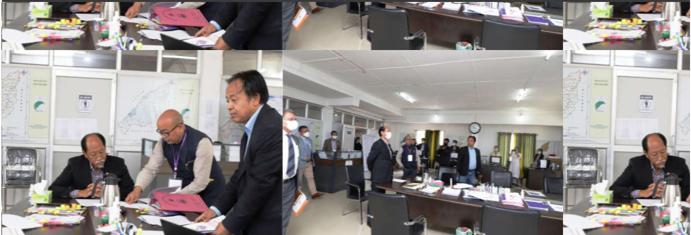
CM Nagaland, Neiphiu Rio visiting State Level Control Centre at Lotha Hoho building, Kezieke, Kohima on 6th April 2020 to see himself the State Level Monitoring Mechanism in the fight against Covid-19 pandemic in the state.