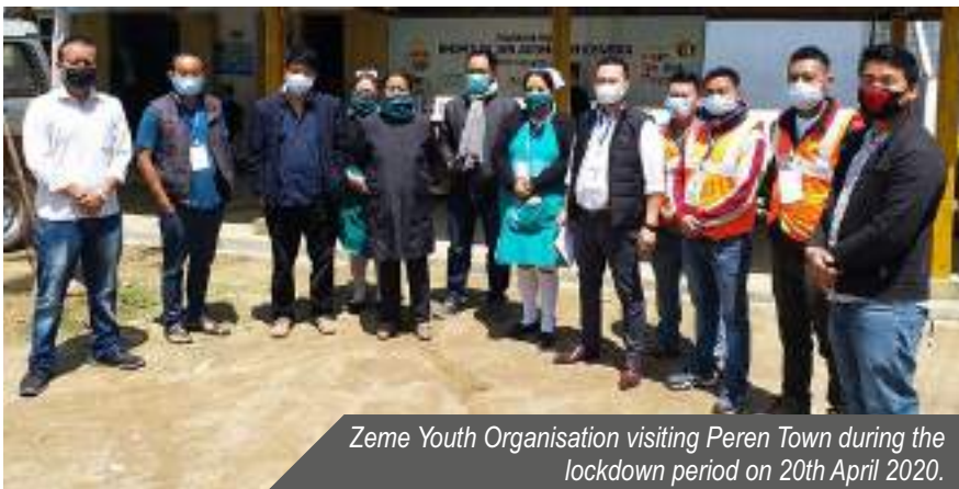
Zeme Youth Organisation visiting Peren Town during the lockdown period on 20th April 2020.