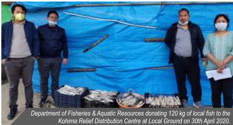
Department of Fisheries & Aquatic Resources donating 120 kg of local fish to the Kohima Relief Distribution Centre at Local Ground on 30th April 2020.

a press release stating the decision of the State Government to ban import of pigs from outside the state in view of the reported