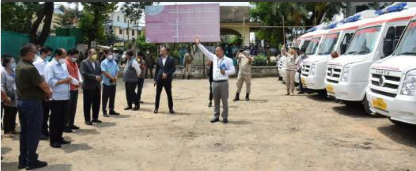
Chaplain District Hospital Dimapur, Y. Thong offering a dedicatory prayer for the 10 Ambulances in the presence of Chief Minister Nagaland, Neiphiu Rio at Dimapur District Hospital premises on 28th April 2020.