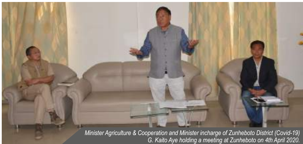
Minister Agriculture & Cooperation and Minister incharge of Zunheboto District (Covid-19) G. Kaito Aye holding a meeting at Zunheboto on 4th April 2020.

The Home department, NSDMA has informed that activities related to agriculture have been allowed inspite of lockdown, keeping in view of the harvesting and sowing season.