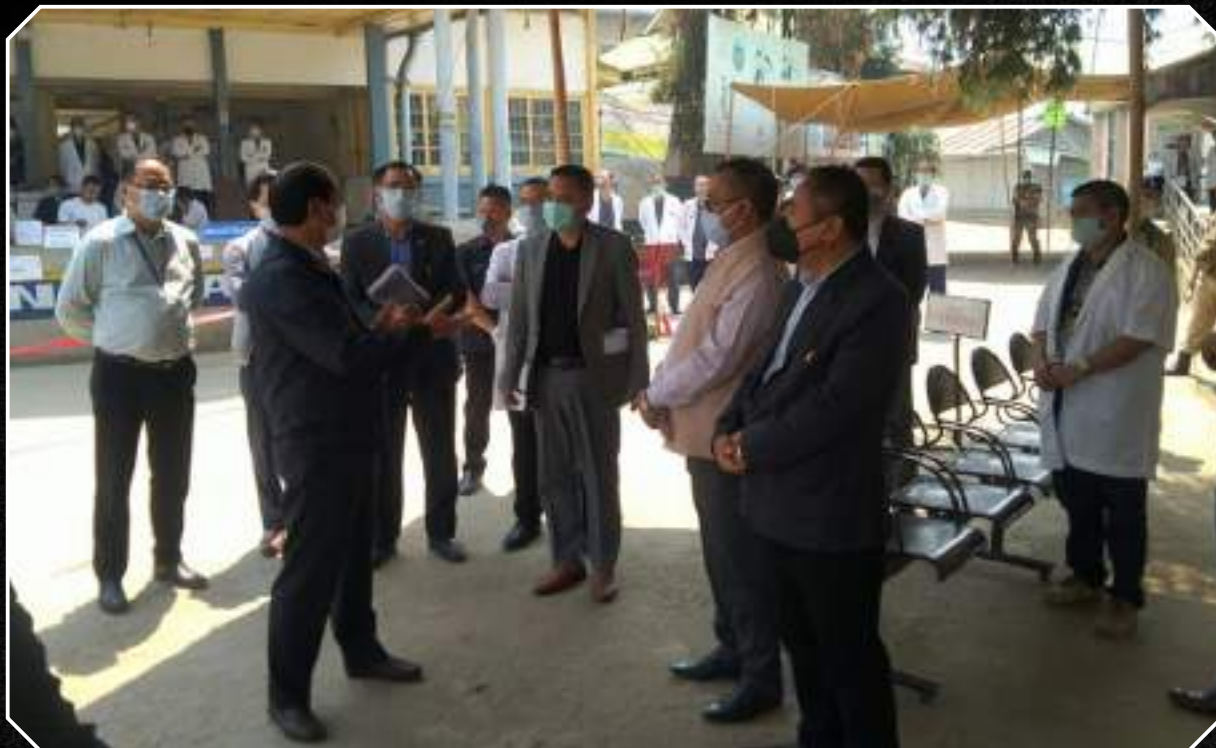
CM Nagaland, Neiphiu Rio and his cabinet colleagues interacting with the officials of NHAK on their visit to NHAK on 1st April 2020.