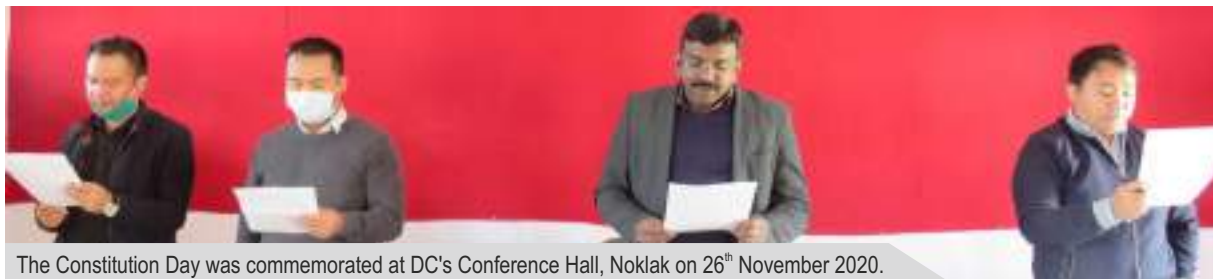
The Constitution Day was commemorated at DC's Conference Hall, Noklak on 26 th November 2020.