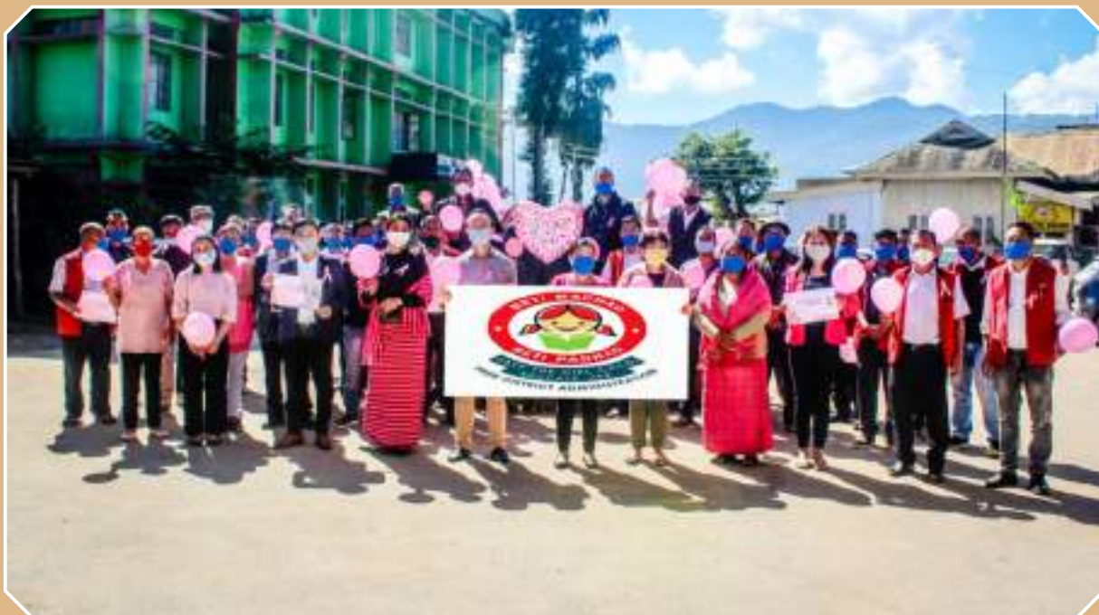
The District Administration and District Level Centre for Women - Mahila Shakti Kendra (Beti Bachao Beti Padhao), Phek observed Breast Cancer Awareness month starting from first week of October to 31 st October 2020 at Phek.