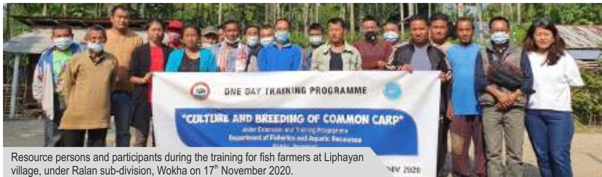
Resource persons and participants during the training for fish farmers at Liphayan village, under Ralan sub-division, Wokha on 17 th November 2020.

The Department of Fisheries & Aquatic Resources, Wokha organised a one day training for