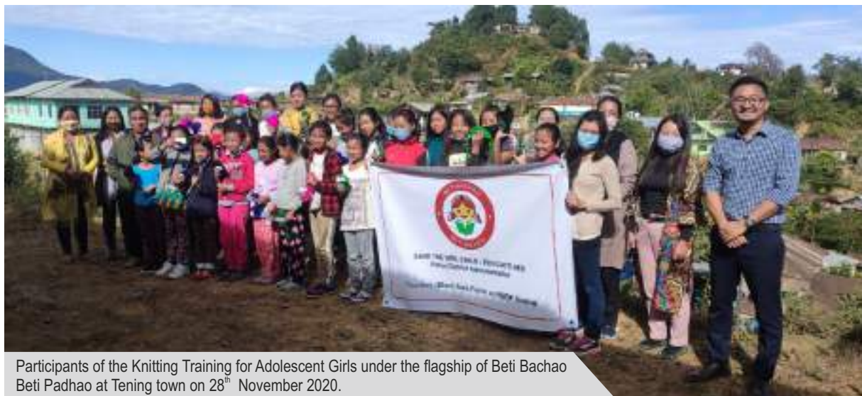
Participants of the Knitting Training for Adolescent Girls under the flagship of Beti Bachao Beti Padhao at Tening town on 28 th November 2020.

Free Knitting Training for Adolescent Girls under the flagship of Beti Bachao Beti Padhao which was held for three days for adolescent girls in Tening town, concluded on 28 th November 2020.