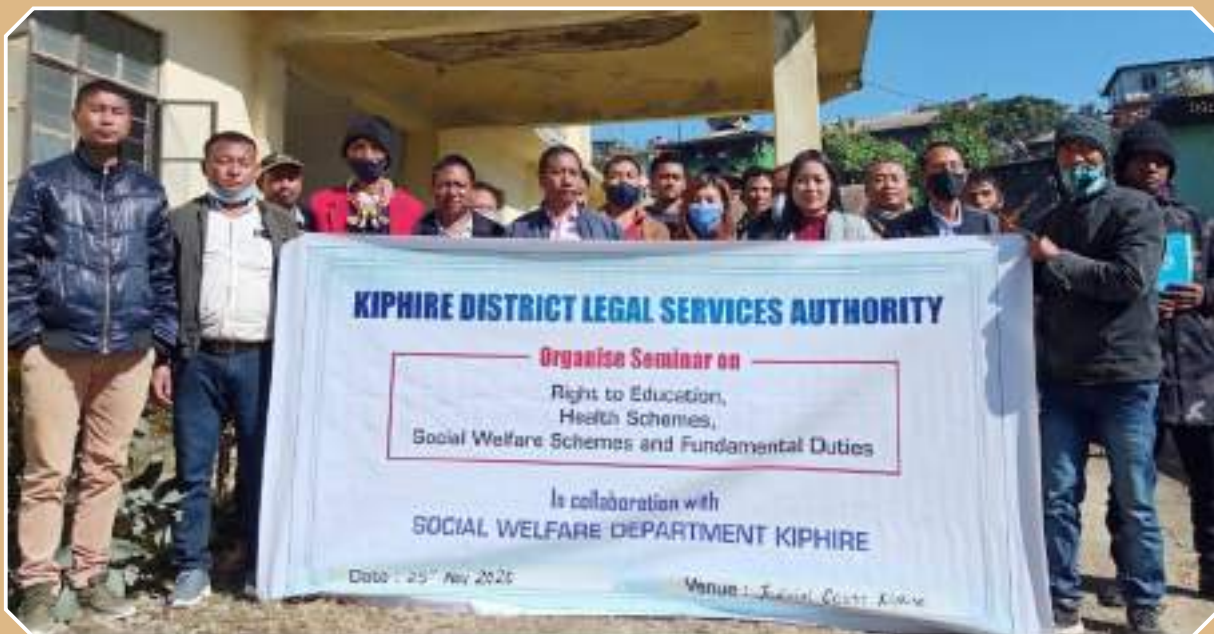
Kiphire District Legal Service Authority organised a legal seminar in collaboration with the Social Welfare Department at Kiphire on 25 th November 2020.