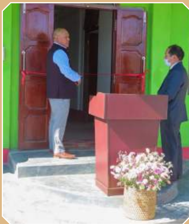
Minister, Soil & Water Conservation and Geology & Mining, V. Kashiho Sangtam inaugurating the new Sub-Divisional Officer's Office, Department of Soil & Water Conservation at Chiephobozou on 13 th November 2020.