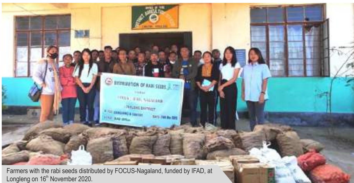
Farmers with the rabi seeds distributed by FOCUS-Nagaland, funded by IFAD, at Longleng on 16 th November 2020.

Fostering Climate Resilient Upland Farming System in Northeast-Nagaland (FOCUS-Nagaland), funded by IFAD, distributed Rabi seeds to all 30 project villages under Longleng district from 16 th to 17 th November 2020.