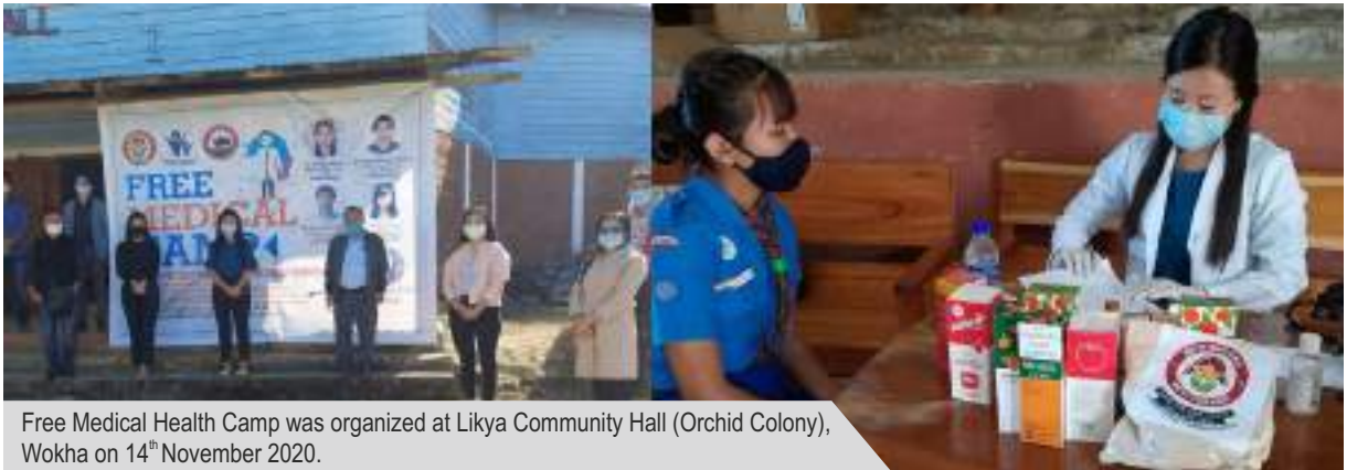
Free Medical Health Camp was organized at Likya Community Hall (Orchid Colony), Wokha on 14 th November 2020.