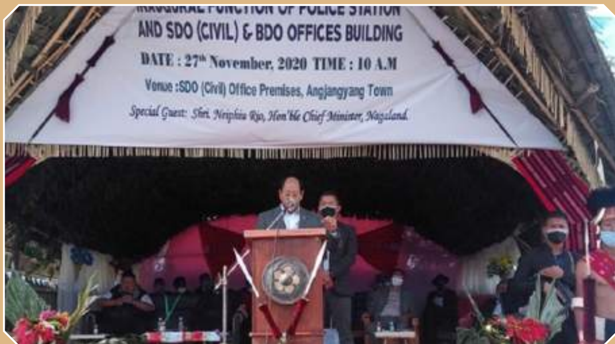
Chief Minister, Neiphiu Rio addressing the gathering at the inaugural function of the Police Station, SDO(C) and BDO Office buildings at Angjanyang on 27 th November 2020.