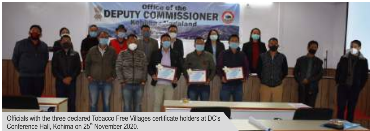
Officials with the three declared Tobacco Free Villages certificate holders at DC's Conference Hall, Kohima on 25 th November 2020.

town and GBs, Village Council Chairman and members from Thonoknyu village, UBI, ISI, Hangbe Noklak and Mb/Sub KB Chlemi, Assam Rifles, Kiphire.