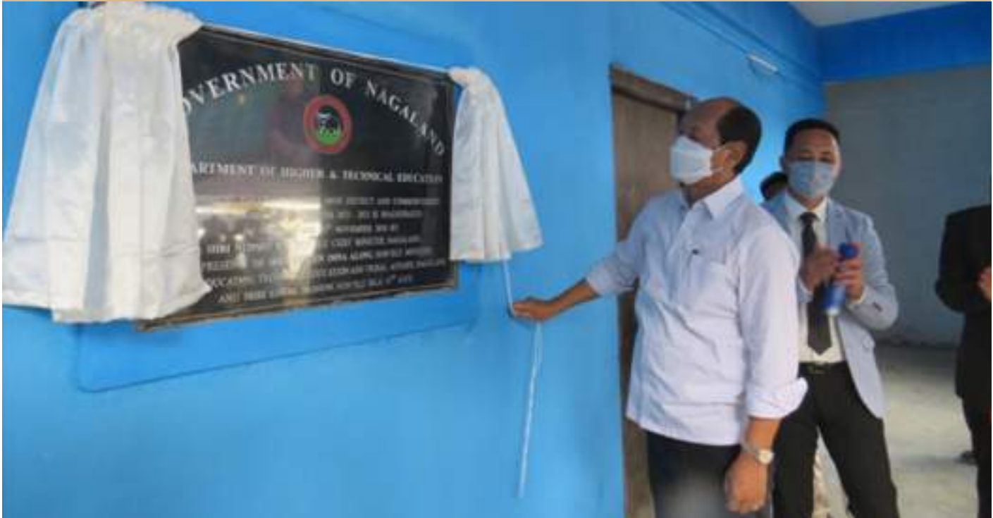
Chief Minister, Neiphiu Rio unveiling the plaque of the State Polytechnic Institute at Aboi on 27 th November 2020.