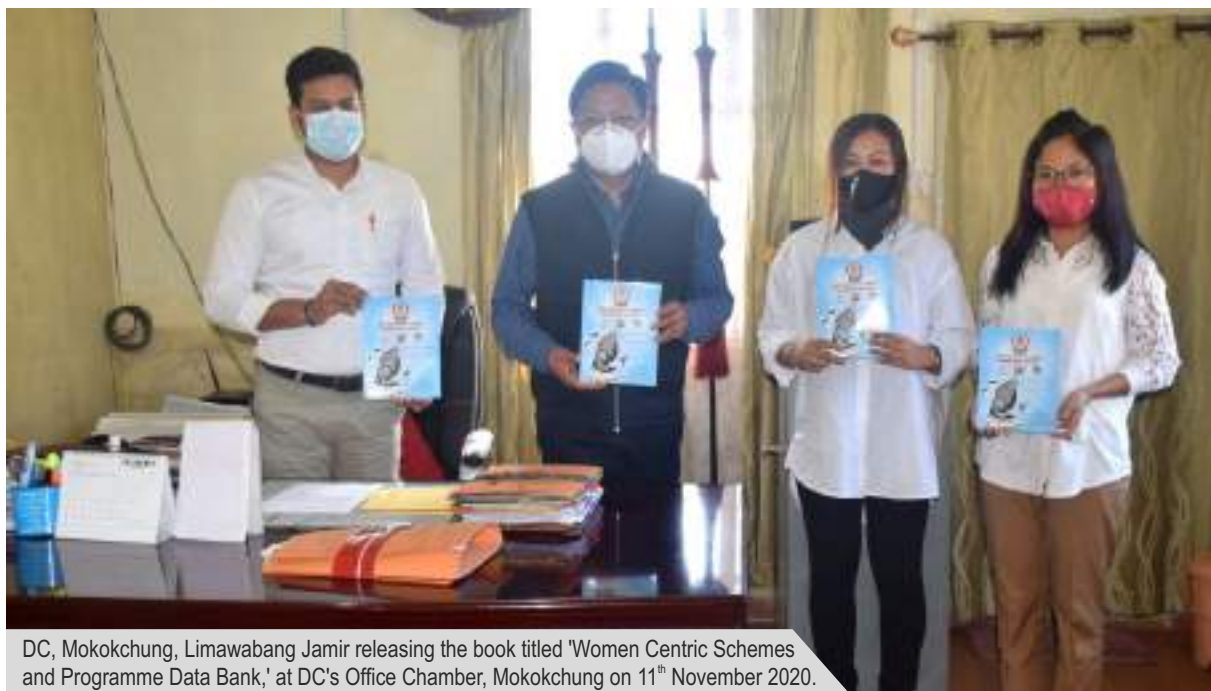
DC, Mokokchung, Limawabang Jamir releasing the book titled 'Women Centric Schemes and Programme Data Bank,' at DC's Office Chamber, Mokokchung on 11 th November 2020.

Deputy Commissioner, Mokokchung, Limawabang Jamir on 11 th November 2020 released a book titled 'Women Centric Schemes and Programmes Data Bank,' a compilation of women related schemes in Nagaland. The book