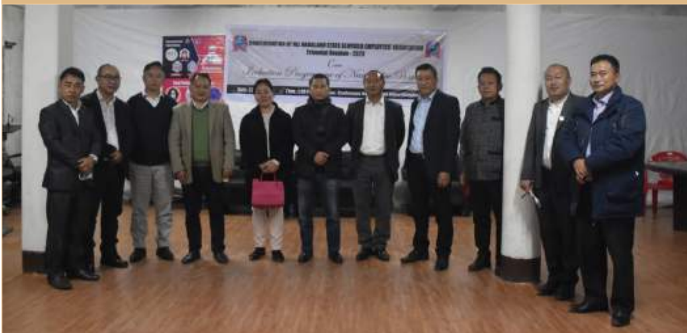
The newly selected CANSSEA office bearers for the tenure 2020-2023 along with members of Search Committee during its Triennial Session 2020 at the CANSSEA's Conference Hall, Themezie, Kohima on 27 th November 2020.