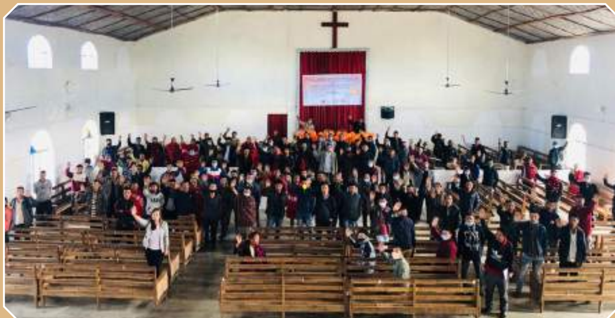
Participants during the awareness programme on International Day for Elimination of Violence Against Women at Bhumnyu Baptist Church, Longleng on 28 th November 2020.