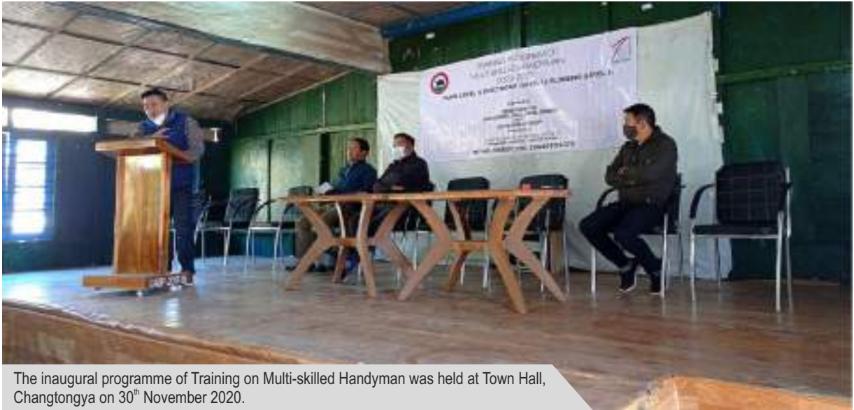
The inaugural programme of Training on Multi-skilled Handyman was held at Town Hall, Changtongya on 30 th November 2020.

Multi-skill training in tilling, as electrician and in plumbing (Level-1), organised by the Department of Employment, Skill Development & Entrepreneurship in collaboration with Zynorigue Initiative Society was inaugurated on 30 th November 2020 at Town Hall, Changtongya town.