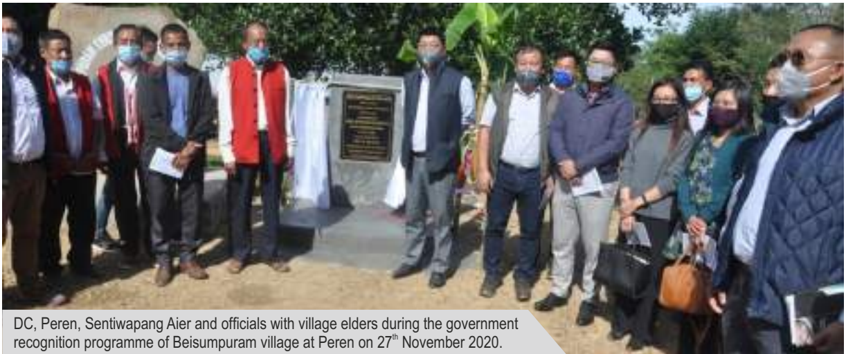
DC, Peren, Sentiwapang Aier and officials with village elders during the government recognition programme of Beisumpuram village at Peren on 27 th November 2020.

Beisumpuiram village under Ahthibung Sub-Division, Peren held a programme on 27 th November 2020 to mark the Government's recognition of the village, with Deputy Commissioner (DC), Peren, Sentiwapang Aier as the Special Guest.