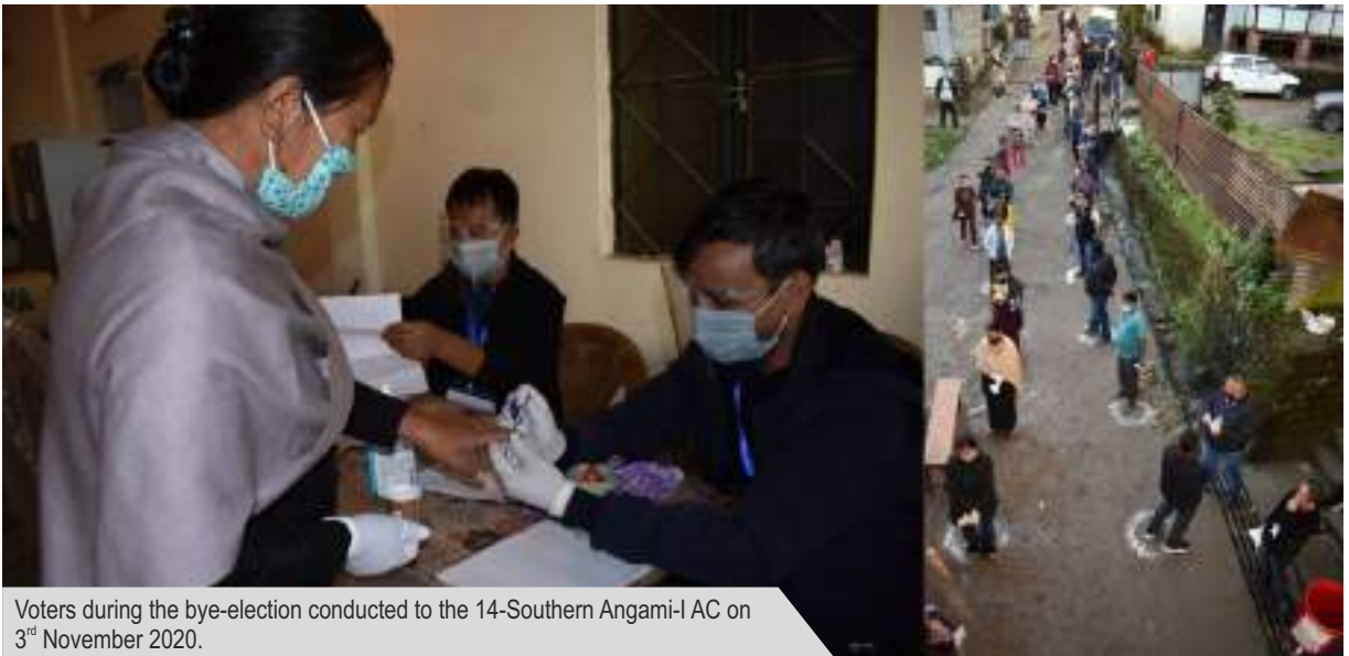
Voters during the bye-election conducted to the 14-Southern Angami-I AC on 3 rd November 2020.

A total of 62,307 samples have been sent for testing through RT-PCR and results of 60,941 samples have been received. In addition, a total of 33,723 samples have been sent for testing on TrueNat and results of 33,690 samples have been received. Through Rapid Antigen Test, 3,944 samples have been tested.