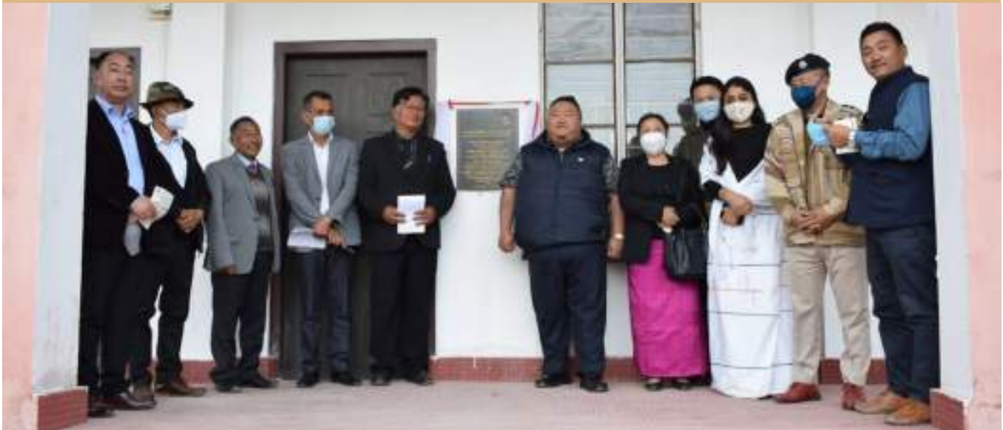
Minister for Higher Education, Technical Education and Tribal Affairs, Temjen Imna Along with Phek Government College officials and others during the inauguration of Phek Government College's Science Laboratory Building at Phek on 20 th November 2020.