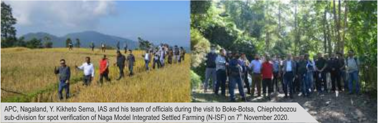
APC, Nagaland, Y. Kikheto Sema, IAS and his team of officials during the visit to Boke-Botsa, Chiephobozou sub-division for spot verification of Naga Model Integrated Settled Farming (N-ISF) on 7 th November 2020.

the traditional methods of jhum and terrace cultivation may not be economically viable nor ecologically sustainable, it cannot be stopped as it is being practiced since time immemorial. He stated that looking at the present situation of the world, there could be food pandemic sooner or later and hence, the need to prepare for self-sufficiency and for which Integrated Settled Farming is of utmost importance. The APC and the team also visited various fields and sites to get first-hand knowledge for taking up various initiatives.