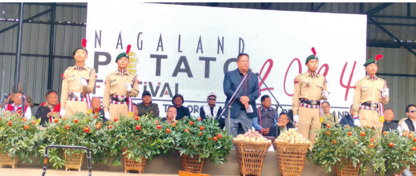
Commissioner of Police, Dimapur, Kevithuto Sophie, IPS speaking on the occasion of the first-ever Nagaland Potato Festival celebrated at Local Ground, Jakhama, Kohima on 10 th May 2024.