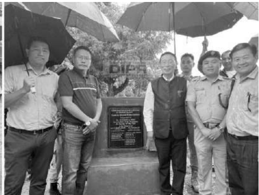
MLA, Dr. Sukhato A Sema along with ADC, Pughoboto and officials during the inauguration of Cement Concrete Road at Kitami village and Agri Link Road at Ghokimi village, Pughoboto on 18 th May 2024.