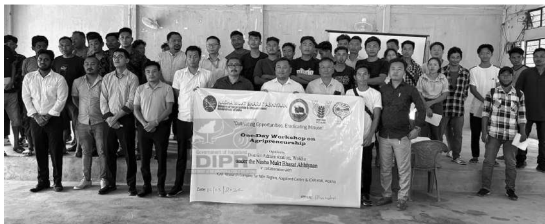
Officials along with the participants during the one day Agripreneurship workshop held at Bhandari Town Hall on 16 th May 2024.

The District Administration of Research Complex for NEH Region, Wokha under the Nasha Mukti Bharat Nagaland Centre and ICAR-KVK, Wokha Abhiyaan, in collaboration with the ICAR organized a successful one-day workshop on