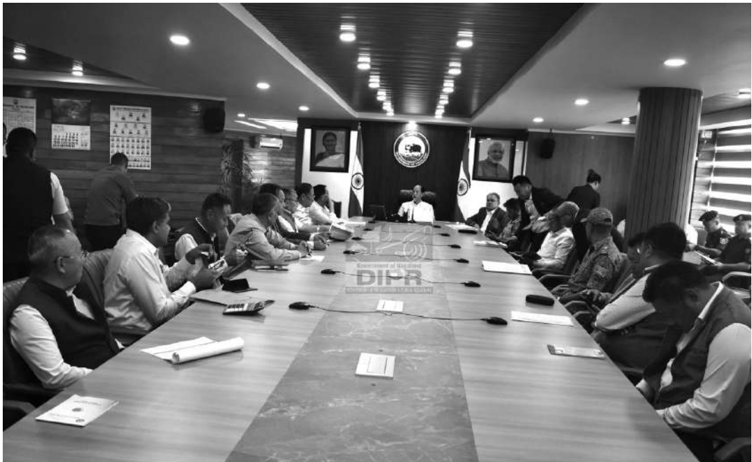
CM and Chairman NSDMA, Neiphiu Rio addressing the monsoon preparedness meeting held at CM's Secretariat, Kohima on 20 th May 2024.

on the need for funding for monsoon preparedness, Rio said that the State should provide some funds for emergency situations to the District Administration so that immediate reliefs can be given to those effected by monsoon related incidents and situations.