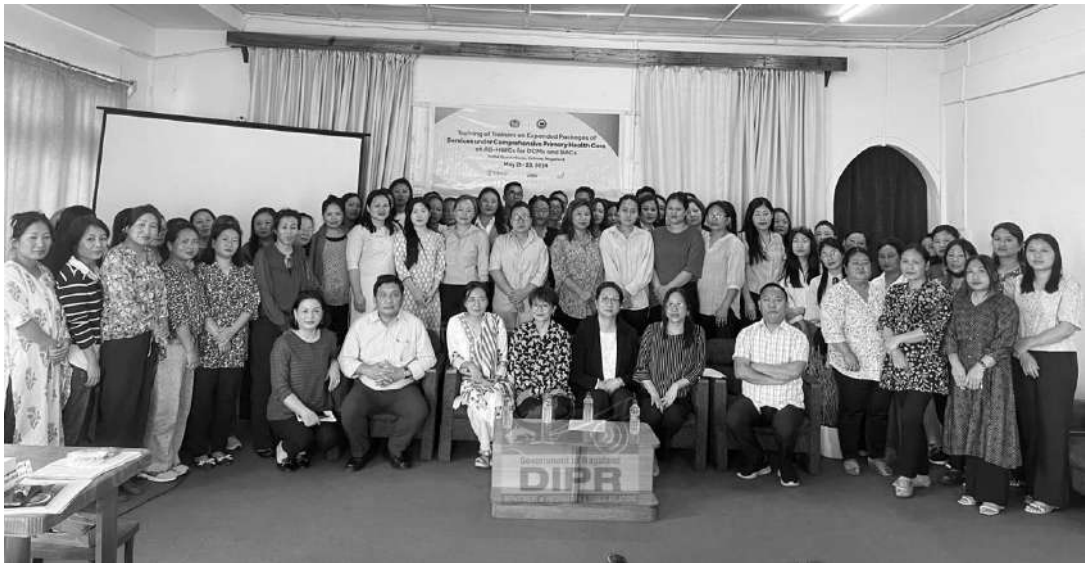
A three-day Training of Trainers of DCMs and BACs on Expanded Packages of Services was held at DUDA Guest House, Kohima on 21 st May 2024.

the additional extended packages of Non-Communicable Diseases, Oral health, ENT, Eye, Elderly Care, Palliatives Care, Mental