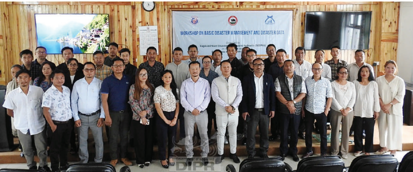
Two-day workshop on 'Basic Disaster Management and Disaster Data' was organised by the Nagaland State Disaster Management Authority, Home Department at the Directorate of Economics & Statistics, Kohima on 16 th May 2024.