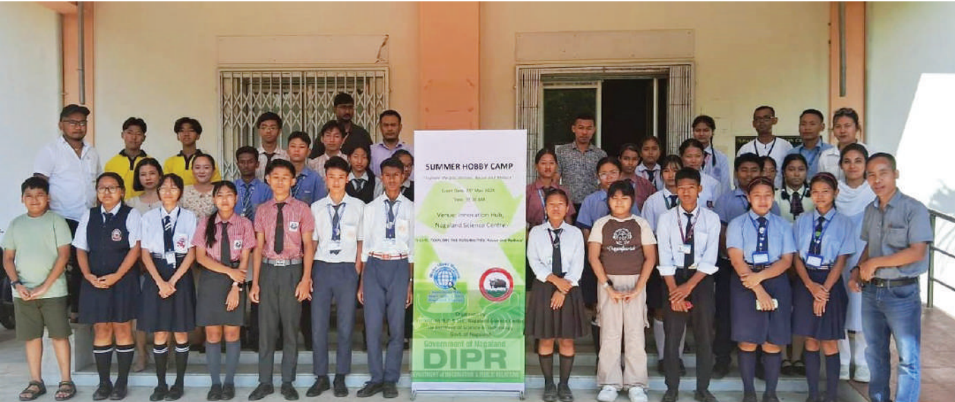
Innovation Hub & Space Education Centre, Nagaland Science Centre, Department of Science & Technology organised the Annual Hobby Camp at the Innovation Hub, Dimapur on 24 th May 2024.