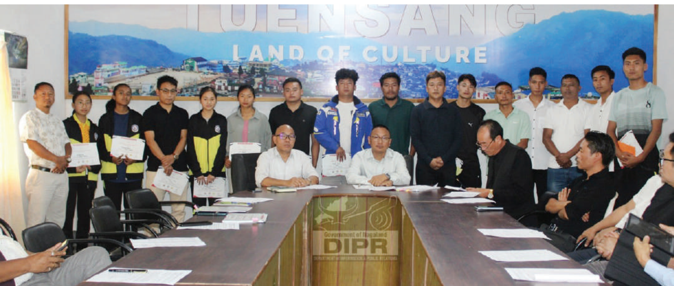
Athletes from Tuensang who participated in the Nagaland Olympic and Paralympic Games were felicitated during the Tuensang DPDB meeting at DC's Conference Hall, Tuensang on 14 th May 2024.