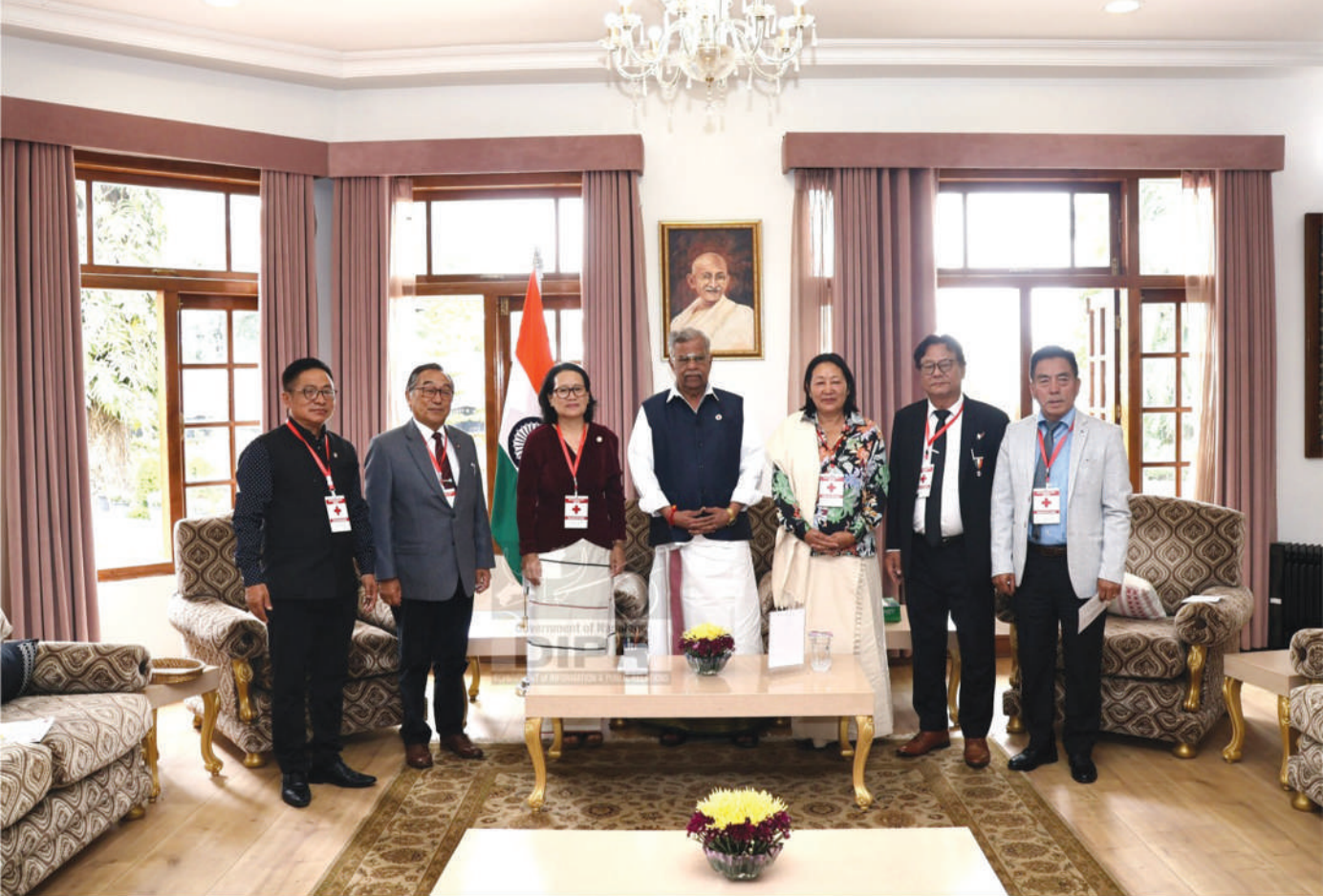
Governor, Nagaland, La Ganesan along with Managing Committee Members of the Indian Red Cross Society, Nagaland State Branch at Raj Bhavan, Kohima on 8 th May 2024.