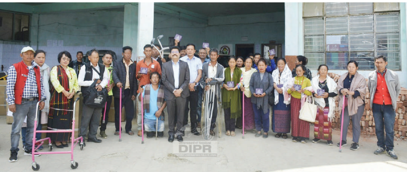
DC, Zunheboto distributed aids and appliances including wheelchairs, walking sticks etc. through the ADIP scheme under the Ministry of Social Justice & Empowerment at Zunheboto on 13 th May 2024.