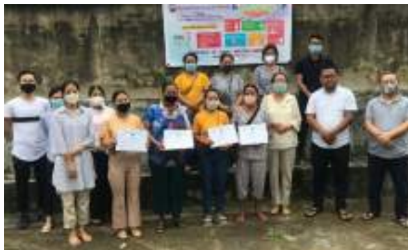
Officials and participants of the cooking competition held as part of Poshan Maah celebration on 15 th September 2020 at CDPO's Office, Medziphema.