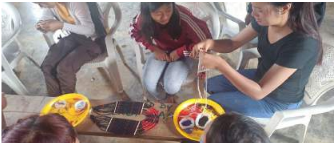
Training on Life Skill and Sustainable Livelihood held at EBRC Hall, Shamator.