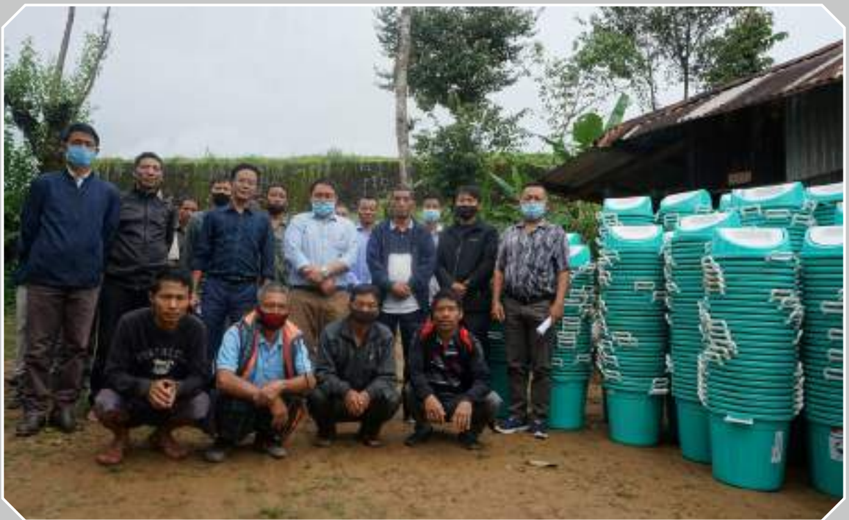
Dustbins were distributed to all the wards of Noklak town during a programme held by the Public Health Engineering (PHE) Department, Noklak at PHE Store, Noklak on 24 th September 2020.