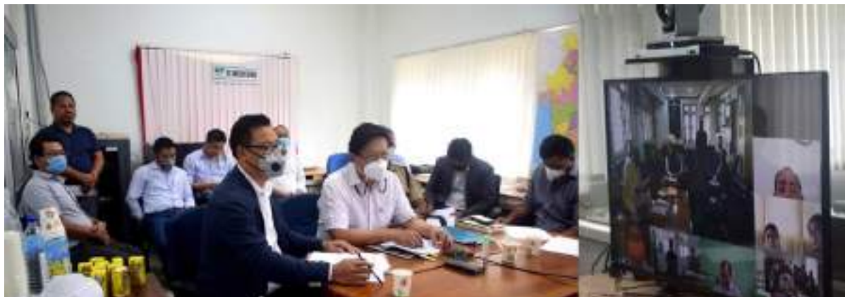
The Mokokchung District Planning & Development Board meeting was held on 22 nd September 2020 at NIC Conference Hall, Mokokchung.