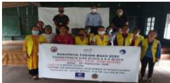
Officials and participants during the Poshan Maah celebration on 16 th September 2020 at Changtongya Town Hall.

Moanungsang BPM, NSRLM Changtongya RD Block spoke on the topic 'Development and maintenance of Kitchen Garden.' He highlighted on the need to develop and maintain kitchen garden in every household and its benefit in providing nutritious food for the family. In order to sustain the kitchen garden, the participants were also encouraged and motivated to maintain compost pit, both individual and collectively.