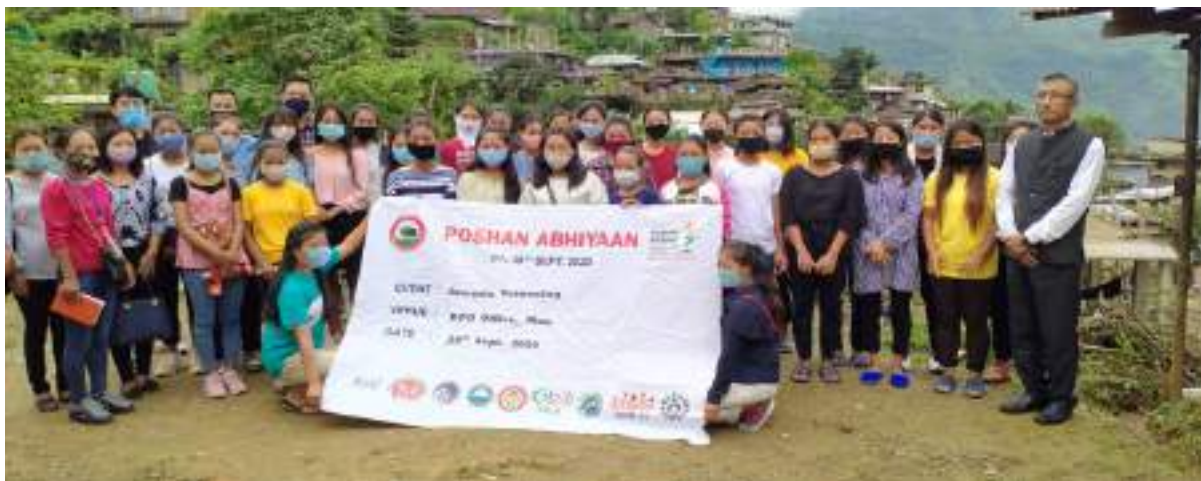
Anaemia Screening Camp organised by the Department of Social Welfare, Mon in collaboration with Health & Family Welfare Department was held on 28 th September 2020 at District Programme Officer's (ICDS) Office, Mon.