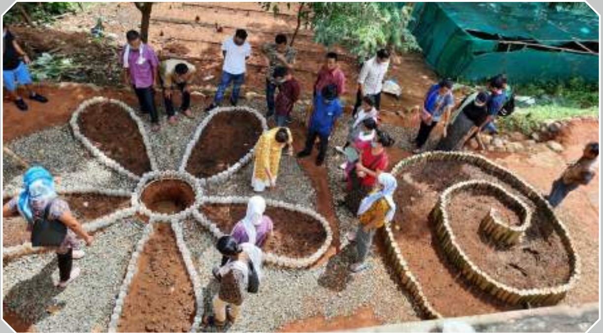
Officials of Department of Land Resources, Peren demonstrating permaculture garden design to farmers at Jalukie on 22 nd September 2020.