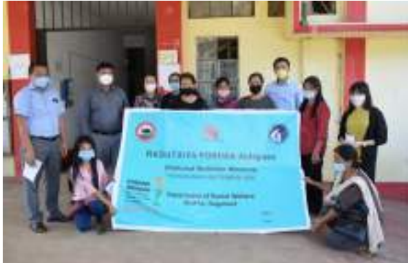
DC, Wokha, Orenthung Lotha and other officials launching Poshan Maah at Wokha on 1 st September 2020.

On 30 th September 2020, the monthlong programme of Poshan Maah 2020 culminated with a cooking competition conducted in collaboration with Wokha and Chukitong Block, Social Welfare Department at Blue Hill Colony, Wokha.