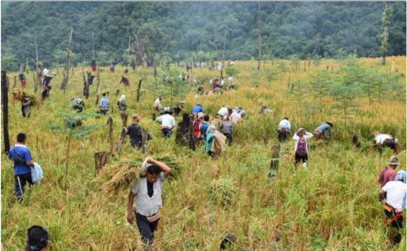
Longsa villagers participating in the 'Mera Nuja' hosted at Mokokchung district on 22 nd September 2020