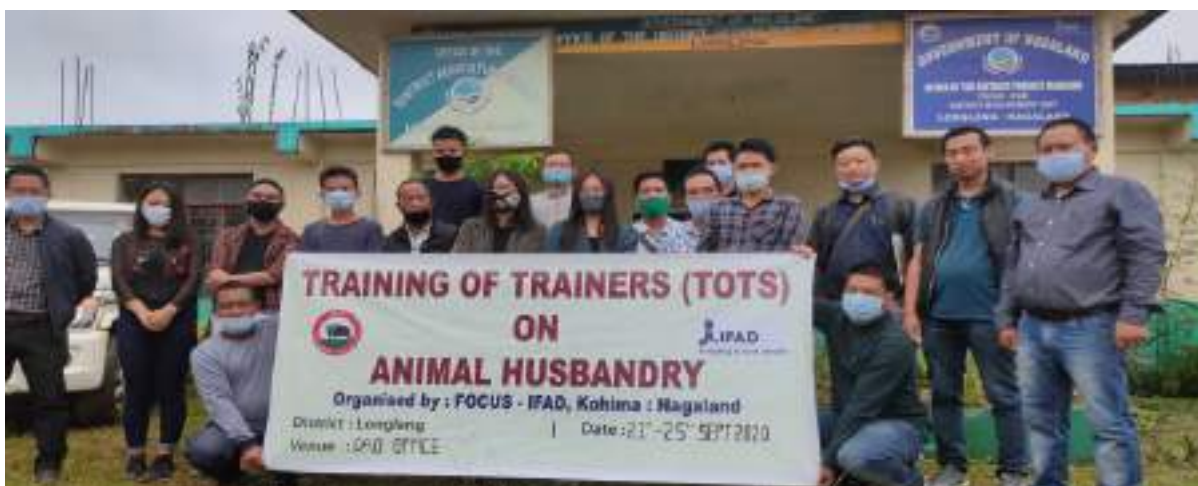
Participants during the Training of Trainers on Animal Husbandry held from 21 st to 25 th September 2020 at Longleng.

FOCUS-IFAD Project under Office of the District Agriculture Officer, Longleng held a training for Training of Trainers (TOT) on horticulture fruits, nuts/spices and animal husbandry at Longleng.