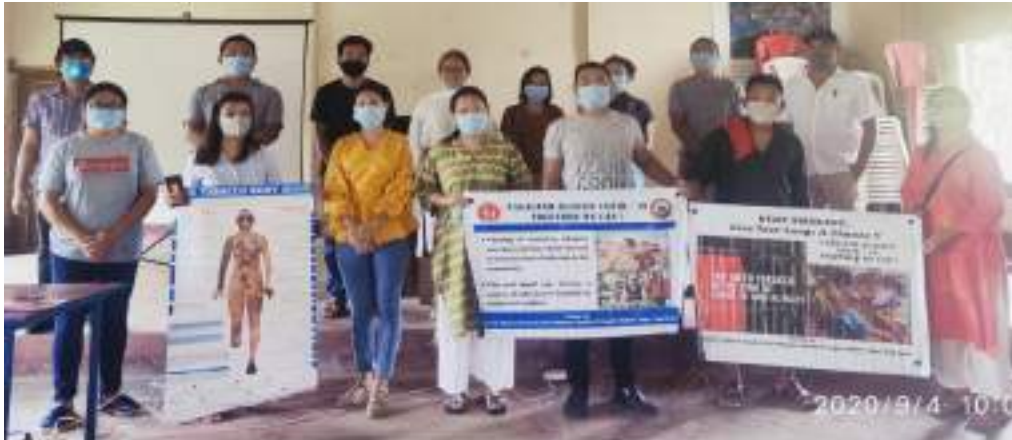
A Panchayati Raj initiative on 'Tobacco control in times of COVID-19 pandemic' was held on 4 th September 2020 at Panchayat Hall, Signal Angami village, Dimapur.