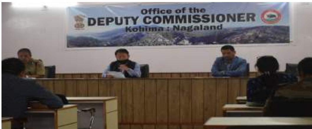
Minister, Mechanical and Housing, Tongpang Ozukum, Deputy Commissioner, Kohima, Gregory Thejawelie and Senior Superintendent of Police, Kohima, K. Sophie during the meeting of Kohima District Task Force on COVID-19 on 9 th September 2020 at DC's Conference Hall, Kohima.

Kohima District Task Force (DTF) on COVID-19 dwelled on the Unlock-4 guidelines issued by the Central and State Government for effective implementation in the district during its meeting held in Deputy Commissioner's (DC) Conference Hall, Kohima on 9 th September 2020.