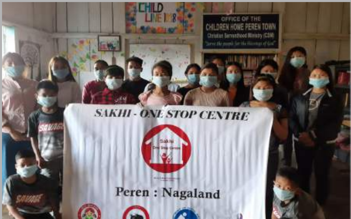
Sakhi-One Stop Centre (OSC) and Peren District Administration organised an awareness programme on 'Child Sexual Abuse and Personality Development' at Servanthood Ministry Children Home, Peren town on 19 th September 2020.