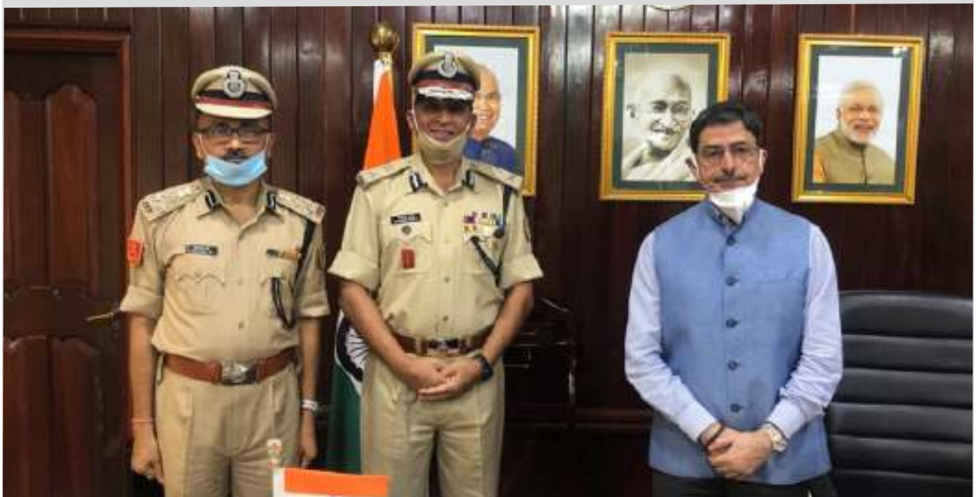
Randeep Datta, PMG, IGP, CRPF, Manipur and Nagaland Sector and Governor of Nagaland, R. N. Ravi during the former's visit to Kohima on 10 th September 2020.