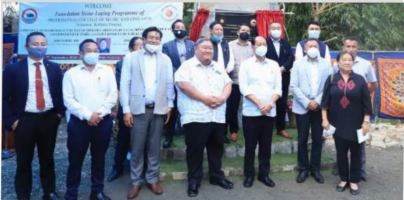
Chief Minister, Neiphiu Rio, his cabinet colleagues and officials during the foundation laying programme of Professional College of Music and Fine Arts at Tsiesema, Kohima on 7 th September 2020.