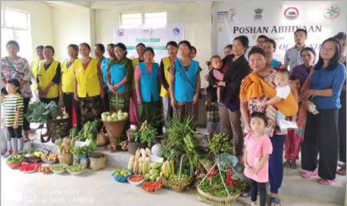
Nursing mothers, young children along with officials during the celebration of Poshan Maah from 1 st September 2020 to 30 th September 2020 under Pughoboto sub-division.