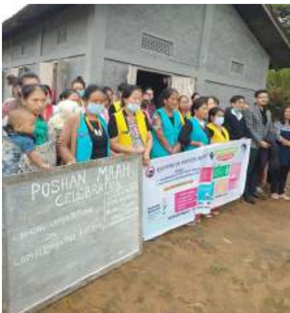
Cooking competition-cum-complementary feeding under Poshan Maah programme was held on 26 th September 2020 at Tening.

The cooking competition was based on preparation of food with organic products in traditional method and was served to 0 to 1 year age group. The 11 Anganwadi Centres from Tening town and villages with Anganwadi workers, lactating mothers and women leaders took part in the programme.