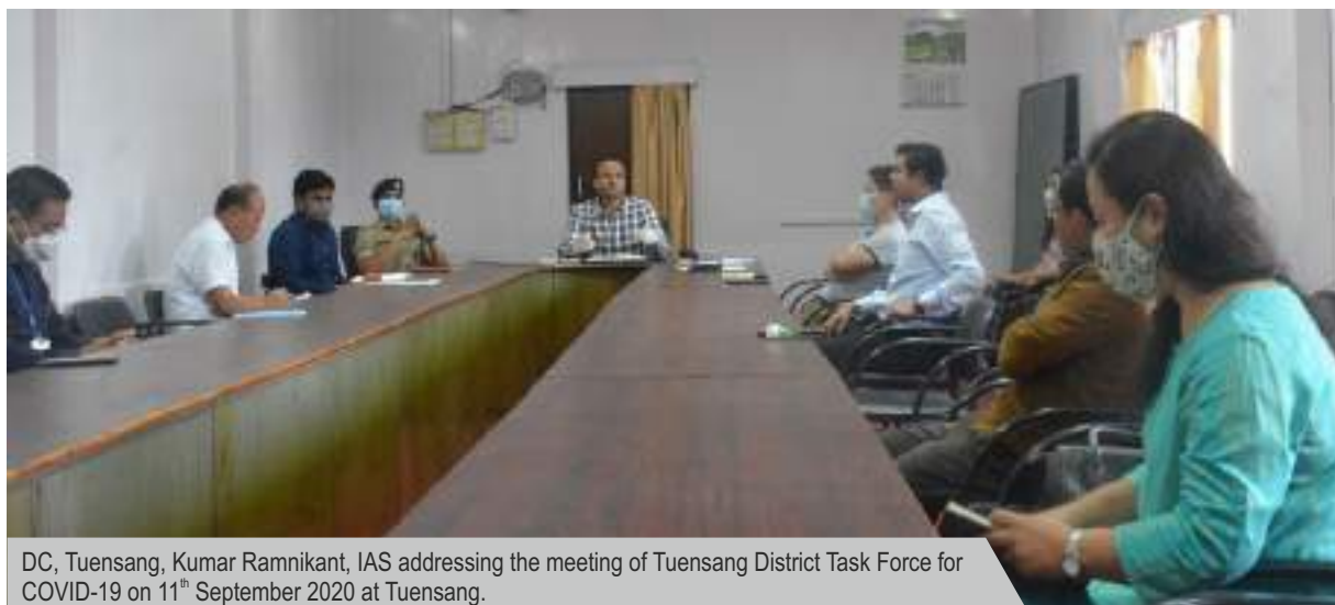
DC, Tuensang, Kumar Ramnikant, IAS addressing the meeting of Tuensang District Task Force for COVID-19 on 11 th September 2020 at Tuensang.