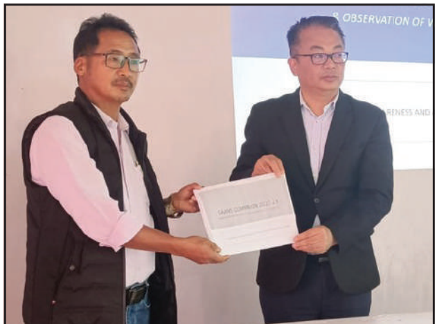
District Health Society under Chief Medical Officer, Noklak launched Social Awareness and Action to Neutralize Pneumonia Successfully at Noklak on 12 th November 2022.

District Health Society under Chief Medical Officer, Noklak launched the Social Awareness and Action to Neutralize Pneumonia Successfully (SAANS) on 12 th November 2022 by Deputy