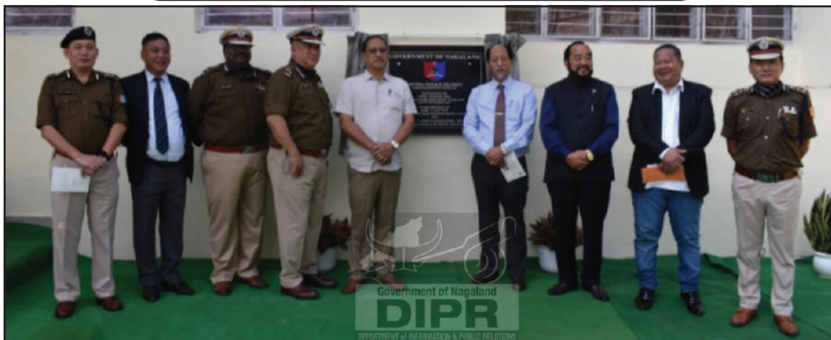
Chief Minister, Neiphiu Rio and Deputy Chief Minister, Y. Patton with other dignitaries during the inauguration of Sovima Police Station at Chümoukedima on 5 th November 2022.

Chief Minister, Neiphiu Rio inaugurated Sovima Police Station in the presence of Deputy Chief Minister and Home Minister, Y. Patton at Sovima village, Chümoukedima on 5 th November 2022.