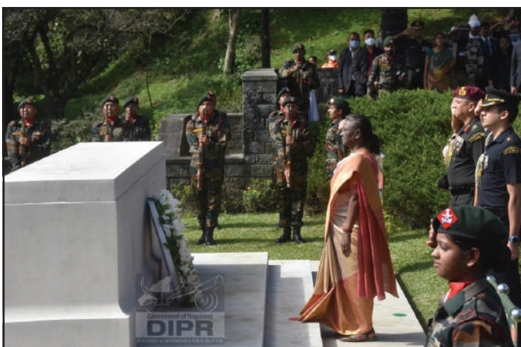
President of India, Droupadi Murmu paying her respect to honour the fallen heroes during her visit to the Kohima War Cemetery on 3 rd November 2022.

President of India, Droupadi Murmu visited the Kohima War Cemetery on 3 rd November 2022 to pay her homage to the brave soldiers who made the supreme sacrifice while defending the nation and also laid a wreath to show her honour and respect to the fallen heroes.