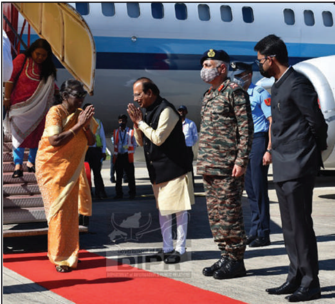
President of India, Droupadi Murmu being received by the Governor of Nagaland and Assam, Prof. Jagdish Mukhi on her arrival at the Dimapur airport on 2 nd November 2022.