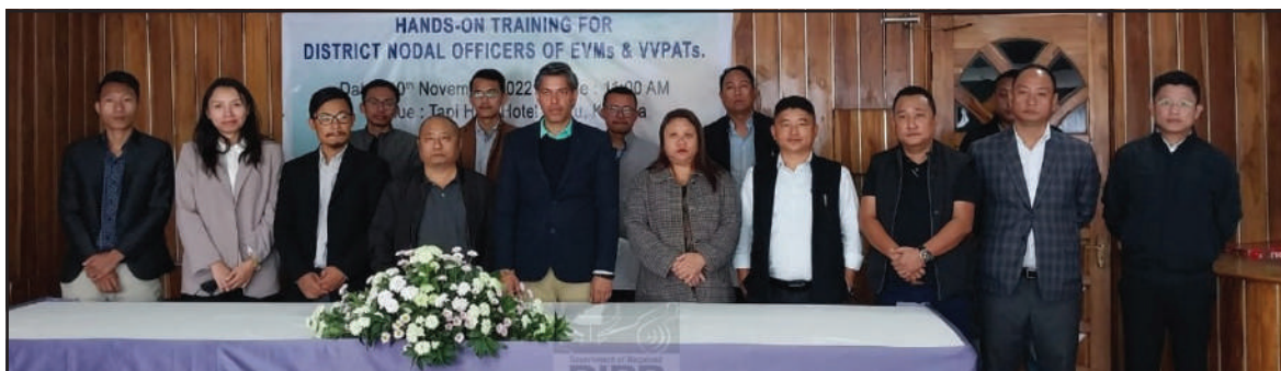
A hands-on training on Electronic Voting Machines for district Nodal Officers of EVMs and VVPAT was conducted by the Office of the Chief Electoral Officer, Nagaland Kohima at Tapi Hall, Japfu Hotel on 10 th November 2022.

A full day hands-on training on Electronic Voting Machines for district Nodal Officers of EVMs and VVPAT was conducted by the Office of the Chief Electoral Officer, Nagaland Kohima at Tapi Hall, Japfu Hotel on 10 th November 2022.