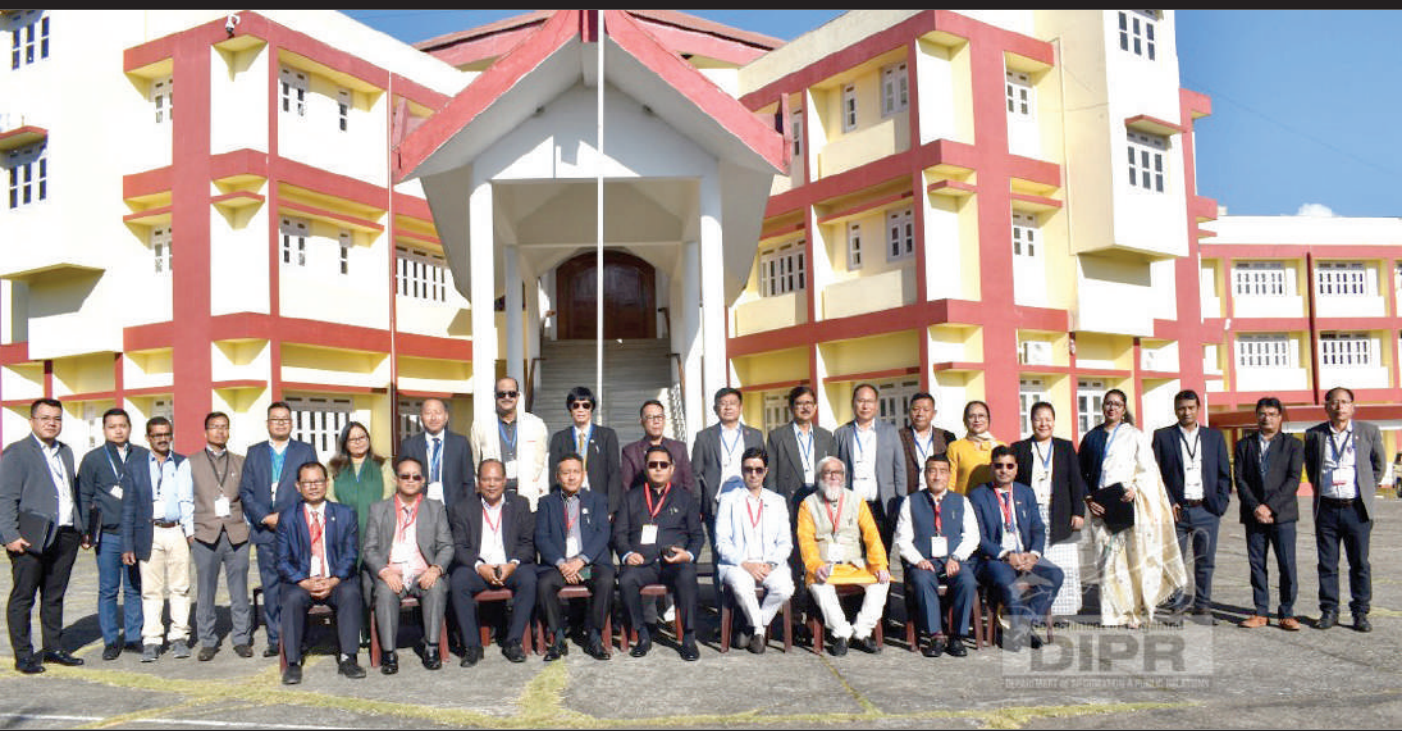
Speakers and Deputy Speakers of North East Legislative Assemblies along with other officials during the joint meeting of Commonwealth Parliamentary Association India Region Zone III and Executive Council, North East Regional Institute of Parliamentary Studies, Training & Research (NERIPSTR), held at Nagaland Legislative Assembly Secretariat, Kohima on 17 th November 2022.