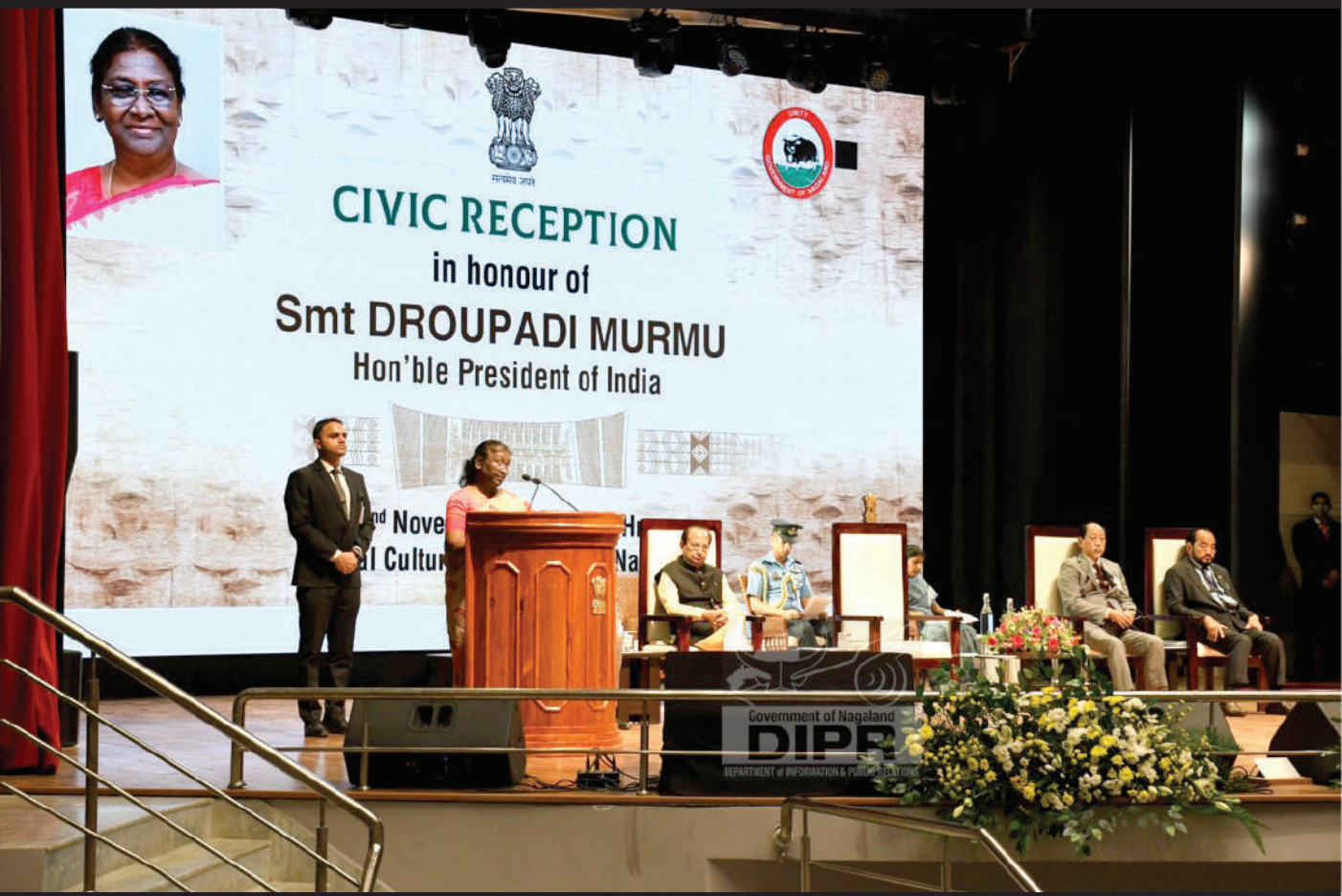
President of India, Droupadi Murmu addressing the gathering during the Civic Reception held in her honour at Capital Cultural Hall, Kohima on 2 nd November 2022.