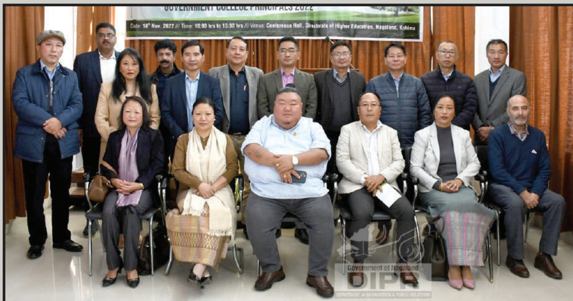
Minister, Higher Education and Tribal Affairs, Temjen Imna Along with Principals of Government Colleges during the Annual Conference of Government College Principals at Conference Hall, Directorate of Higher Education, Kohima on 18 th November 2022.