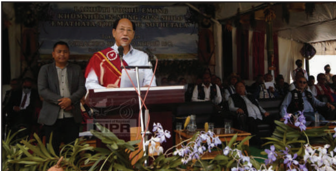
Chief Minister, Neiphiu Rio extending Tokhu Emong greetings to the people of Lakhuti village, Wokha on 7 th November 2022.

Commissioner & Secretary, Geology & Mining and Soil & Water Conservation, K. Libanthung Lotha, IAS as the special guest inaugurated the three-day Tokhu Emong Mini Hornbill Festival celebration on 5 th November 2022 at Local Ground, Wokha.