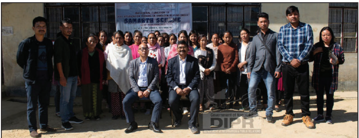
The skill upgradation training on handloom weaving under Samarth scheme was inaugurated at District Industries Centre Office in Tuensang on 15 th November 2022.