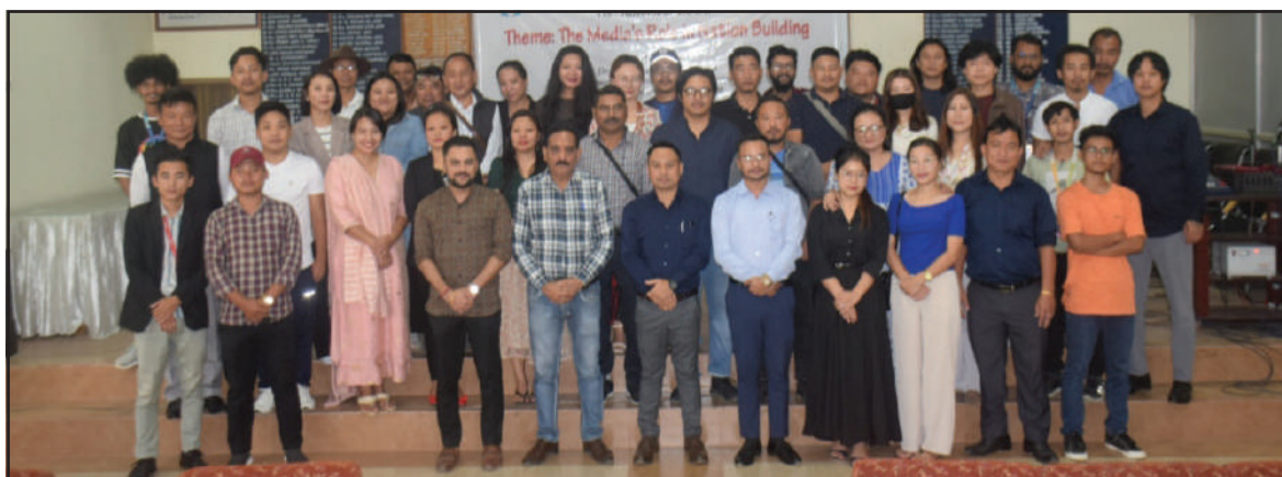
Dimapur Press Club celebrated National Press Day with the theme 'The media's role in nation building' on 16 th November 2022 at the Rotary Club Dimapur Conference Hall.

The Dimapur Press Club celebrated National Press Day with the theme 'The media's role in nation building' on 16 th November 2022 at the Rotary Club Dimapur Conference Hall.