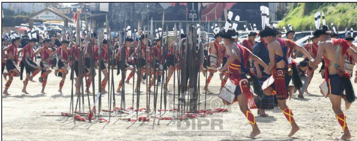
Sumi menfolk performing a traditional dance during the Ahuna-cum-Mini Hornbill Festival at Local Ground Zunheboto on 12 th November 2022.