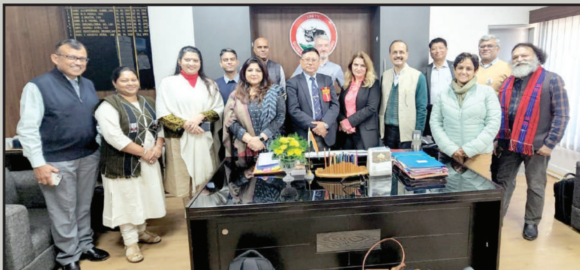
The World Bank team comprising of twelve members held a meeting with Core Committee & Technical Committee for implementation of ELEMENT project at Agriculture Production Commissioner's Office Conference Hall, Kohima on 14 th November 2022.