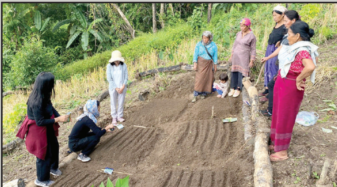
ATMA Chiephobozou Block, Kohima conducted a demonstration on cultivation practices of winter crops at Ziezou and Zhadima villages from 28 th to 29 th October 2022.