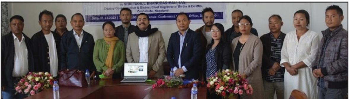
The online registration of births and deaths was launched at Zunheboto by Deputy Commissioner, Rahul Bhanudas Mali, IAS at DC's Conference Hall, Zunheboto on 11 th November 2022.

The online registration of births and deaths was launched at Zunheboto by Deputy Commissioner and District Chief Registrar of Births & Deaths Zunheboto, Rahul Bhanudas Mali, IAS at DC's Conference Hall, Zunheboto on 11 th November 2022.