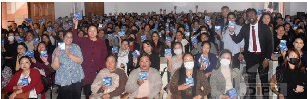
Deputy Commissioner, Kohima, Shanavas C, IAS with Project Baala Team and others during the awareness programme on menstrual hygiene at DC's Conference Hall, Kohima on 9 th November 2022.

The training and awareness programme on 'Menstrual Hygiene' and free distribution of reuseable sanitary pads in different locations under Kohima district from 9 th to 11 th November 2022 was launched on 9 th November 2022 by Deputy Commissioner, Kohima, Shanavas C, IAS at DC's Conference Hall, Kohima. The training programme was organized by the Kohima District Administration in collaboration with Project Baala, District Education Office, District Welfare Office, and One Stop Centre, Kohima.