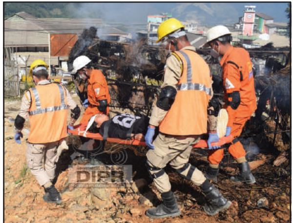
Mock exercise on earthquake was conducted in Tuensang on 17 th November 2022.

Mock Exercise on earthquake disaster was conducted at Tuensang town, organized by Nagaland State Disaster Management Authority (Tuensang district) in collaboration with the National Disaster Management Authority. The Nagaland Emergency Preparedness Exercise (NEPEX) incident sites were at DC's Office old building, the Old PWD Complex, and under construction building of the District & Sessions Court. The staging area was done at the Parade Ground, a makeshift hospital was arranged at the Badminton Stadium and de-briefing was conducted at Town Hall Tuensang. The SDRF, Fire & Emergency Services, DEF, CMO & Staff, Wireless, DPRO Office, and NCC took part in the session.