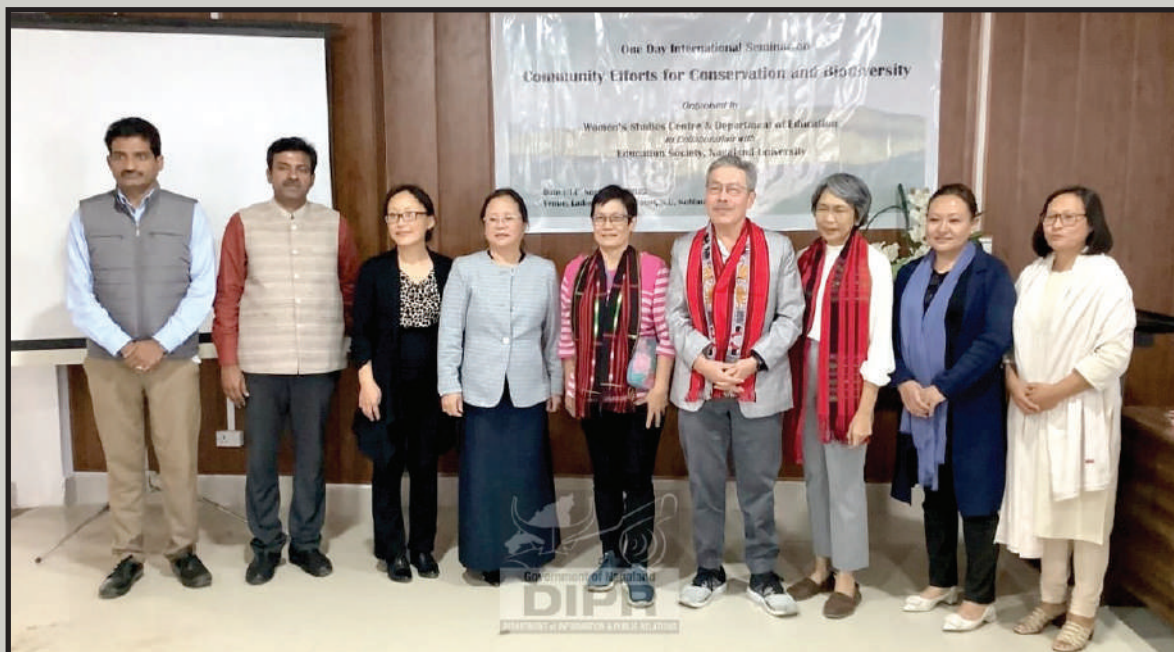
An international seminar on 'Community Efforts for Conservation and Biodiversity' was held at Nagaland University, Meriema, Kohima Campus on 14 th November 2022.