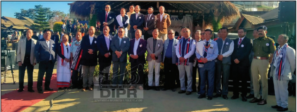
Chief Minister, Neiphiu Rio along with Ministers, Advisors, MLAs and other dignitaries during the 75 th Anniversary celebration of Peren township held at Peren town on 16 th November 2022.