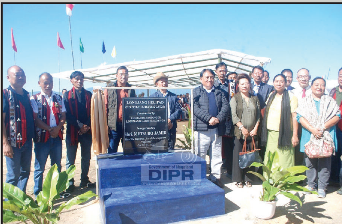
Minister, Rural Development, Metsubo Jamir inaugurated the Longjang Helipad at Longjang village, Mokokchung on 23 rd November 2022.