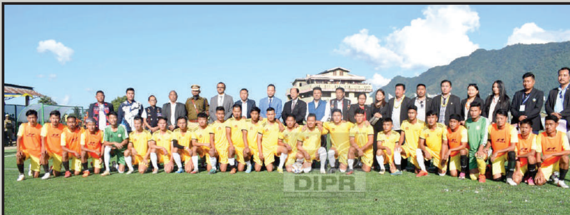
Chief Minister, Neiphiu Rio with officials and sports persons during the inauguration of Loyem Memorial Astroturf Ground-cum-opening of the 30 th Loyem Memorial Trophy 2022 at Loyem Memorial Ground, Tuensang on 5 th November 2022.