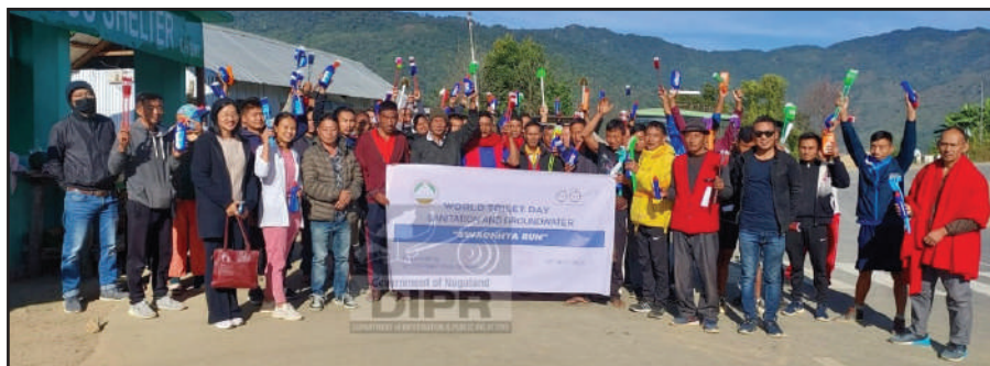
Public Health Engineering Department Phek celebrated World Toilet Day at Khomi village, Phek on 19 th November 2022.

Public Health Engineering Department (PHED) Phek celebrated World Toilet Day on 19 th November 2022 at Khomi village, Phek by organizing ‘Swachhta Run’ under the theme ‘Sanitation and groundwater - Making the invisible visible,’ which focuses