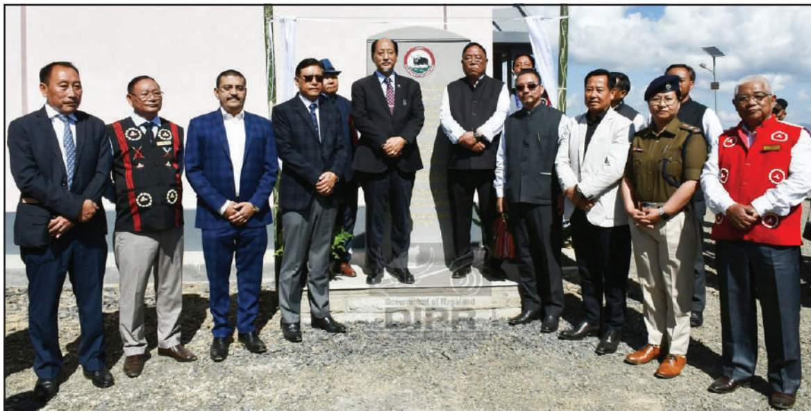
Zunheboto Multi-Purpose Hall was inaugurated by Chief Minister, Neiphiu Rio at Zunheboto on 4 th November 2022.

The Multi-Purpose Hall Zunheboto was inaugurated by Chief Minister, Neiphiu Rio on 4 th November 2022.