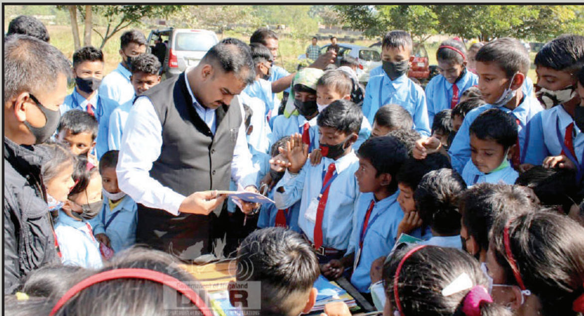
Deputy Commissioner, Chümoukedima, Abhinav Shivam, IAS interacting with school children during the inauguration of Hanging Library at GMS Tenyiphe II and GMS Block IV, Chümoukedima on 18 th November 2022.