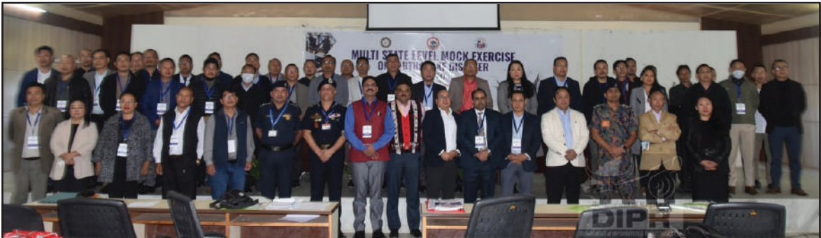
Multi-State Level Mock Drill Exercises on Earthquake Disaster (NEPEX) was held at ATI, Kohima on 15 th October 2022.

Multi-State Level Mock Drill Exercises on Earthquake Disaster (NEPEX), with the Home Commissioner, Nagaland, Abhijit Sinha IAS was held at ATI, Kohima on 15 th October 2022.