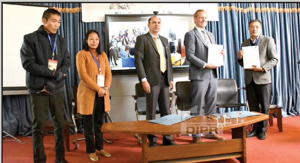
A Memorandum of Understanding (MoU) was signed between Kohima Science College and Deutsche Gesellschaft für Internationale Zusammenarbeit (GIZ) – India during the workshop on 'Current and Traditional Practices for Sustainable Management of Aquatic Ecosystem' at Kohima Science College on 24 th November 2022.