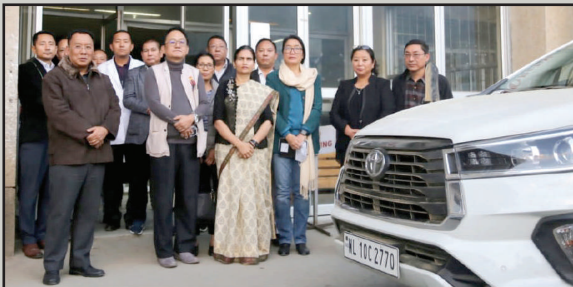
Union Minister of State, Health & Family Welfare, Dr. Bharti Pravin Pawar with officials of Health & Family Welfare, Nagaland during her visit to Naga Hospital Authority Kohima on 11 th November 2022.