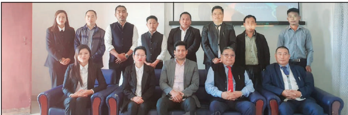
Judge Gauhati High Court, Justice Kakheto Sema along with other officials during the inauguration of District Court Complex, Longleng and e-Sewa Kendra on 24 th November 2022.