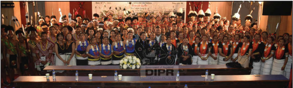
Janjatiya Gaurav Divas 2022 evening cultural programme was organized by the Department of Tribal Affairs on 16 th November 2022 at Capital Convention Centre, Kohima.

The Nagaland Tribal Research Institute, Department of Tribal Affairs organized Janjatiya Gaurav Divas 2022 evening cultural programme on 16 th November 2022 at Capital Convention Centre, Kohima with the Minister of Tribal Affairs and Higher Education, Temjen Imna Along as the special guest. Janjatiya Gaurav Divas name is a name given to 15 th November by the Union Cabinet of the Government of India to honor tribal freedom fighter, Birsa Munda.