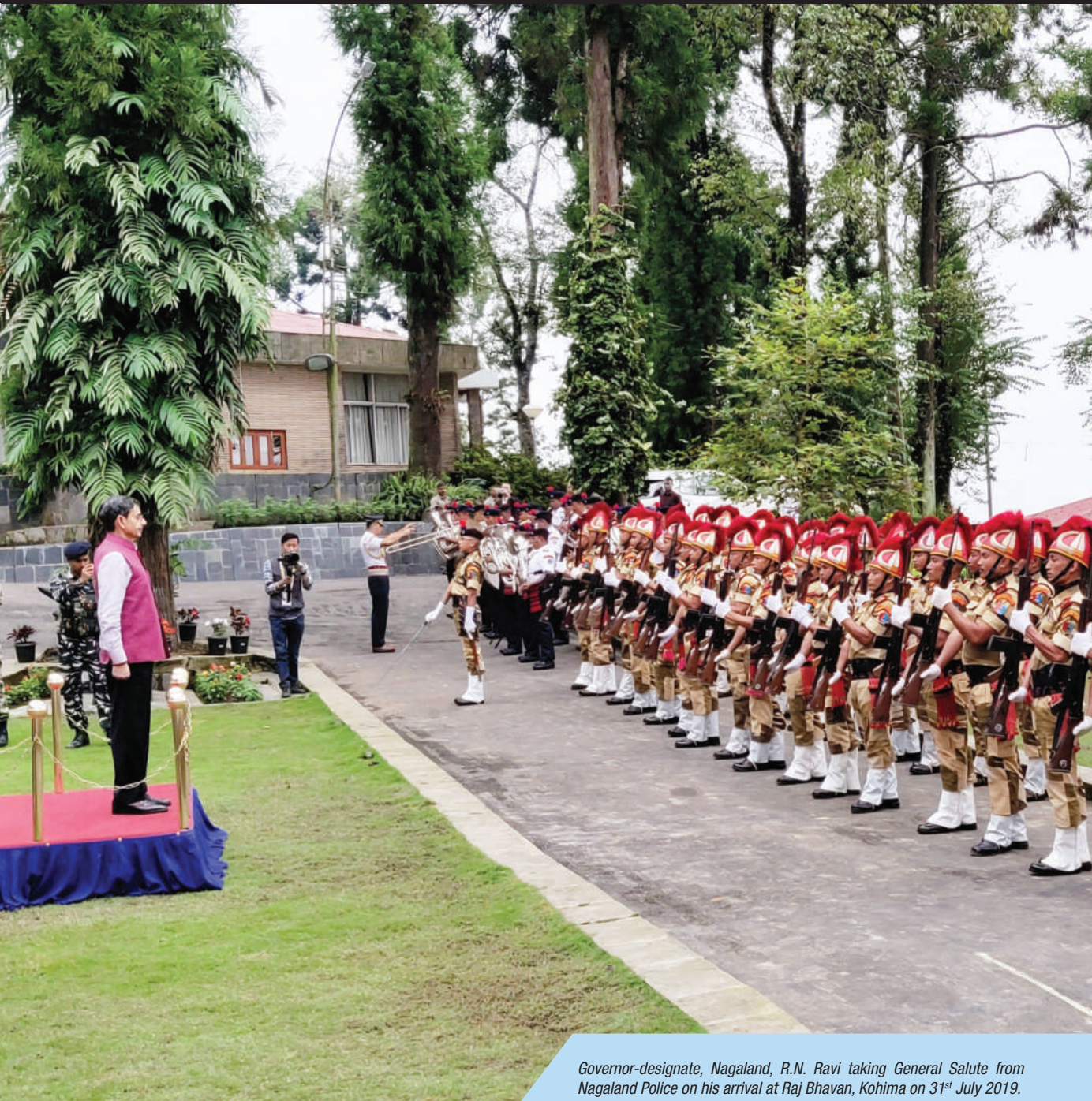
Governor-designate, Nagaland, R.N. Ravi taking General Salute from Nagaland Police on his arrival at Raj Bhavan, Kohima on 31 st July 2019.