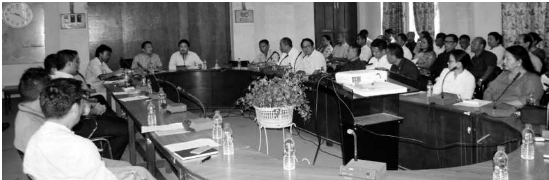
Minister, PHE, Jacob Zhimomi speaking at the DPDB meeting held at DC's Office, Dimapur on 5 th July 2019.

As suggested by one of the Board members in regard to acknowledging dedicated government servants in the district on special occasions, the Board constituted a committee headed by Deputy Commissioner. The Department of Land Resources gave a powerpoint presentation, highlighting the activities and its achievements in the district. Health & Family Welfare Department also gave a presentation on Dengue awareness during which common clinical symptoms, sequence of events, treatments, common breeding sites and its control measures were explained in detail.