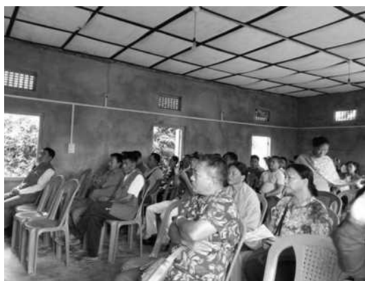
Participants during the Plastic Free Environment programme and training on Thonga (paper bag) making for the usage of degradable paper in place of plastics at Tening town on 2 nd July 2019.