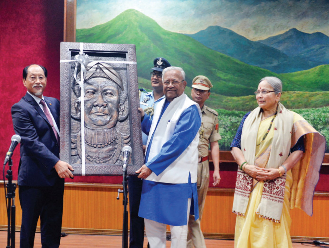
Chief Minister, Neiphiu Rio presenting a souvenir to Governor, P. B. Acharya during the farewell programme held in honour of the outgoing Governor at State Banquet Hall, Kohima on 25 th July 2019.