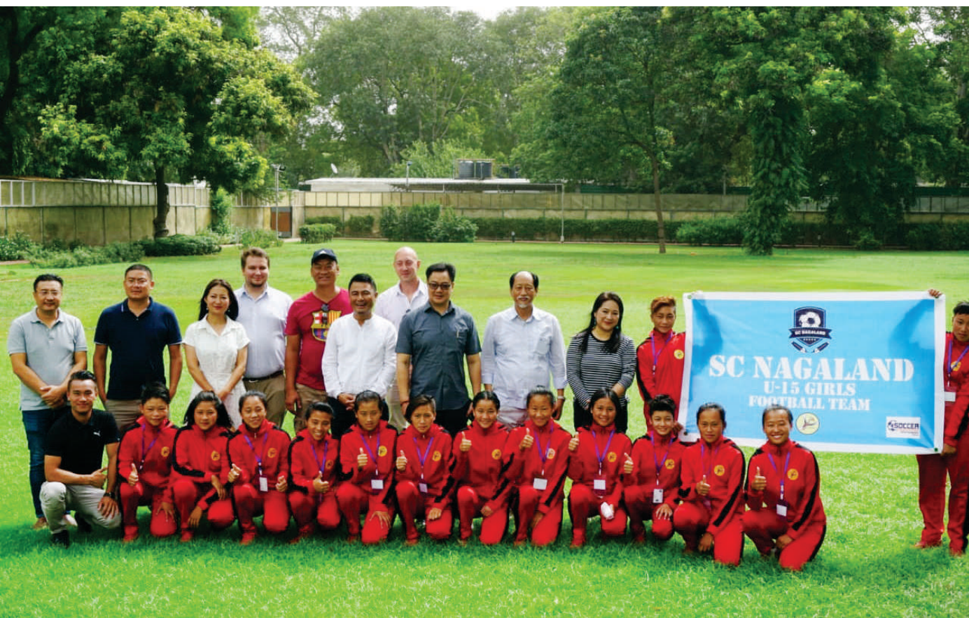
Union Minister of Youth Affairs & Sports, Kiren Rijiju along with Chief Minister, Neiphiu Rio and other officials with the U-15 Girls Football Team from Nagaland at New Delhi on 11 th July 2019. The team from Nagaland represented India in the Gothia Cup held in Sweden.