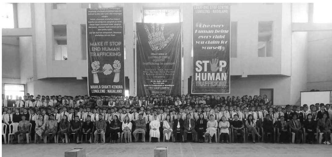
World Day against Trafficking in Persons was observed at Indoor Stadium, Longleng on 30 th July 2019.