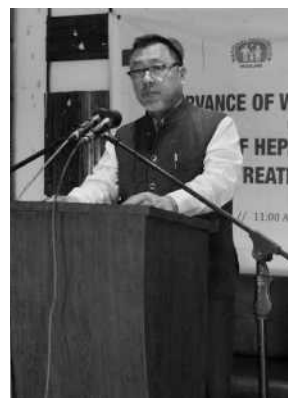
Minister, H&FW, S. Pangnyu Phom speaking on the occasion of World Hepatitis Day 2019-cum-Roll out of Hepatitis C treatment at NHAK on 26 th July 2019.