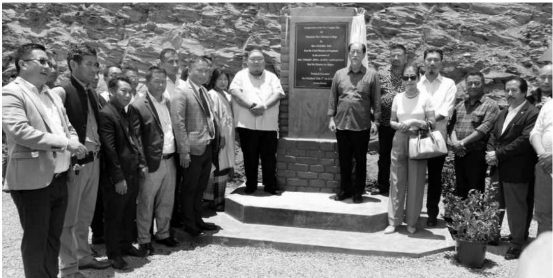
CM Neiphiu Rio, Minister Temjen Imna Along with officials during the launching of the new campus site of Mountain View Christian College at Nerhe Phezha on 2 nd July 2019.

The new campus of Mountain View Christian College in Nerhe Phezha marks a new beginning for the people under Chiephobozou sub-division as it is the first college to be set up in that region. It will greatly benefit the students of the area as they no longer have to travel to Kohima or Dimapur in pursuit of higher studies. The college currently provides degree courses in all humanities subjects with future aim to introduce more subjects.