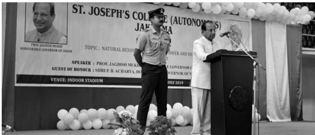
Governor of Assam, Prof. Jagdish Mukhi speaking at the seminar on 'Natural Resources, Skill Manpower and Development of North East' at St. Joseph's College, Jakhama on 17 th July 2019.

On the State front, Mukhi said that the Civil Aviation Ministry has approved two helicopter services to keep the state headquarters connected with the district headquarters and under the Union Budget, 2019-20, Rs. 500 crore was allocated for rail, connecting Dimapur with Kohima. To augment air services in Nagaland, three new routes were taken up in which Dimapur will be connected with Guwahati,