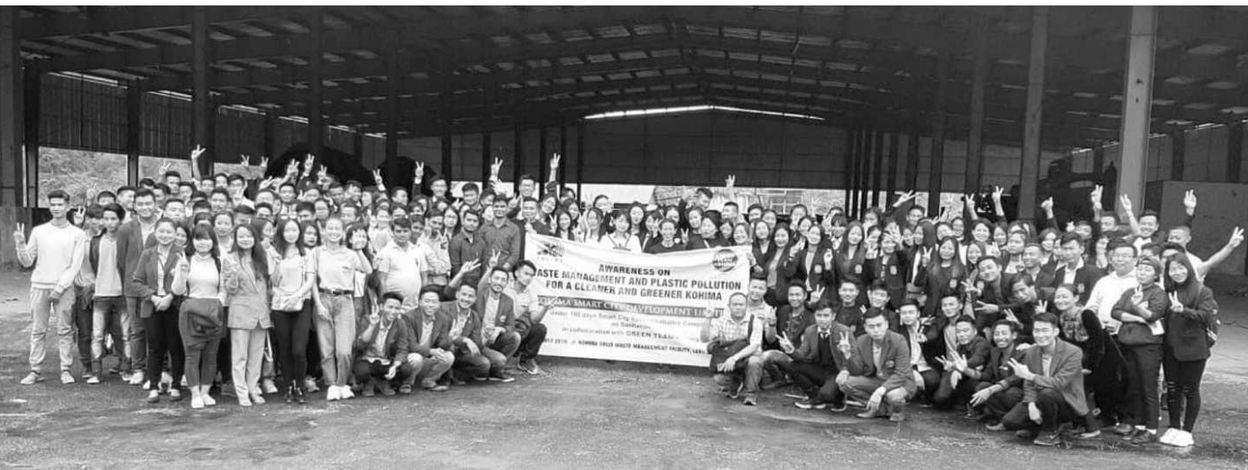
A one day orientation programme under the '100 Days of Smart City Special Initiative Campaign on Sanitation' for educational institutions was held at Kohima on 12 th July 2019.

pile and shoved into plastic bottles to make eco-bricks. This was an initiation to reduce non-degradable wastes into creative and useful items instead of littering.