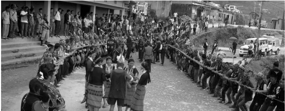
District Gaonburas' Union Tuensang installing a New Log Drum at Customary Court, Tuensang on 19 th June 2019.

by other outside factors”, he stated. He also added that the Log drum is an integral part of Naga society and exhorted the youngsters to follow the examples set by the elders today.