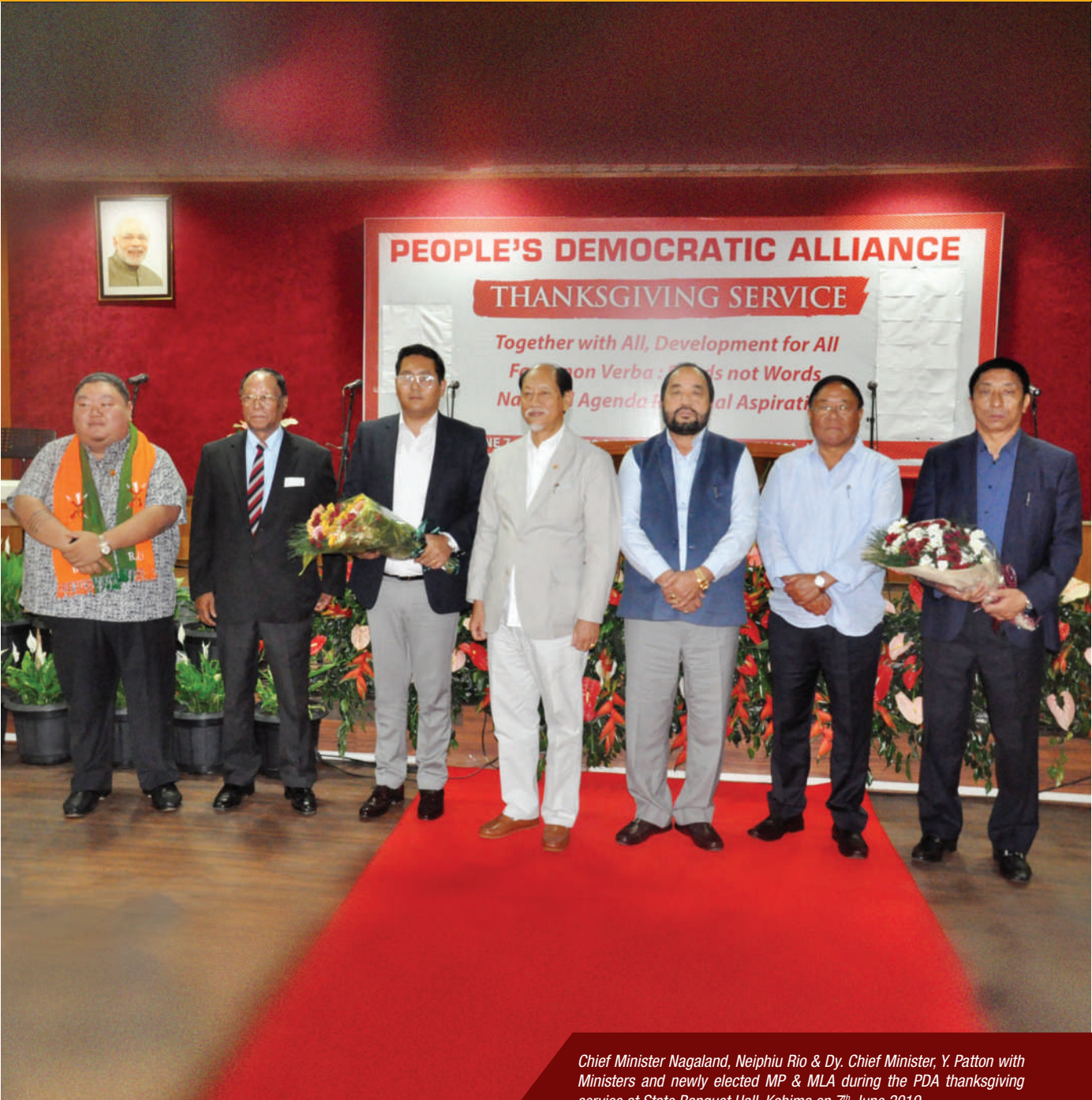
Chief Minister Nagaland, Neiphiu Rio & Dy. Chief Minister, Y. Patton with Ministers and newly elected MP & MLA during the PDA thanksgiving service at State Banquet Hall, Kohima on 7 th June 2019.