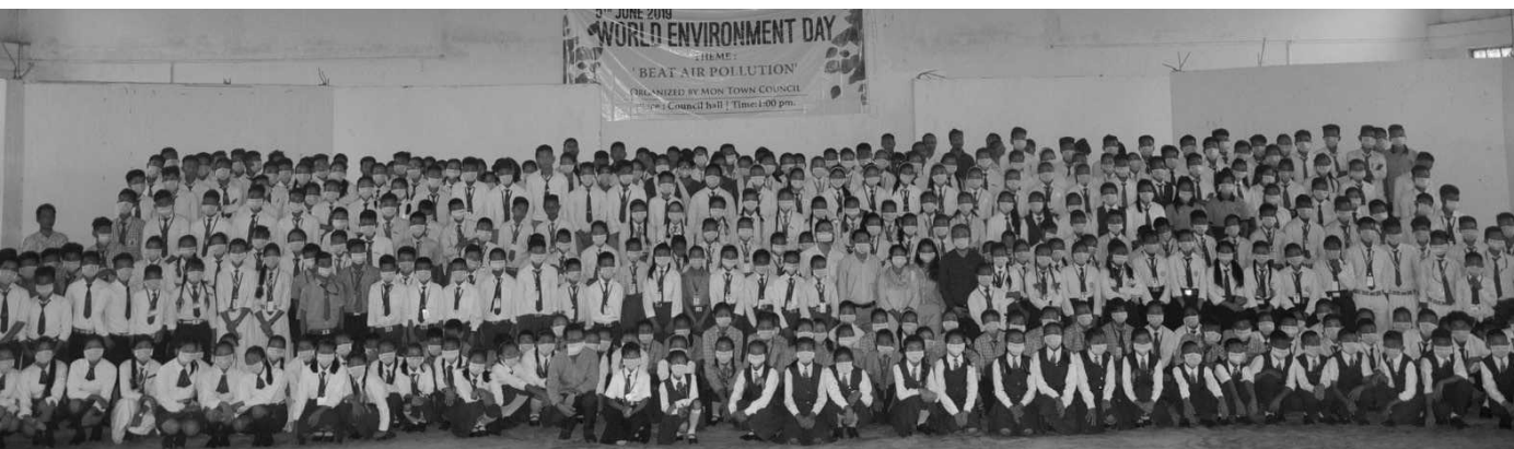
World Environment Day observed at Mon under the theme "Beat Air Pollution" organized by Mon Town Council at Council Hall, Mon on 5 th June 2019.

Earlier, Zunheboto Town Council headed by