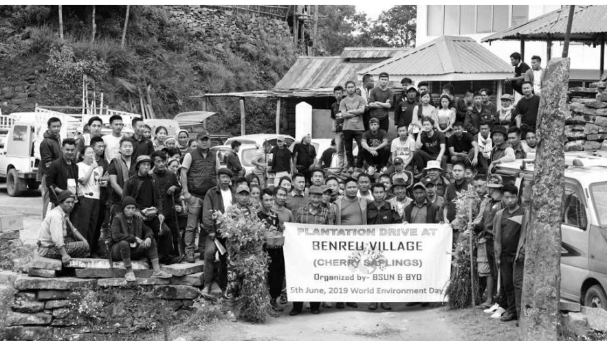
Benreu village elders along with the youth volunteers during the plantation drive commemorating World Environment Day at Benreu Tourist village, Peren on 5 th June 2019.

Along with the Horticulture department, the Airport Authority of India and other stakeholders including CISF, Indian oil, Bharat Petroleum, Indigo, Air India also participated in the plantation and cleanliness drive to celebrate World Environment Day.