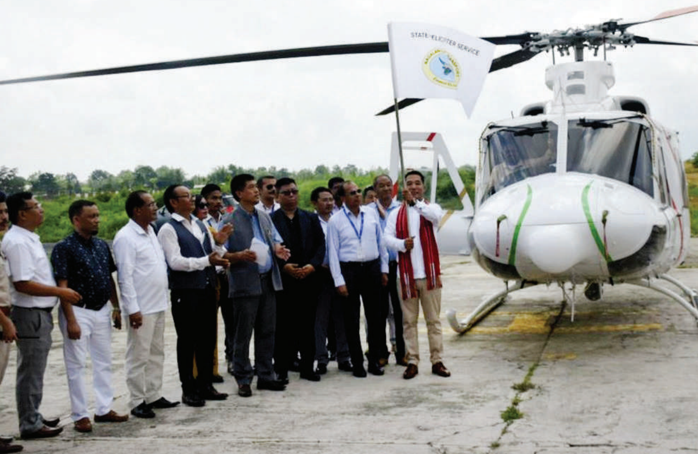
Minister, Transport, Civil Aviation, Railways & Land Resources, P. Paiwang Konyak flagging off the 2 nd Nagaland State Helicopter Service at Dimapur Airport on 12 th June 2019.