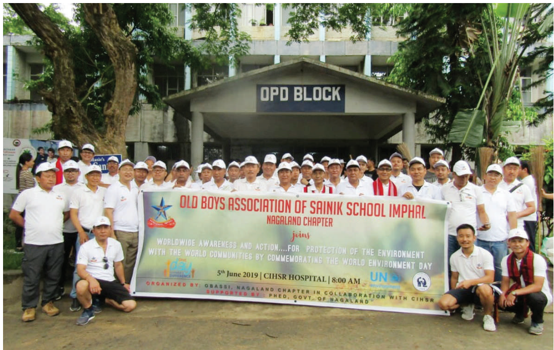
Old Boys' Association of Sainik School Imphal (OBASSI), Nagaland Chapter in collaboration with CIHSR Dimapur conducted a Clean-up and placement of bins at CIHSR on 5 th June 2019.