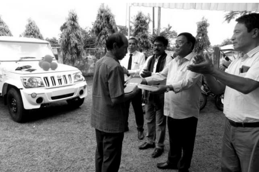
Minister for Agriculture & Cooperation, G. Kaito Aye handing over Bolero Pick-up to one of the beneficiaries during the program on Distribution of Market Linkage Vehicle & Recovery Bike at CTC, Medziphema on 4 th June 2019.

Department of Cooperation, Government of Nagaland, organised a programme on Distribution of Market Linkage Vehicle & Recovery Bike at CTC Medziphema on 4 th June 2019.