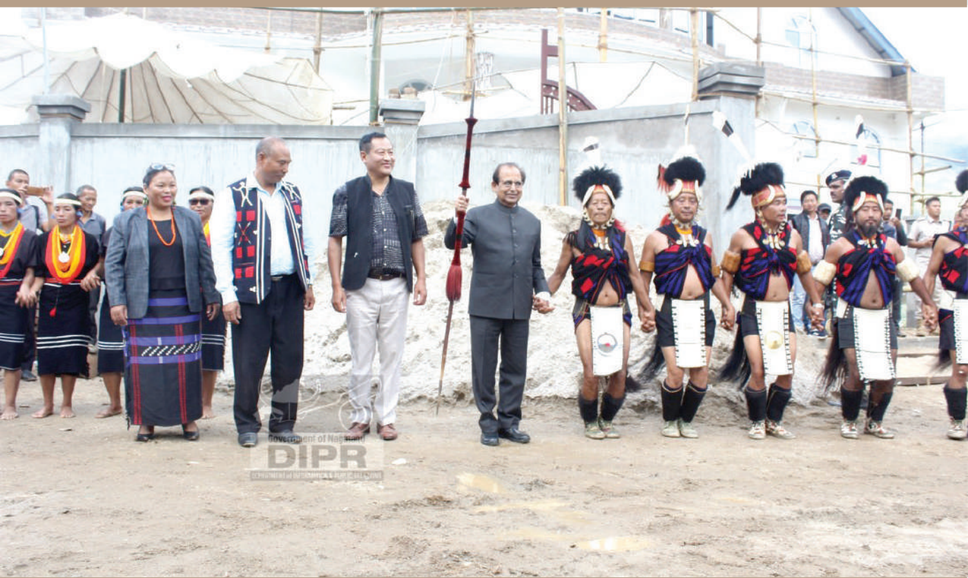
Governor of Assam and Nagaland, Prof. Jagdish Mukhi with a cultural troupe during his visit to New Pangsha village, Noklak on 28 th September 2022.