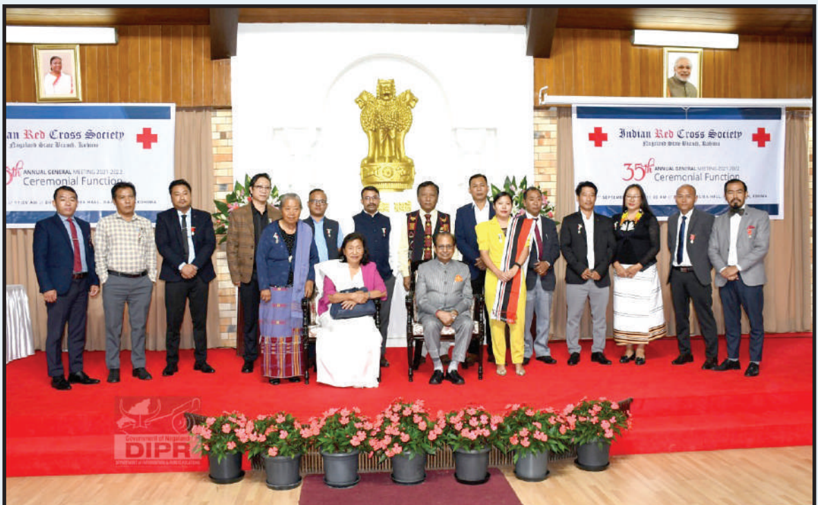
Governor of Assam and Nagaland, Prof. Jagdish Mukhi with officials of Indian Red Cross Society Nagaland (IRCSN) during the ceremonial function of the 35 th Annual General Meeting of the IRCSN at Raj Bhavan, Kohima on 27 th September 2022.