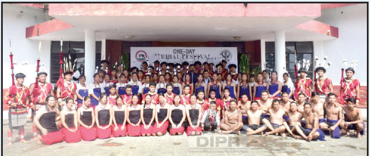
Deputy Commissioner, Mokokchung with officials and cultural troupes during the Tribal Festival held at District Cultural Office, Mokokchung on 29 th September 2022.