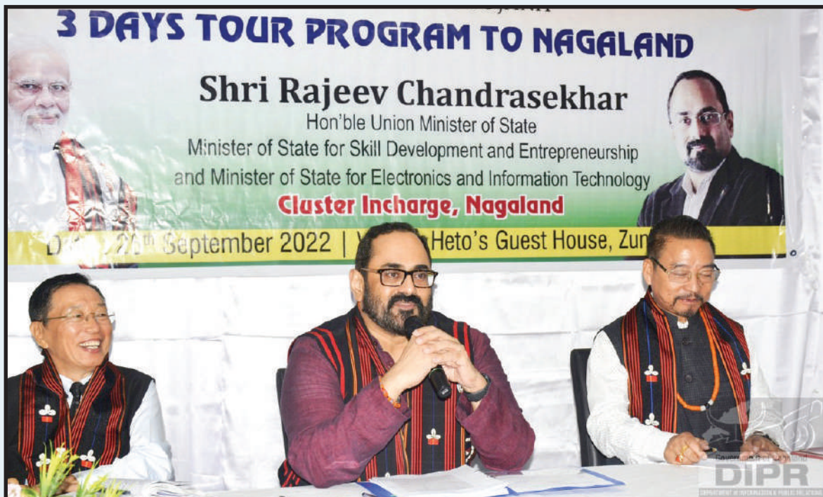
Union Minister of State, Skill Development and Entrepreneurship, Electronics and Information Technology, Rajeev Chandrasekhar during his visit to Zunheboto on 26 th September 2022.