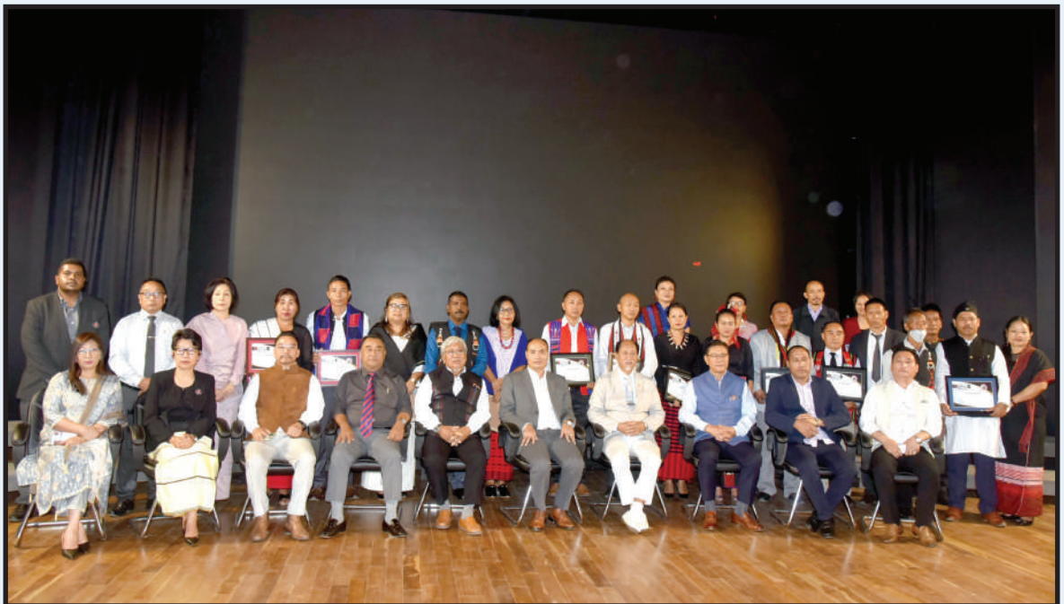
Chief Minister, Neiphiu Rio, Advisors, MLAs and senior government officials with the recipients of State Level Teacher's Award on the occasion of Teacher's Day celebration at Capital Cultural Hall, Kohima on 5 th September 2022.