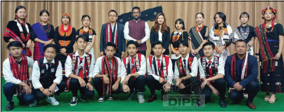
A Tribal Festival with the theme 'Igniting Cultural Traditions' was celebrated at State Academy Hall, Kohima on 30 th September 2022.