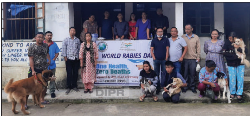
A free anti-rabies vaccination drive was conducted by the Department of Animal Husbandry & Veterinary Services, Wokha in commemoration of World Rabies Day at Veterinary Hospital, Wokha on 28 th September 2022.