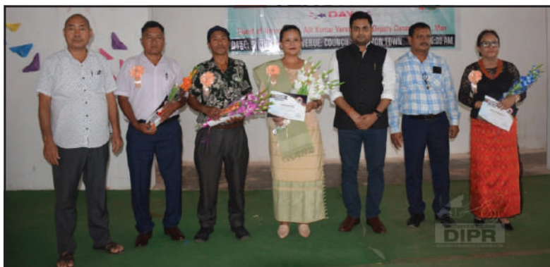
Department of School Education, Mon organised Teachers' Day 2022 at Council Hall Mon on 5 th September 2022.

Department of School Education, Mon organised a grand celebration of Teachers' Day