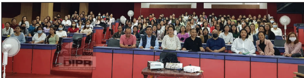
A five-day induction of 136 newly appointed Community Health Officers (CHOs) of the 4 th , 5 th , and 6 th batch started on the 12 th of September 2022 at the Capital Convention Hall, Kohima.

A five-day induction of the 136 newly appointed Community Health Officers (CHOs) of the 4 th , 5 th , and 6 th batch started on the 12 th of September 2022 at the Capital Convention Hall, Kohima.