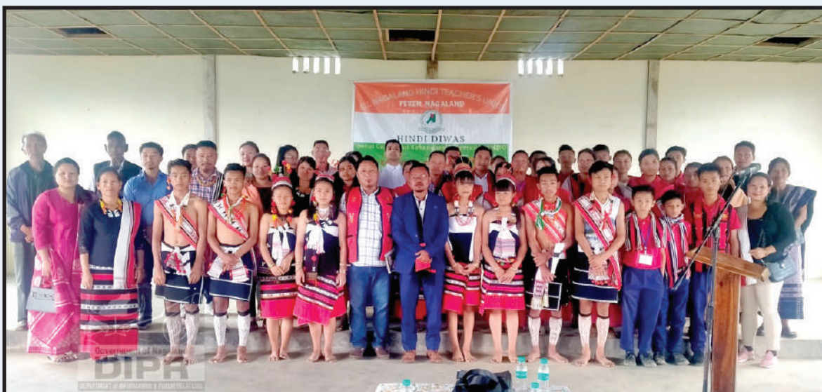
Hindi Teachers' Union, Peren Unit celebrated Hindi Diwas 2022 at Tening Village Council Hall on 14 th September 2022.