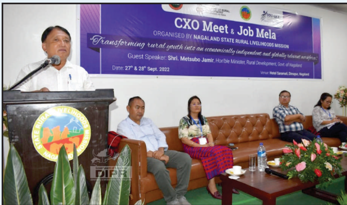
Minister, Rural Development, Metsubo Jamir addressing the gathering during CXO meeting held at Dimapur on 27 th September 2022.