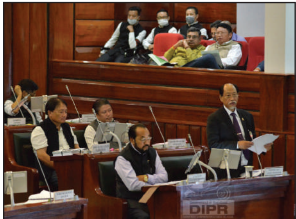
Chief Minister, Neiphiu Rio during the Twelfth Session of the Thirteenth NLA at the NLA Secretariat, Kohima on 22 nd September 2022

Rio said that the Parliamentary Committee