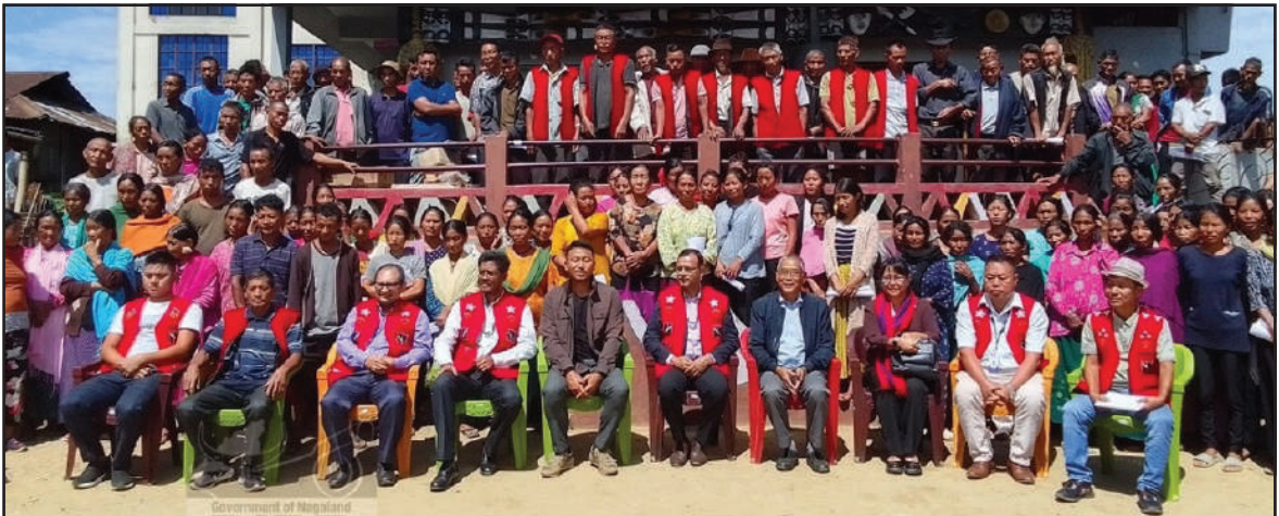
State Bank of India, Longleng Branch along with bank officials from Jorhat conducted the first special credit outreach programme on PM - Kisan Samman Nidhi at Bhumnyu village, Longleng on 10 th September 2022.