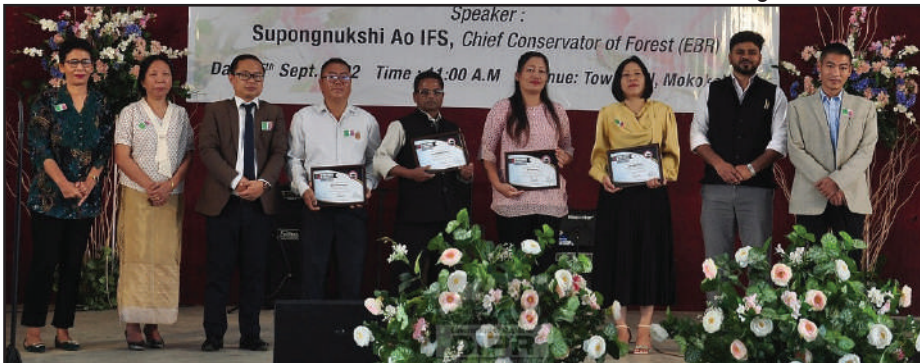
61 st Teachers' Day celebration programme was held at the Town Hall, Mokokchung on 5 th September 2022.

Organized by the Ao Students' Conference (AKM), the 61 st Teachers' Day celebration programme was held at the Town Hall, Mokokchung on 5 th September 2022, under the theme 'Leading in crisis, re-imagining the future.'