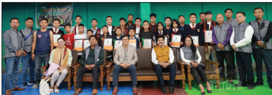
The District Sports Council Zunheboto felicitated medal winners in the 2 nd Nagaland Olympic & Paralympic Games at DSCZ Indoor Stadium, Zunheboto on 14 th September 2022.

The District Sports Council Zunheboto organized a felicitation programme for Zunheboto district podium finishers in the 2 nd Nagaland Olympic & Paralympic Games 2022, 44 th Inter District & State Open Badminton Championship,