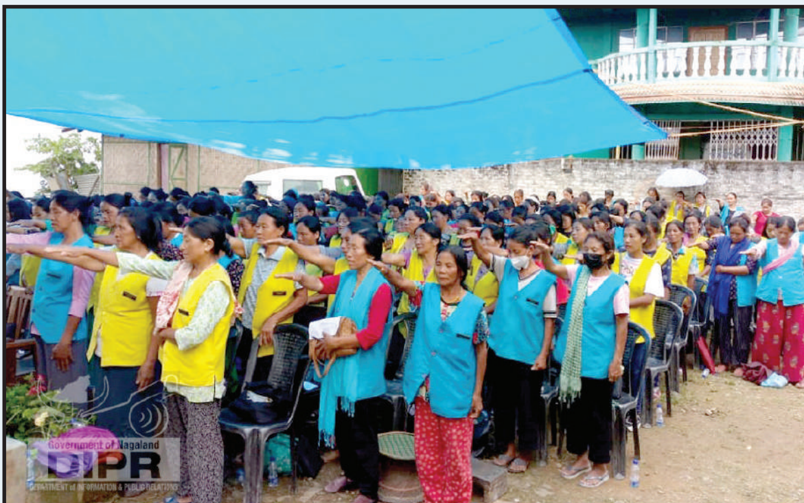
Anganwadi Workers of Longleng taking the Poshan Pledge during the launching programme of Poshan Maah at CDPO's Office, Longleng on 3 rd September 2022.