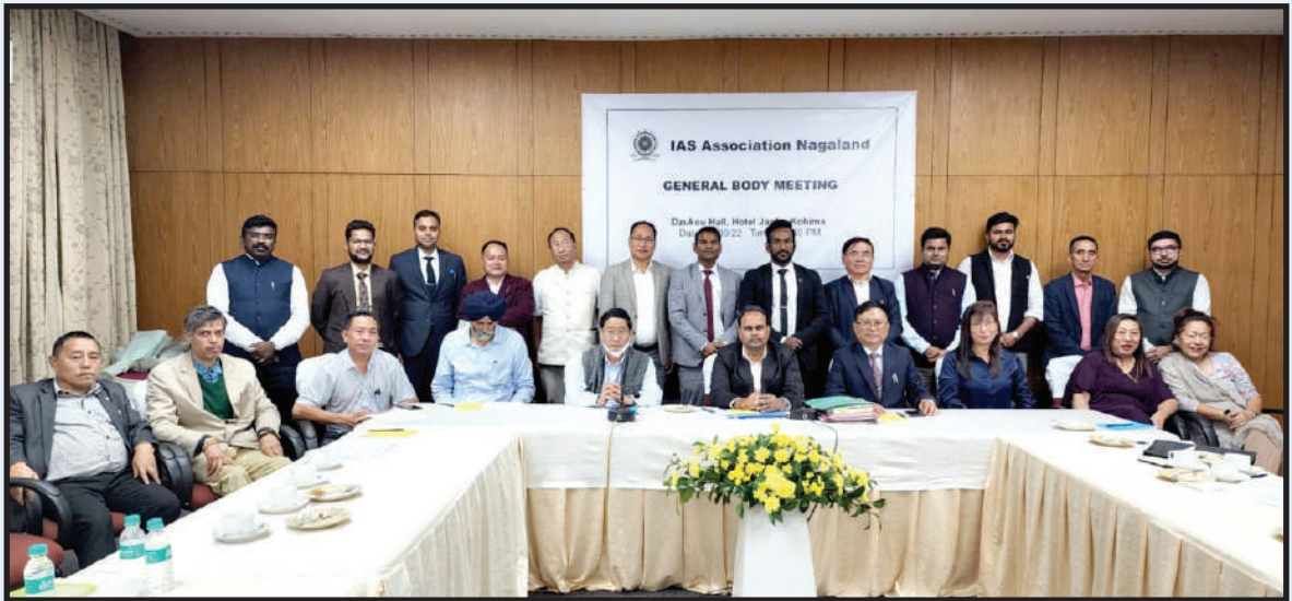
The IAS Association, Nagaland held its General Body Meeting at Hotel Japfü, Kohima on 15 th September 2022.