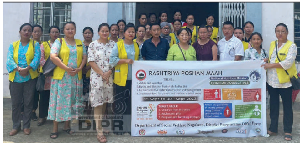
Peren ICDS Project under the Department of Social Welfare organised district level launching of Poshan Maah Women Welfare Hall, Peren on 1 st September 2022.