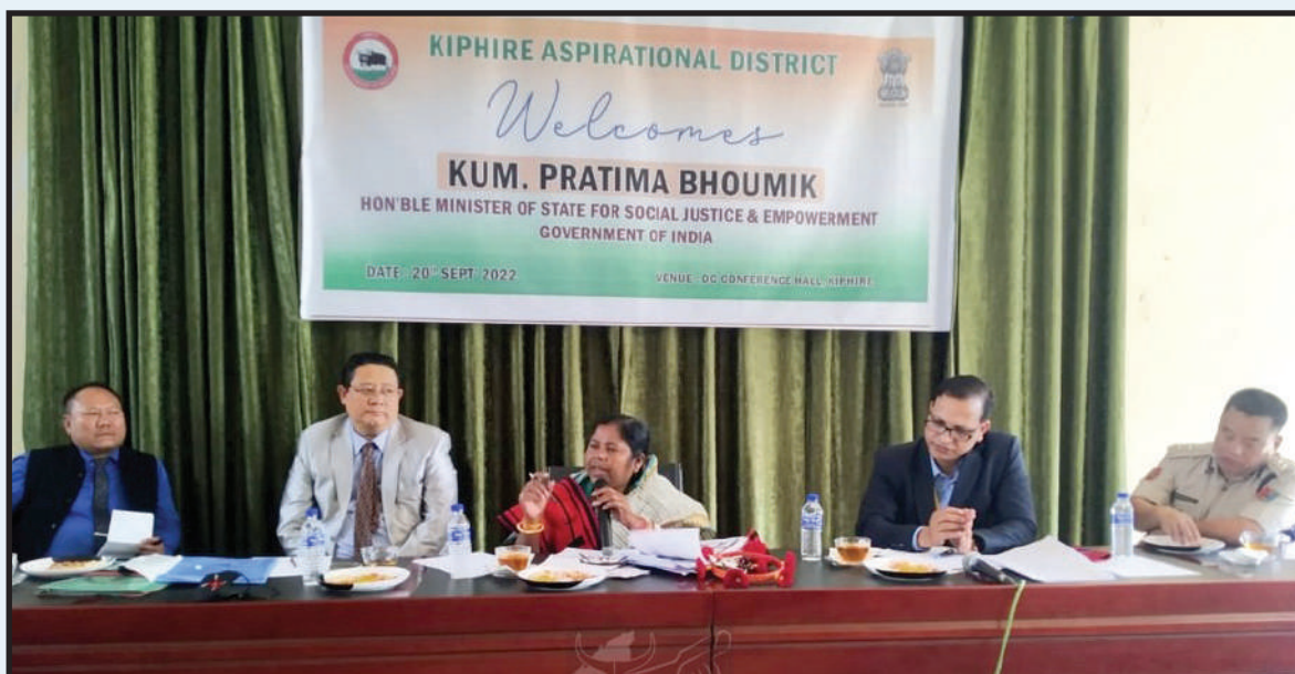
Union Minister of State for Social Justice & Empowerment, Pratima Bhoomik visited Kiphire and held an interaction with district officials at DC's Conference Hall, Kiphire on 20 th September 2022.