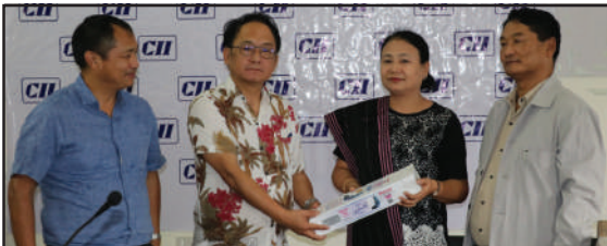
Handing over programme of 468 BP instruments was held at IDSP Hall, Directorate of Health & Family Welfare, Kohima on 26 th September 2022.

to CII Nagaland Branch. He further mentioned that the department looks forward to supporting in the future too.