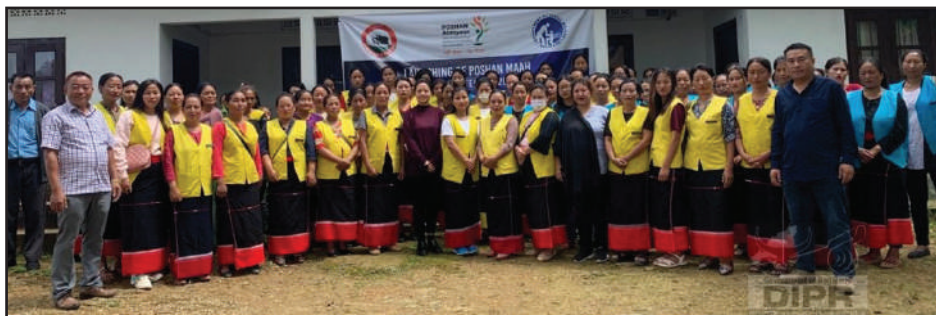
Anganwadi workers and helpers along with officials during the launching of Poshan Maah programme in Chozuba on 2 nd September 2022.

Poshan Maah, a month long programme was formally flagged off by ADC, Imokokla at Chozuba on 2 nd September 2022.