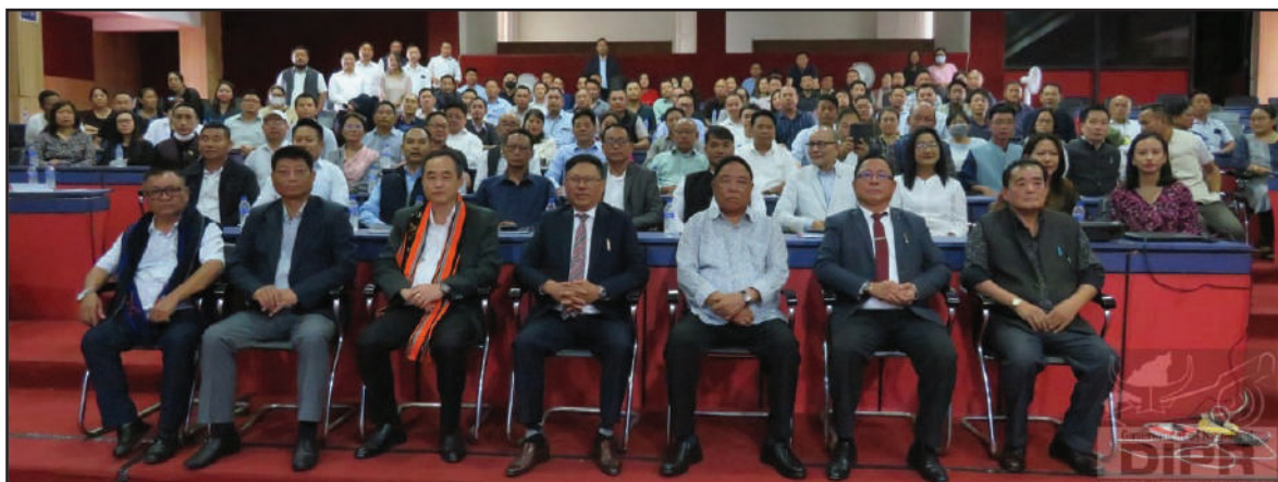
Agriculture Officers' Co-ordination meeting was held at Capital Convention Centre, Kohima on 2 nd September 2022.

difficulties, motivate and educate them about the new technology of farming, and encourage the farming community to adopt the cluster system of farming and emphasize about integrated settled farming, so as to promote farmers of the State to have a sustainable life. He also instructed the officers to see that the schemes/facilities for the beneficiaries reach them on time and to identify the bogus beneficiaries of PMKSY schemes meant for the farmers and to spread awareness to the farmers to avail the KCC loans which is an interest free loan. He added that the farmers should be encouraged to grow commercial crops which can be produced in the State.