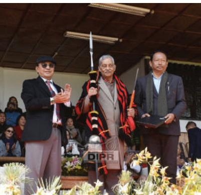
Advocate General of Nagaland, K. N. Balgopal being felicitated during the cultural programme of the Hornbill Festival at Kisama on 7 th December 2024.