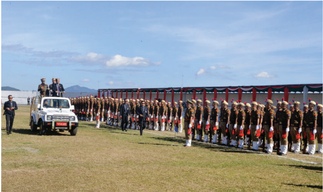
Chief Minister, Neiphiu Rio inspecting the parade contingents during the 62 nd Statehood Day celebration held at Nagaland Civil Secretariat Plaza, Kohima on 1 st December 2024.