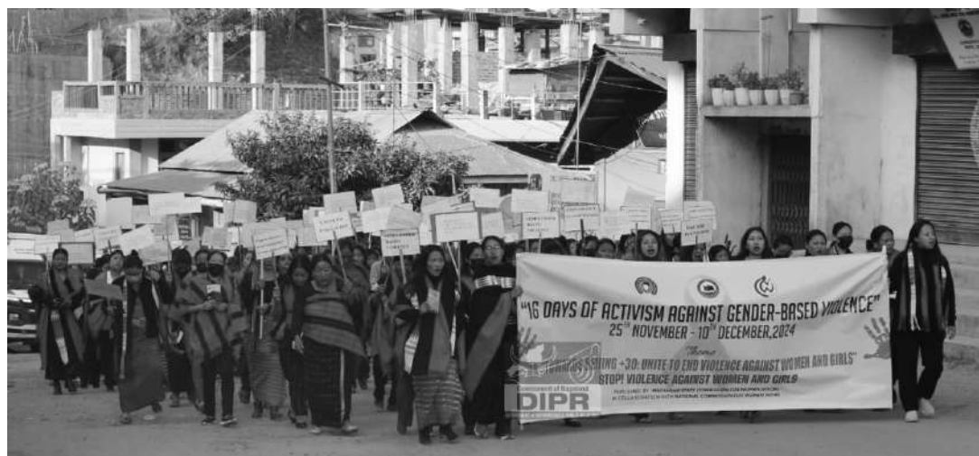
Womenfolk participating in the walkathon during the culmination programme of 16 Days of Activism against Gender Based Violence held at Longleng on 10 th December 2024.

Under the aegis of District Administration, District Hub for Empowerment of Women (DHEW) & Sakhi-One stop centre in convergence with Phomla