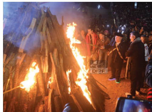
Minister, Tourism and Higher Education, Temjen Imna and other dignitaries lighting the bonfire during the closing ceremony of the 25 th Edition of Hornbill Festival at Naga Heritage Village, Kisama on 10 th December 2024.