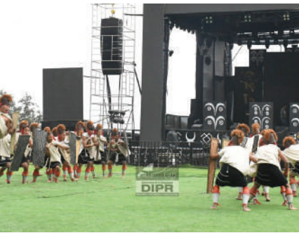
Chakhesang Cultural Troupe presenting Lorhi Ketshe (ritual game) during the Hornbill Festival at Kisama on 6 th December 2024.