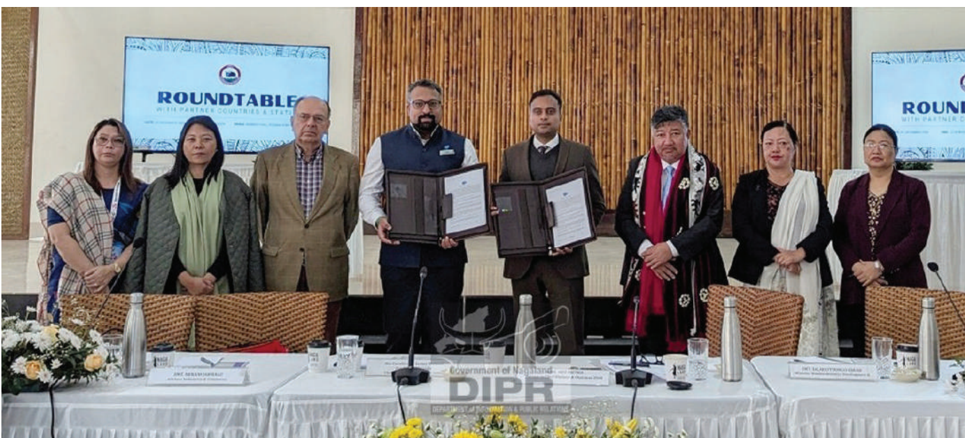
Officials and dignitaries at the signing of the Memorandum of Understanding between the Department of Higher Education and Salesforce.com India Pvt. Ltd. at the Naga Heritage Village, Kisama on 2 nd December 2024.