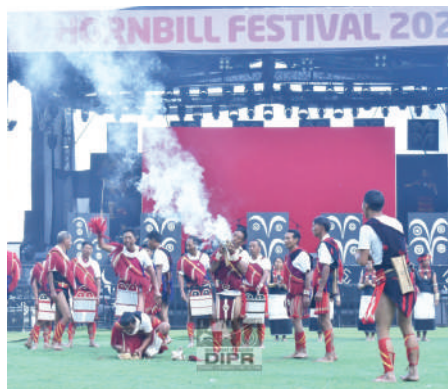
Sumi Cultural Troupe presenting the traditional way of fire making during the Hornbill Festival at Kisama on 9 th December 2024.