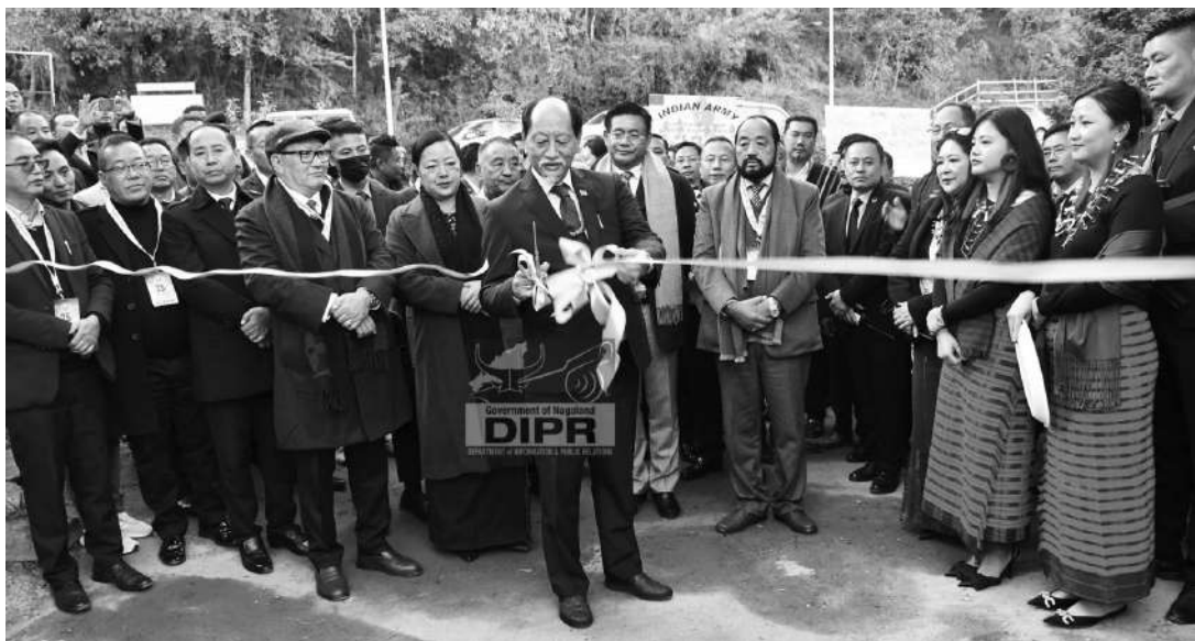
Chief Minister, Neiphiu Rio inaugurating the Hortiscape during the Hornbill Festival at Kisama on 1 st December 2024.

Chief Minister, Neiphiu Rio inaugurated the Hortiscape at Nagaland Heritage Village, Kisama on 1 st December 2024. The Hortiscape housed the Kaleidoscope Hortus and Floral Galleria, which was organised by the Department of Horticulture. At the Kaleidoscope Hortus, visitors could buy local fruits and vegetables sourced from different parts of the State. The Floral Galleria featured