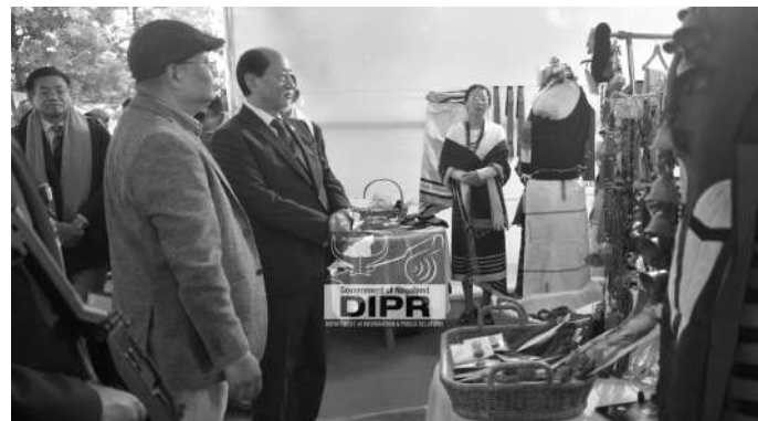
Chief Minister, Neiphiu Rio visiting the MykiFest during the Hornbill Festival at Kisama on 1 st December 2024.

First launched in August 2017, MykiFest celebrates the achievements of women and has been an annual feature of the Hornbill Festival since 2018. The Myki Stall featured products from the apparels & accessories production programme, the Food Processing & Resource Centre, and the creation of trainees and instructors from the Multi-Training Centres in Kohima and Dimapur.