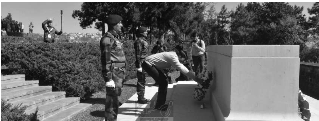
Union Minister for Labour & Employment and Youth Resources & Sports, Dr. Mansukh L. Mandaviya paying his respects during his visit to the Kohima War Cemetery, Kohima on 8 th December 2024.

Dr. Mansukh interacted with the officials of Labour & Employment Department, Youth Resources & Sports Department, Nagaland Olympic Association and State Sports Association.