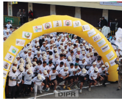
'Run for Hornbill Against Time' was organised as part of the Hornbill Festival on 7 th December 2024.