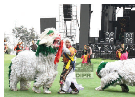
Sikkim Cultural Troupe performing during the Hornbill Festival at Naga Heritage Village, Kisama on 6 th December 2024.