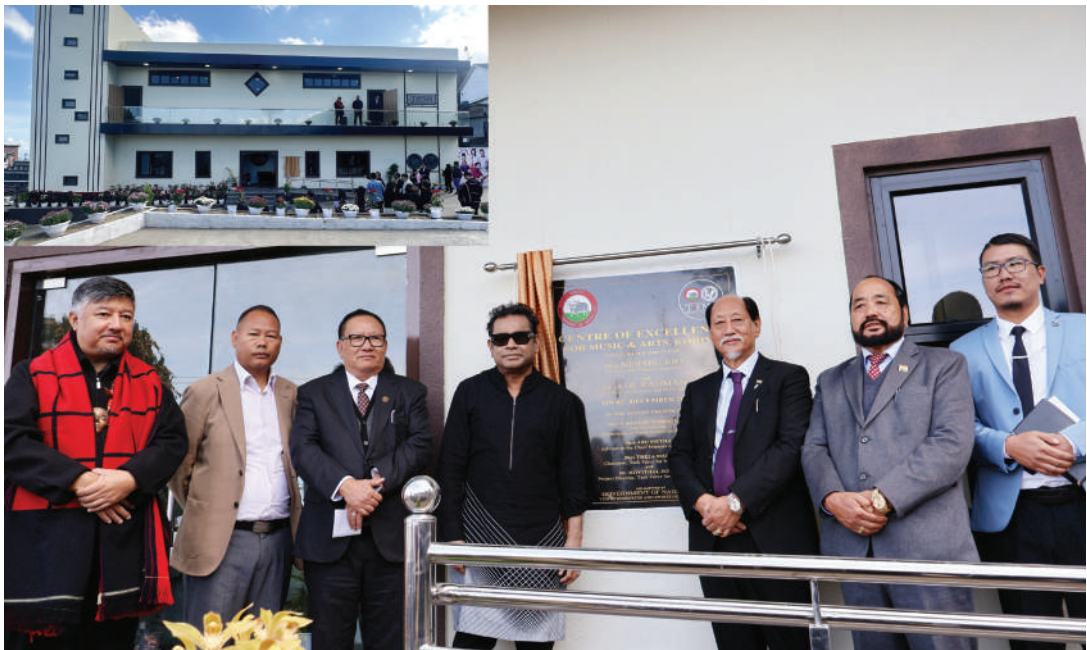
Chief Minister, Neiphiu Rio and his colleagues with Dr. A.R. Rahman during the inauguration of Centre of Excellence for Music & Arts held at Old Minister's Hill, Kohima on 1 st December 2024.