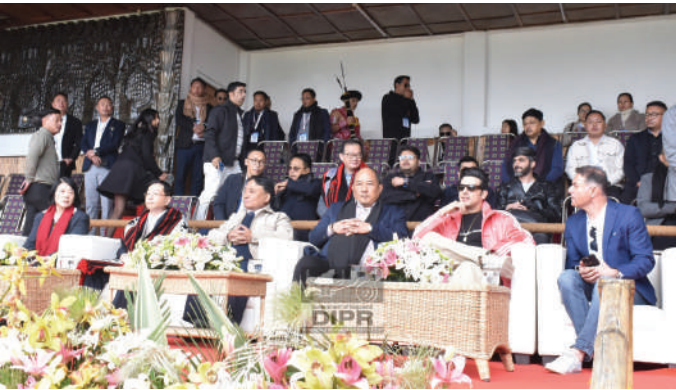
Guests and dignitaries on the 10 th Day of the Cultural Extravaganza at Naga Heritage Village, Kisama on 10 th December 2024.