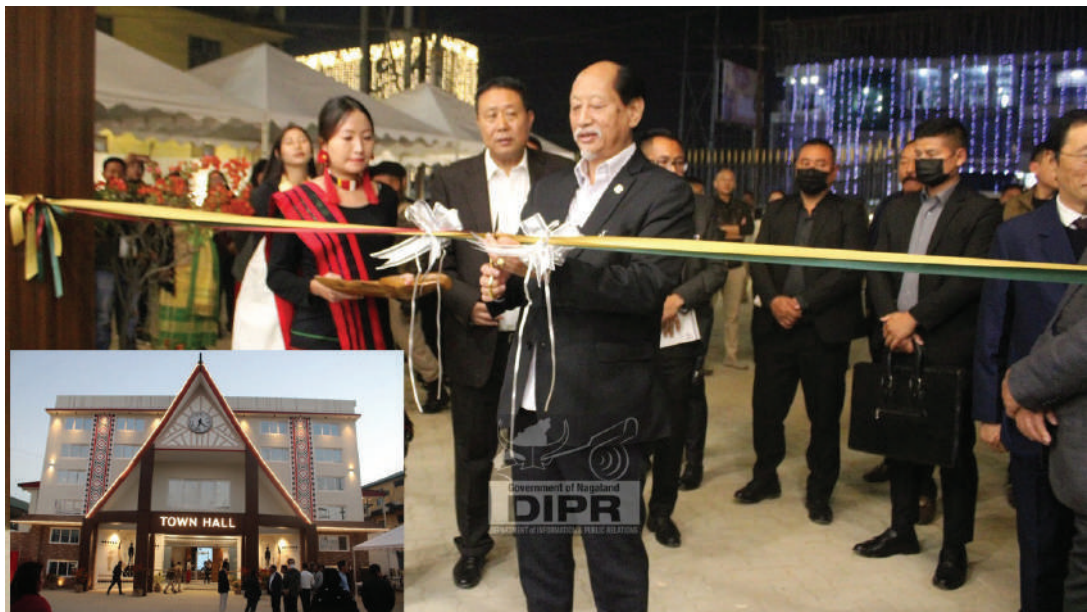
Chief Minister, Neiphiu Rio inaugurating the Dimapur Town Hall at NSA, Super Market, Dimapur on 17 th December 2024.