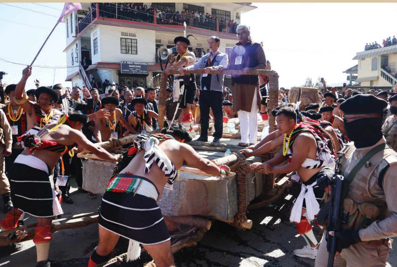
Chief Minister, Neiphiu Rio with Union Minister, Culture and Tourism, Government of India, Gajendra Singh Shekhawat at the Stone Pulling ceremony held from Kipfuzha, Kigwema to Naga Heritage Village, Kisama on 4 th December 2024.