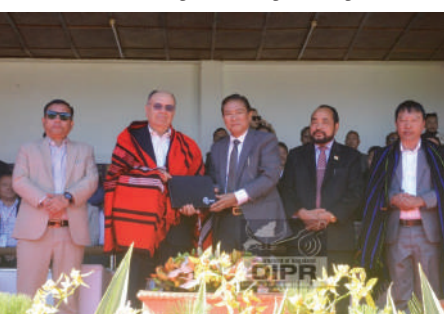
Ambassador of Peru to India, HE Javier Paulinich being felicitated during the cultural programme of the Hornbill Festival at Kisama on 3 rd December 2024.