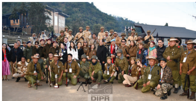
Chief Minister, Neiphiu Rio with dignitaries and participants during the 13 th Edition of WW-II Peace Rally at the WW-II Museum Complex, Kisama on 2 nd December 2024.