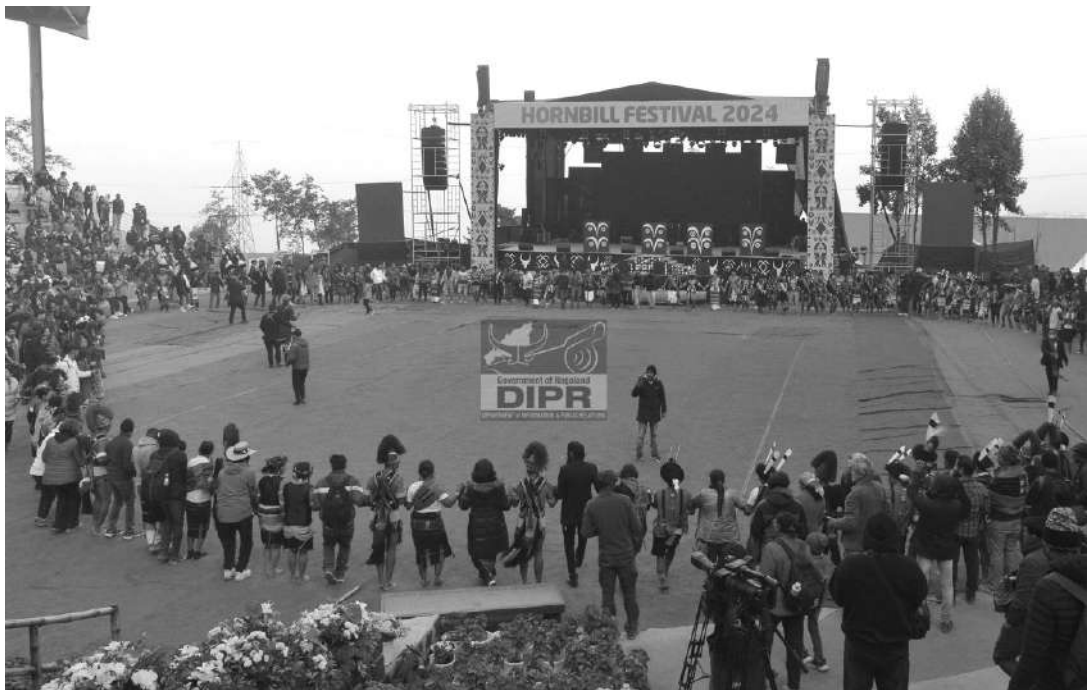
Cultural Troupes performing the Unity Dance on the final day of 25 th Edition of Hornbill Festival at Kisama on 10 th December 2024.

to the world. He also appreciated Tourism Department for their effort in making the Festival a grand success. He also extended gratitude to the TaFMA team for their persistence and commitment, and providing opportunities in the field of music and arts throughout the 10-day period.