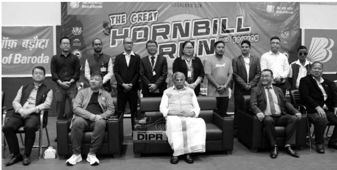
Governor, La Ganesan and officials of Bank of Baroda at the 4 th Edition of the Great Hornbill Festival held at Multi-Discipline Sports Stadium, Sovima, Chumoukedima on 9 th December 2024.