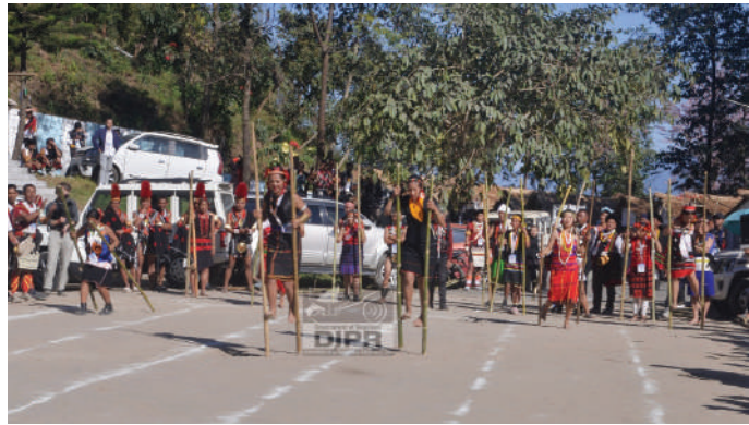
Participants in action during the Stilt Bamboo Race held at Naga Heritage Village, Kisama on 3 rd December 2024.