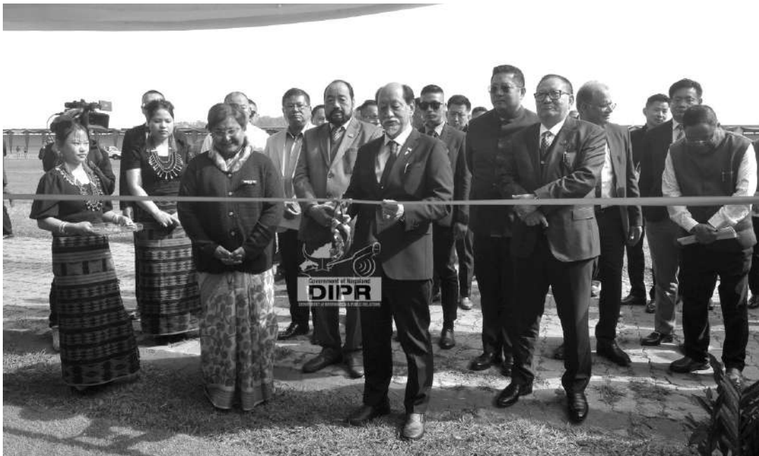
Chief Minister, Neiphiu Rio inaugurating the exhibition stalls during the 62 nd Statehood Day celebration held at Nagaland Civil Secretariat, Kohima on 1 st December 2024.

Special performances were presented by Rengma Chorale, Tseminyu who presented the song titled 'Ma Senyalo,' and Sangtam Cultural Group with the song titled 'Vingvingtii.' The celebration also witnessed a war dance performed by Sumi Cultural Troupe, cultural dance 'Sonkeng Jihang' performed by Khiamniungan Cultural Troupe, folk dance 'Phita' performed by the