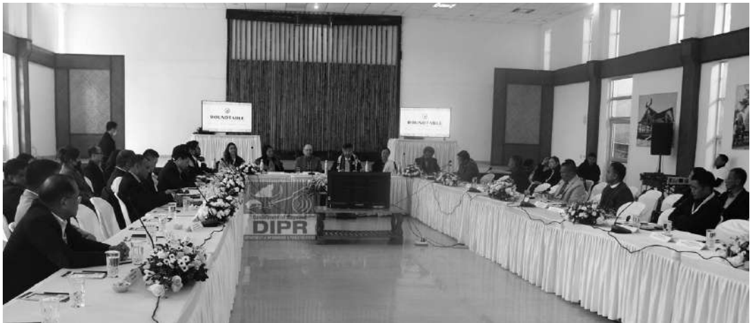
A roundtable meeting with partner countries and partner states of the 25 th Hornbill Festival was held at Bamboo Hall, Kisama on 2 nd December 2024.

particularly in the area of investment. He appreciated and mentioned that the Government of Nagaland is the first state in the whole of North East to have Investment & Development Authority of Nagaland (IDAN) for investment and development of the State. He also emphasized the possibility of collaboration with Nagaland and the whole of North East especially in Tour Operators/ Packages and establishment of industrial parks in the region.