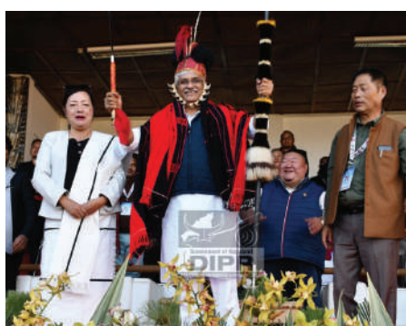
Union Minister of Culture and Tourism, Gajendra Singh Shekhawat being felicitated during the Hornbill Festival at Kisama on 3 rd December 2024.