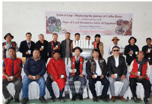
Chiechama Coffee Growers and CVC Members with LRD officials during 'The Heritage Basket,' organised by Chiechama village as part of the Hornbill Festival at Chiechama on 7 th December 2024.