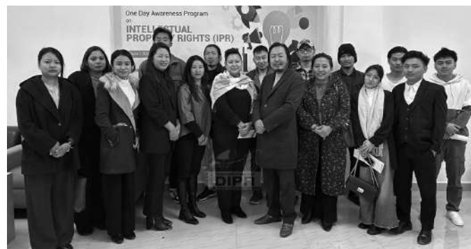
Officials during the One-Day Awareness Programme on Intellectual Property Rights held at IDAN, Kohima on 12 th December 2024.