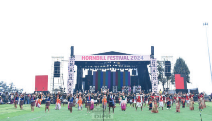
Joint cultural troupes from across the Northeast states performing on the 7 th Day of the Hornbill Festival at Naga Heritage Village, Kisama on 7 th December 2024.