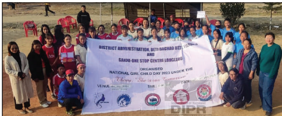
National Girl Child Day was celebrated at Bautung Government Higher Secondary School, Longleng from 21 st to 24 th January 2023.

District Administration, Beti Bachao Beti Padhao and Sakhi One Stop Centre, Longleng celebrated National Girl Child Day from 21 st to 24 th January 2023 under the theme 'She is our Tomorrow' at Bautung Government Higher Secondary School, Longleng.