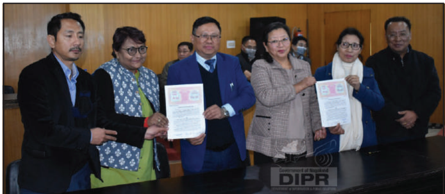
A Memorandum of Understanding was signed between Nagaland Institute of Medical Sciences and Research and NHAK, affiliating NHAK as a teaching hospital for NIMSR at Directorate of Health & Family Welfare, Kohima on 25 th January 2023.