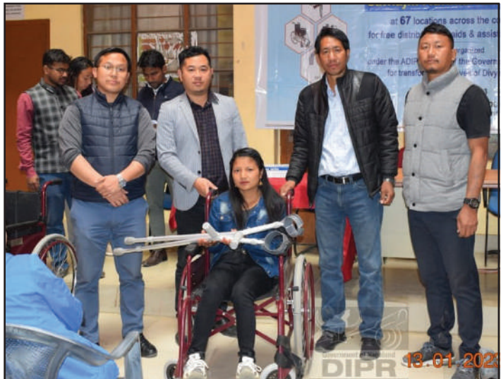
Officials along with a beneficiary during the distribution of aid and assistive device at DC's Conference Hall, Longleng on 14 th January 2023.

DWO in-charge Longleng, Longlang Phom appealed to ALIMCO to hold more such assessment camps in different parts of the district in the future to ensure coverage of more beneficiaries.