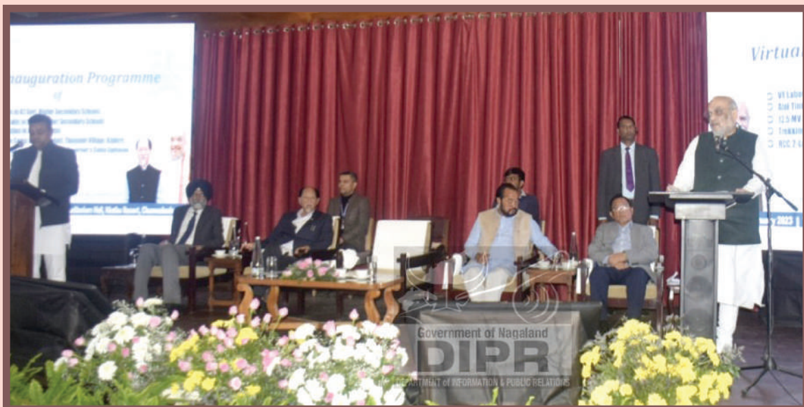
Union Minister of Home Affairs & Cooperation, Amit Shah virtually inaugurated various projects from Nousi Auditorium Hall, Chümoukedima on 6 th January 2023.