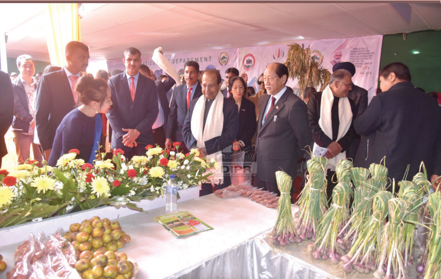
Governor, Prof. Jagdish Mukhi and Chief Minister, Neiphiu Rio visiting the exhibition stalls set up during the 74 th Republic Day celebration at Nagaland Civil Secretariat Plaza, Kohima on 26 th January 2023.