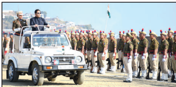
Speaker, Nagaland Legislative Assembly, Sharingain Longkumer inspecting the parade contingents during the 74 th Republic Day celebration at Zunheboto on 26 th January 2023.

Zunheboto district celebrated Republic Day at the Local Ground with Sharingain Longkumer, Speaker of Nagaland Legislative Assembly as