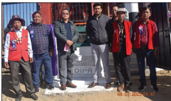
Minister, Health & Family Welfare, S. Pangnyu Phom inaugurated the Customary Court of GB's Association of Longleng on 9 th January 2023.

Asserting that GBs are the guardian and custodians of the customary law and order, Minister, Health & Family Welfare, Nagaland, S. Pangnyu Phom called upon the GB Association, Longleng to maintain dignity and prestige of the GB, and discharge their roles and responsibilities wisely with utmost sincerity. Pangnyu was addressing the inaugural function of the Customary Court of GB's Association of Longleng on 9 th January 2023 near the Public