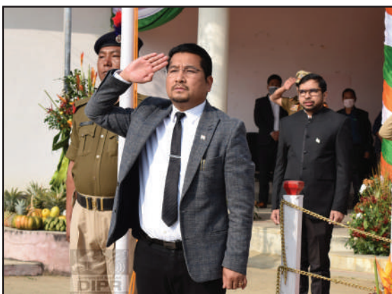
Minister, Public Works Department (Housing and Mechanical), Tongpang Ozukum taking the rashtriya salute on the occasion of 74 th Republic Day celebration at Peren on 26 th January 2023.

In Peren, Minister, Housing & Mechanical, Tongpang Ozukum after unfurling the national flag, took rashtriya salute from the parade contingents, and delivered the Republic Day speech at Deputy Commissioner's Office Complex, Peren HQ, on the occasion of the 74 th Republic Day celebration on 26 th January 2023.