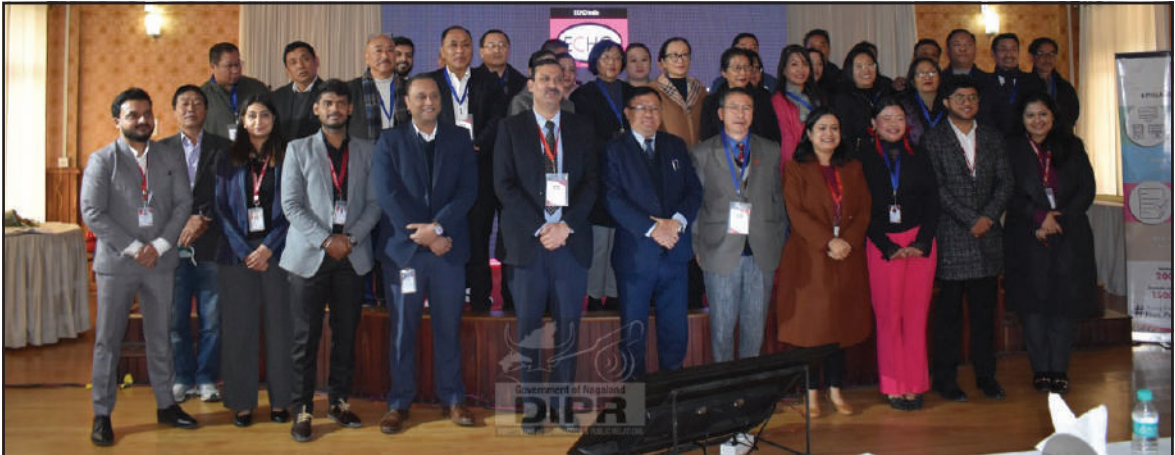
A two-day orientation workshop for the State of Nagaland on Indian Public Health Standards 2022 was held at Directorate of Health & Family Welfare, Kohima on 13 th January 2023.

and requested all the officers present to propose setting up health units only on a need basis. He also urged the officers to have a consultation sitting with the churches and community to work together and come into partnership in building up community-based health centers in those that are lying non-functional.