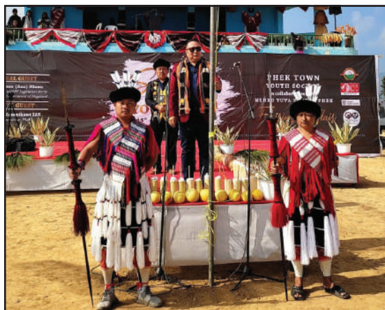
MLA Kuzholuzo Azo Nienu graced the Sükrünye Festival held at Local Ground, Phek on 14 th January 2023.

Azo Nienu delivered Sükrünye greetings on behalf of the Government of Nagaland to all the Chakhesang people, and he also expressed gratitude to Phek Town Youth Society and Nehru Yuva Kendra Phek for organizing the Sükrünye Festival in a grand manner. He shared about the objective of the Festival and said that Sükrünye Festival is to renew the body and soul and make