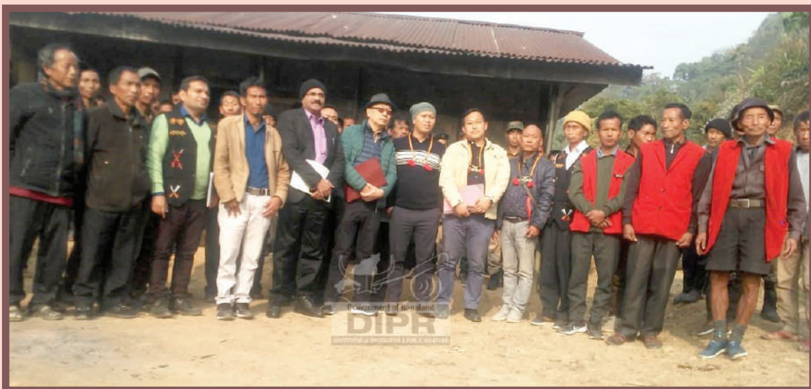
Officers from the Ministry of Development of North-Eastern Region, officials of District Administration, Mon and Longleng with village leaders and GBs during their visit to Sawa village on 18 th January 2022.