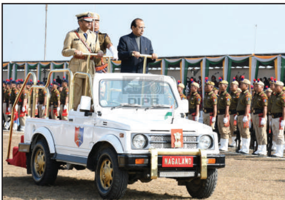
Governor, Nagaland, Prof. Jagdish Mukhi inspecting the parade contingents during the 74 th Republic Day celebration at Nagaland Civil Secretariat Plaza, Kohima on 26 th January 2023.

Addressing the gathering on the occasion of the 74 th Republic Day celebration at Nagaland Civil Secretariat Plaza, Kohima on 26 th January 2023, Governor of Nagaland, Prof. Jagdish Mukhi stated that the formation of the Republic on 26 th January 1950 was the first milestone in the march towards realizing the dreams of the people in the aftermath of India's Independence.