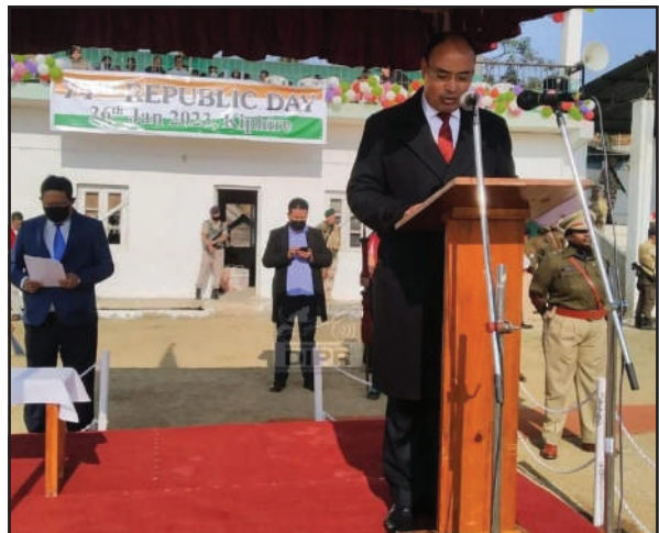
MLA Yitachu addressing the gathering during the 74 th Republic Day celebration at Kiphire on 26 th January 2023.

The 74 th Republic Day celebration was observed at the Public Ground, Kiphire HQ on 26 th January 2023. MLA, Yitachu graced the programme as the special guest. He unfurled the national flag and took the salute from the six parade contingents.