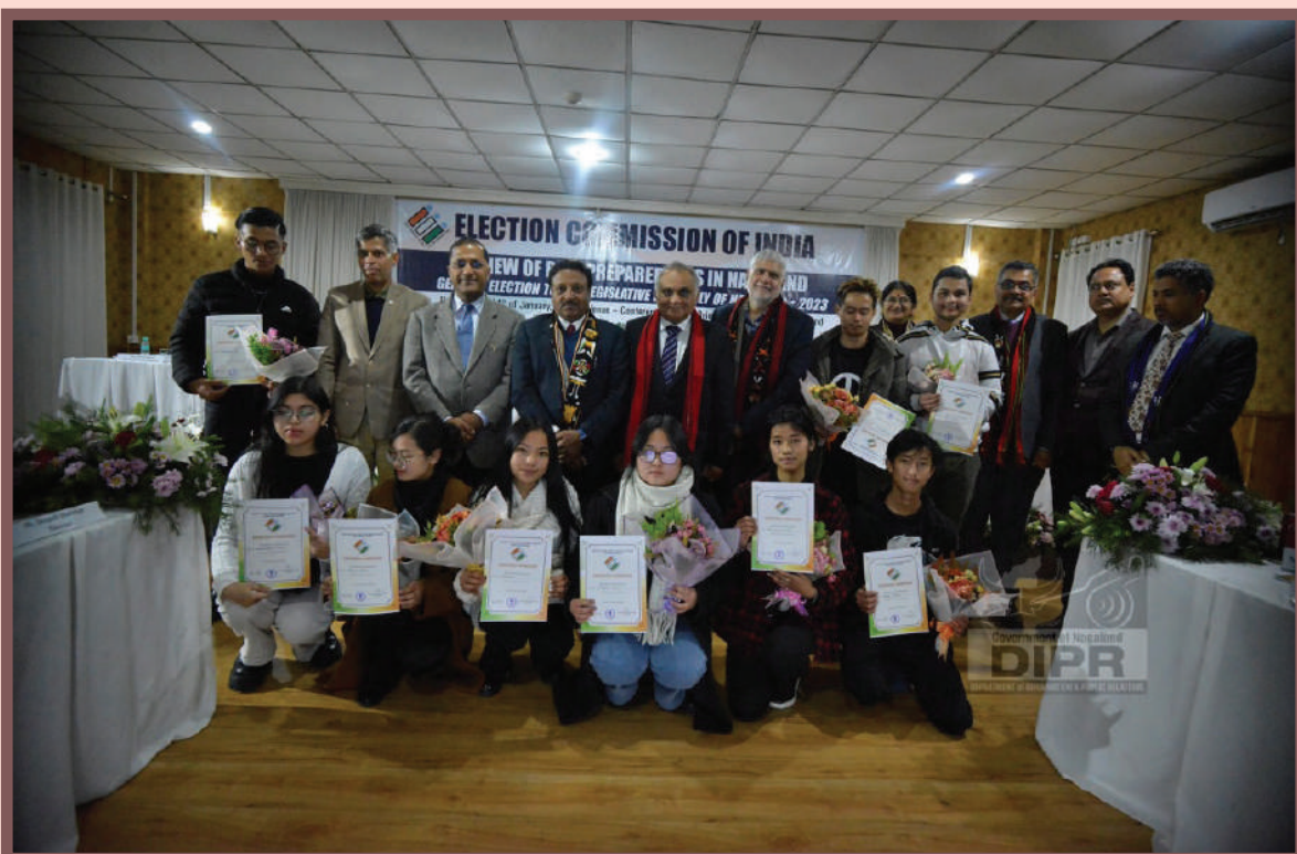
First time voters being felicitated by Election Commission of India at de Oriental Grand Hotel, Kohima on 13 th January 2023.