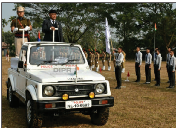
Minister, Geology & Mining, Soil & Water Conservation, V. Kashiho Sangtam inspecting the parade contingents during the 74 th Republic Day celebration at Niuland on 26 th January 2023.

The 74 th Republic Day celebration at Niuland