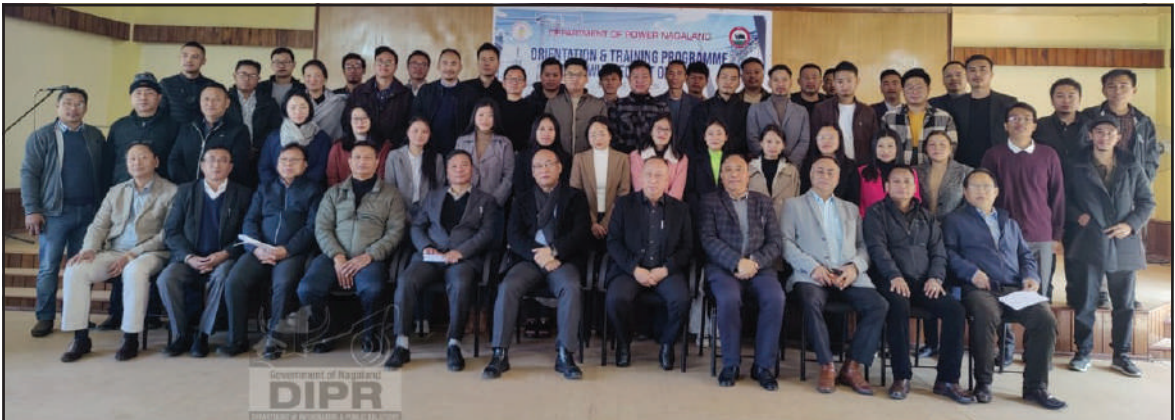
Newly recruited officers with Engineer-in-Chief, Chief Engineers and senior officers of Power Department during the Orientation-cum-Training held at Kohima on 20 th January 2023.