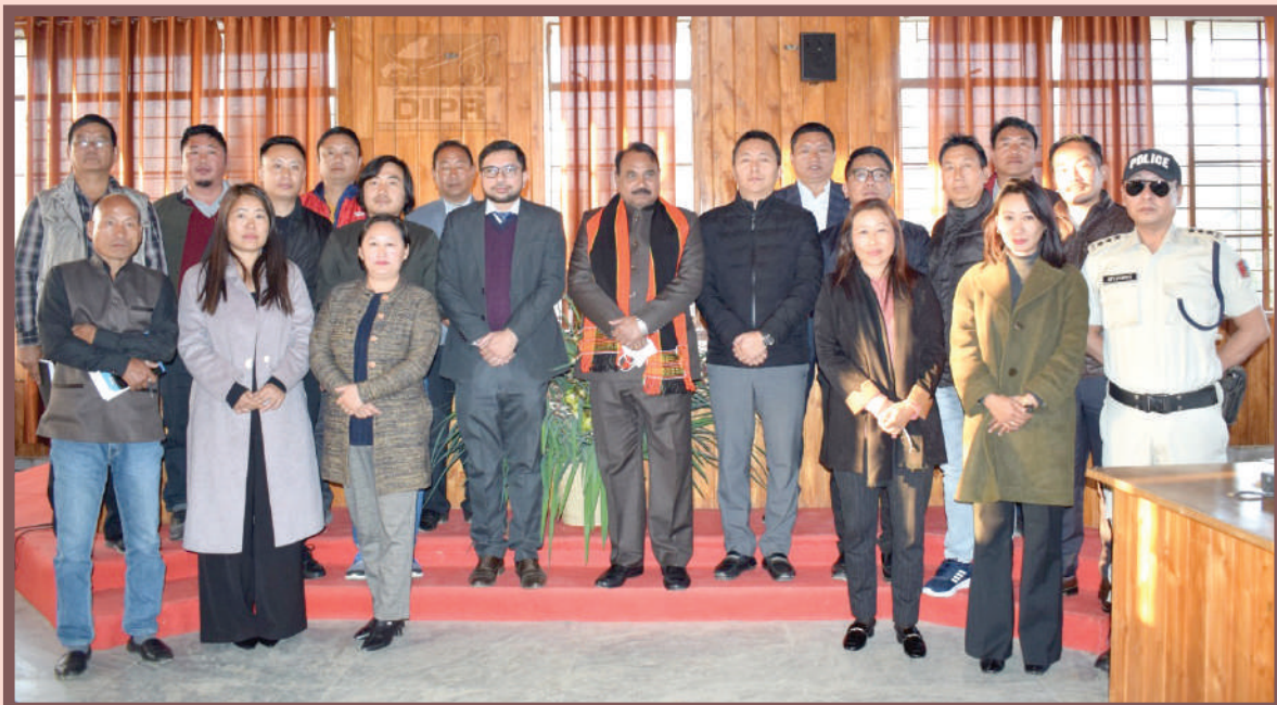
Minister of State, Micro, Small & Medium Enterprises, Bhanu Pratap Singh Verma with officials during a meeting held with officials of Peren district at DC's Conference Hall, Peren on 5 th January 2023.