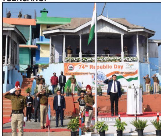
Deputy Speaker, Nagaland Legislative Assembly, Yangseo Sangtam taking the rashtriya salute on the occasion of 74 th Republic Day celebration at Tuensang on 26 th January 2023.

The celebration was held at the Parade Ground Yangseo Sangtam, Deputy Speaker, NLA as the special guest, who unfurled the national flag and took rashtriya salute from the