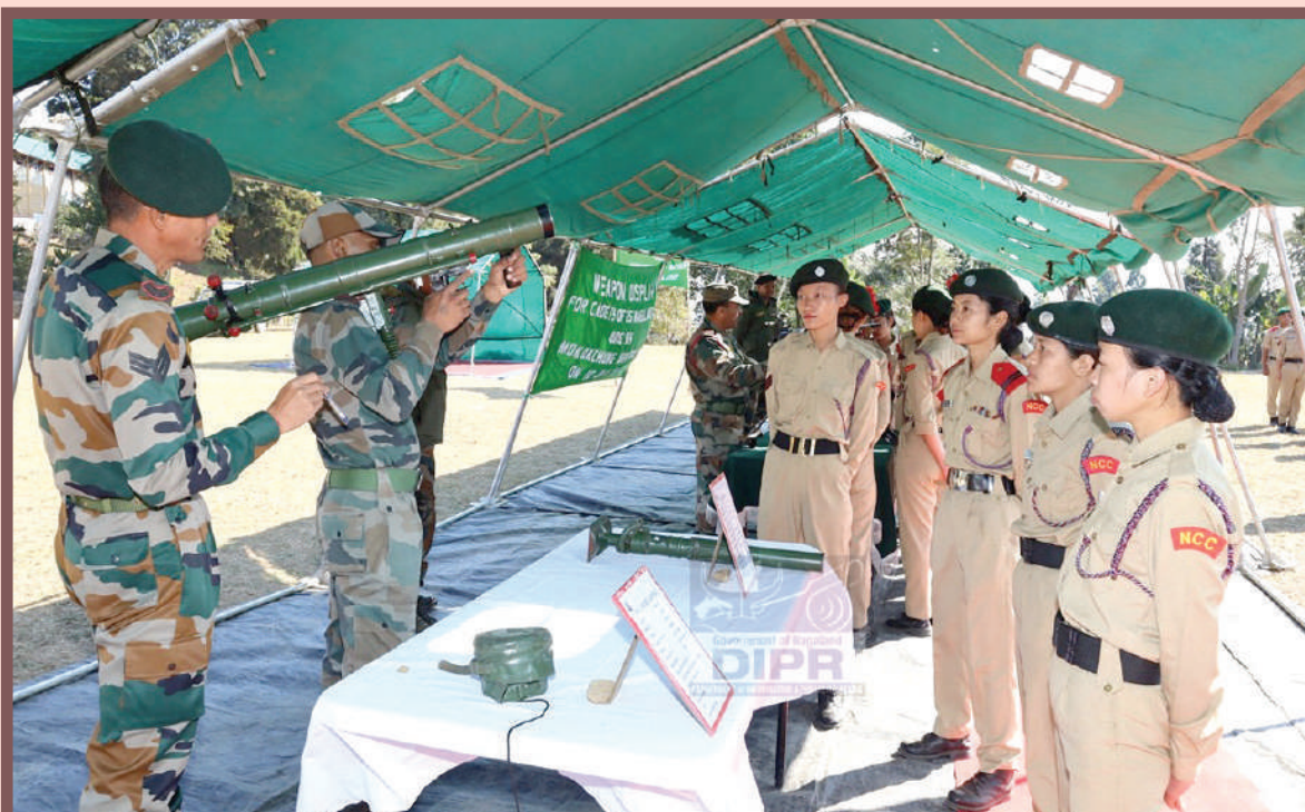
NCC cadets at the demonstration of weapons during the Combined Annual Training Camp held at Fazl Ali College Ground, Mokokchung on 10 th January 2023.