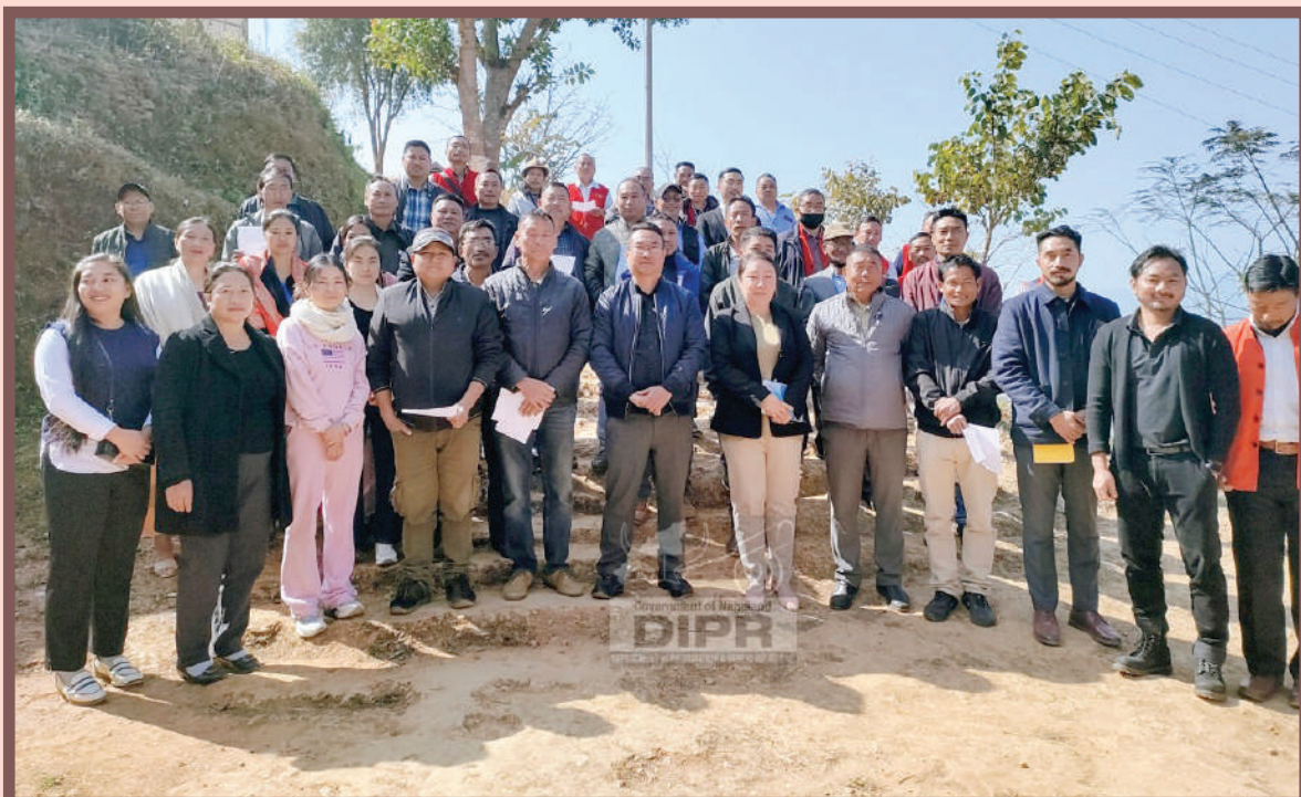
Officials and participants during the 13 th National Voters' Day, which was held at ADC's Office, Meluri on 25 th January 2023.