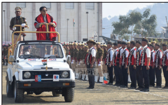
Advisor, Food & Civil Supplies and Legal Metrology & Consumer Protection, Pukhayi Sumi inspecting the parade contingents during the 74 th Republic Day celebration at Imkongmeren Sports Complex, Mokokchung on 26 th January 2023.

The 74 th Republic Day was celebrated at Imkongmeren Sports Complex, Mokokchung, with Advisor, F&CS, LM&CP, Nagaland, Pukhayi Sumi unfurling the national flag and delivering