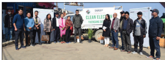
ADC, Thungchanbemo with officials and performers at the Systematic Voters Education and Electoral Participation programme held at Tower Clock, Tuensang on 25 th January 2023.

The District Administration and Election Office, Tuensang organized a Systematic Voters Education and Electoral Participation (SVEEP) programme at Tower Clock, Tuensang on 25 th January 2023.