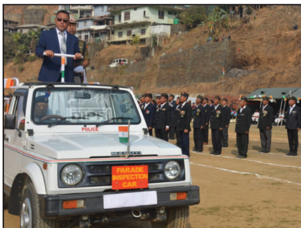
Minister, Health & Family Welfare, Pangnyu Phom inspecting the parade contingents during the 74 th Republic Day celebration at Mon on 26 th January 2023.

The 74 th Republic Day was observed in Mon on 26 th January 2023 at the Local Ground. The programme began with the Parade Review by SP, Mon, T. Uniel Kichu, IPS. The Ceremonial Flag Hoisting and Inspection of Parade were carried out by the special guest, Minister of Health & Family Welfare, S. Pangnyu Phom.