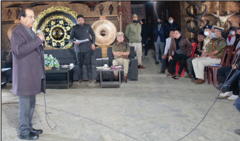
Governor, Prof. Jagdish Mukhi interacting with heads of offices in Mon district at Longwa village on 21 st January 2023.

Modi was talking on some minor issues. But the launch of the scheme has created wonders in the country since children in schools developed the habit of not littering around, and today the common site of throwing trash out of the car window in Delhi is not seen. He added that the notion of sanitation is adopted through inspiration from Mahatma Gandhi.