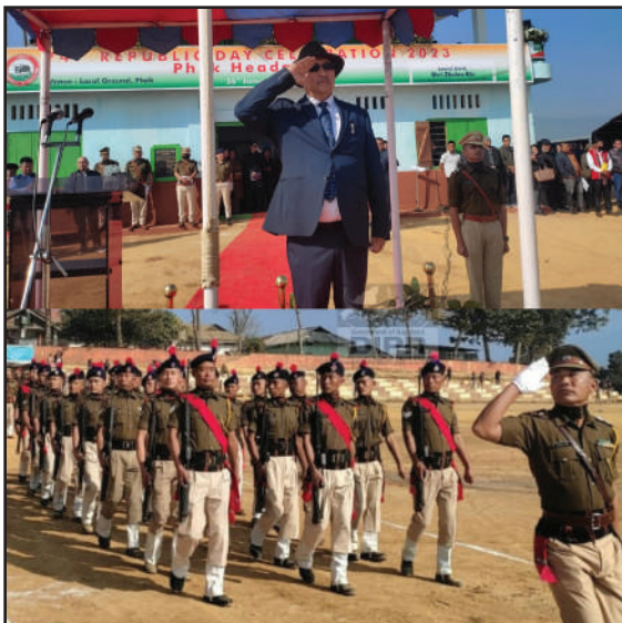
Advisor, Sericulture, Excise and Minority Affairs, Zhaleo Rio taking the rashtriya salute on the occasion of 74 th Republic Day celebration at Phek on 26 th January 2023.

Advisor for Sericulture, Excise & Minority Affairs, Zhaleo Rio graced the 74 th Republic Day celebration at Local Ground, Phek HQ. After unfurling the national flag, taking the rashtriya salute, he also inspected the parade contingents, followed by the Republic Day speech. He inaugurated the exhibition stalls put up by Agriculture and Allied Departments during the celebration.