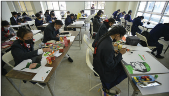
Students participating in the Drawing & Painting Competition on the life of Netaji Subhas Chandra Bose held at the Capital Cultural Hall, Kohima on 18 th January 2023.

one of the most patriotic and loved freedom fighters in the nation, and that Netaji had a close connection with the Naga people when he and the Indian National Army came and stayed in Nagaland during the Second World War.