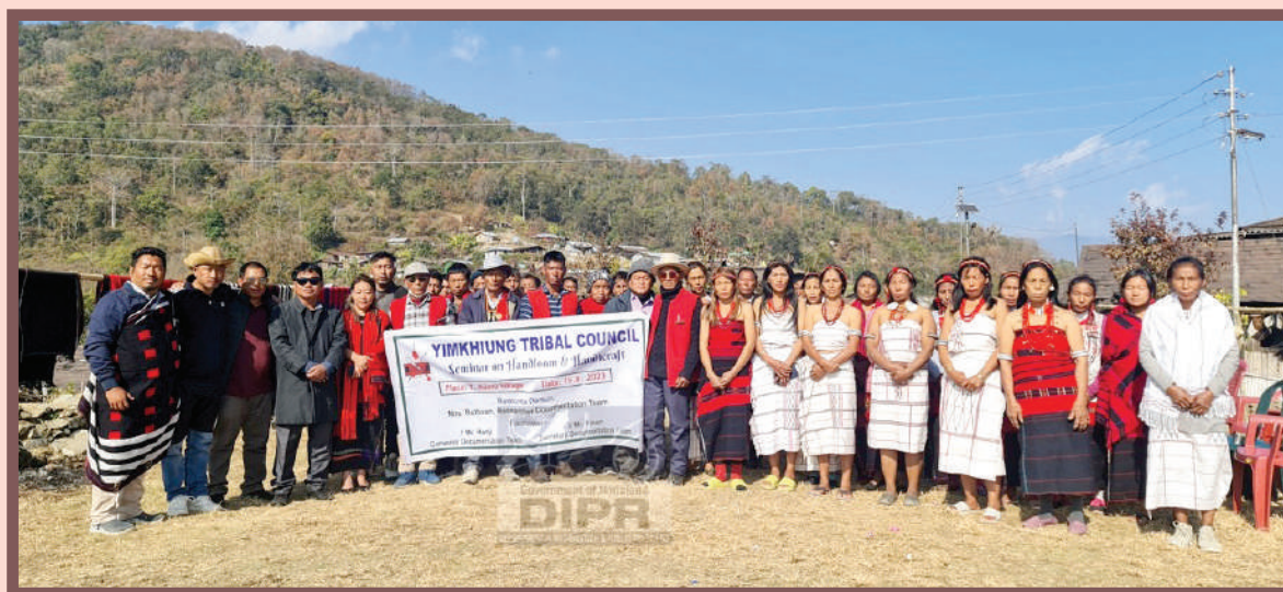
Officials and participants during a seminar on handloom and handicrafts held at Y. Anner village, Shamator on 18 th January 2023.