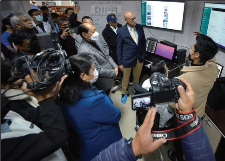
Chief Minister, Neiphiu Rio along with other officials visiting the Tele ICU Hub at Naga Hospital Authority Kohima on 6 th January 2023.