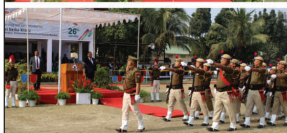
Minister, Planning & Coordination, Parliamentary Affairs and Land Revenue, Neiba Kronu taking the rashtriya salute during the 74 th Republic Day celebration at Chumoukedima on 26 th January 2023.

Chumoukedima Town Public Ground. On arrival, Minister of Planning & Coordination, Parliamentary Affairs and Land Revenue, Neiba Kronu unfurled the national flag and inspected the parade contingents, followed by his address.