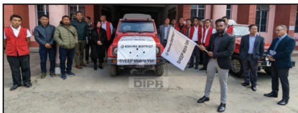
Deputy Commissioner & District Election Officer Kohima, Shanavas C, IAS flagging off a Mobile Demonstration Van at the DC's Office Complex, Kohima on 11 th January 2023.

As part of the Systematic Voters Education and Electoral Participation (SVEEP) campaign and in connection with the forthcoming 14 th Nagaland Legislative Assembly election 2023, Mobile Demonstration Van (MDV) was flagged off by Deputy Commissioner & District Election Officer Kohima, Shanavas C, IAS at the DC's Office Complex, Kohima on 11 th January 2023. The demonstration was done at five locations within Kohima town to create awareness of the use of the Electronic Voting Machine (EVM) and Voters' Verifiable Paper Audit Trail (VVPAT). Altogether, 89 electors participated in the awareness programme. Besides, the message on a free and fair election for the upcoming election on NLA 2023 was disseminated in vernacular language.