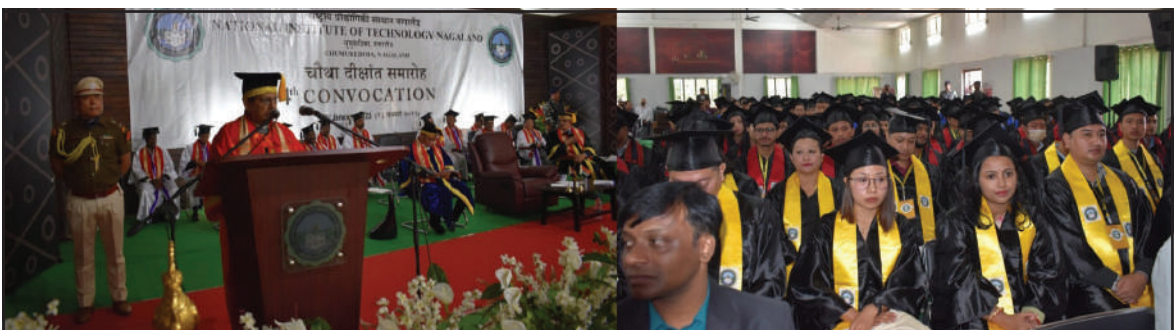
Prof. Jagdish Mukhi, Governor of Nagaland and Assam graced the 4 th convocation of the National Institute of Technology (NIT) Nagaland at Chumoukedima Town Council Hall on 23 rd January 2023.