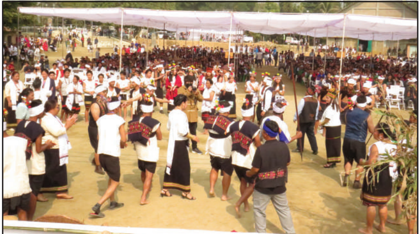
Crowds gathered during the Mimkut Mini Hornbill Festival celebrated at GMS Ground, Molvom village, Medziphema sub-division, Chümoukedima on 16 th January 2023.