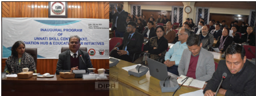
Chief Secretary addressing the gathering during the inauguration of CSR Initiatives Unnati Skill Centre Kohima, UNXT, and Innovation Studio was held at the State Capital Secretariat Conference Hall, Kohima on 12 th January 2023.