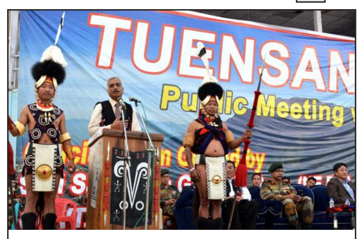
Joint Secretary MHA speaking at Tuensang

the proposed demand. The speakers also requested the visited guest also initiate to pursue the matter in the earliest.