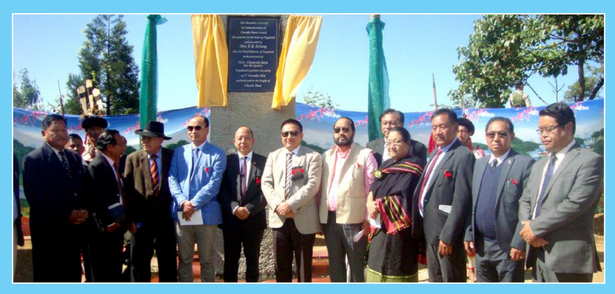
Chief Minister T.R. Zeliang and other dignitaries at the inaugural of Chozuba Town Council on 2nd November 2016.