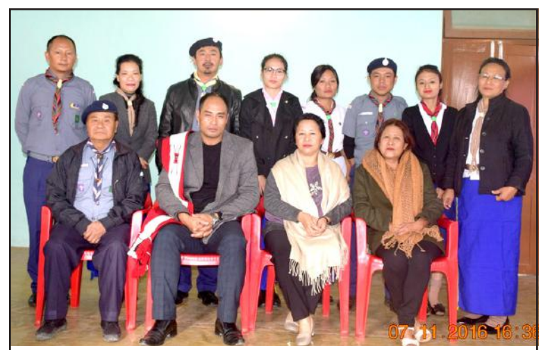
DYRO Mokokchung along with other officials on the occasion of 66th Bharat Scouts & Guides Foundation Day Celebration at Mokokchung on 7th November 2016.

also mentioned that the overall personality development of the students are enhanced through extra-curricular activities.