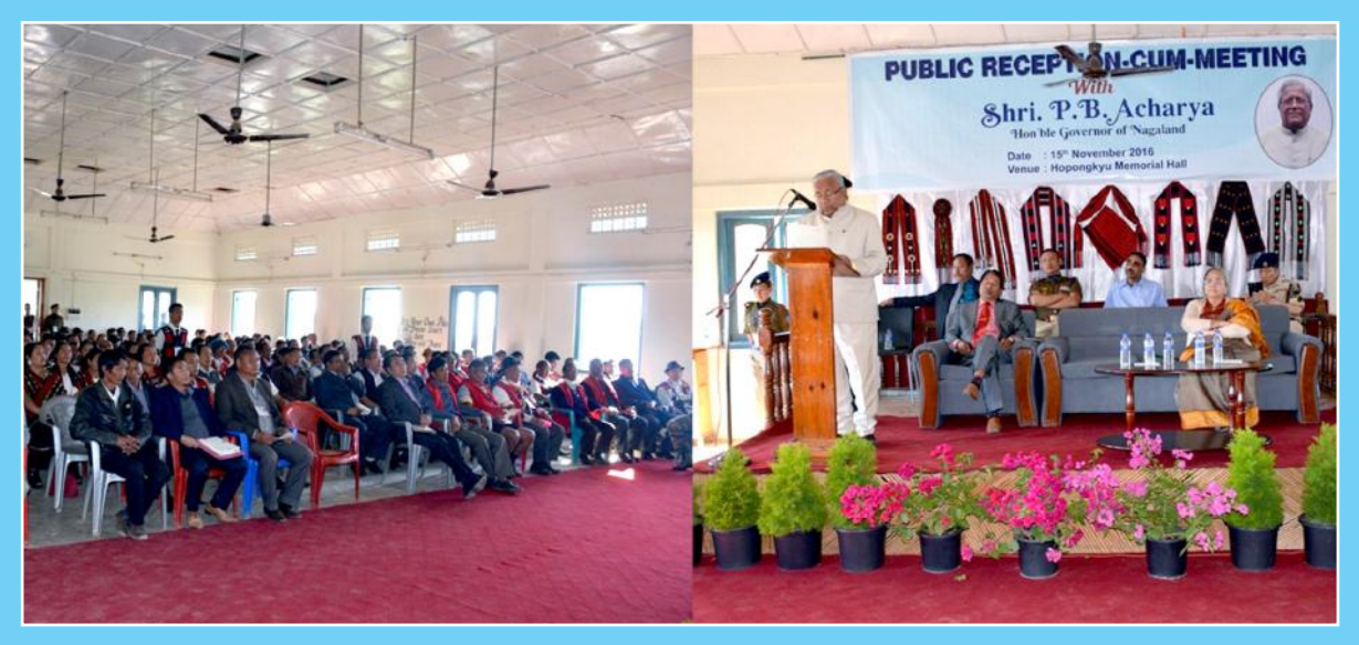
Governor of Nagaland P.B. Acharya addressing at the public reception at Kiphire on 15th November 2016.