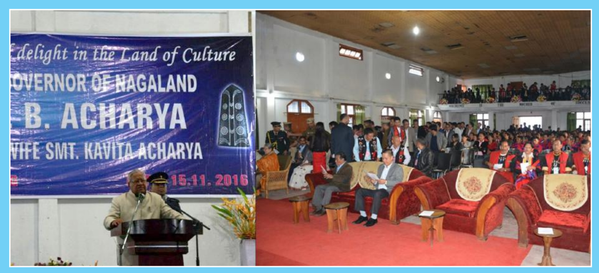
Governor, P.B. Acharya addressing the citizens of Tuensang Town at GHSS Auditorium Tuensang on 15th November, 2016.