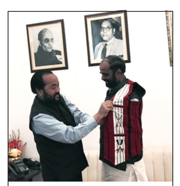
Nagaland Home Minister, Y. Patton felicitating the Union Minister of State for Home,Hansraj Gangaram Ahir on 9th November 2016 at New Delhi.

Home Minister, Government of Nagaland, Y.Patton, called on Union Minister of State for Home, Hansraj Gangaram Ahir on 9th November 2016 at New Delhi and congratulated him on his new assignment. As the Union Minister of State is in-charge of Police Modernization, Patton