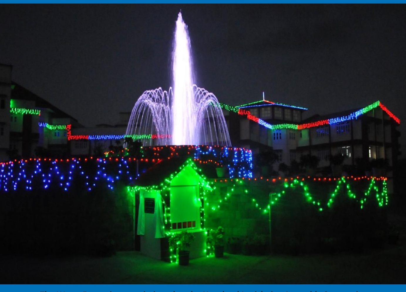
The Water Fountain commissioned at the Nagaland Legislative Assembly Secretariat on 15<sup>th</sup> November 2016.

Published by: The Directorate of Information & Public Relations