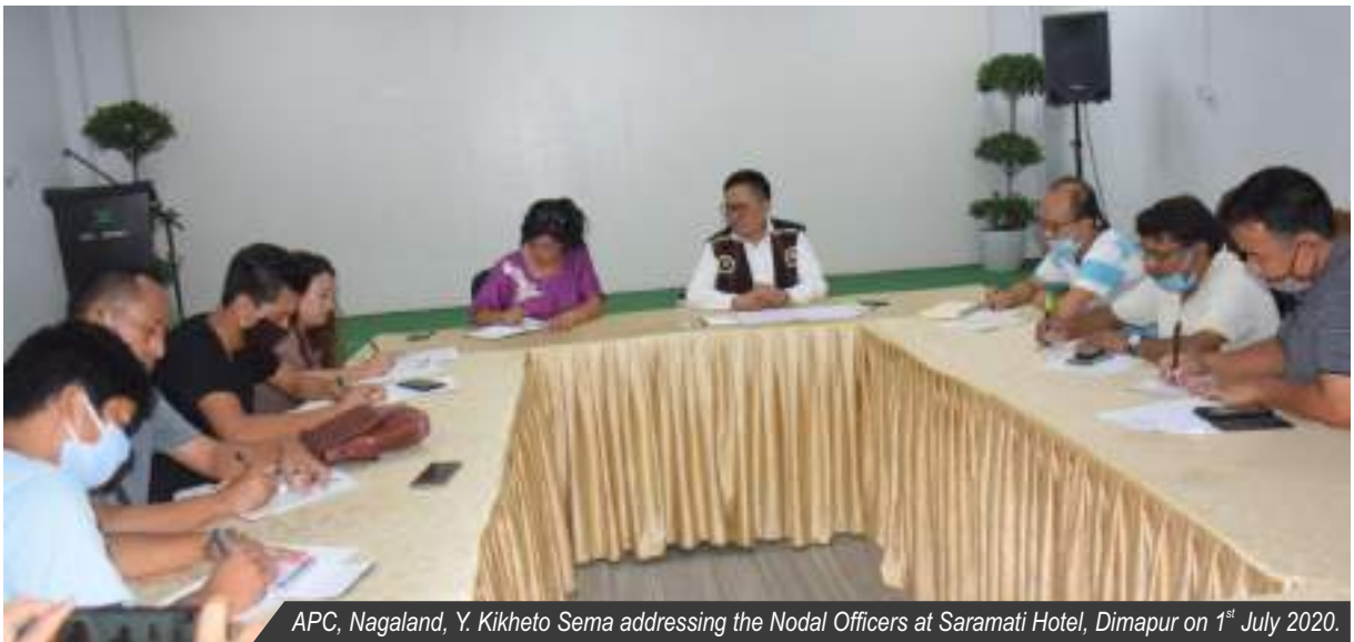
APC, Nagaland, Y. Kikheto Sema addressing the Nodal Officers at Saramati Hotel, Dimapur on 1 st July 2020.

Till 1 st July 2020, a total of 12,268 samples have been tested. Results of 11,630 have been received. Out of the total of 12,268 samples, 8,070 samples have been received at the BSL-3 Lab at Naga Hospital Authority Kohima (NHAK) and a total of 7,881 samples have been tested, out of which 388 samples have tested positive. In addition a total of 5,669 samples have been tested by TrueNat, out of which 110 samples tested positive and sent for confirmation by RT-PCR.