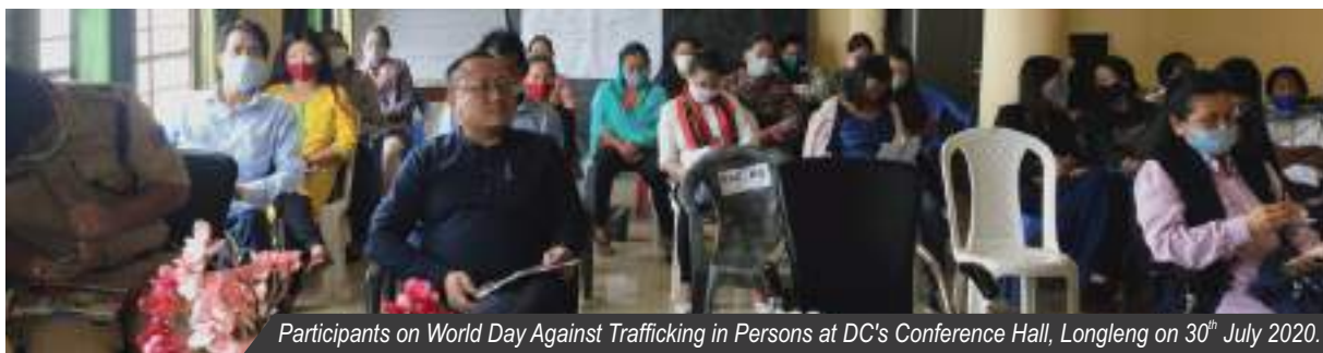
Participants on World Day Against Trafficking in Persons at DC's Conference Hall, Longleng on 30 th July 2020.

The order stated that, the earlier order on total ban of transportation of pigs and slaughtering of pigs for consumption purpose, under Bhandari sub-division, will continue and the ADC has asked the concerned department to continue monitoring the case for public health safety.