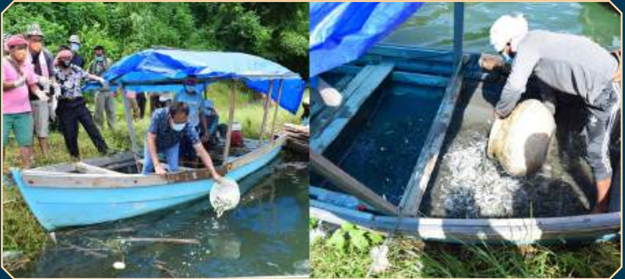
Fingerlings provided by the Department of Fisheries and Aquatic Resources being released at Doyang Reservoir, Wokha on 17 th July 2020.