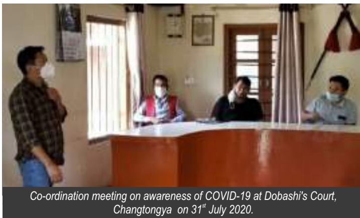
Co-ordination meeting on awareness of COVID-19 at Dobashi's Court, Changtongya on 31 st July 2020.

social distancing, wearing face masks, using hand sanitisers and sanitising the church before and after