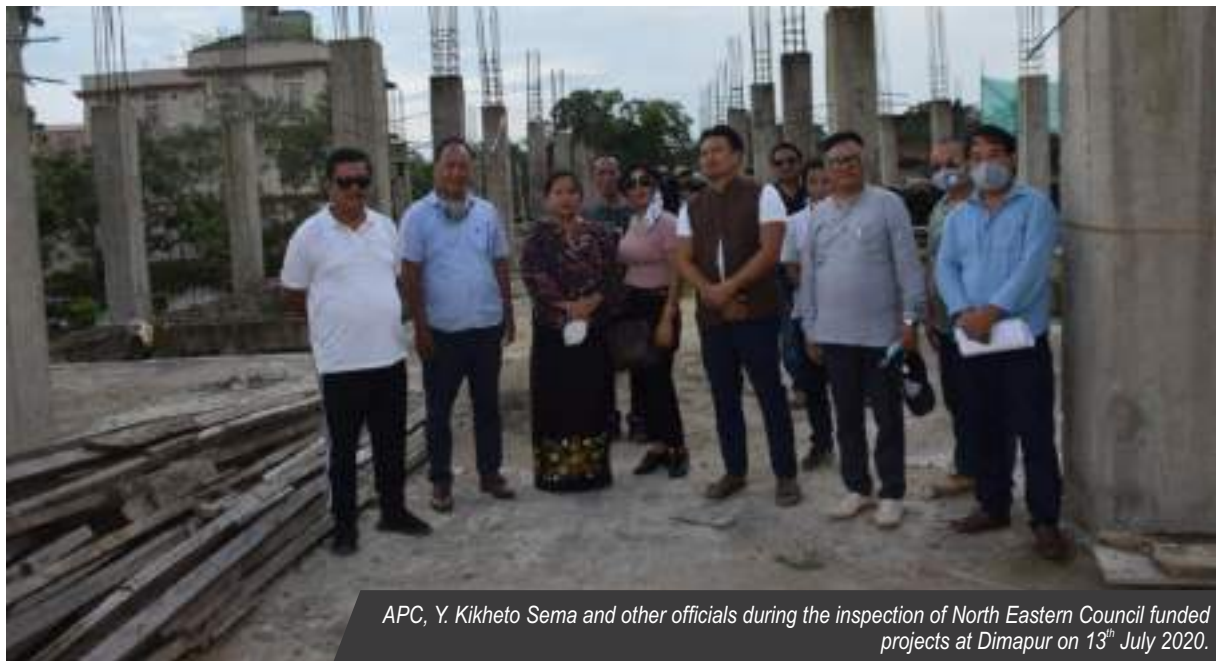
APC, Y. Kikheto Sema and other officials during the inspection of North Eastern Council funded projects at Dimapur on 13 th July 2020.

As per the order of Chief Secretary, Nagaland, a team headed by Agriculture Production Commissioner, Y. Kikheto Sema monitored and inspected the North Eastern Council (NEC) funded projects on 13 th July 2020, and called for accountability and transparency in all the NEC funded projects.