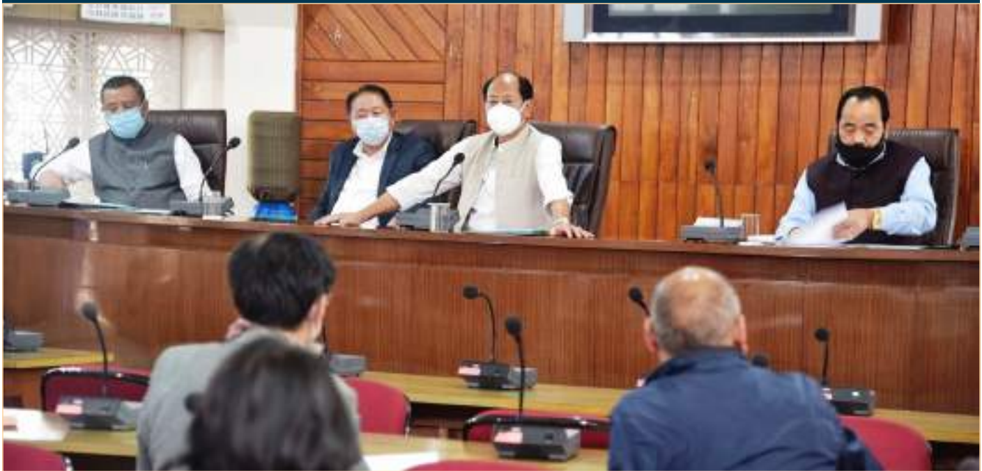
Chief Minister, Neiphiu Rio addressing the State level meeting on monsoon preparedness at Nagaland Secretariat Conference Hall on 4 th July 2020.