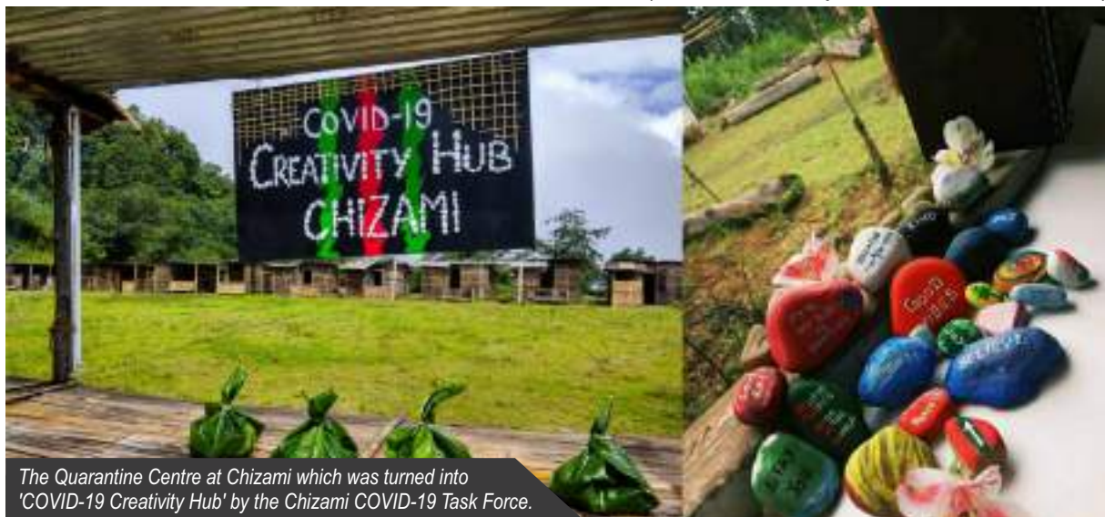
The Quarantine Centre at Chizami which was turned into 'COVID-19 Creativity Hub' by the Chizami COVID-19 Task Force.

(A DIPR feature by Avika Awomi, IA, Pfutsero)