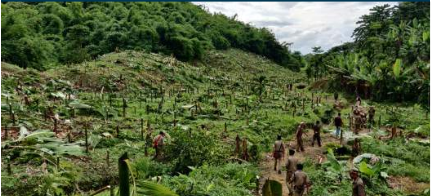
Anti- Encroachment Team clearing illegal plantations on government purchased land at Bhandari, Wokha on 10 th July 2020.