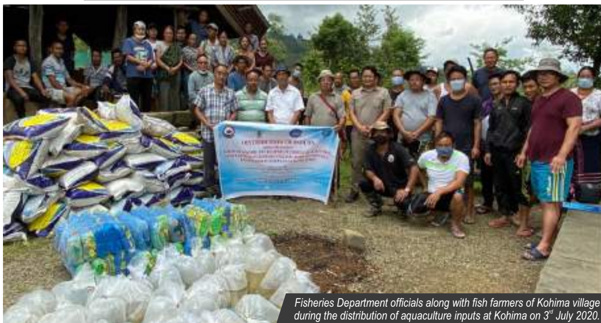
Fisheries Department officials along with fish farmers of Kohima village during the distribution of aquaculture inputs at Kohima on 3 rd July 2020.

Additional Deputy Commissioner, Rhosietho Nguori highlighted on the overall situation of Tening sub-division. The meeting was attended by Tening Sub-Divisional Task Force, government officials, GBs, pastors and public leaders.