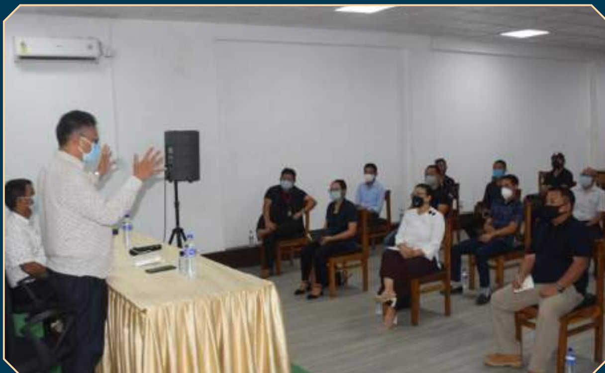
Agriculture Production Commissioner, Nagaland, Y. Kikheto Sema addressing a meeting of Nodal Officers of all the districts of Nagaland at Saramati Hotel, Dimapur on 1 st July 2020.