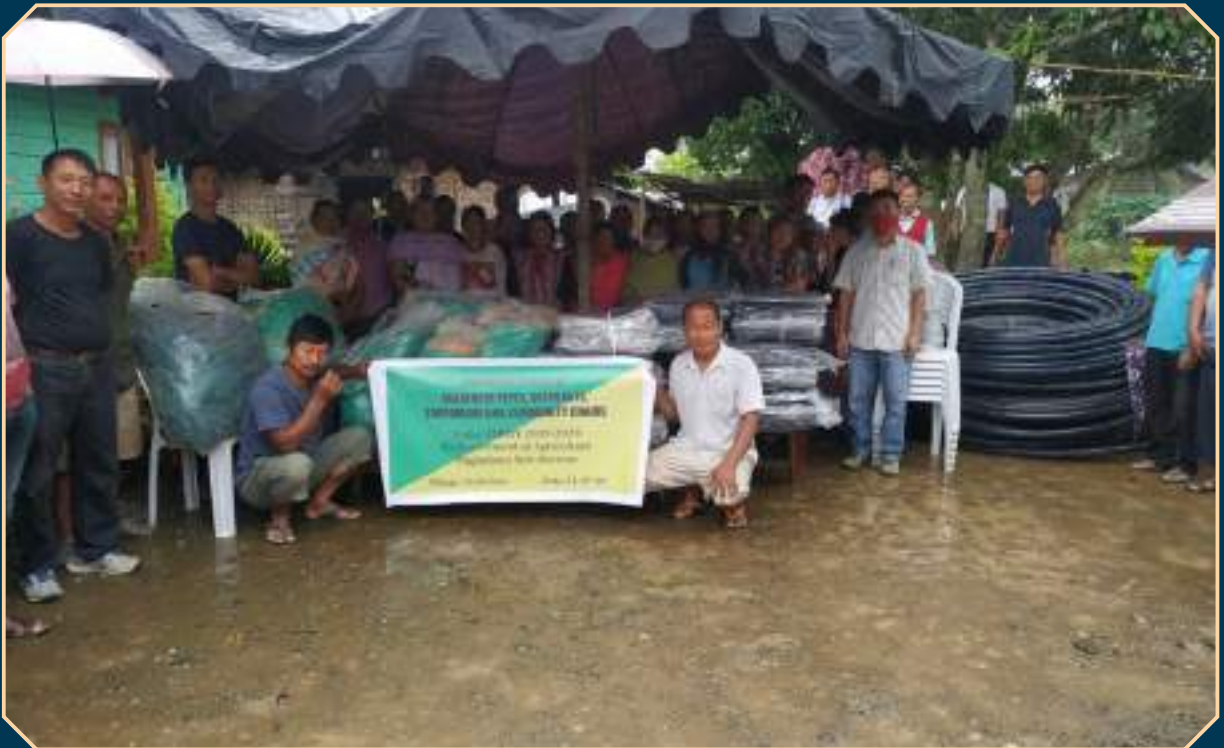
Fishing equipments and materials distributed to farmers by the Department of Agriculture, under Pradhan Mantri Krishi Sinchayee Yojana scheme at Chishilimi, Pughoboto on 21 st July 2020.