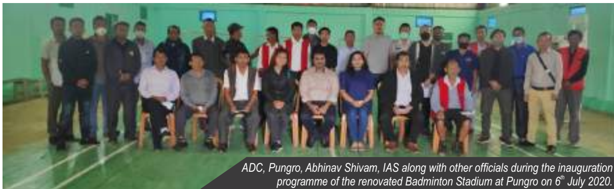
ADC, Pungro, Abhinav Shivam, IAS along with other officials during the inauguration programme of the renovated Badminton Stadium at Pungro on 6 th July 2020.

The Badminton Stadium at Pungro town, which was in dilapidated condition has been successfully renovated. An inauguration programme was held on 6 th July 2020 at the Indoor Stadium.