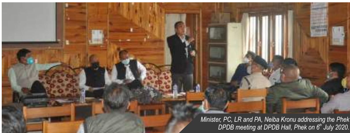
Minister, PC, LR and PA, Neiba Kronu addressing the Phek DPDB meeting at DPDB Hall, Phek on 6 th July 2020.

The monthly meeting of Phek District Planning & Development Board was held on 6 th July 2020 at Phek DPDB Hall under the chairmanship of Minister for Planning & Co-ordination, Land Revenue and Parliamentary Affairs, Neiba Kronu. Members of Legislative Assembly from Phek district also attended the meeting.