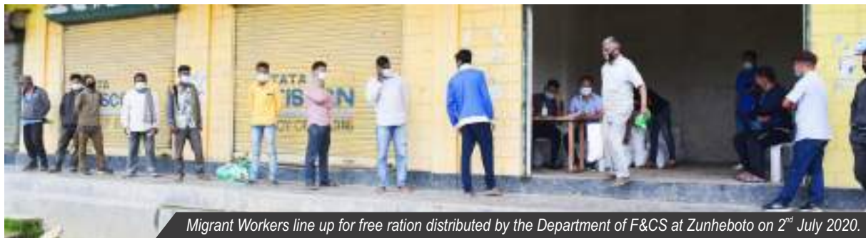
Migrant Workers line up for free ration distributed by the Department of F&CS at Zunheboto on 2 nd July 2020.