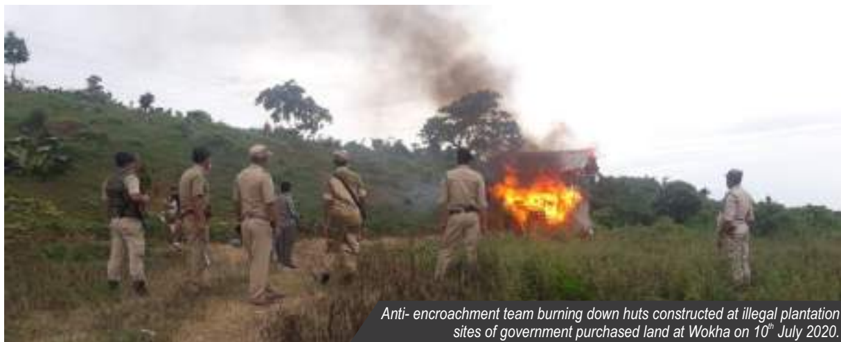
Anti-encroachment team burning down huts constructed at illegal plantation sites of government purchased land at Wokha on 10 th July 2020.

The official team also inspected District Hospital Peren and interacted with various civil societies.