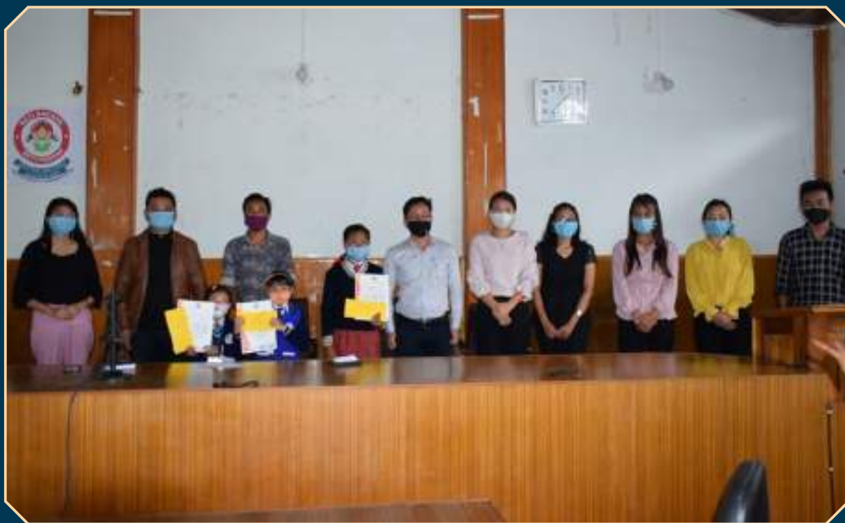
Winners of the Online Inter School & College Photography and Short Film Competition on the topic 'Violence Against Women and Children in Wokha' at Deputy Commissioner's Conference Hall, Wokha on 16 th July 2020.