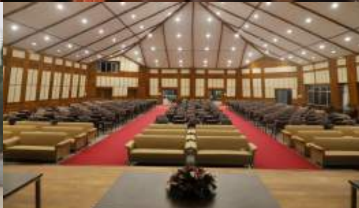
Chief Minister, Neiphiu Rio delivering the Inaugural Address during the virtual inauguration of the new State Banquet Hall at Chief Minister's Residential Complex, Kohima on 29th July 2020, and (below) the exterior view, left, and the interior view, right, of the new State Banquet Hall.