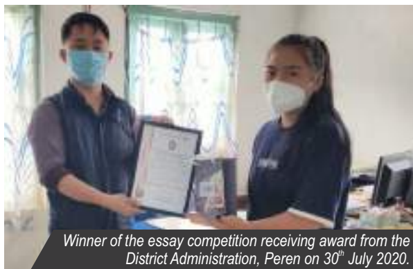
Winner of the essay competition receiving award from the District Administration, Peren on 30 th July 2020.