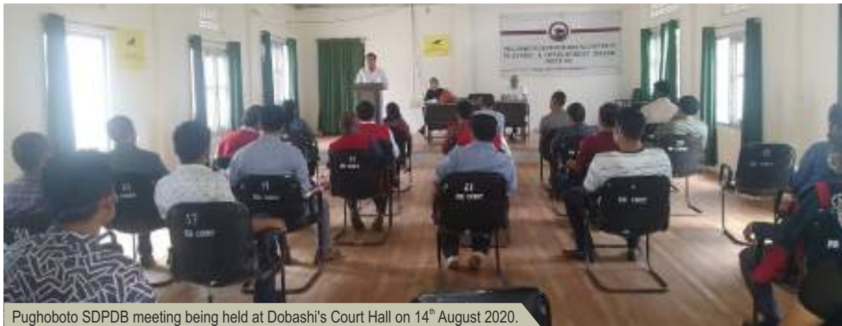
Pughoboto SDPDB meeting being held at Dobashi's Court Hall on 14 th August 2020.

not to discriminate COVID-19 patients or spread rumours. He also thanked the MLA for his