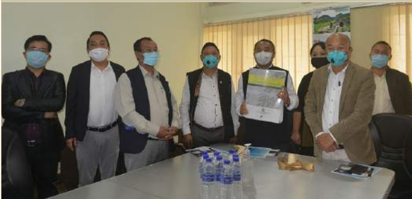
Minister, Planning & Co-ordination, Land Resources and Parliamentary Affairs, Neiba Kronu along with other officials releasing the Two Volume Report of the Project 'Geospatial Water Resource Map of Nagaland' at Nagaland GIS & Remote Sensing Centre, Kohima on 21 st August 2020.