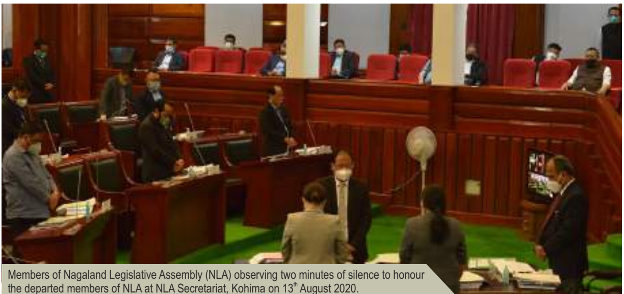
Members of Nagaland Legislative Assembly (NLA) observing two minutes of silence to honour the departed members of NLA at NLA Secretariat, Kohima on 13 th August 2020.

The business session began with Commissioner & Secretary reporting the assent of Governor of Nagaland to the following bills: the