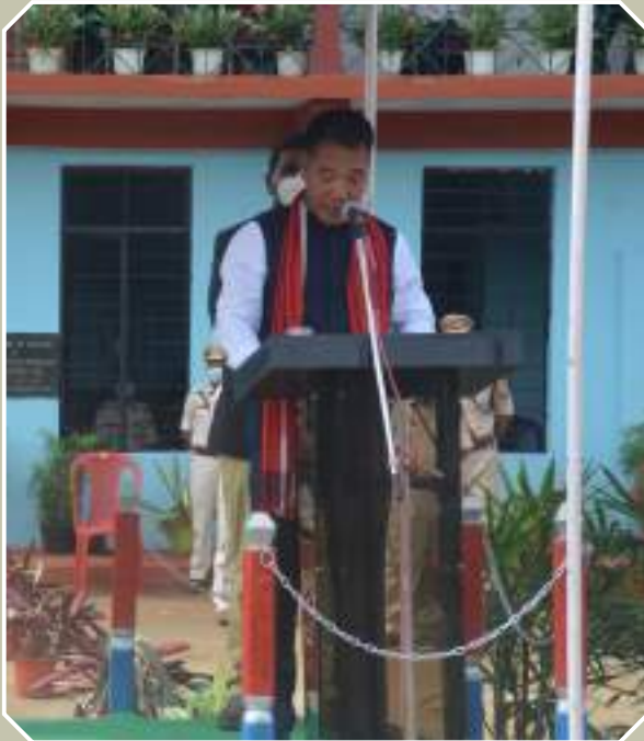
Minister, Civil Aviation & Railways, and Land Resources, P. Paiwang Konyak delivering the Independence Day Address at Mon on 15 th August 2020.