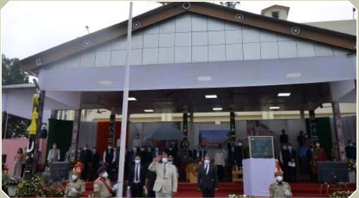
Chief Minister, Neiphiu Rio taking the salute during the Independence Day celebration at Secretariat Plaza, Kohima on 15 th August 2020.