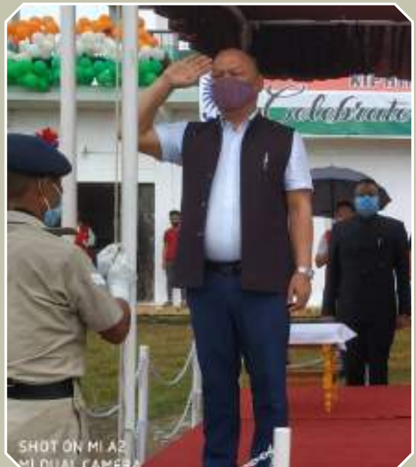
Minister, Soil & Water Conservation, Geology & Mining, V. Kashiho Sangtam taking the salute during the Independence Day celebration at Local Ground, Kiphire on 15 th August 2020.