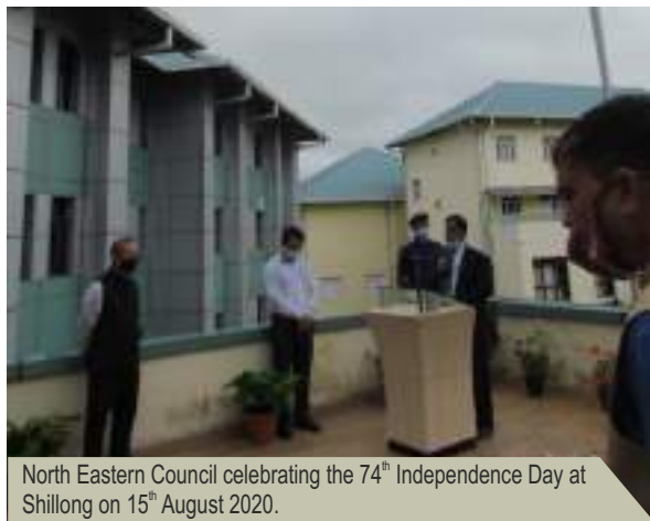
North Eastern Council celebrating the 74 th Independence Day at Shillong on 15 th August 2020.