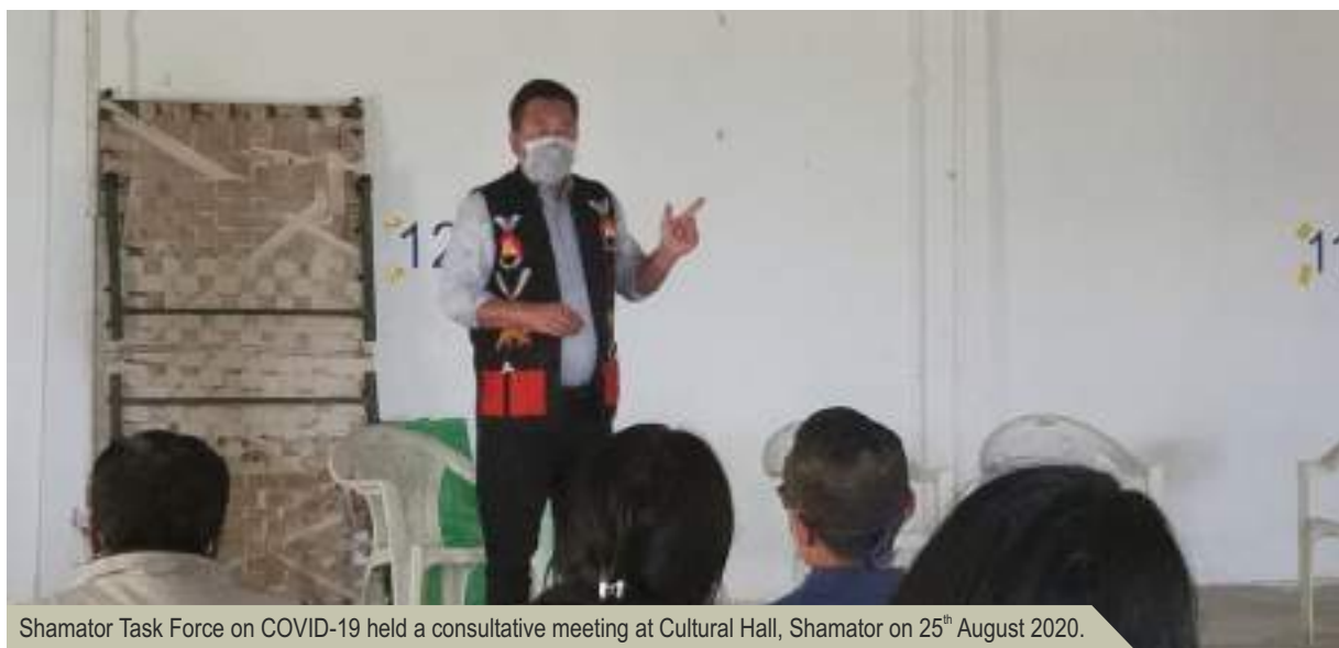
Shamator Task Force on COVID-19 held a consultative meeting at Cultural Hall, Shamator on 25 th August 2020.

The Shamator Task Force (STF) for COVID-19 under Tuensang district held a consultative meeting on 25 th August 2020 at Cultural Hall, along with volunteers, resource centre in charge, media cell, medical team, NGOs and 11 Wards Chairmen. The objective of the meeting was to acclimatize the frontline workers and public with new agenda to fight against the pandemic.