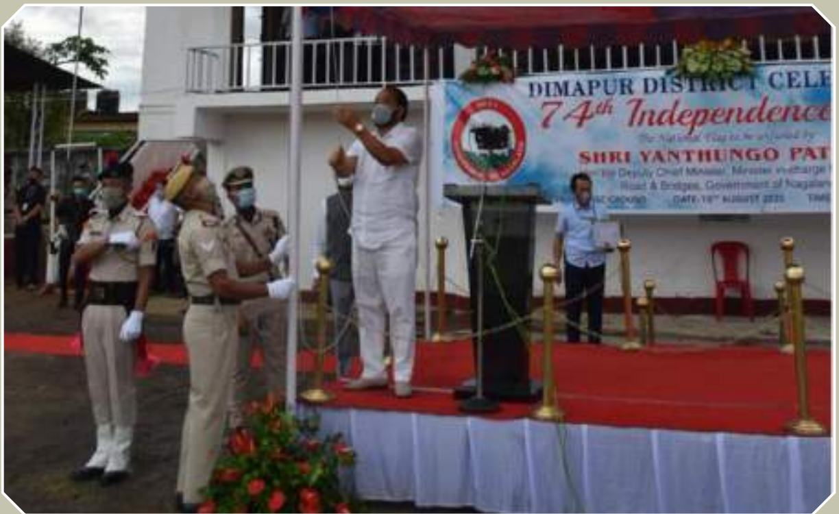
Deputy Chief Minister, Y. Patton unfurling the national flag during the Independence Day celebration at DDSC Stadium, Dimapur on 15 th August 2020.