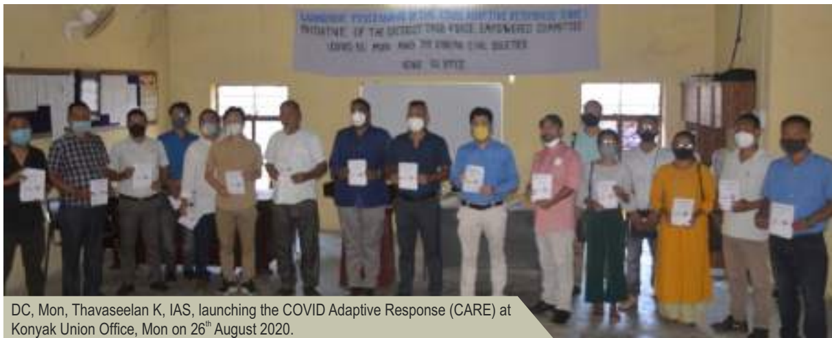
DC, Mon, Thavaseelan K, IAS, launching the COVID Adaptive Response (CARE) at Konyak Union Office, Mon on 26 th August 2020.

COVID Adaptive Response (CARE), initiated by the Mon District Task Force for COVID-19, Empowered Committee COVID-19, Mon and the Konyak civil societies was launched by Deputy Commissioner, Mon, Thavaseelan K, IAS, on 26 th August 2020 at Konyak Union Office, Mon.