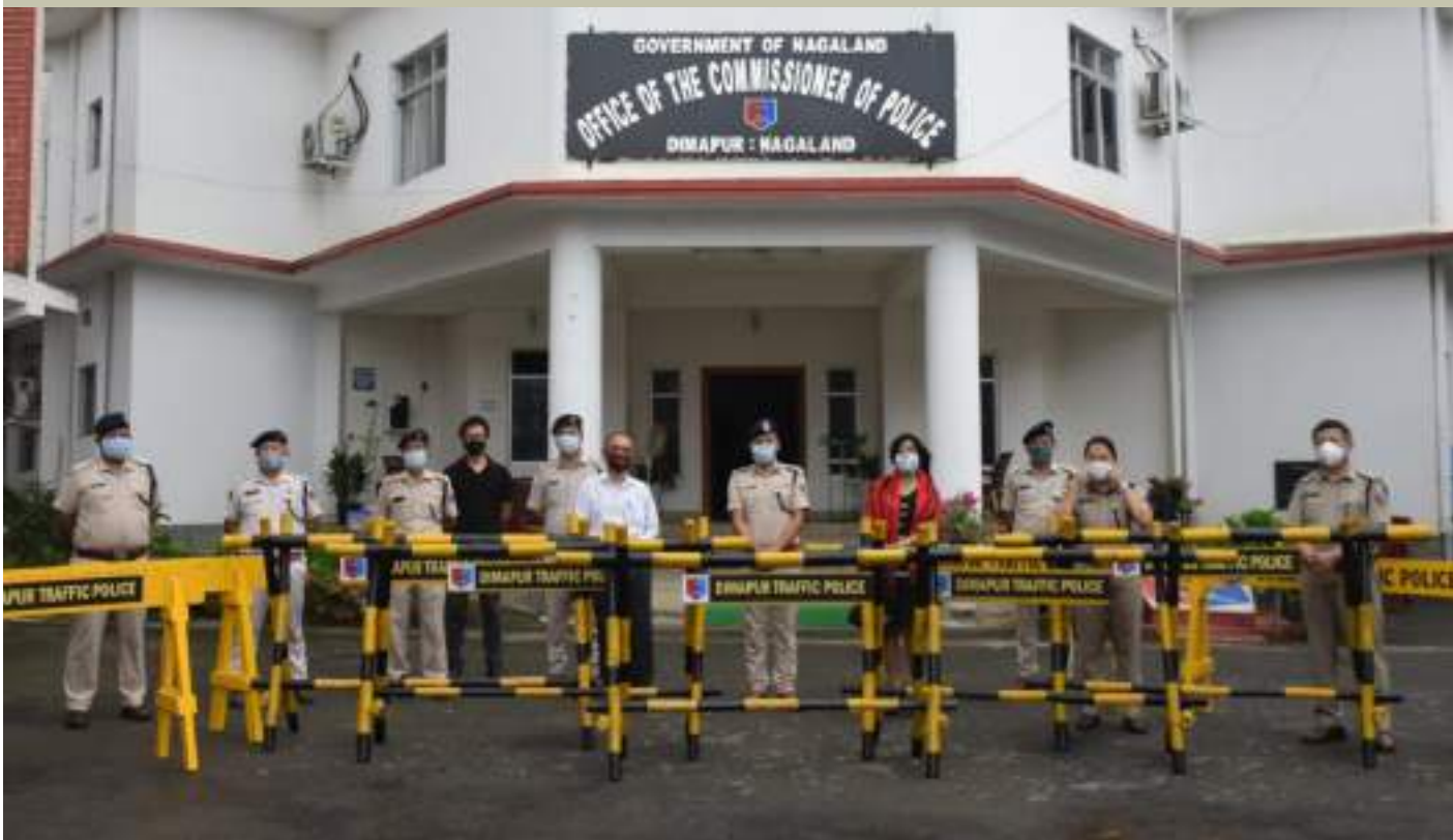
Commissioner of Police (CP), Dimapur, Rothihu Tetseo, IPS along with other officials during the launch of bamboo barricades for Dimapur Police at CP's Office, Dimapur on 4 th August 2020.