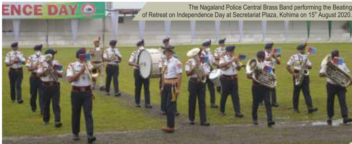
The Nagaland Police Central Brass Band performing the Beating of Retreat on Independence Day at Secretariat Plaza, Kohima on 15 th August 2020.

Rio mentioned that the pandemic has shown our resilience and our capacity to raise our efficiency, management and planning capabilities to further heights and also to face the challenges on the economic front. He called upon every citizen to work in their own walks of life with the same zeal and spirit that they have shown against COVID-19.