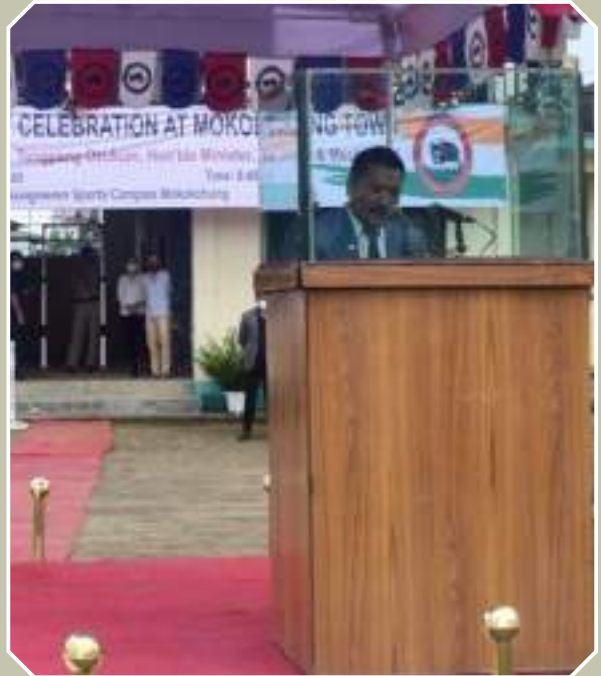
Minister, Housing and Mechanical, Tongpang Ozukum delivering the Independence Day Address at Imkongmeren Sports Complex, Mokokchung on 15 th August 2020.