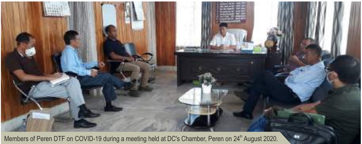
Members of Peren DTF on COVID-19 during a meeting held at DC's Chamber, Peren on 24 th August 2020.

Peren District Task Force (PDTF) and Joint Action Committee (JAC) on COVID-19 meeting was held on 24 th August 2020 at Deputy Commissioner's Chamber, Peren to discuss matters related to COVID-19 in the district.