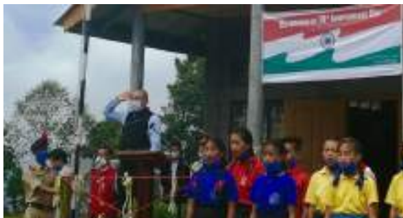
ADC, Chozuba, Theodore Yanthan taking the salute during the Independence Day celebration at Chozuba on 15 th August 2020.

The 74 th Independence Day was celebrated at Additional Deputy Commissioner's Office, Chozuba town. ADC, Theodore Yanthan, unfurled the national flag. Delivering the Independence Day speech, the ADC highlighted the challenges and achievements of the Government, especially in regard to the COVID-19 pandemic in the State.