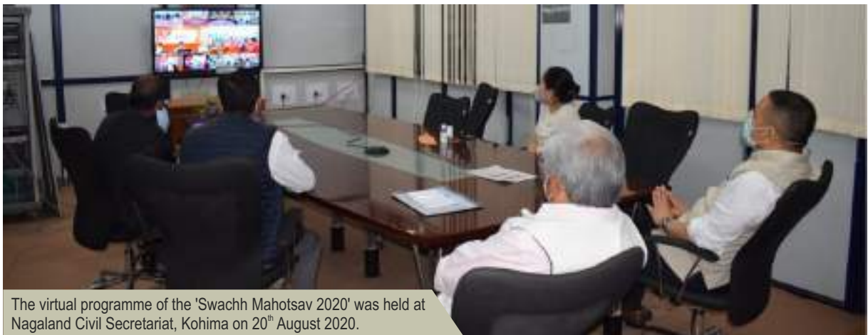
The virtual programme of the 'Swachh Mahotsav 2020' was held at Nagaland Civil Secretariat, Kohima on 20 th August 2020.

Mokokchung town has been awarded the Cleanest City in North East India, under the population of 25 to 50 thousand category, by Minister of State for Housing and Urban Affairs, Hardeep Singh Puri on 20 th August 2020, during a virtual programme of the 'Swachh Mahotsav 2020,' organised by the Ministry of Housing and Urban Affairs.