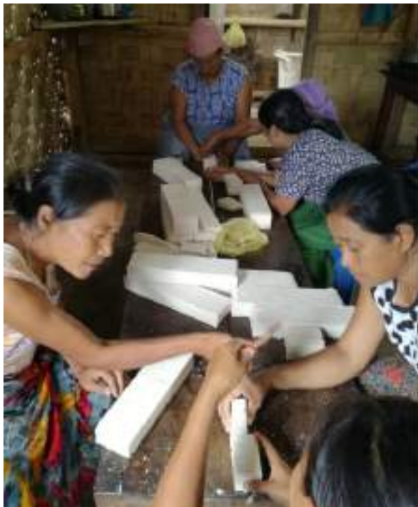
Keyima SHG members making aloe vera soaps at Heningkunglwa village, Peren.

(A DIPR feature by Sūzo Kikhi, IA, DIPR)