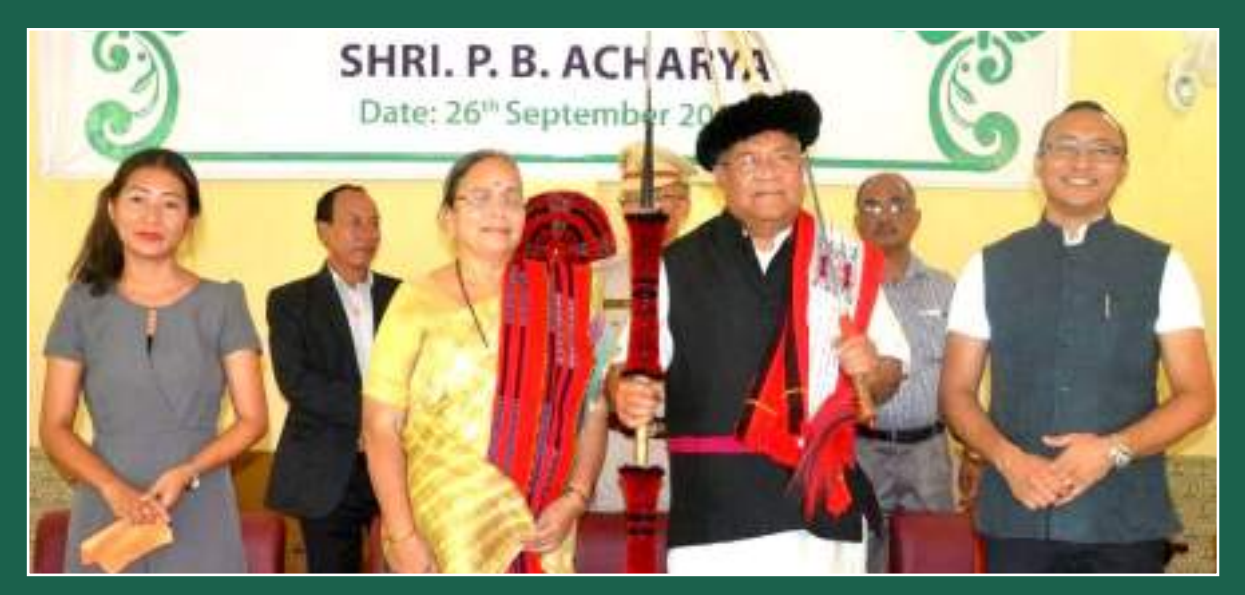
Governor of Nagaland, P. B. Acharya launching the Bhandari Town Council at the Town Hall, Bhandari on 26th September 2016.