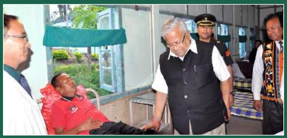
Governor P. B. Acharya meets the patients during his visit to Phek Civil Hospital on 12th September 2016.