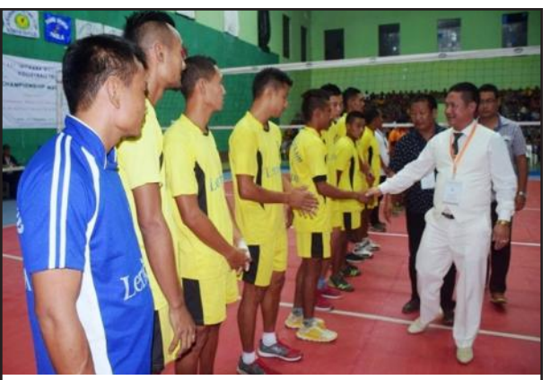
Minister for National Highway & Mechanical Engineering & Election, Nuklutoshi meets the players before the final match of the 11th Imchaba Master Memorial Nagaland Open Volleyball Trophy at Multi Sports Complex, Mokokchung on 23rd September 2016.

11th Imchaba Master Memorial Nagaland Open Volleyball Trophy 2016 got underway here at Multi-purpose Sports Complex, Mokokchung on 20th September 2016 with Adventure Club Changtongya