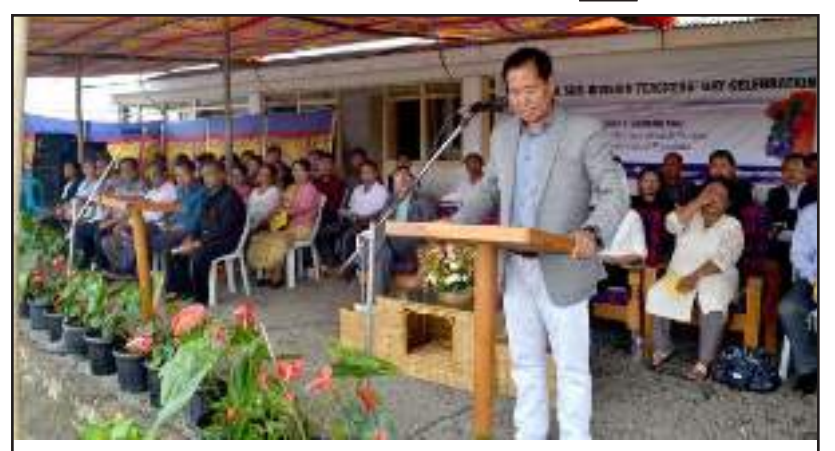
Minister for Roads & Bridges Y. Vikheho Swu speaking at the Teacher's Day celebration at town hall, Pughoboto on 5th September 2016.

under Pughoboto. He wished all the teachers for their outstanding contribution to society in shaping the future of the students.