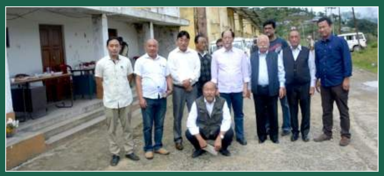
MP (LS) Rio visiting the FCI godown at Tuensang on 19th September 2016.