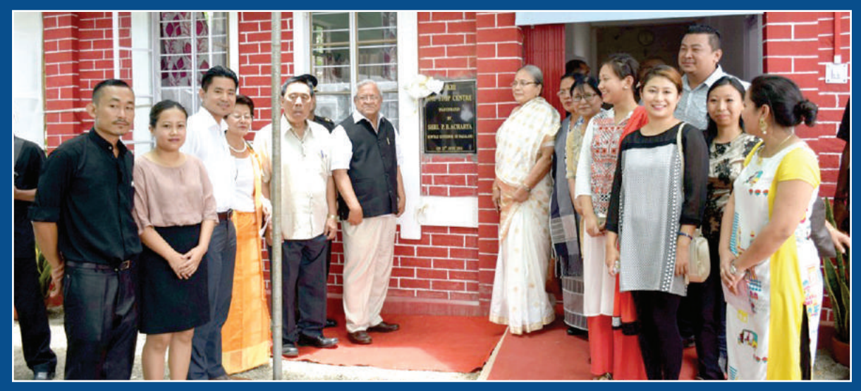
Governor of Nagaland P.B. Acharya, Minister Kiyaneilie Peseyie and others after unveiling the monolith of Sakhi-One Stop Centre at Dimapur on 23rd June 2016.