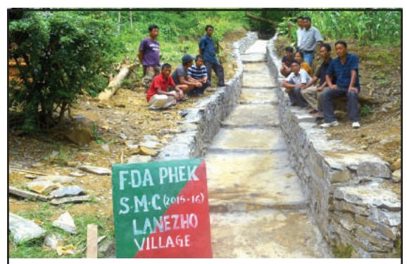
Phek Forest Officials & Villagers near the newly constructed Soil & Moisture Conservation structure at Lanyezho, Phek.

A concrete embankment cum nullah to conserve soil and water was constructed at Lanyezho village by JFMC Lanyezho sponsored by Phek Forest Division. The structure was constructed under the SMC (Soil & Moisture Conservation) component of FDA to avert soil erosion and for proper water management. Around 10 Ha area of Oak and fruit bearing species were planted during this season by JFMC Lanyezho under FDA Regular. During the inaugural programme of the structure, DFO Phek Rongsenlemla Imchen highlighted the importance of water and its effective management. She appreciated the village community for cooperating with the department with regard to Wild Life & Forest Conservation. The village community expressed gratitude to Phek Forest Division for showing confidence to the villagers and also asserted that the community will reaffirm to firmly abide the Forest Resolution passed by the Council.