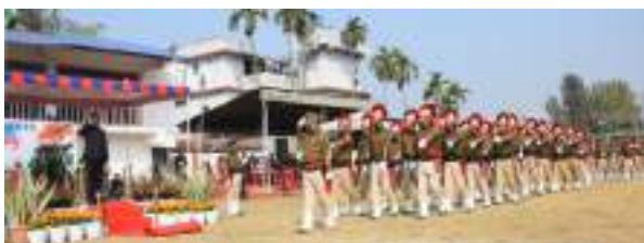
Speaker, NLA, Sheringain Longkumer taking the rashtriya salute during the Republic Day celebration at DDSC Stadium, Dimapur on 26 th January 2021.

In Dimapur, the Republic Day celebration was held at DDSC Stadium, Dimapur and Speaker, Nagaland Legislative Assembly, Sheringain Longkumer unfurled the national flag. He delivered the Republic Day Speech and inspected the march past contingents and took salute from 6 Parade Contingents.