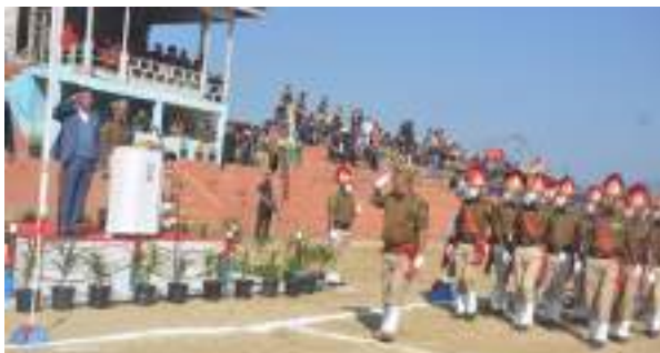
Minister of Public Health Engineering Department, Jacob Zhimomi taking the rashtriya salute during the Republic Day celebration at Parade Ground, Tuensang on 26 th January 2021.

Tuensang district celebrated the 72 nd Republic Day at Parade Ground, Tuensang on 26 th January 2021. The Chief Guest was Jacob Zhimomi, Minister of Public Health Engineering Department.