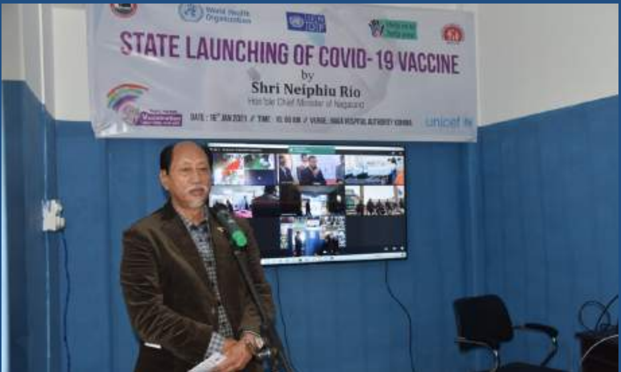
Chief Minister, Neiphiu Rio speaking during the inaugural function of State Launching of COVID-19 Vaccination at Naga Hospital Authority Kohima on 16 th January 2021.