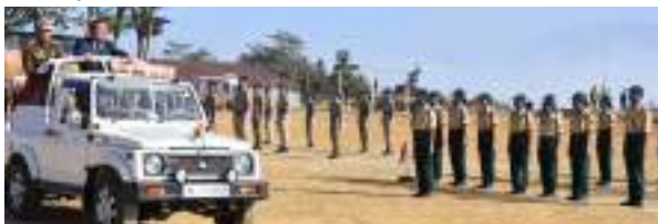
Minister, Planning & Coordination, Land Revenue and Parliamentary Affairs, Neiba Kronu inspecting the parade contingents during the Republic Day celebration at Phek Local Ground on 26 th January 2021.

Guest. He unfurled the national flag and inspected the parade contingents and felicitated local champions under Beti Bachao Beti Padhao.