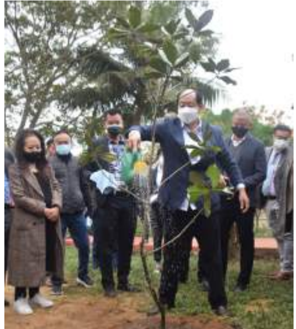
Chief Minister, Neiphiu Rio waters a Magnolia tree at Green Park, State Horticulture Nursery, Dimapur on 21 st January 2021.