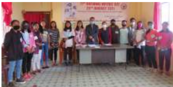
ADC and AERO along with newly enrolled voters during 11 th National Voter's Day celebration at Aboi town on 25 th January 2021.