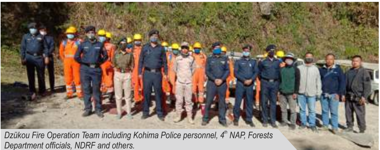
Dzükou Fire Operation Team including Kohima Police personnel, 4 th NAP, Forests Department officials, NDRF and others.