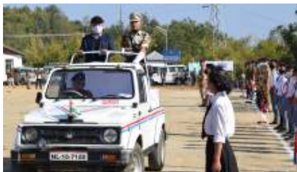
Minister, Soil & Water Conservation, Geology & Mining, V. Kashiho Sangtam inspecting the parade contingents during the Republic Day celebration at DC's Office Complex, Peren on 26 th January 2021.

The Special Guest unfurled the national flag and took the rashtriya salute from the Parade Contingents. The Parade Contingents comprising of DEF Peren; 9 th IRB, Saijang; All Saints Higher Secondary School, Peren and School Police Cadet, GHSS, Jalukie participated in the march past.