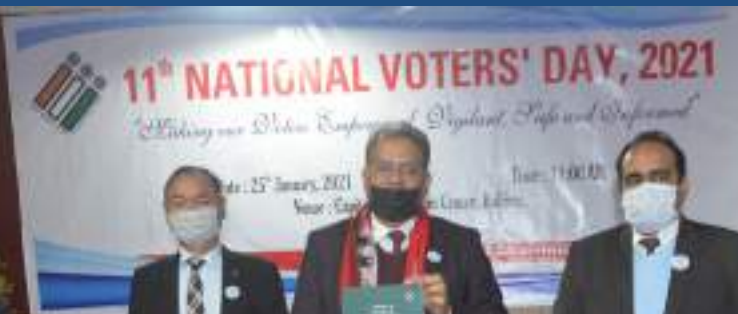
Chief Secretary, Nagaland, J. Alam, IAS along with officials releasing 'A Glimpse of Systematic Voters Education & Electoral Participation (SVEEP) Activities in Nagaland' on 11 th National Voters' Day at Capital Convention Centre, Kohima on 25 th January 2021.