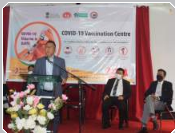
Minister, Health & Family Welfare, S. Pangnyu Phom and officials during the Dimapur district COVID-19 vaccine launch at District Hospital Dimapur on 16 th January 2021.