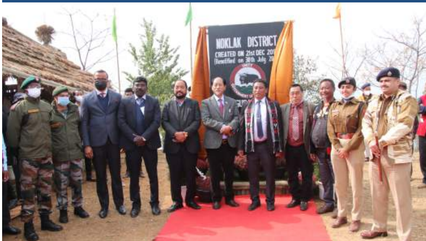
Chief Minister, Neiphiu Rio, Deputy Chief Minister, Y. Patton, Advisors and other dignitaries during the inauguration of Noklak as the 12 th district of Nagaland on 20 th January 2021 at Public Ground, Noklak.