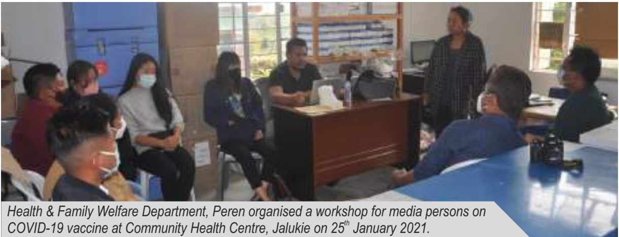
Health & Family Welfare Department, Peren organised a workshop for media persons on COVID-19 vaccine at Community Health Centre, Jalukie on 25 th January 2021.