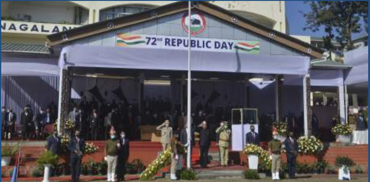
Governor, R. N. Ravi taking the salute on the occasion of the 72 nd Republic Day celebration at Nagaland Civil Secretariat Plaza, Kohima on 26 th January 2021.