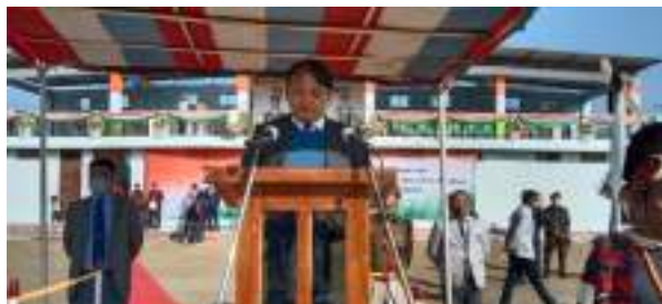
Minister, Rural Development, Metsubo Jamir addressing the gathering during the Republic Day celebration at Public Ground, Longleng on 26 th January 2021.

have seen significant and positive breakthroughs and there is a spirit of understanding among everyone to work unitedly to fulfill the long cherished aspiration of our people without any delay overcoming all the obstacles.