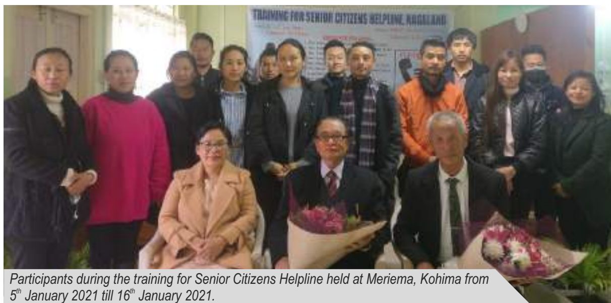
Participants during the training for Senior Citizens Helpline held at Meriema, Kohima from 5 th January 2021 till 16 th January 2021.