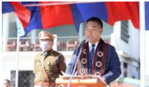
Minister, Transport, Civil Aviation and Land Resources, Paiwang Konyak addressing the gathering during the Republic Day celebration at Zunheboto Public Ground on 26 th January 2021.

and 2 nd Commander, Inaxu, Sub Inspector, Zunheboto. Awards were given to 24 Village Development Boards (VDB), under different blocks in Zunheboto, who have implemented MORD and State programme satisfactorily, as well as for maintaining the VDBs assets properly during 2019-2020 and 2020-2021.