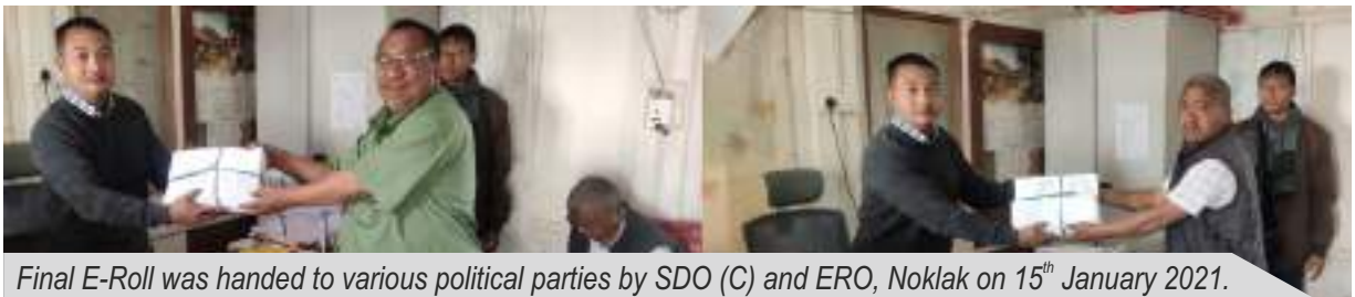
Final E-Roll was handed to various political parties by SDO (C) and ERO, Noklak on 15 th January 2021.