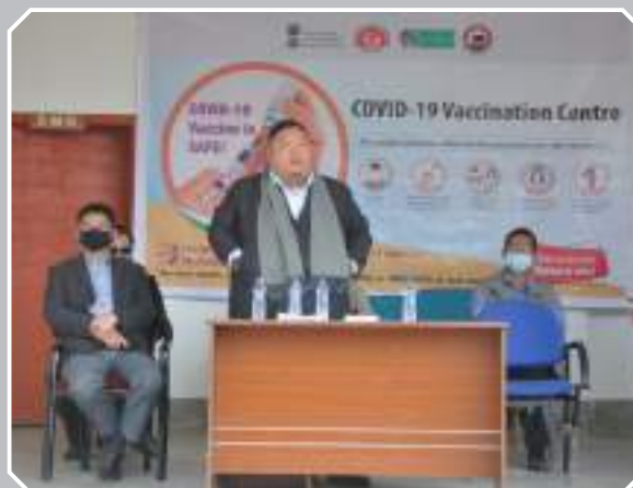
Minister, Higher Education and Tribal Affairs, Temjen Imna Along during the launch of COVID-19 vaccine at Community Health Centre, Jalukie on 16 th January 2021.