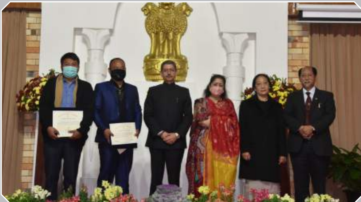
Governor, R. N. Ravi and Chief Minister, Neiphiu Rio along with their wives and recipients of Governor's Award during the Governor's 'At Home' programme held at Dr. Imkongliba Ao Hall, Raj Bhavan, Kohima on 26 th January 2021.