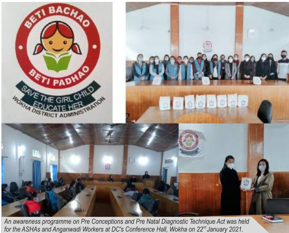
An awareness programme on Pre Conceptions and Pre Natal Diagnostic Technique Act was held for the ASHAs and Anganwadi Workers at DC's Conference Hall, Wokha on 22 nd January 2021.

Under Beti Bachao Beti Padhao (BBBP) the Wokha District Administration, DLCW-MSK and Wokha District Legal Services Authority (WDLA) organized an awareness programme on Pre Conceptions and Pre Natal Diagnostic Technique (PCPNDT) Act for the ASHAs and Anganwadi Workers on 22 nd January 2021 at Deputy Commissioner's Conference Hall, Wokha.