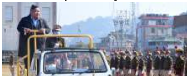
Minister, Higher Education and Tribal Affairs, Temjen Imna Along inspecting the parade contingents during the Republic Day celebration at Imkongmeren Sports Complex, Mokokchung on 26 th January 2021.

The 72 nd Republic Day was celebrated at Mokokchung on 26 th January 2021 at Imkongmeren Sports Complex with Minister, Higher Education and Tribal Affairs, Temjen Imna Along as the Chief Guest.