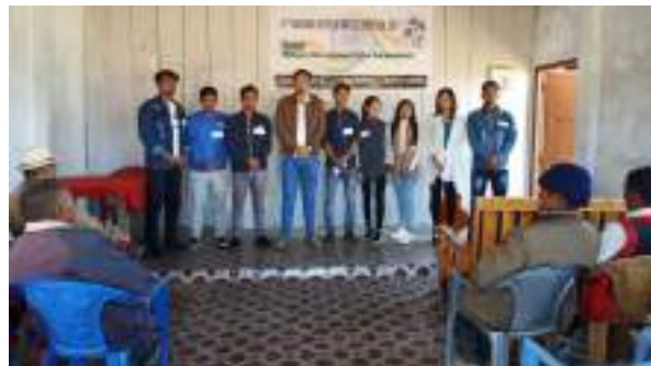
The 11 th National Voter's Day (NVD) was observed at DB's Court, SDO (C)'s Office, Thonoknyu on 25 th January 2021.

The 11 th National Voter's Day (NVD) was observed at Thonoknyu Headquarter at DB's Court, SDO (C)'s Office on 25 th January 2021.