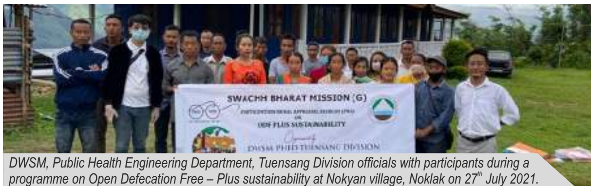
DWSM, Public Health Engineering Department, Tuensang Division officials with participants during a programme on Open Defecation Free – Plus sustainability at Nokyan village, Noklak on 27 th July 2021.