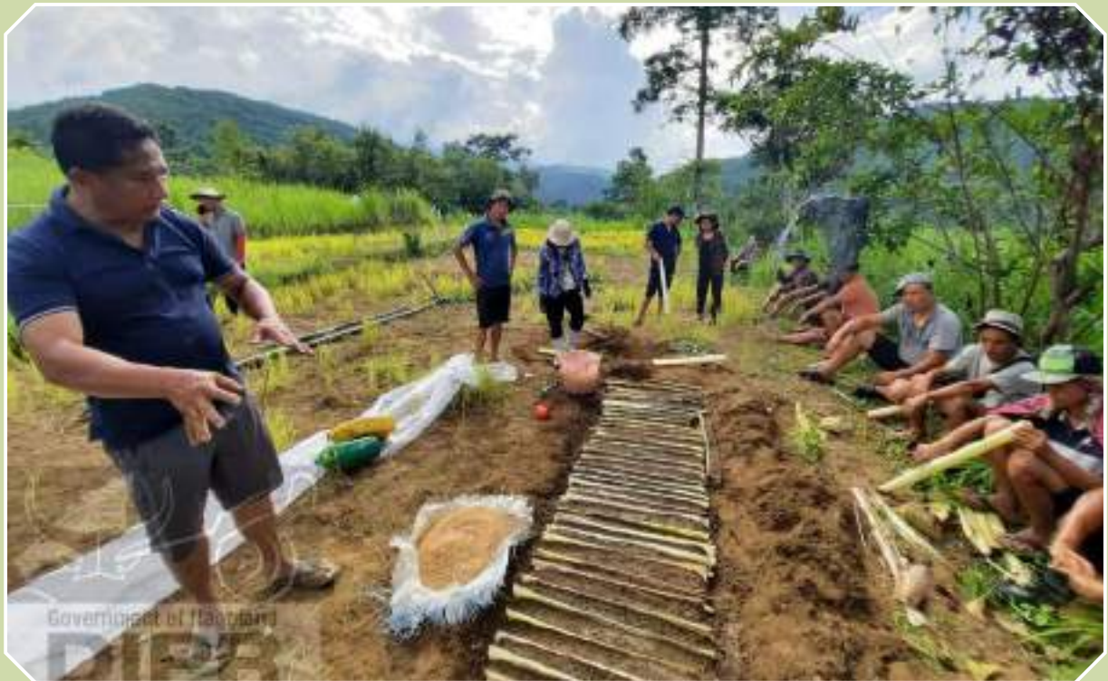
ATMA Jakhama Block along with DAO field staff and officers conducting field demonstration on various farming methods at Jakhama Block on 21 st July 2021.