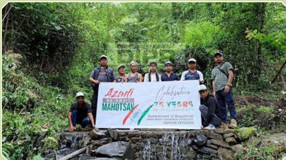
The Public Health Engineering Department, Kiphire Division during the launch of 'Azadi Ka Amrit Mahotsav,' ahead of fifty eight weeks of 75 th anniversary of Indian Independence. Marking the anniversary, the Department organised cleanliness drive and tree plantation activities at Main Water Source, Yingshikiur village, Kiphire on 6 th July 2021.