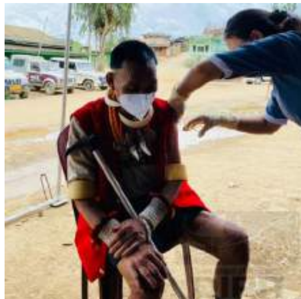
An elderly person receiving the COVID-19 vaccine at Deluxe Point, Kiphire on 11 th July 2021.

Nagaland State Transport (NST), carried out sensitisation programme on COVID-19 vaccination drive under the supervision of DTF, Kiphire at three villages on 5 th July 2021.