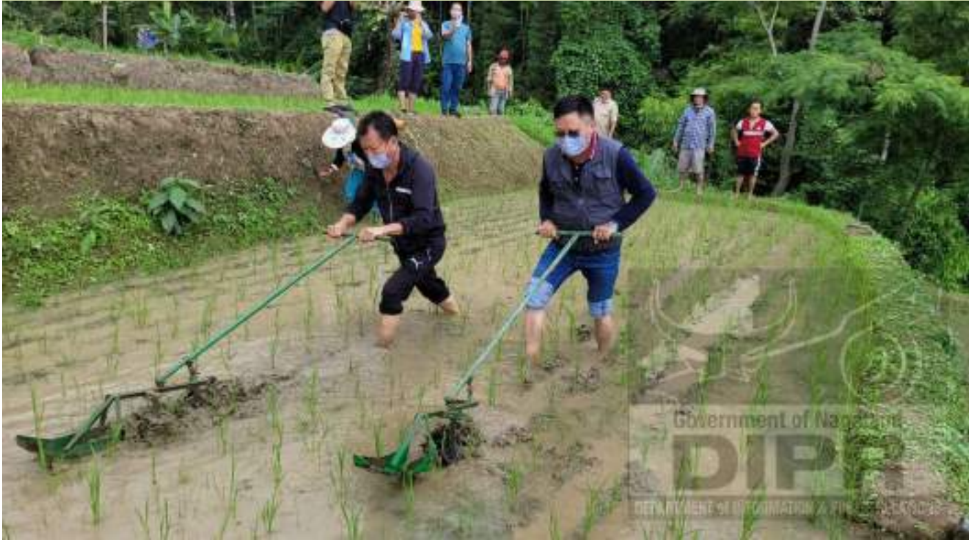
Agriculture Production Commissioner, Y. Kikheto Sema, IAS trying out a cono weeder, a mini tool used for ploughing fields during a visit to Boke-Botsa on 17 th July 2021, to review the progress of activities being implemented under the Naga Model Integrated Settled Farming.