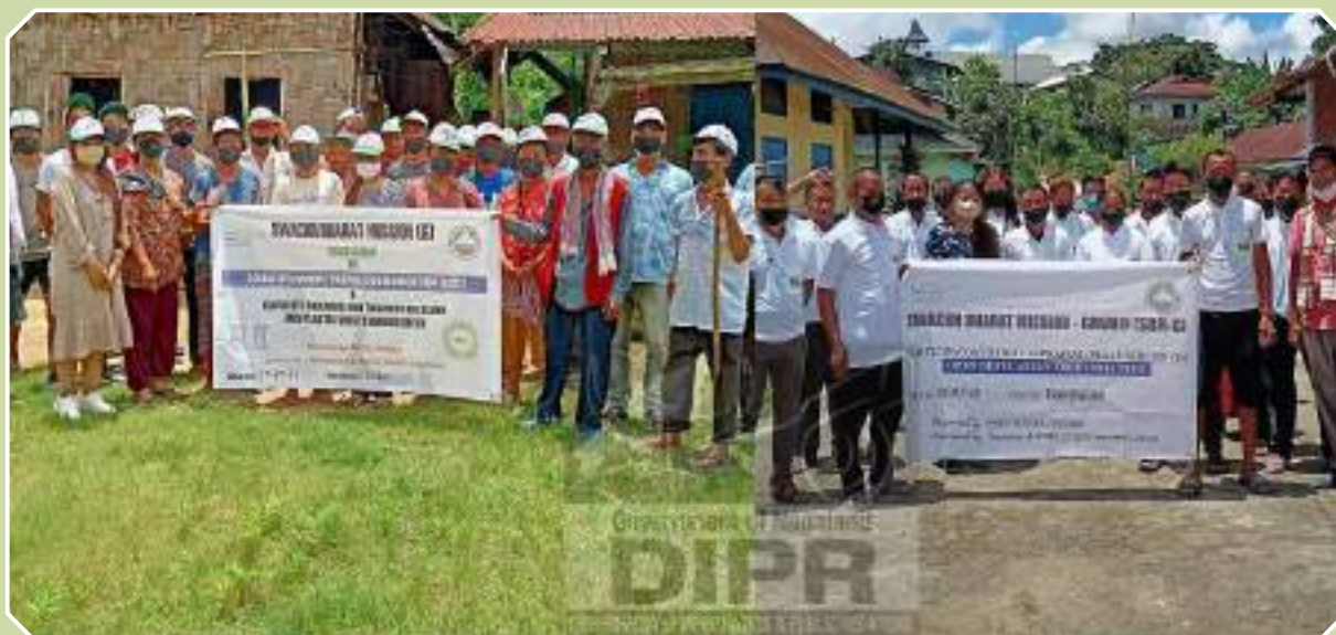
Public Health Engineering Department, Wokha Division conducted behavioural change communication, capacity building and training on Solid Liquid Waste Management and Participatory Rural Appraisal exercise on Open Defecation Free - Plus under Swachh Bharat Mission – Gramin at Yonchucho village (Right) and Soku village (Left) on 24 th and 27 th July 2021, respectively.