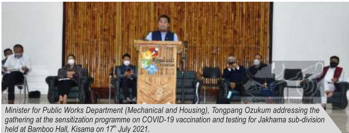
Minister for Public Works Department (Mechanical and Housing), Tongpang Ozukum addressing the gathering at the sensitization programme on COVID-19 vaccination and testing for Jakhama sub-division held at Bamboo Hall, Kisama on 17 th July 2021.

SOP in order to stop the transmission. He said the only way to protect oneself from this virus was to get vaccinated and called upon the village leaders and apex organisations to disseminate and sensitise the people on the importance of testing and vaccination for the safety of the community.