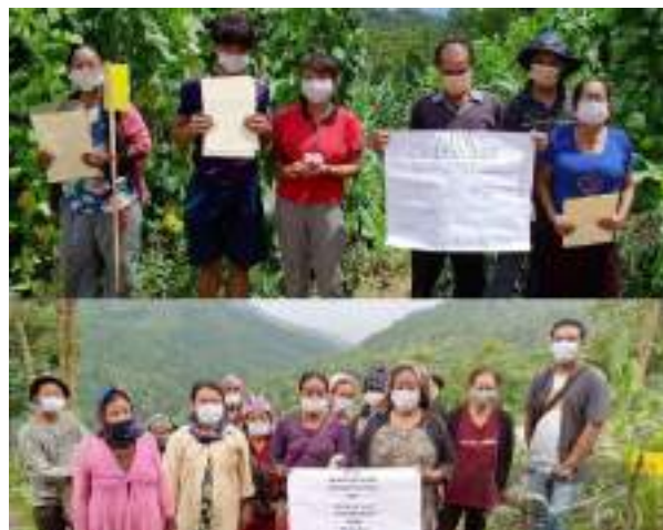
Demonstration on organic pest management was conducted by Chunlikha Block, Kohima at Yikhanyu village on 9 th July 2021, and at K. Station village on 12 th July 2021.