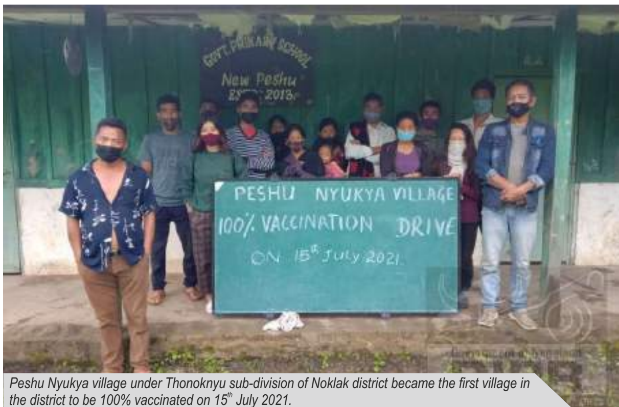
Peshu Nyukya village under Thonoknyu sub-division of Noklak district became the first village in the district to be 100% vaccinated on 15 th July 2021.

Peshu Nyukya village under Thonoknyu sub-division of Noklak district became the first village in the district to be 100% vaccinated. COVID-19 vaccination for all eligible beneficiaries above 18 years of age was