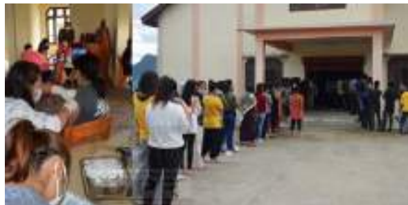
Vaccination mela for COVID-19 was held at Town Hall, Tuensang on 11 th July 2021.

Vaccination mela for COVID-19 vaccine was held on 11 th July 2021 at Town Hall, Tuensang under the initiative of the District Administration and Health & Family Welfare Department.