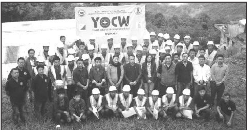
Trainees along with department officials during the Assistant Mason's six days training inaugural programme at GITI, Wokha 26 th June, 2017.

The Government of Nagaland in partnership with Zynorique Initiative, Youth Net and Directorate of Employment, Skill Development & Entrepreneurship organized an inaugural programme of the 'Year of Construction Workers' for Re-Skilling/Up Skilling at Government ITI, Wokha on 26 th