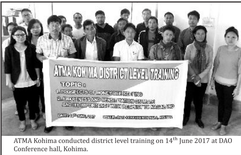
ATMA Kohima conducted district level training on 14 th June 2017 at DAO Conference hall, Kohima.

his keynote address said that honey bee has many utility to us as it can also create avenues for employment. Nagaland being a biodiversity hot spot has numerous medicinal and aromatic plants yet to be researched. Hence, an awareness and sensitization on MAP and its importance with respect to Nagaland needs to be shared.