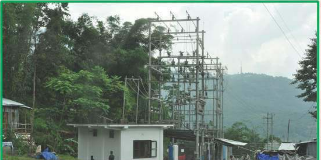
The compact sub-station at Nagabazar, Kohima which was inaugurated on 14 th June, 2017 by C. Kipili Sangtam, Minister (Power).