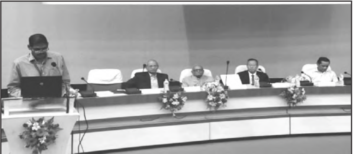
A Workshop on 'Recalling the Great Shillong Earthquake of 12 th June, 1987' was held on 12 th June 2017 at NEC, Shillong.