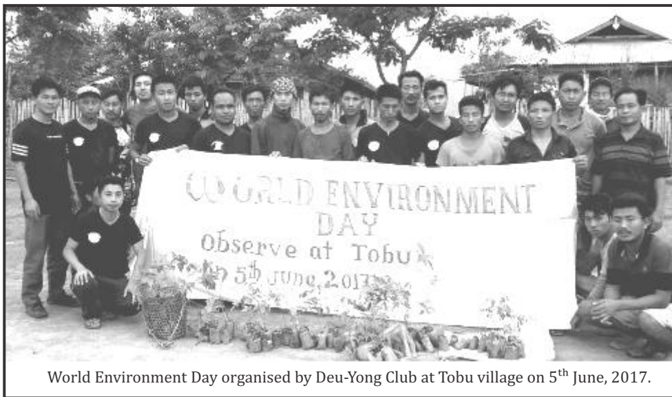
World Environment Day organised by Deu-Yong Club at Tobu village on 5 th June, 2017.

Communication w.e.f from the day the MOU was signed i.e 16 th May, 2017. The Chief Guest said the recent advancement of technology has brought us all closer. He however said that it has both merit and demerit, and he called upon the