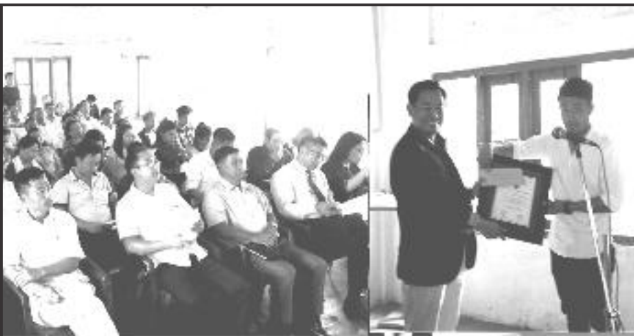
Minister for R&B, Y. Vikheho Swu felicitating the successful candidates during the Pughoboto SDPDB meeting at the ADC Pughoboto office on 8 th June 2017.