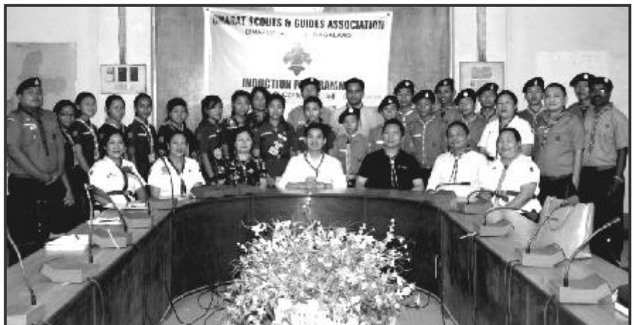
DC Dimapur and others at the induction programme of Bharat Scouts & Guides of Dimapur at DC's conference Hall on 23 rd July 2017.

LADP 2017-18 scheme in respect of 56 & 57 Assemble Constitution as submitted by Minister and Parliamentary Secretary was approved to be forwarded to the concerned department for necessary action. Renewal of Pathso Village Council Club was agreed upon to be forwarded to the Government.