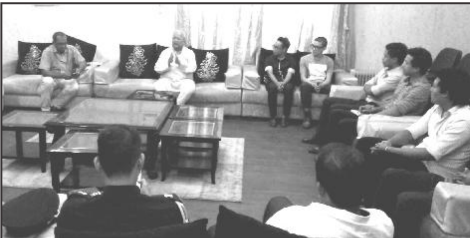
Governor of Nagaland, P.B. Acharya met the student leaders and Naga entrepreneurs at Nagaland House, New Delhi on 18 th June, 2017.