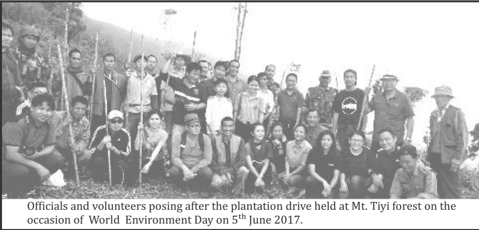
Officials and volunteers posing after the plantation drive held at Mt. Tiyi forest on the occasion of World Environment Day on 5 th June 2017.

called for preserving and conserving the forest of the same. He lauded the DPDB, and the Forest Department for initiating such commendable service and giving the opportunity to the Lotha Officers Association to be a part of the great venture.