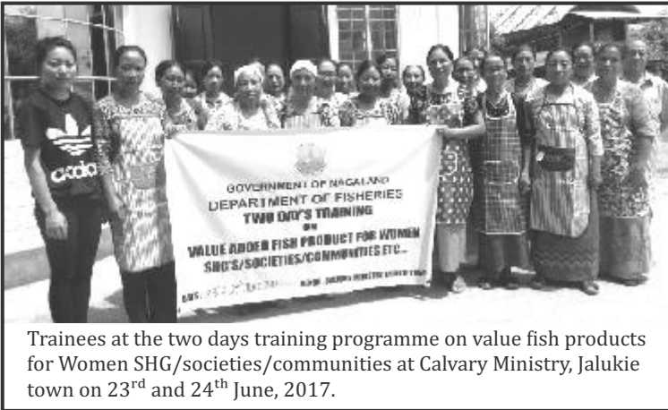
Trainees at the two days training programme on value fish products for Women SHG/societies/communities at Calvary Ministry, Jalukie town on 23 rd and 24 th June, 2017.