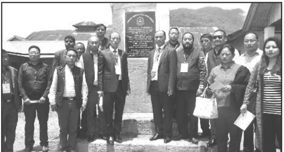
Minister for School Education, Yitachu, his colleagues and other officials at the 75 th year Jubilee celebration of Government Higher Secondary School, Chukitong on 9 th June 2017.

Minister for School Education, Nagaland, Yitachu graced the 75 th year Jubilee celebration of Government Higher