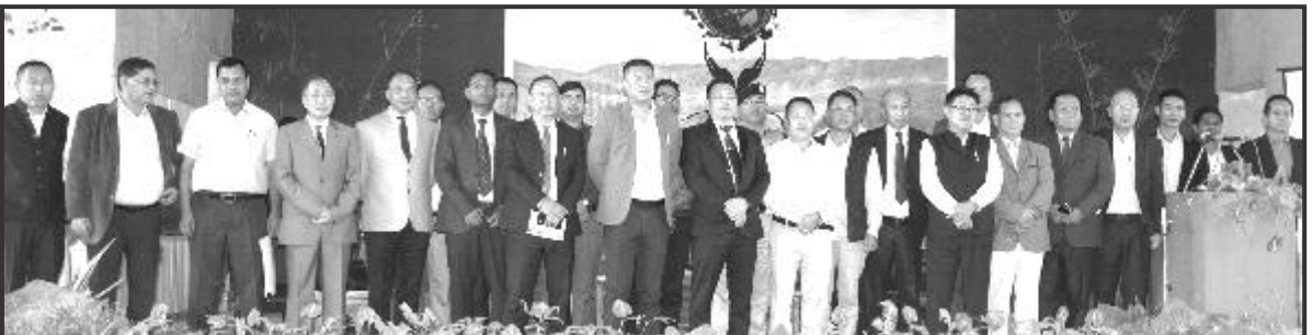
World Environment Day was observed at Mokokchung Town Hall on 5 th June 2017 with Nagaland Legislative Assembly Speaker Dr. Imtiwapang Aier as the chief guest.

The joint and unanimous resolution of the people includes (a) protection and preservation of the forest, bio-diversity and natural environment, selection of an area within the village jurisdiction and designate it as Community Reserve Forest where no activities detrimental to the forest shall be permitted (b) to prohibit uncontrolled burning of forest throughout the area under jurisdiction (c) to prohibit the use of chemicals, toxic substances, batteries and other harmful methods of fishing in the rivers