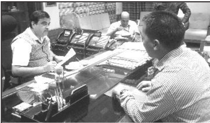
Minister P. Paiwang Konyak with Union Minister Nitin Gadkari at New Delhi

The Union Minister had agreed to take up some roads project in those areas to improve their lives and connectivity of those