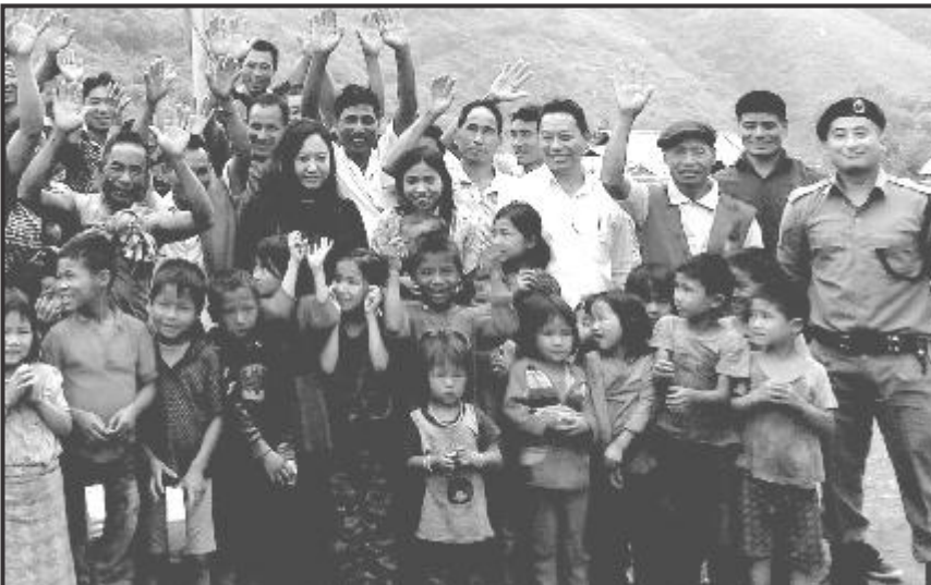
DFO Phek and village community with solar street light in Mutsale village, Phek on 1 st June 2017.

A month long Plantation Drive under the theme "Green Phek-Connecting with Nature" was launched in Phek on 3 rd June, 2017