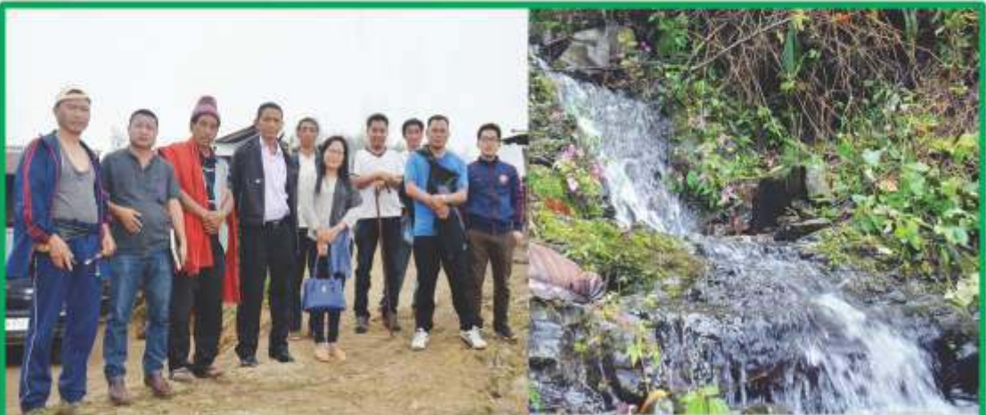
Verification team for connection of water supply to newly constructed Zisaji Presidency Government College conducted a spot verification at Phakroki River, Kiphire on 1 st June 2017.