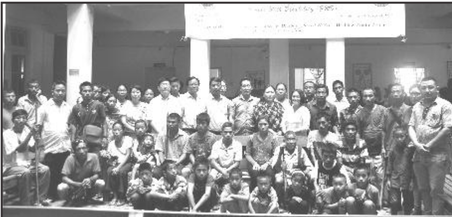
Awareness cum Medical Camp for People with Disability (PWD) was held on 8 th June 2017 at Civil Hospital, Mon.