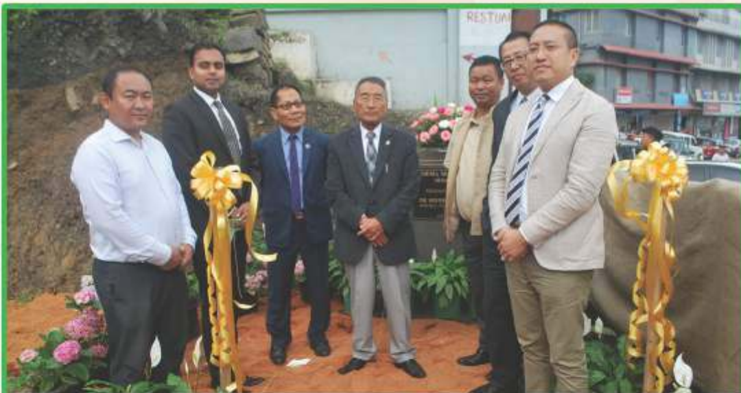
Nagaland Chief Minister Dr. Shürhozelie Liezietsu and other officials at the foundation laying programme for Kohima Municipal Council (KMC) building at Keziekie, Kohima on 15 th June 2017.