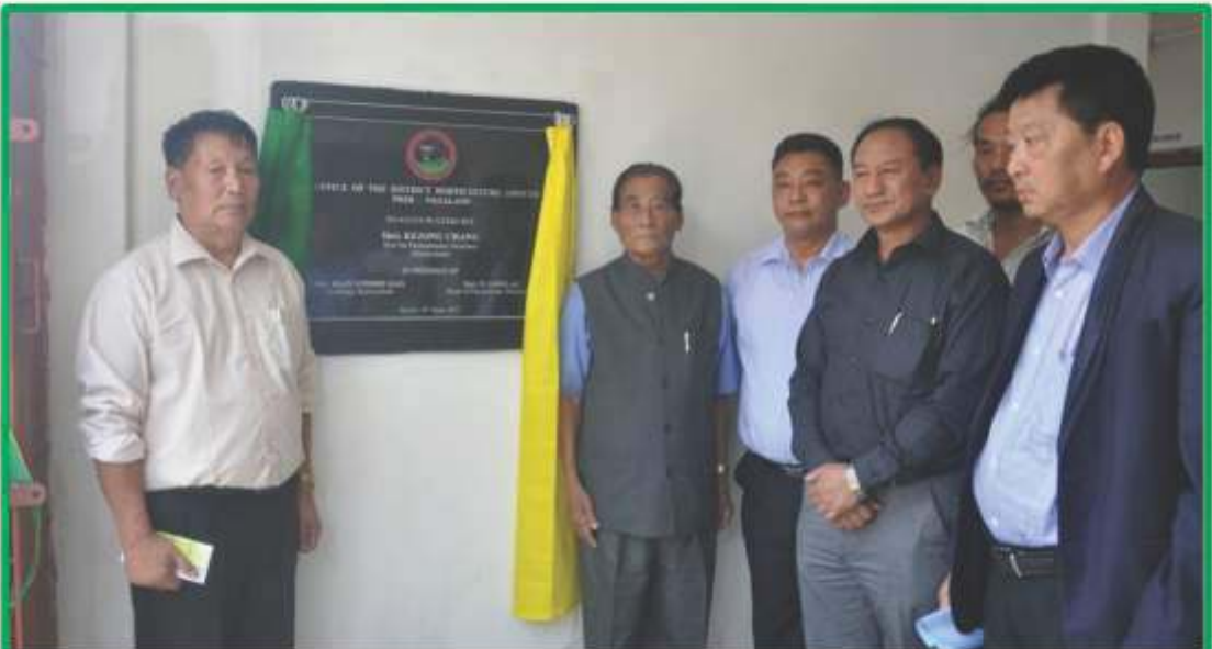
Parliamentary Secretary Horticulture, Kejong Chang and other officials during the inauguration programme for office building of the DHO, Phek on 8 th June 2017.