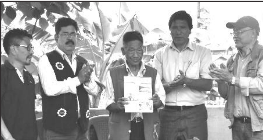
Chairman Lizutomi Village Council, Hokhyi Awomi releasing 'The Jhum-Vol 2' on Environment and Development published by Soil & Water Conservation Department at Lizuto village on 8 th June 2017.