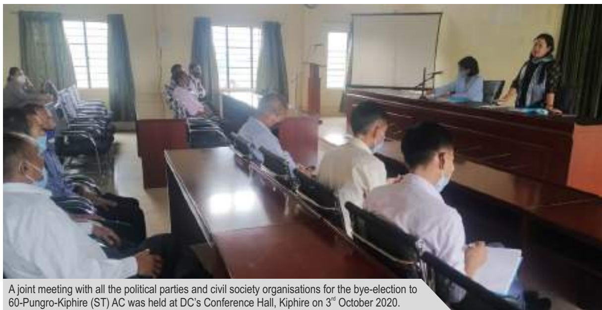
A joint meeting with all the political parties and civil society organisations for the bye-election to 60-Pungro-Kiphire (ST) AC was held at DC's Conference Hall, Kiphire on 3 rd October 2020.

A joint meeting with all the political parties and civil society organisations for the upcoming bye-election to 60 Pungro-Kiphire assembly constituency was held at DC's Conference Hall, Kiphire on 3 rd October 2020.