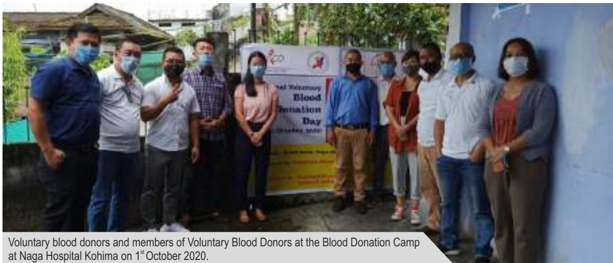
Voluntary blood donors and members of Voluntary Blood Donors at the Blood Donation Camp at Naga Hospital Kohima on 1 st October 2020.

The programme was organized to address the needs and shortage of blood during this public health crisis where voluntary donors are needed more than ever and also to maintain safe and adequate blood supply for patients in need. All safety measures were followed during the donation drive. Altogether 15 persons turned up to donate blood.