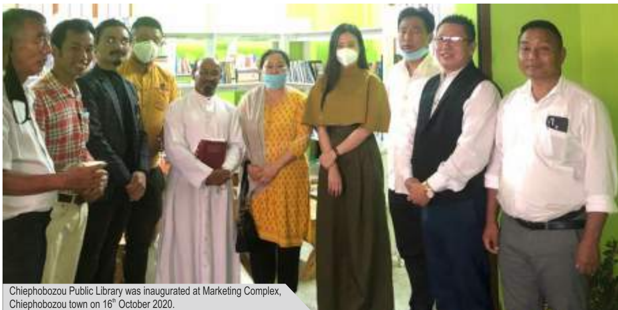
Chiephobozou Public Library was inaugurated at Marketing Complex, Chiephobozou town on 16 th October 2020.

The Chiephobozou Public Library, a public library comprising of recreational as well as educational books was inaugurated at Marketing Complex, Chiephobozou town on 16 th October 2020.