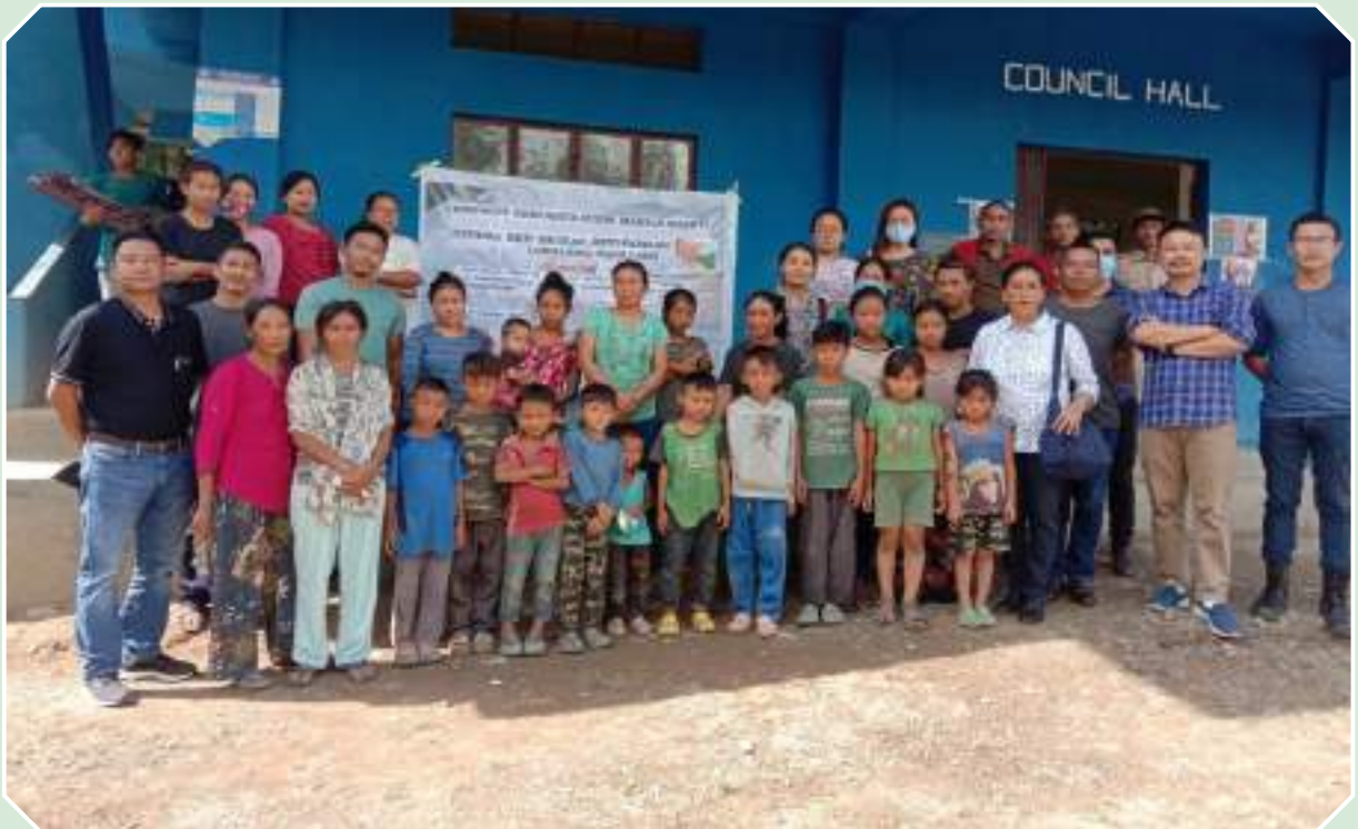
The District Administration in collaboration with Mahila Shakti Kendra (MSK) and District Task Force on Beti Bachao Beti Padhao, Longleng organised a free health check-up for women and girl child at Community Hall, Mongtikang village.