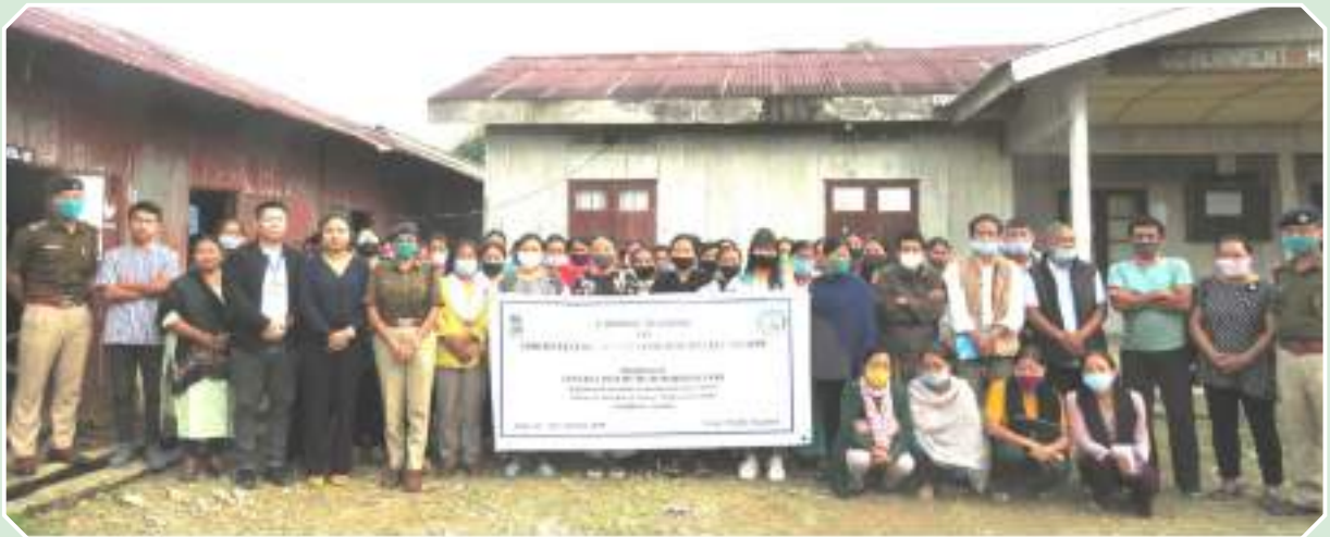
Participants along with officials during a two day farmers training on horticulture avenues for sustainable income held at Government Higher Secondary School, Noklak on 21 st and 22 nd October 2020.