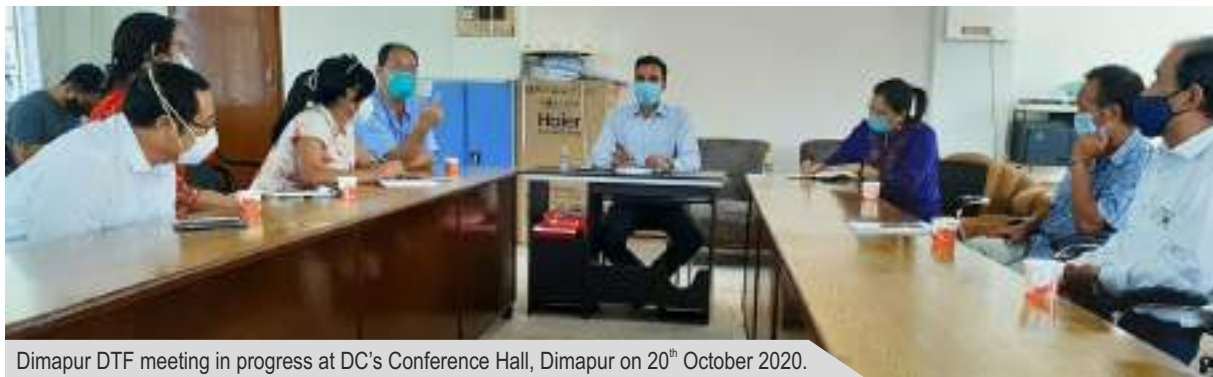
Dimapur DTF meeting in progress at DC's Conference Hall, Dimapur on 20 th October 2020.

Observing the lackadaisical attitude amongst the general public and some traders in Dimapur, Deputy Commissioner (DC), Dimapur, Rajesh Soundararajan, IAS has cautioned that more stringent enforcement of COVID-19 precautions will be carried out.