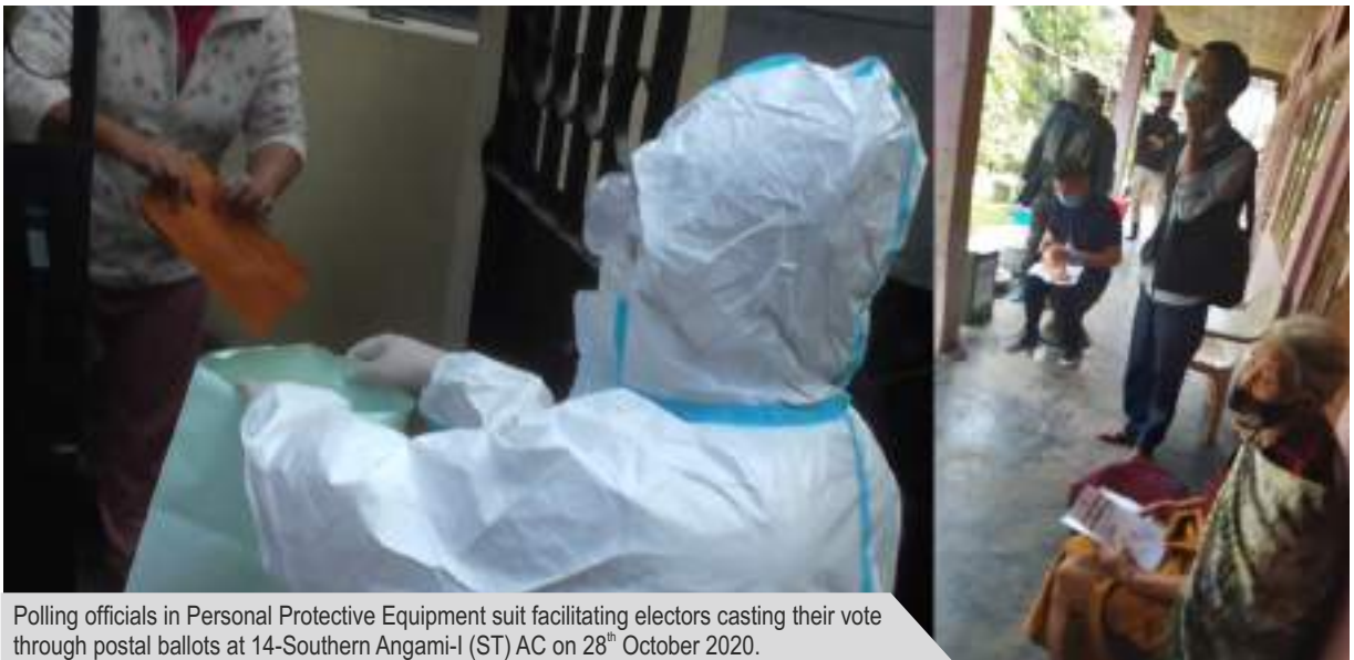
Polling officials in Personal Protective Equipment suit facilitating electors casting their vote through postal ballots at 14-Southern Angami-I (ST) AC on 28 th October 2020.

The Kohima District Task Force (DTF) on COVID-19 held an emergency meeting with regard to safe election in the upcoming bye-