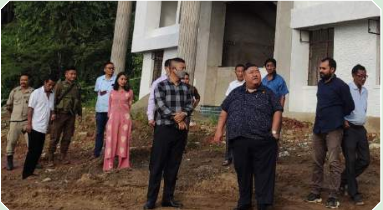
Minister, Higher Education, Technical Education and Tribal Affairs, Temjen Imna Along with other officials during their visit to the construction site of Model College, Mangkolemba on 20 th October 2020.