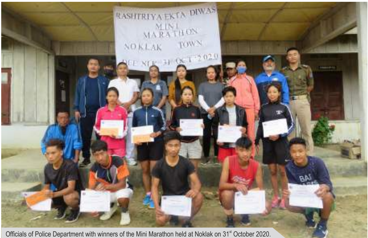
Officials of Police Department with winners of the Mini Marathon held at Noklak on 31 st October 2020.

To mark the Rashtriya Ekta Diwas, a Mini Marathon was organized by the Police Department on 31 st October 2020 at Noklak.