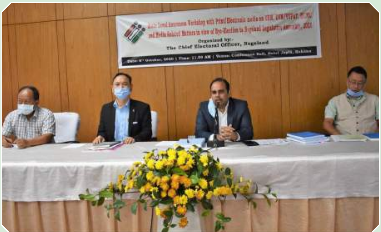
Chief Electoral Officer, Nagaland, Abhijit Sinha, IAS along with other officials during the state level awareness workshop with print and electronic media in view of bye-election to Nagaland Legislative Assembly, 2020 at Hotel Japfü, Kohima on 8 th October 2020.