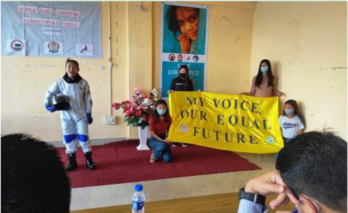
International Girl Child Day was observed at Longleng district from 7 th - 11 th October 2020.