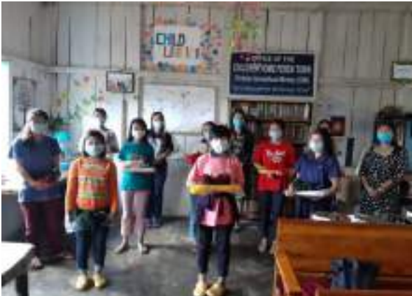
International Day of Girl Child was observed at Servanthood Ministry Children Home, Peren town on 11 th October 2020.

Meanwhile, as part of skill development programme, knitting set and plastic rope for making baskets were also distributed to the girl child and adolescents of Servanthood Ministry Children Home, Peren town.