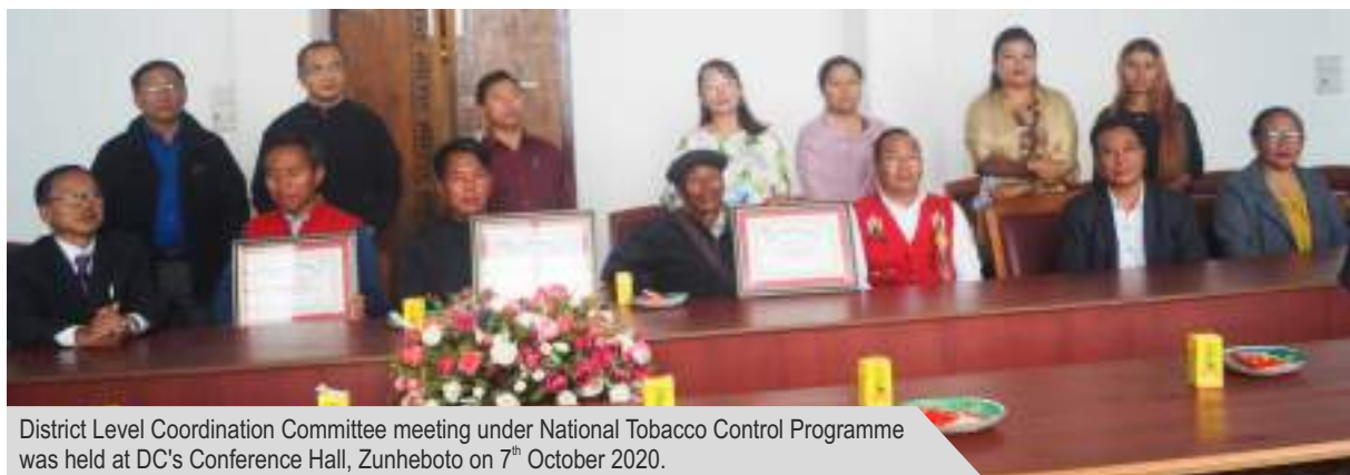
District Level Coordination Committee meeting under National Tobacco Control Programme was held at DC's Conference Hall, Zunheboto on 7 th October 2020.

District Level Coordination Committee meeting led by District National Tobacco Control