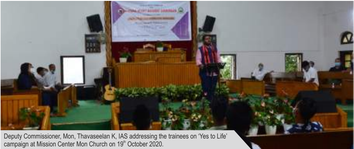
Deputy Commissioner, Mon, Thavaseelan K, IAS addressing the trainees on 'Yes to Life' campaign at Mission Center Mon Church on 19 th October 2020.

Konyak Bumeinok Bangjum Youth Ministry in collaboration with Nasha Mukta Bharat Abhiyaan, Mon held a one day training on 'Yes to Life' at Mission Center Mon Church on 19 th October 2020 with Deputy Commissioner (DC), Mon, Thavaseelan K, IAS as Special Guest.