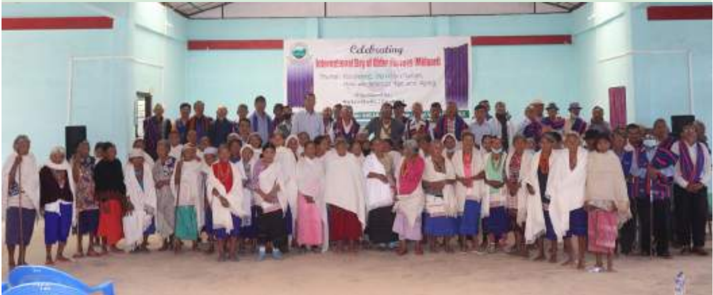
Senior citizens during a programme held to mark International Day of Older Persons at Village Council Hall, Meluri, Phek district on 1 st October 2020.