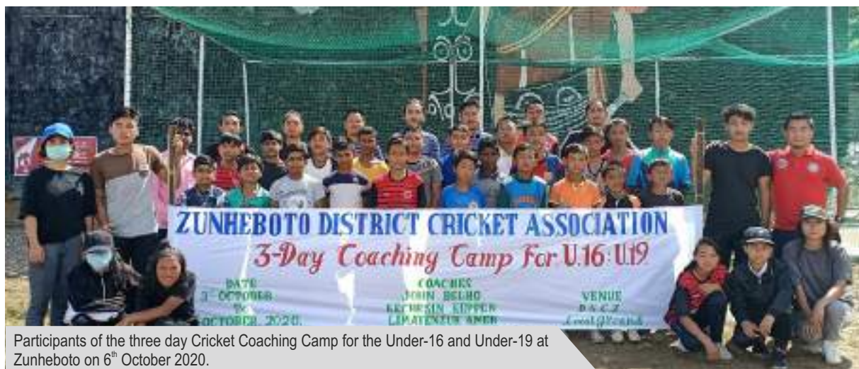
Participants of the three day Cricket Coaching Camp for the Under-16 and Under-19 at Zunheboto on 6 th October 2020.

A three day cricket coaching camp for the age group of Under-16 and Under-19 concluded on 6 th October 2020 at Zunheboto. A team of three BCCI coaches, under the aegis of the Nagaland Cricket Association (NCA) organized a coaching camp-cum-talent with an aim to reach the untouched areas, and to identify and nurture the budding talents across the State.