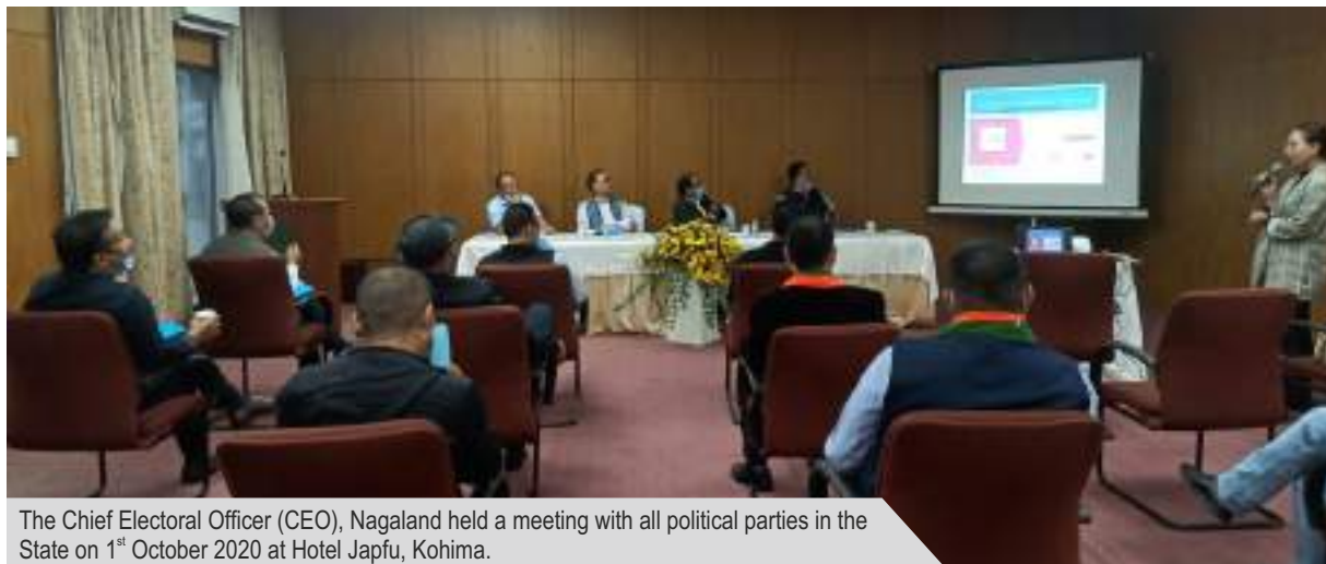
The Chief Electoral Officer (CEO), Nagaland held a meeting with all political parties in the State on 1 st October 2020 at Hotel Japfu, Kohima.

The representatives of BJP, INC, NDPP, NPF, NPP, JD (U), RPI (A) were present in the meeting.