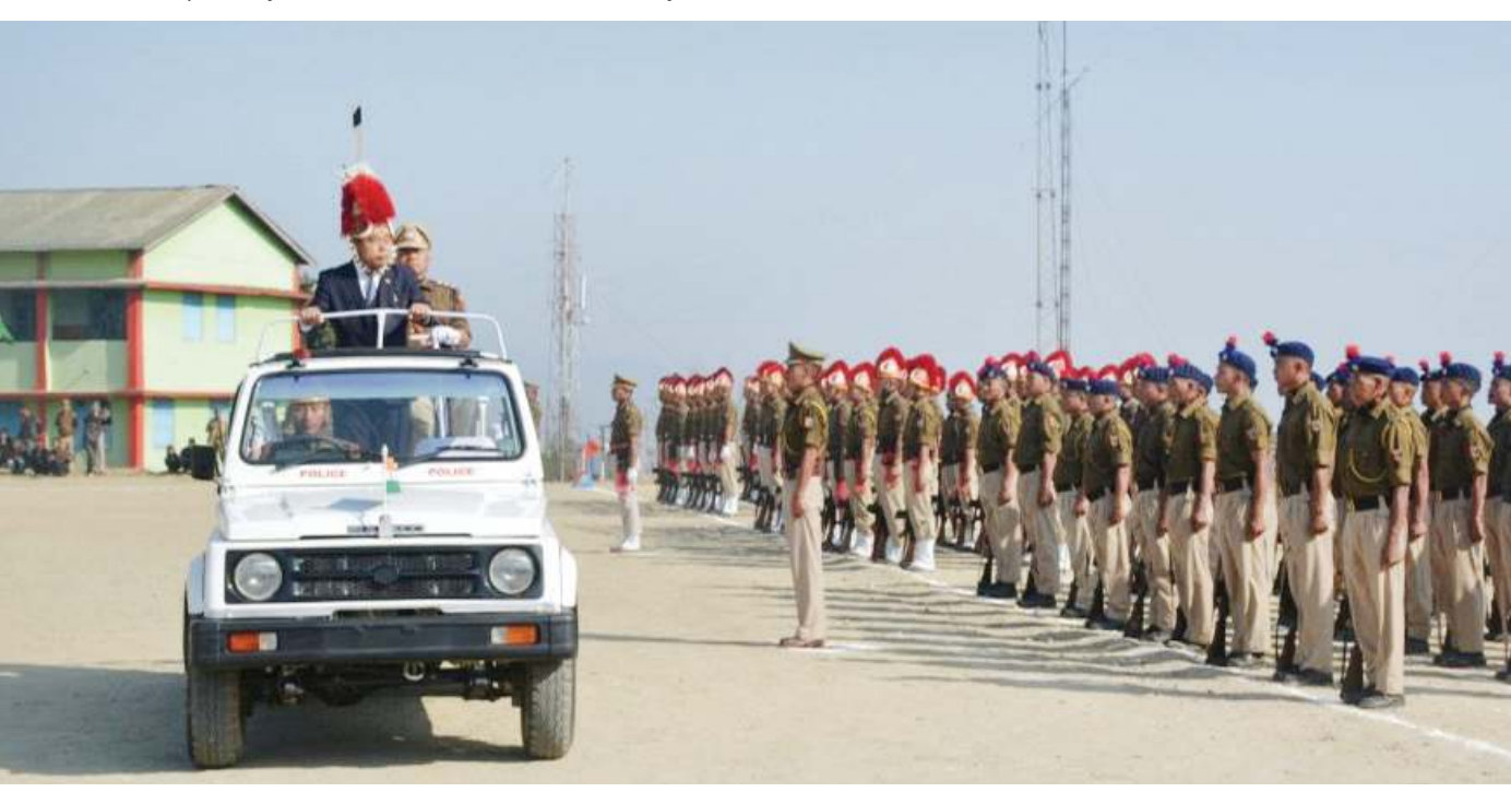
Minister, Planning & Coordination and Land Revenue, Neiba Kronu inspecting the parade contingents during the 70<sup>th</sup> Republic Day celebrations at Tuensang HQ on 26<sup>th</sup> January 2019.