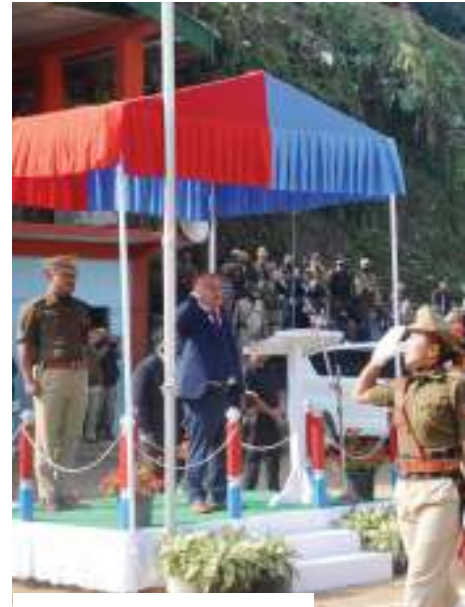
Minister, Soil & Water Conservation and Geology & Mining, V. Kashiho Sangtam taking salute from the parade contingents during the 70<sup>th</sup> Republic Day celebrations at Mon HQ on 26<sup>th</sup> January 2019.