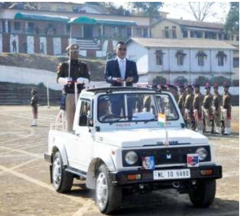
Minister, Health & Family Welfare, Pangnyu Phom inspecting the 70<sup>th</sup> Republic Day parade contingents at Wokha HQ on 26<sup>th</sup> January 2019.