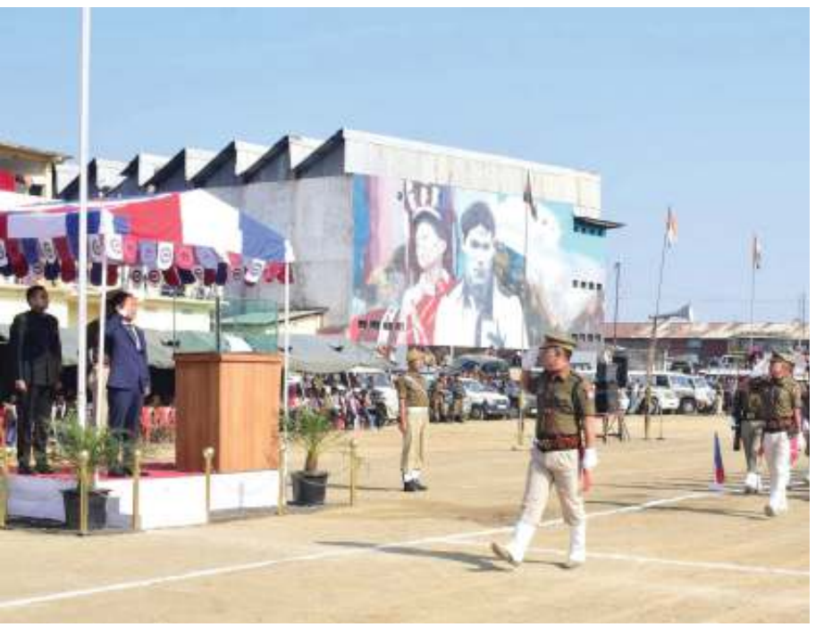
Minister, Transport, Civil Aviation & Railways and Land Resources, P. Paiwang Konyak taking salute from the parade contingents on the occasion of the 70<sup>th</sup> Republic Day celebrations at Mokokchung HQ on 26<sup>th</sup> January 2019.