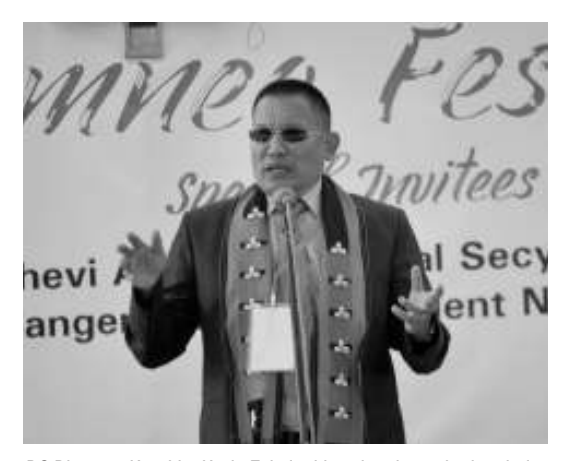
DC Dimapur, Kevekha Kevin Zehol addressing the gathering during the Tsungkamneo Festival at Dimapur District Sports Complex on 16<sup>th</sup> January 2019.

The Yimchunger Union Dimapur celebrated Tsungkamneo Festival at Dimapur District Sports Complex with Deputy Commissioner Dimapur, Kevekha Kevin Zehol as special guest and Director NEC, Energy Pvt. Ltd. Sapu Bhattacharyya as guest of honour on 16<sup>th</sup> January 2019.