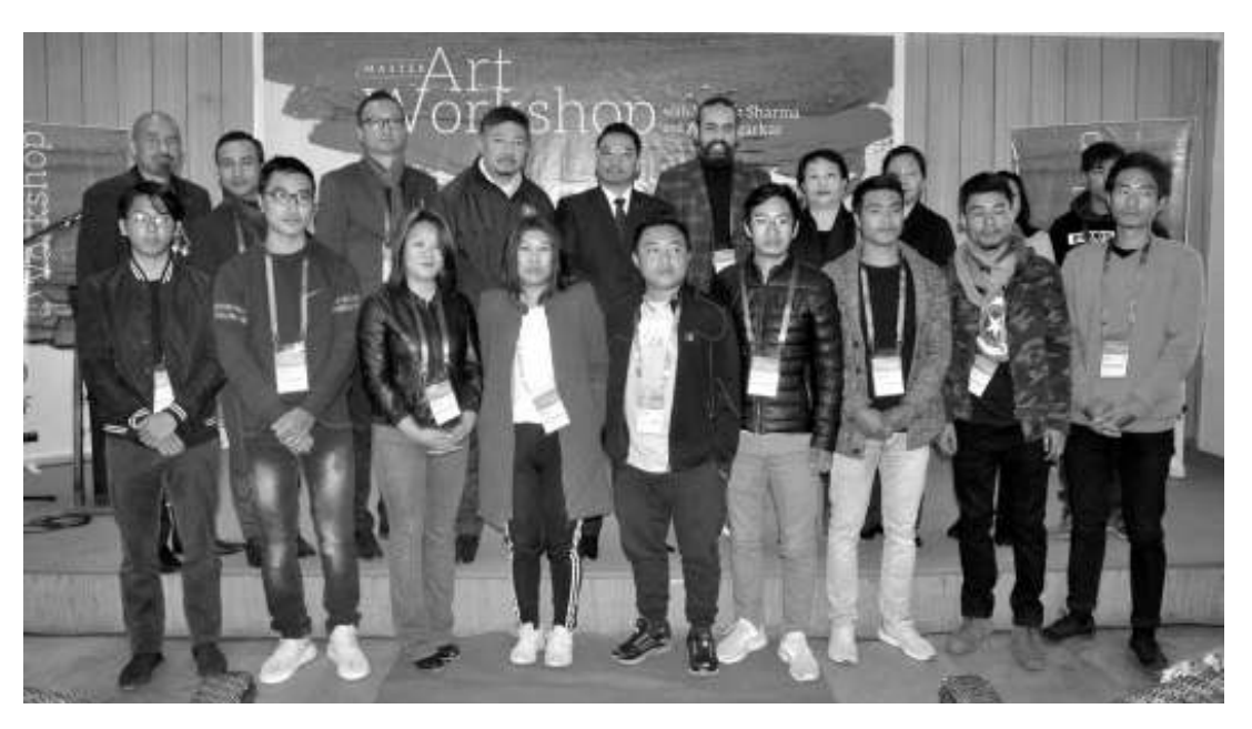
Inaugural program of the 10 day Master Art Workshop, organised by Rattle and Hum Foundation in collaboration with the Department of Art & Culture was held on 22<sup>nd</sup> January 2019 at the Heritage, Kohima.

extensively in various Indian metros as well as international galleries at Dusseldorf, Zurich and New York.