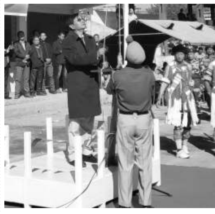
Advisor, Food & Civil Supplies, Legal Metrology & Consumer Protection, NSDMA, Pukhayi unfurling the national flag on the occasion of the 70<sup>th</sup> Republic Day celebrations at Pfutsero subdivision on 26<sup>th</sup> January 2019.