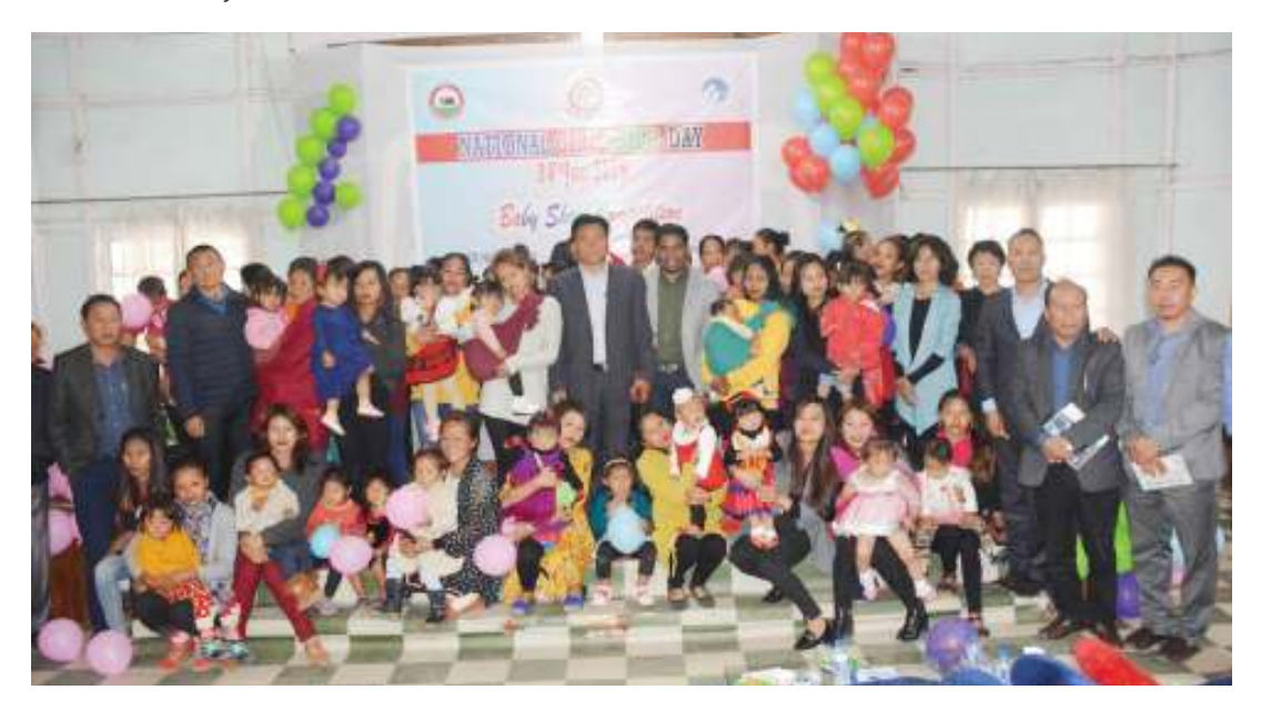
Officials from District Administration, Social Welfare and Health & Family Welfare with the participants of the Baby Show Competition on the occasion of the National Girl Child Day which was observed at CSK Hall, Tuensang on 24<sup>th</sup> January 2019.