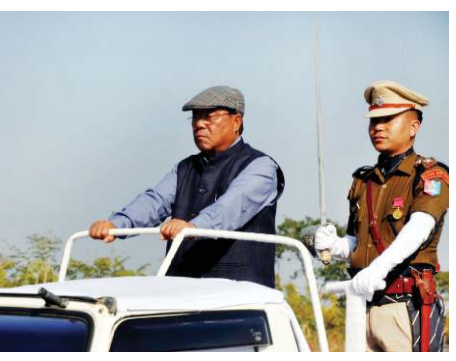
Minister, Agriculture and Co-operation, G. Kaito Aye graced the 70<sup>th</sup> Republic Day celebrations at Peren HQ on 26<sup>th</sup> January 2019.