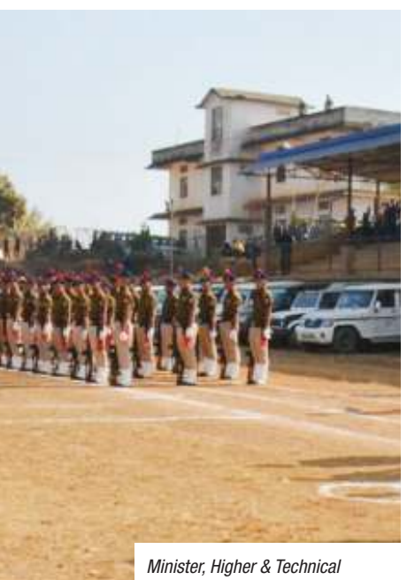
Minister, Higher & Technical Education, Temjen Imna Along inspecting the 70<sup>th</sup> Republic Day parade contingents at Kiphire HQ on 26<sup>th</sup> January 2019.