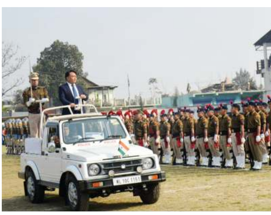
Minister, Urban Development and Municipal Affairs, Metsubo Jamir inspecting the 70<sup>th</sup> Republic Day parade contingents at Dimapur HQ on 26<sup>th</sup> January 2019.