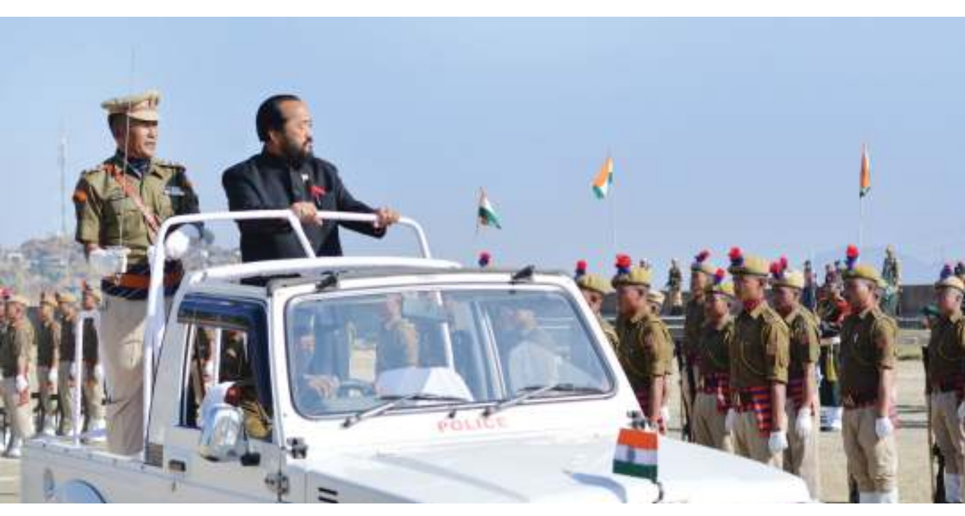
Deputy Chief Minister and Minister for Home and National Highways, Y. Patton inspecting the parade contingents on the occasion of the 70<sup>th</sup> Republic Day celebrations at Zunheboto HQ on 26<sup>th</sup> January 2019.