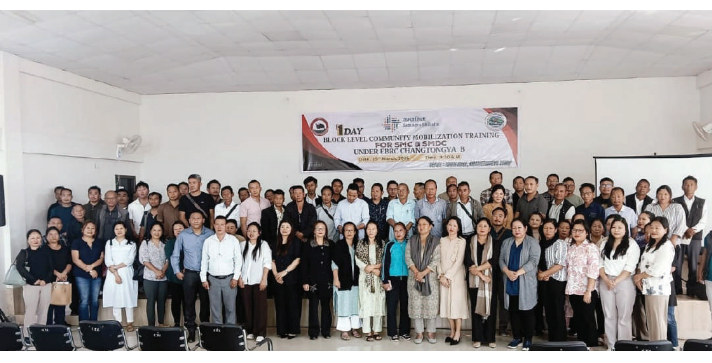
Officials and participants at the one-day block level community mobilization for School Management Committees (SMCs) and School Management and Development Committees (SMDCs) held at Changtongya, Mokokchung on 25<sup>th</sup> March 2025.