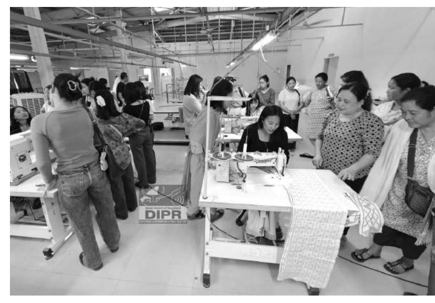
Participants experiencing hands-on training in advance machinery during the Apparel Technology Workshop held at Mongken Apparel Unit, Sovima, Chumoukedima on 4<sup>th</sup> and 5<sup>th</sup> March 2025.

The workshop featured six technology clinics covering topics, fusion of handloom weaving modern technology, and understanding fabric types, textile printing technologies, digitization of motifs and patterns, optimizing apparel production workflow, and sustainable practices in production.