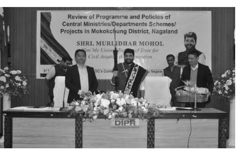
Union Minister of State for Civil Aviation and Cooperation, Murlidhar Mohol being felicitated during his visit to Mokokchung on 3<sup>rd</sup> March 2025.

development. The Minister while appreciating the natural beauty of Mokokchung district, also thanked the people for the hospitality shown towards him.