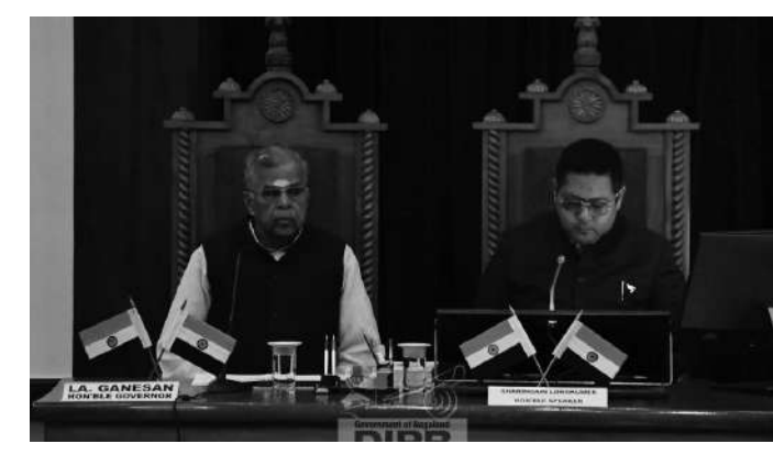
Governor, La. Ganesan addressing the first day of the Sixth Session of the 14<sup>th</sup> NLA at NLA Hall, Kohima on 3<sup>rd</sup> March 2025.

The Governor said that the House has collectively taken steps to ensure the peaceful resolution of the Naga political issue. As assured on the floor of the House by the Chief Minister, the Government held a Consultative Meeting with the apex and influential tribal bodies and civil society organisations to deliberate on the Naga Political Issue on 12<sup>th</sup> September 2024. On 21<sup>st</sup> November 2024, the Chief Minister, accompanied by his Cabinet colleagues, met the Union Home Minister and apprised him of the people's desire for an early solution to