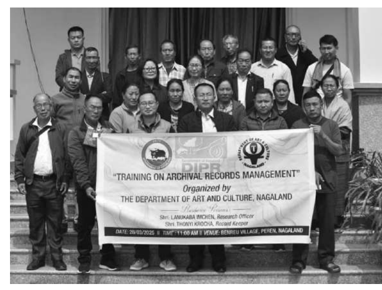
Officials with participants during the one-day training on Archival Record Management held at Benreu, Peren on 28<sup>th</sup> March 2025.

The training was attended by <sup>Man</sup> village council members, church leaders and others. During the practical session, the resource persons also visited the church