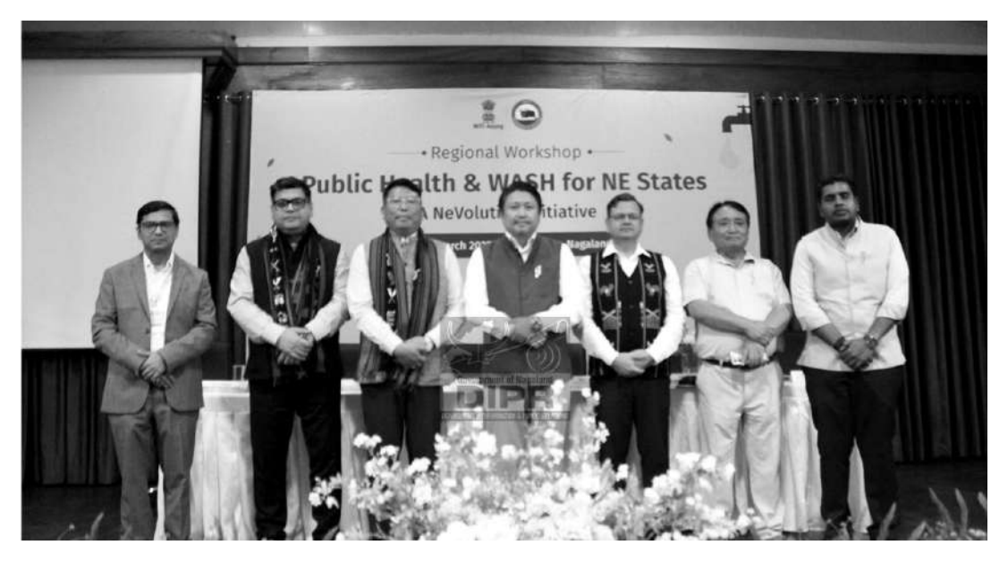
Minister, PHED and Co-operation, Jacob Zhimomi, Minister, Rural Development, Mestubo Jmair and other senior officials at the Regional Workshop on Public Health and WASH for NE States held at Niathu Resort, Chumoukedima on 26<sup>th</sup> March 2025.

Further, Zhimomi pointed that with regard to Aspirational Block Programme, out of 3 (three) Aspirational Blocks, Akuhaito Block in Zunheboto district has attained 100% ODF Plus status. Infrastructures in the other two Blocks have been built, but the progress appears rather low on the IMIS because of rigorous marking system in order to declare a village ODF Plus.