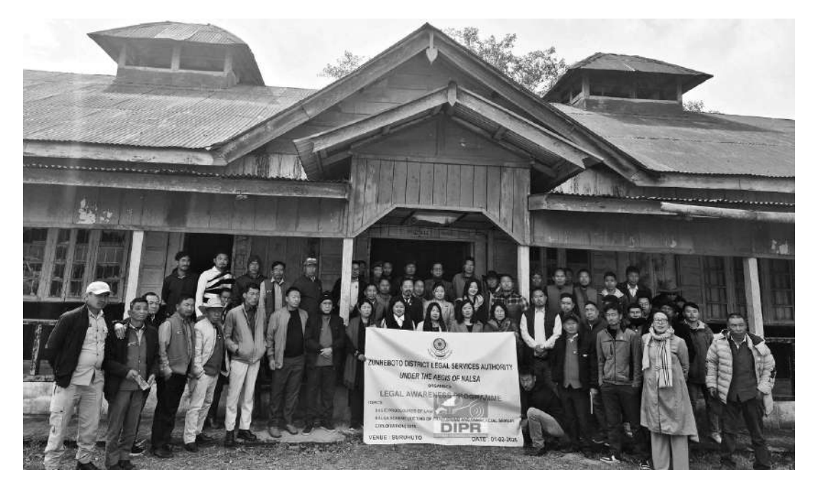
SDO (C), Suruhoto, Trongdiba Tongpi along with ZDLSA officials and participants during the legal awareness programme held at Town Hall, Suruhuto, Zunheboto on 1<sup>st</sup> March, 2025.

The programme concluded with an interactive session with active participation from O.C. Police, and the participants shared experiences and cleared their queries. The elders/leaders further expressed their needs and requested the authorities to set up Legal Aid Clinic at Suruhoto, so as to cater to the needs of the people including the neighbouring villages. Pamphlets/leaflets were later distributed to all the participants.