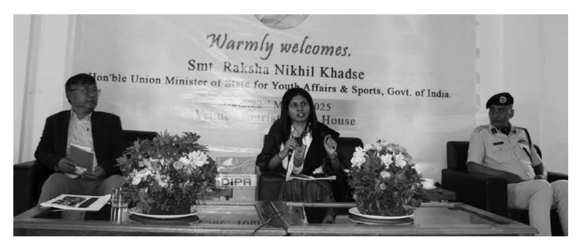
Union Minister of State for Youth Affairs & Sports, Raksha Nikhil Khadse chairing a meeting during her visit to Noklak on 22^{nd} March 2025.

Guard of honour was performed by the Nagaland Village Guards, Noklak. As part of the visit, the Union Minister along with officials from various departments visited Nokyan village to assess the needs of the local community. The purpose of her visit was to get an overview of the district's profile, progress and challenges.