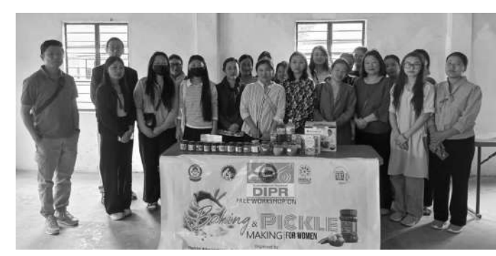
District Administration and SANKALP-DHEW organised a one-day workshop on pickle making and baking at Tseminyu Town Hall on 22<sup>nd</sup> March 2025.

During the workshop, experts/ entrepreneurs from 'Eja pickle' and 'The Touch' Tseminyu imparted training in making bitter gourd pickle, eggplant pickle,