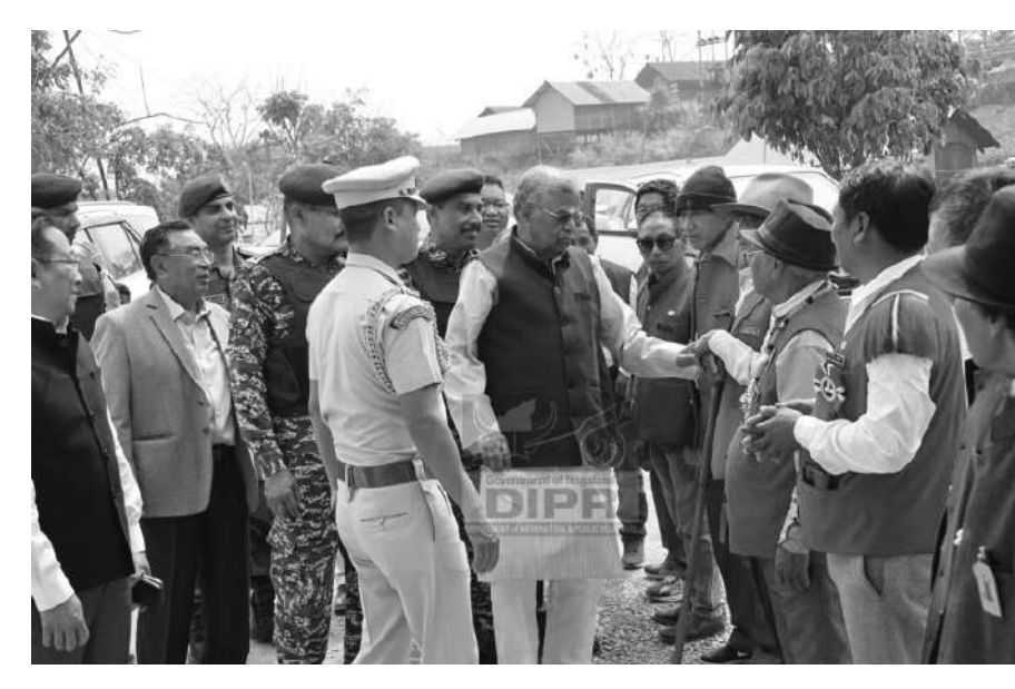
Governor La Ganesan being greeted by village elders during his visit to Meluri district on 28^{th} March 2025.

"Meluri may be the youngest district of our state, but it holds immense promise for bright future," a the Governor remarked. He described the district as "the Land of Fortunes." highlighting its rich