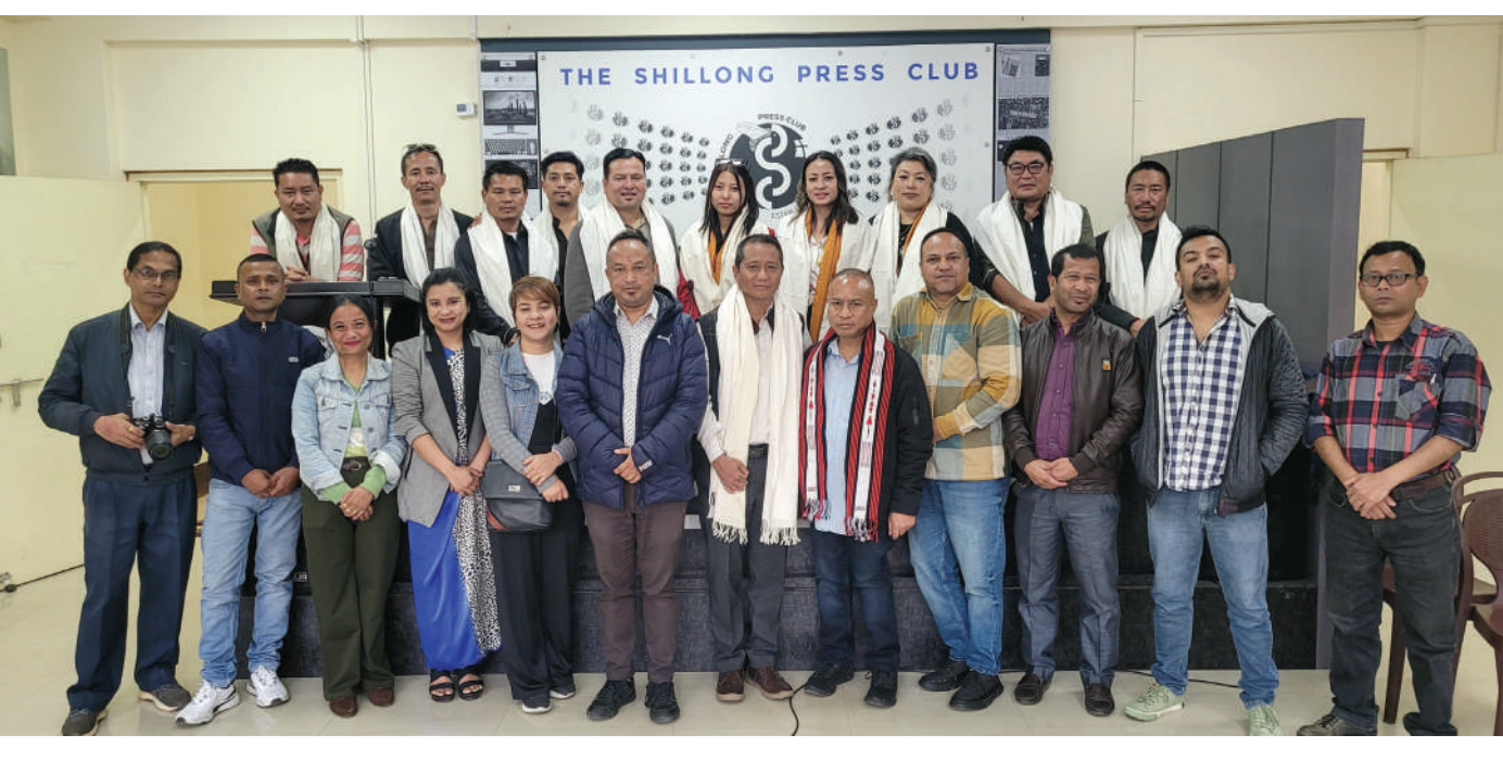
Nagaland Media Team along with the Press Club of Shillong during the media exposure tour at the Conference Hall of the Shillong Press Club on 25^{th} March 2025.