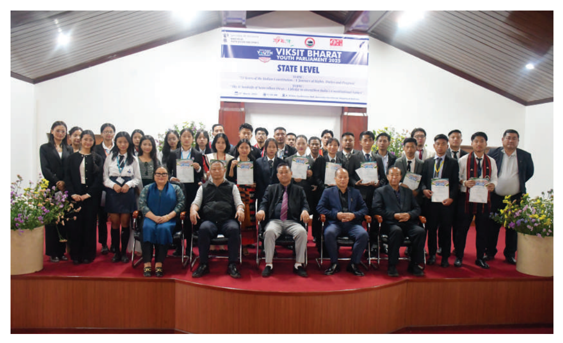
Viksit Bharat Youth Parliament 2025 (District Level) was held under the theme 'One Nation, One Election: Paving the way for Viksit Bharat,' at Dimapur on 21<sup>st</sup> and 22<sup>nd</sup> March 2025.