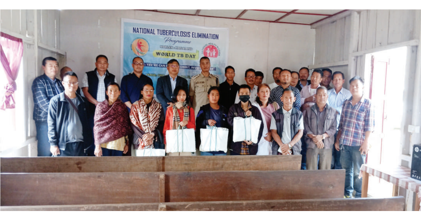
Deputy Commissioner, Noklak, Arikumba with other officials and participants during the World Tuberculosis Day observed at Noklak on 24<sup>th</sup> March 2025.