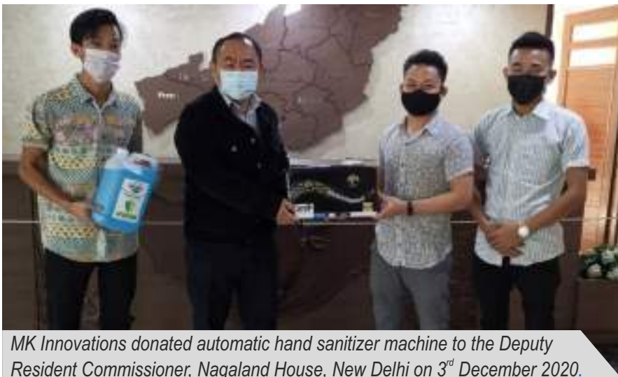
MK Innovations donated automatic hand sanitizer machine to the Deputy Resident Commissioner, Nagaland House, New Delhi on 3 rd December 2020.