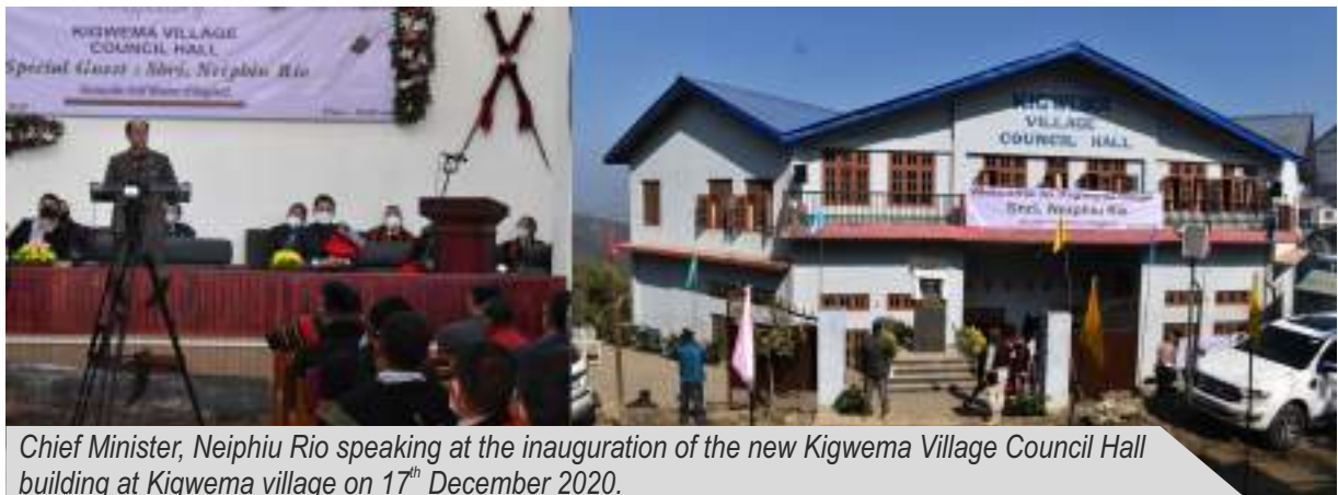
Chief Minister, Neiphiu Rio speaking at the inauguration of the new Kigwema Village Council Hall building at Kigwema village on 17 th December 2020.

Chief Minister, Neiphiu Rio inaugurated the new Kigwema Village Council Hall building at Kigwema village on 17 th December 2020.