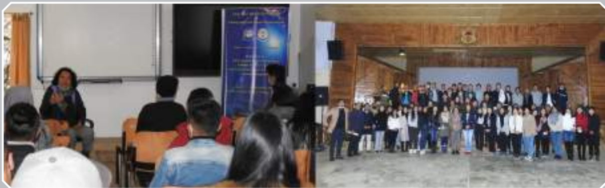
A three day state level workshop on Ethnography and Visual Documentation was organized by the Department of Anthropology, Kohima Science College (Autonomous), Jotsoma from 3 rd to 5 th December 2020.