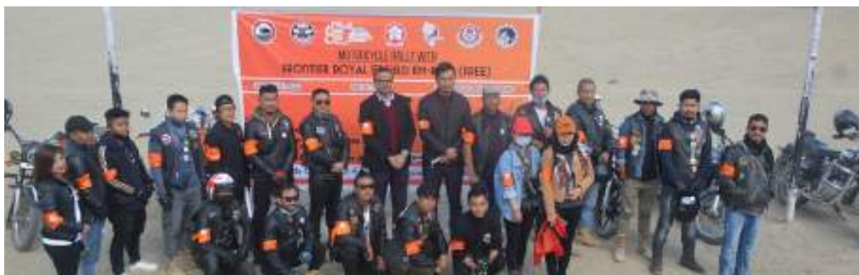
The Sakhi-One Stop Centre and Mahila Shakti Kendra organized a Motor Cycle rally in collaboration with Frontier Royal Enfield En-Blok (FREE) Club as an awareness campaign for violence against women at Parade Ground, Tuensang on 10 th December 2020.

The Sakhi-One Stop Centre and Mahila Shakti Kendra organized a Motor Cycle rally in collaboration with Frontier Royal Enfield En-Blok (FREE) Club as an awareness campaign for violence against women at Parade Ground,