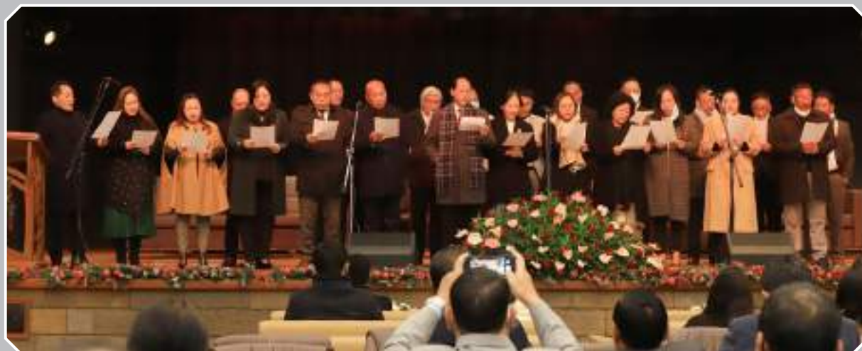
Nagaland Legislators and their wives presenting a special number during the Advent Christmas programme held at the State Banquet Hall (New), CMRC, Kohima on 12 th December 2020.