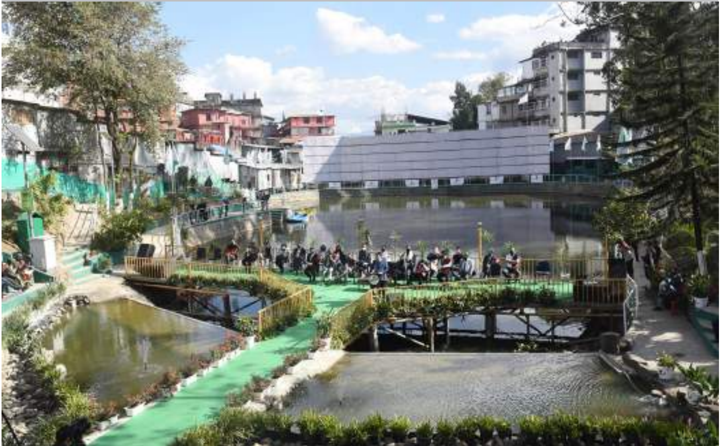
Minister, Rural Development, Metsubo Jamir speaking during the inauguration of Sokhriezie Park at Kohima on 4 th December 2020.