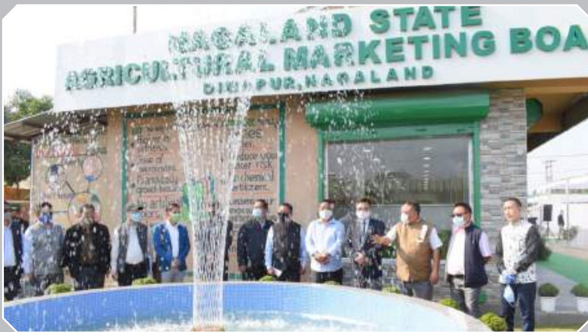
Minister, Agriculture and Cooperation, G. Kaito Aye inaugurating the Organic AC Market at NSAMB Complex at Agri Expo Site, Dimapur on 8 th December 2020.