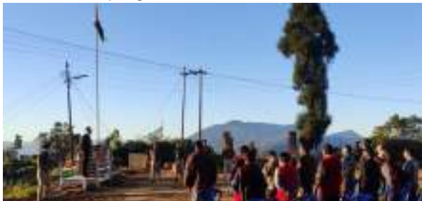
EAC, Tening, Tumben P. Tsanglao delivering the 58 th Statehood Day speech at Tening on 1 st December 2020.

Tumben P. Tsanglao, EAC, unfurled the national flag which was followed by reading of the Statehood Day speech. Government officials from different departments, GBs and public leaders attended the programme.