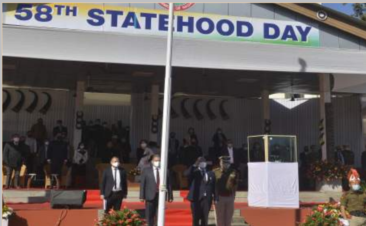
Chief Minister, Nagaland, Neiphiu Rio taking the salute on the occasion of the 58 th Statehood Day at Nagaland Civil Secretariat Plaza, Kohima on 1 st December 2020.