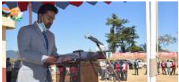
DC, Phek, Sachin Jaiswal, IAS delivering the speech during the 58 th Statehood Day celebration at Phek on 1 st December 2020.

After the function, the District Planning and Development Board meeting was also held where the DC called upon everyone to be attentive in their duties for smooth conducive atmosphere of the district in particular and the State as a whole.