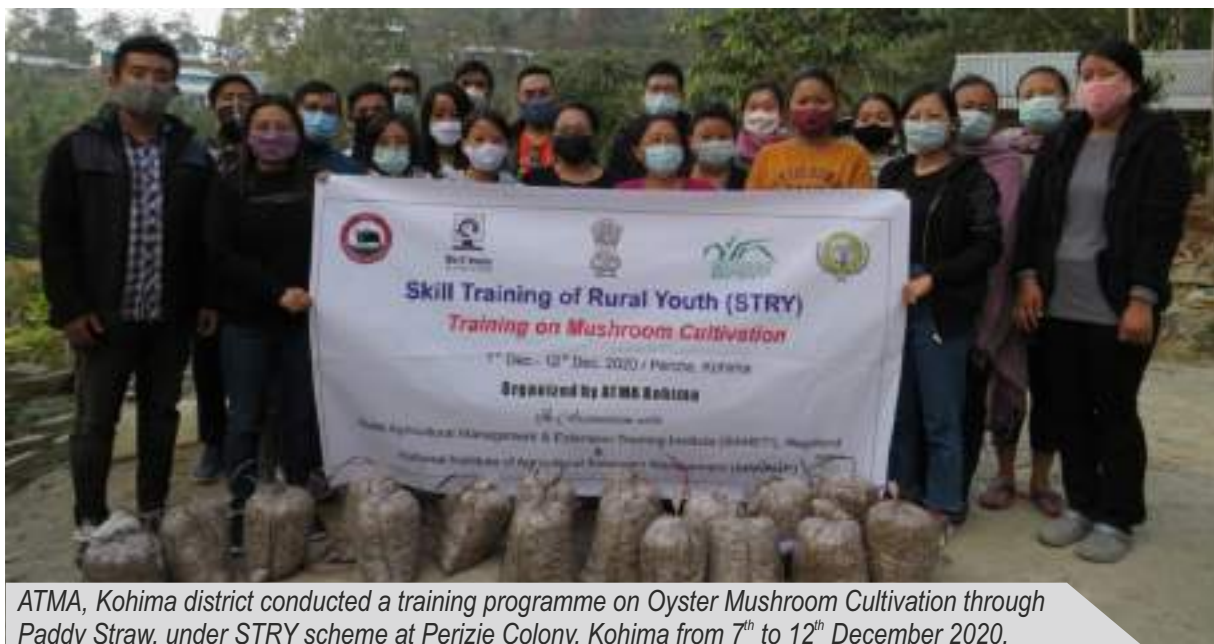
ATMA, Kohima district conducted a training programme on Oyster Mushroom Cultivation through Paddy Straw, under STRY scheme at Perizie Colony, Kohima from 7 th to 12 th December 2020.

ATMA, Kohima district conducted training programme on Oyster Mushroom Cultivation through Paddy Straw, under Skill Training for Rural Youth (STRY) Scheme under the Sub-Mission on Agriculture Extension (SMAE) of National Mission on Agricultural Extension Technology (NMAET) of Ministry of Agriculture and Farmer's Welfare,