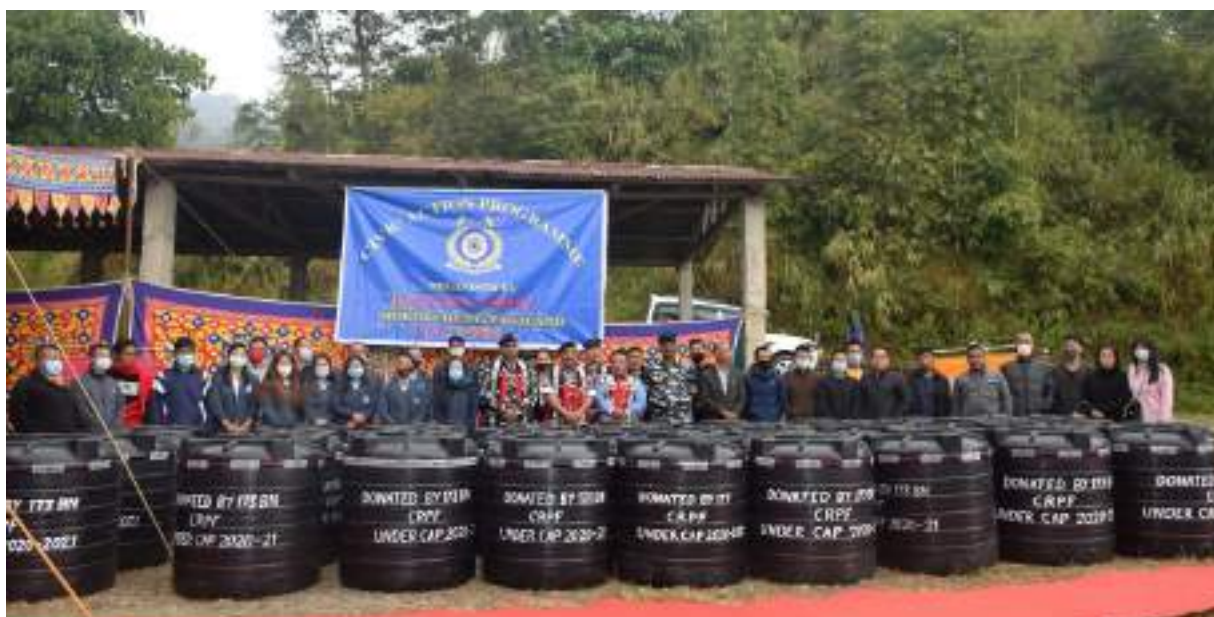
Commandant 173 BN, CRPF, Vishnu Goutam and other officials with the beneficiaries during the Civic Action Programme organized by B/173 BN, CRPF at Mokokchung on 18 th December 2020.

In continuance with the Civic Action Programme (CAP) the B/173 BN, CRPF organized a Water Storage Tank distribution programme on 18 th December 2020 at Mokokchung.