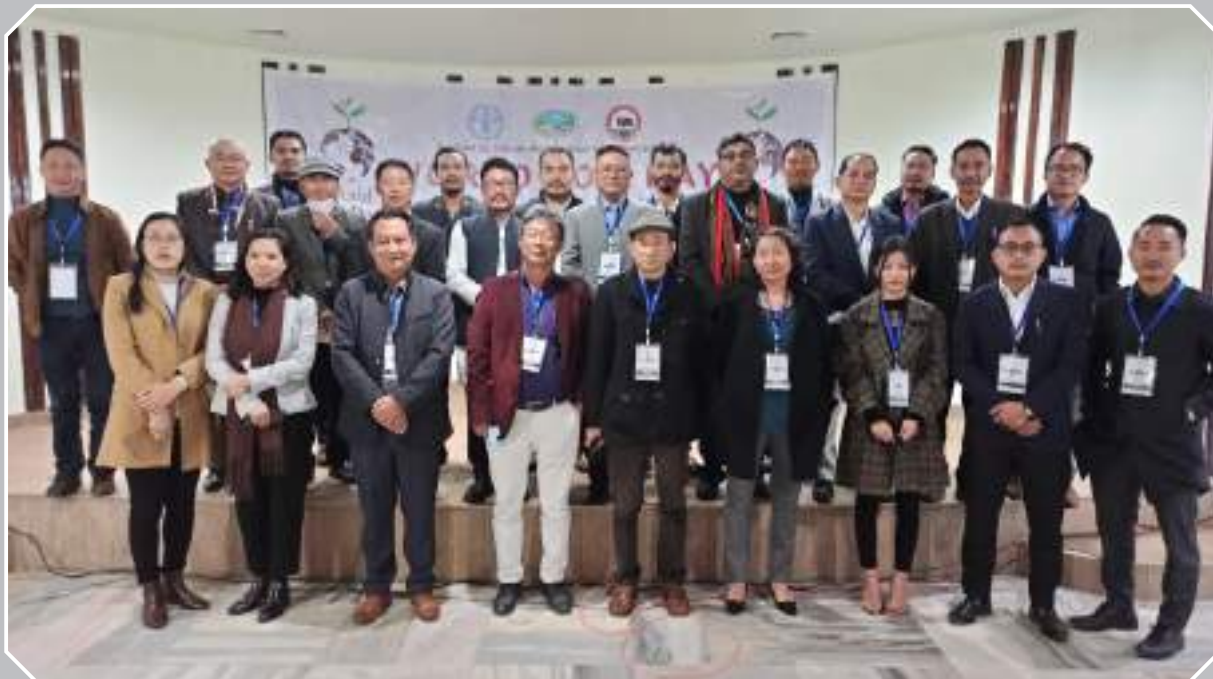
World Soil Day with the theme, "Keep soil alive, protect soil biodiversity" was observed at Hotel Japfu, Kohima on 5 th December 2020, organised by the Department of Soil & Water Conservation, Nagaland in coordination with the Food & Agriculture Organisation, United Nations.