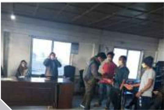
Model AWC-cum-distribution of relief to the fire victims was held at AWC-A Wakching village, Mon on 11 th December 2020