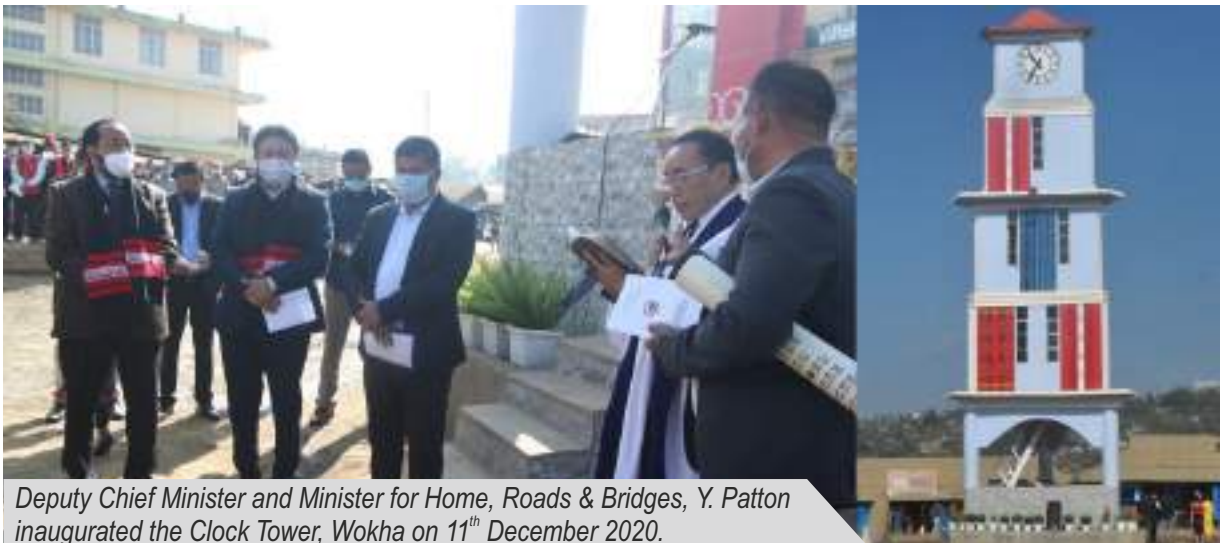
Deputy Chief Minister and Minister for Home, Roads & Bridges, Y. Patton inaugurated the Clock Tower, Wokha on 11 th December 2020.

Deputy Chief Minister, Home and Roads & Bridges (R&B), Y. Patton inaugurated the Clock Tower, Wokha on 11 th December 2020.