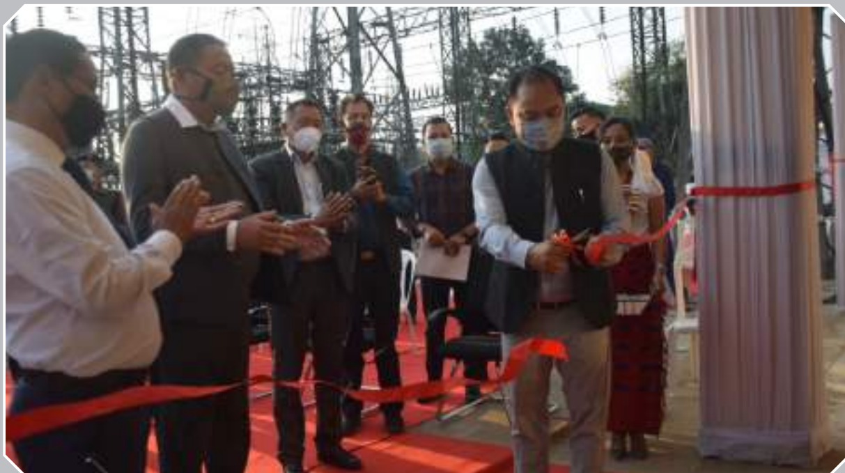
Advisor, Power, H. Tovihoto Ayemi inaugurating the upgraded 2×100 MVA Power Sub-Station, Nagarjan, Dimapur on 9 th December 2020.