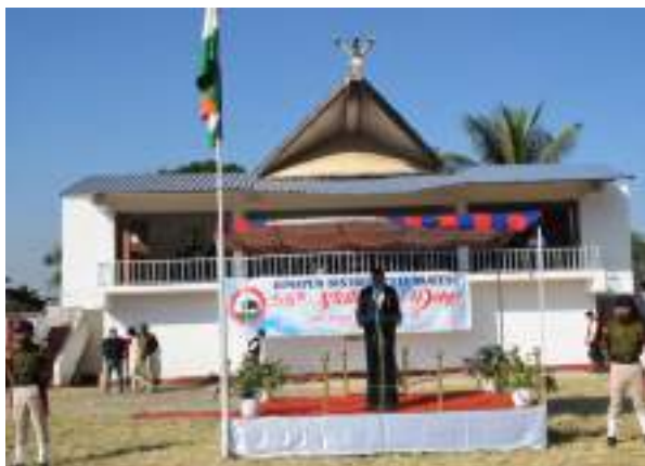
DC, Dimapur, Rajesh Soundararajan IAS delivering an address during the 58 th Nagaland Statehood Day celebrated at Dimapur on 1 st December 2020.

Parade contingents for the day included Commissionerate of Police, 15 th IRB Mahila Battalion and 15 th IRB Mahila Battalion Pipe Band and ABI, Commissionerate of Police, Dimapur, Neichuzo Rio was the Parade Commander.