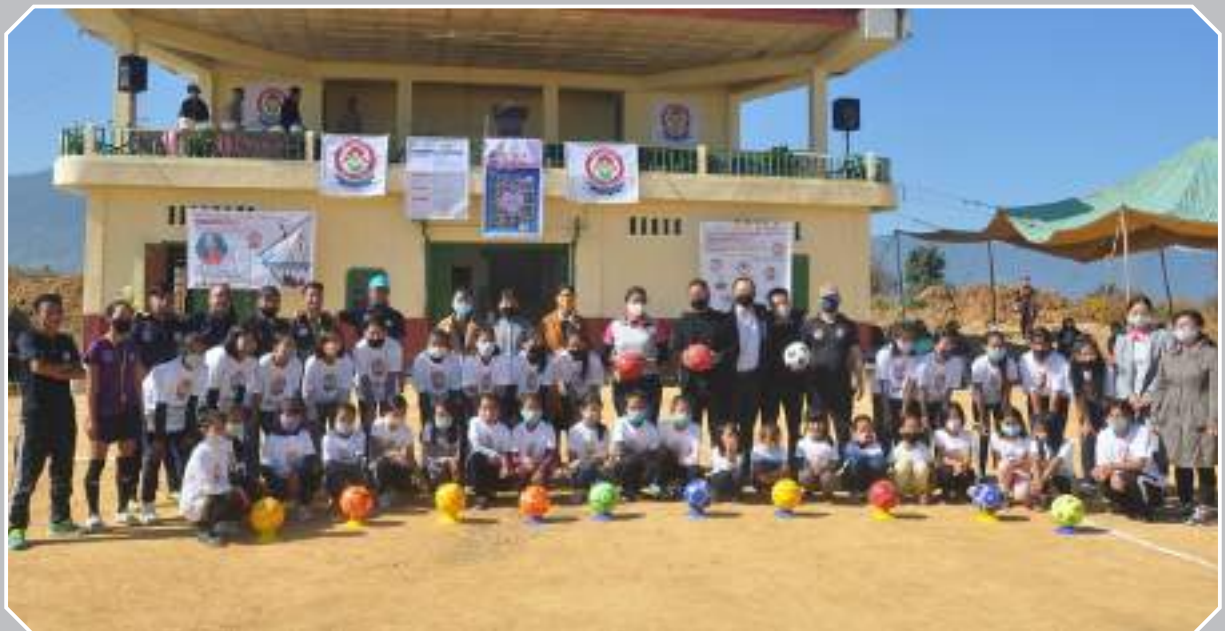
Girls Football Coaching Camp 2020 was held at Phek Town Local Ground on 8 th December 2020 under Beti Bachao Beti Padhao.