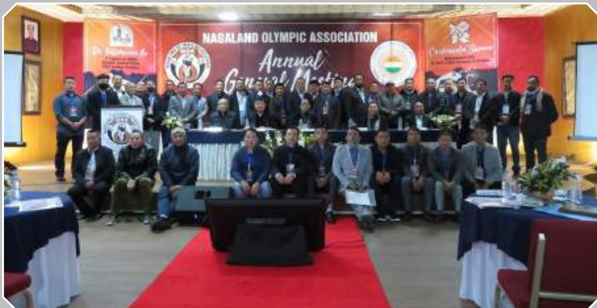
The Nagaland Olympic Association held its Annual General Meeting with the affiliated associations at the Banquet Hall, State Guest House, Kohima on 11 th December 2020.