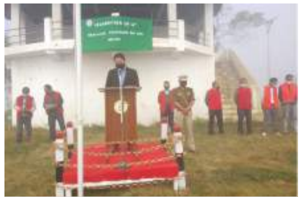
ADC, Meluri, Temjen Chuba reading out the 58 th Statehood Day speech at Meluri on 1 st December 2020.

The 58 th Statehood Day was observed at Local Ground, Meluri on 1 st December 2020. ADC, Meluri, Temjen Chuba read out the Statehood Day message, which was attended by all government employees and Heads of Offices under Meluri sub-division.