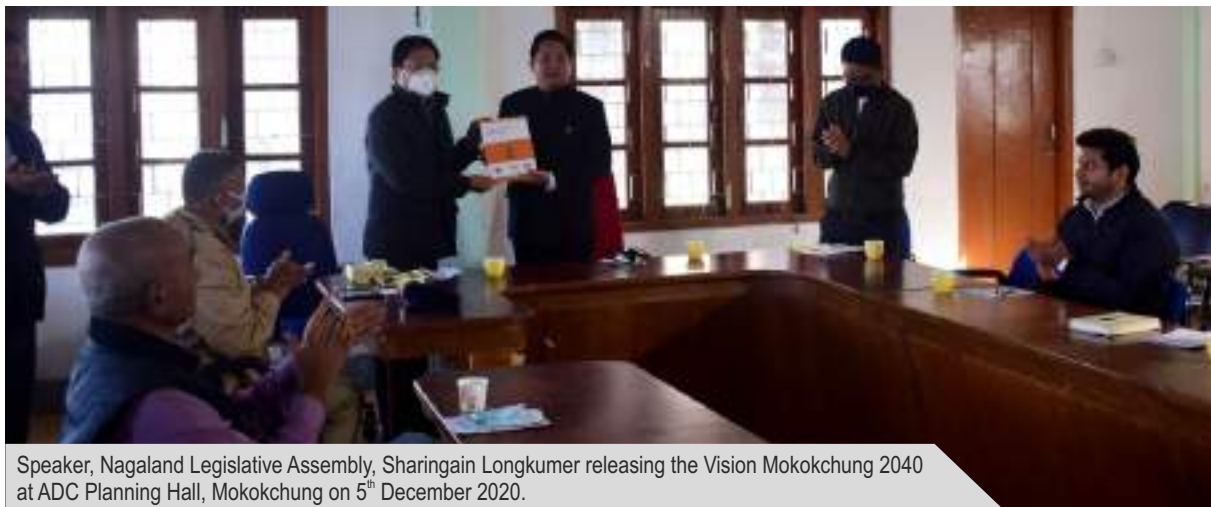
Speaker, Nagaland Legislative Assembly, Sharingain Longkumer releasing the Vision Mokokchung 2040 at ADC Planning Hall, Mokokchung on 5 th December 2020.

Speaker, Nagaland Legislative Assembly, Sharingain Longkumer released the Vision Mokokchung 2040 at ADC Planning Hall, Mokokchung on 5 th December 2020. The document was prepared and published by Mokokchung District Art & Culture Council (MDACC) and Mayangnokcha Award Trust (MAT), a collaboration between the Mokokchung Town Quasiquicentennial Planning and Organizing Committee and the citizens of Mokokchung.