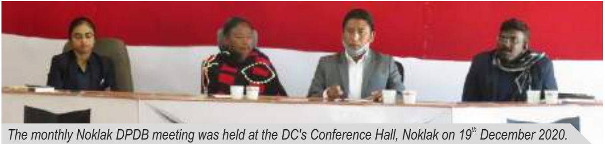
The monthly Noklak DPDB meeting was held at the DC's Conference Hall, Noklak on 19 th December 2020.

The monthly Noklak District Planning and Development Board (DPDB) meeting was held on 19 th December 2020 at Deputy Commissioner's Conference Hall, Noklak.