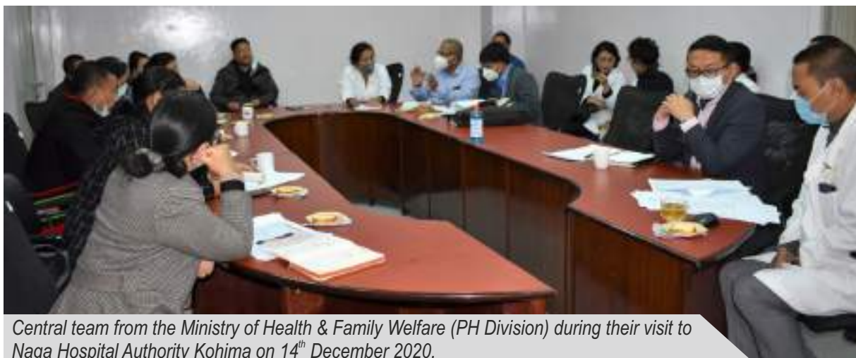
Central team from the Ministry of Health & Family Welfare (PH Division) during their visit to Naga Hospital Authority Kohima on 14 th December 2020.

A central team from the Ministry of Health & Family Welfare (PH Division) visited Naga Hospital Authority Kohima (NHAK) on 14 th December 2020 to assist State Health Department in review of public health measures and clinical management for COVID-19.