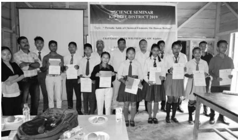
Science Seminar on the topic “Periodic Table of Chemical Elements: Impact on Human Welfare” was held at EBRC Hall, Kiphire on 23 rd August 2019