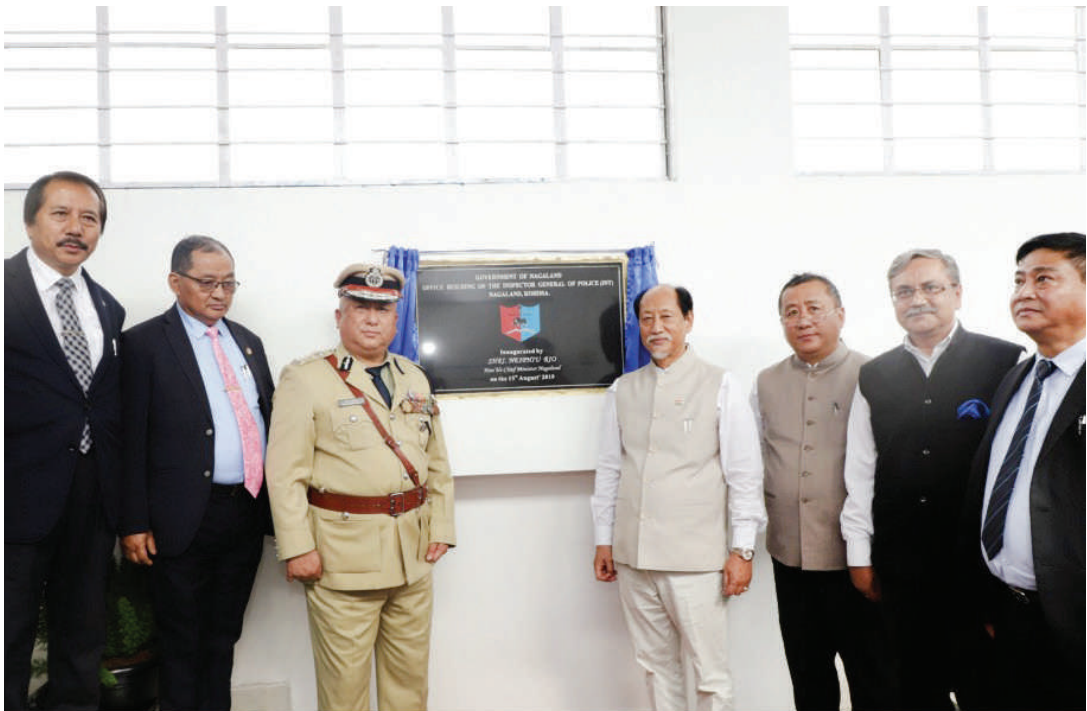
Chief Minister, Neiphiu Rio inaugurated the new office building of the Inspector General of Police (Intelligence) at PHQ Complex, Kohima on 15 th August 2019.