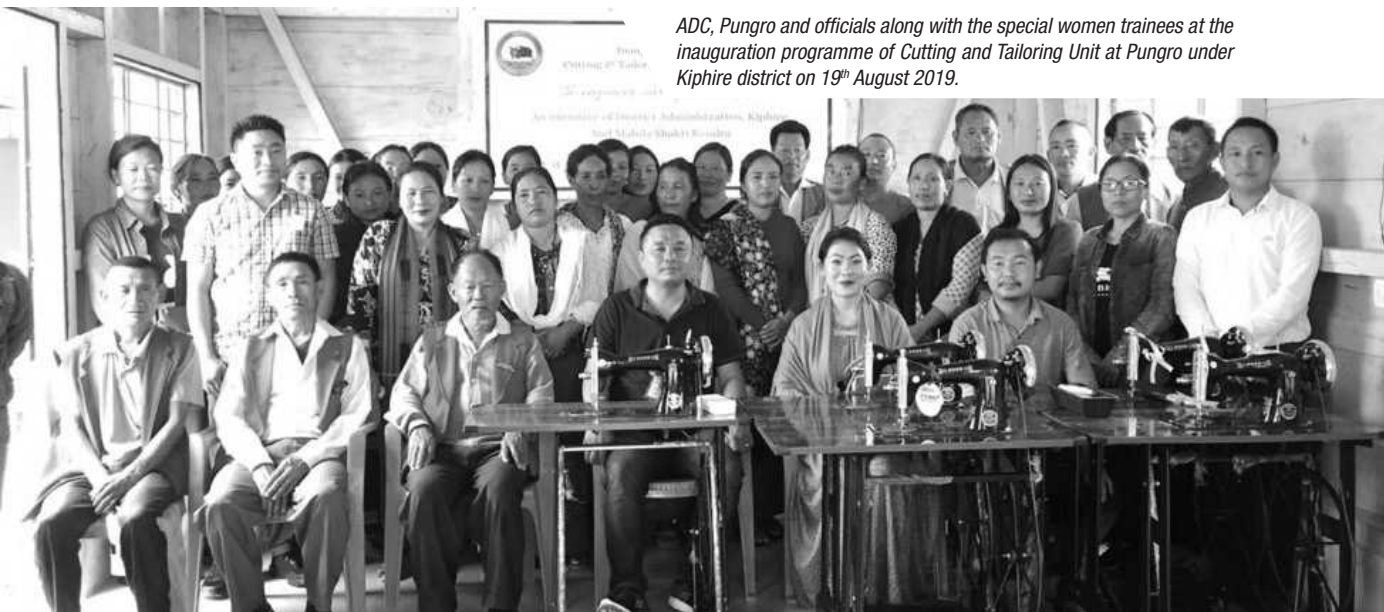
ADC, Pungro and officials along with the special women trainees at the inauguration programme of Cutting and Tailoring Unit at Pungro under Kiphire district on 19 th August 2019.

Simultaneously, the same launching programme was also held in Pungro and Seyochung-Sitimi Sub-Division.