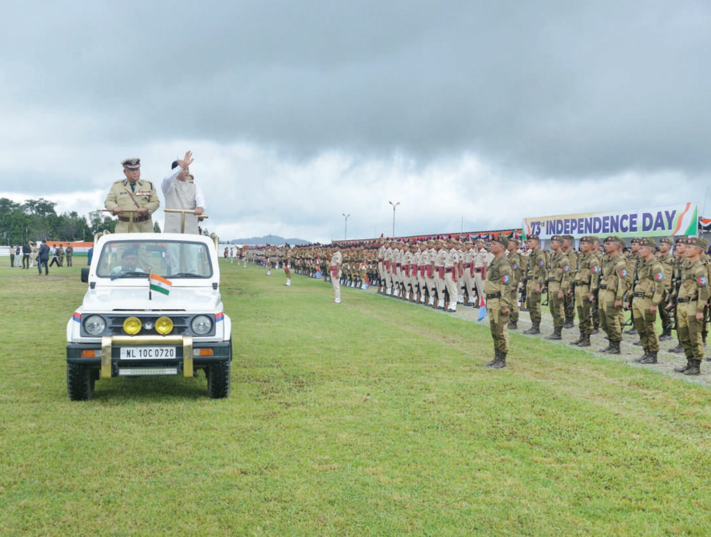
Chief Minister, Neiphiu Rio inspecting the parade contingents on the occasion of the 73 rd Independence Day celebrations at the Secretariat Plaza, Kohima on 15 th August 2019.