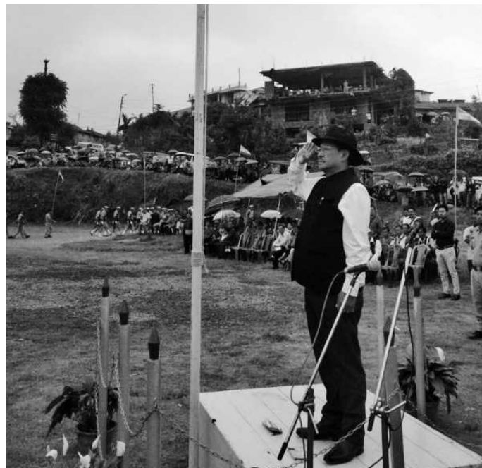
Advisor, Sericulture, Excise and Minority Affairs, Zhaleo Rio taking the salute after unfurling the national flag on the Independence Day at Tseminyu town on 15 th August 2019.

National anthem was sung by the students Government High School Tesophenyu village. The chief guest also inaugurated the exhibition stalls put up by Agriculture and Allied Departments and various Self Help Groups. Folk songs and dance by Kandinu Azami, Tseminyu South village, Kasha Daho, special song by Mt. Terogu Theological College Zumphu, Taekwondo display by students of Christian School Tseminyu were the other highlights of the celebration.