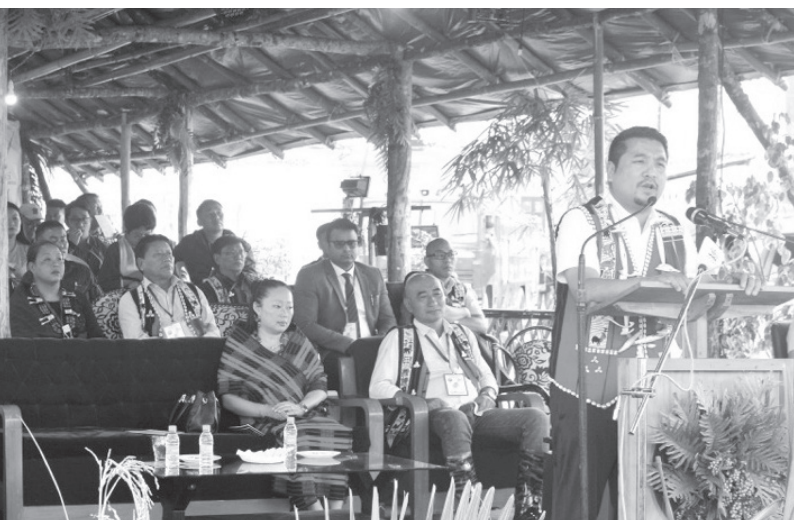
Minister for Housing and Mechanical, Tongpang Ozukum addressing the Tsungremmong Mini Hornbill Festival celebration at Imkongmeren Sports Complex, Mokochung on 1 st August 2019.

Tsungremmong Mini Hornbill Festival Mokochung 2019 was held at Imkongmeren Sports Complex on 1 st August 2019 with Minister, Housing and Mechanical, Tongpang Ozukum declaring the festival open as the special guest.