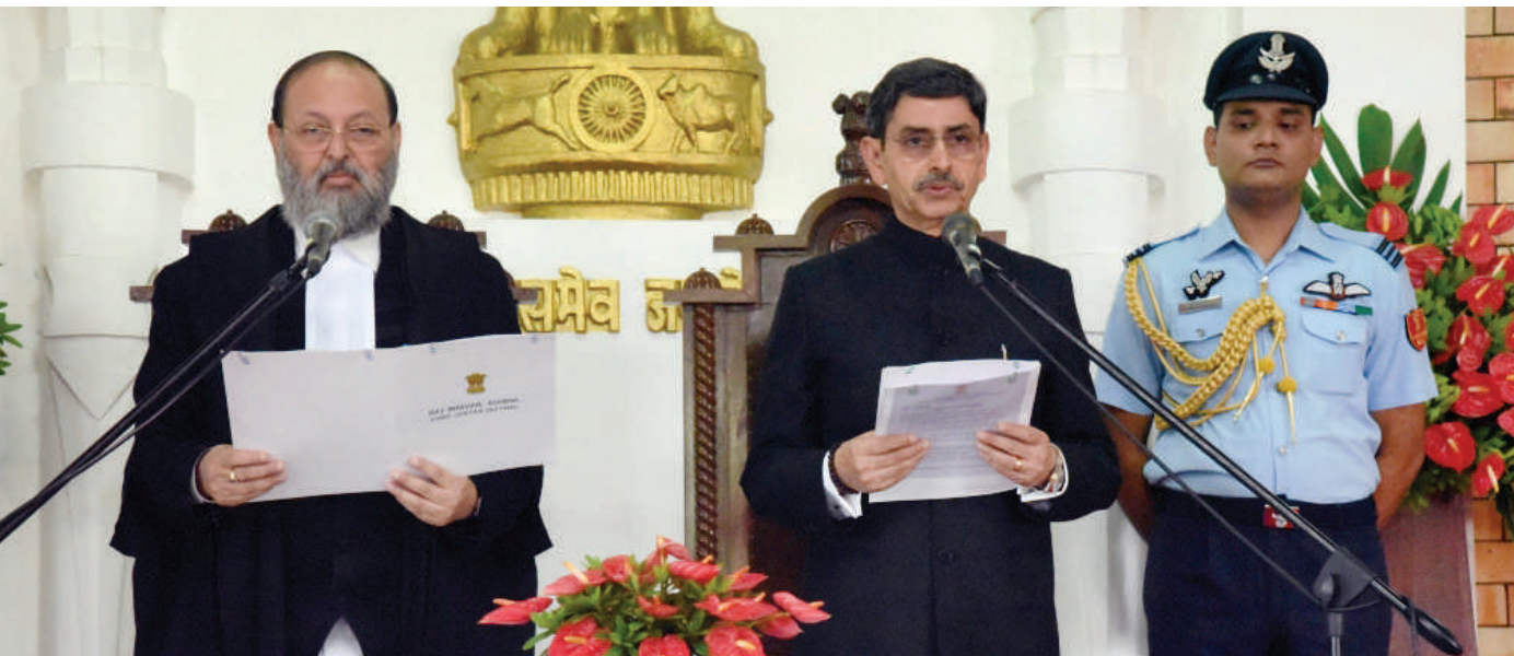
Chief Justice (Acting), Gauhati High Court, Arup Kumar Goswami administering the Oath of Office to R.N. Ravi as the 19th Governor of Nagaland at Durbar Hall, Raj Bhavan, Kohima on 1 st August 2019.