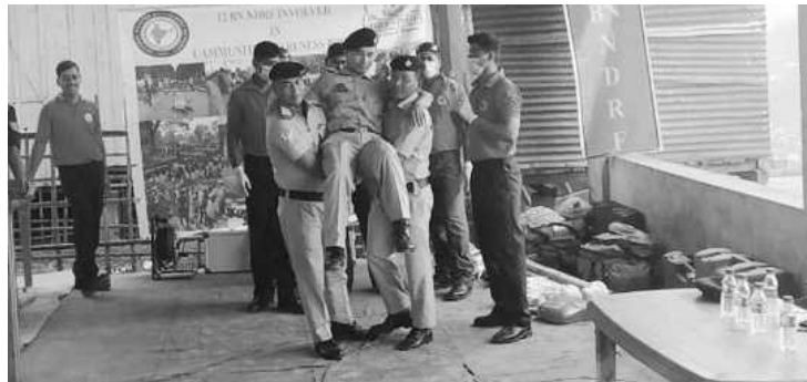
Familiarization Exercise on Disaster Management was held at Longleng from 26 th to 28 th August 2019.