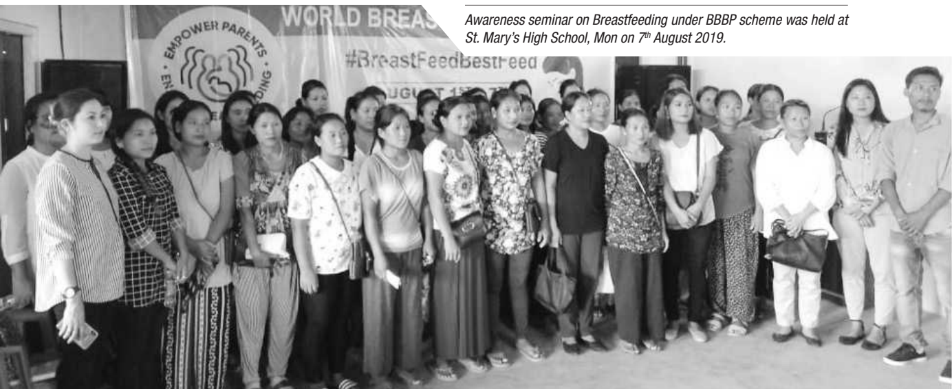
Awareness seminar on Breastfeeding under BBBP scheme was held at St. Mary's High School, Mon on 7 th August 2019.

Beti Bachao Beti Padhao scheme on the theme 'Breastfeed Best Feed' at St. Mary's High School on 7 th August 2019. The seminar was conducted as part