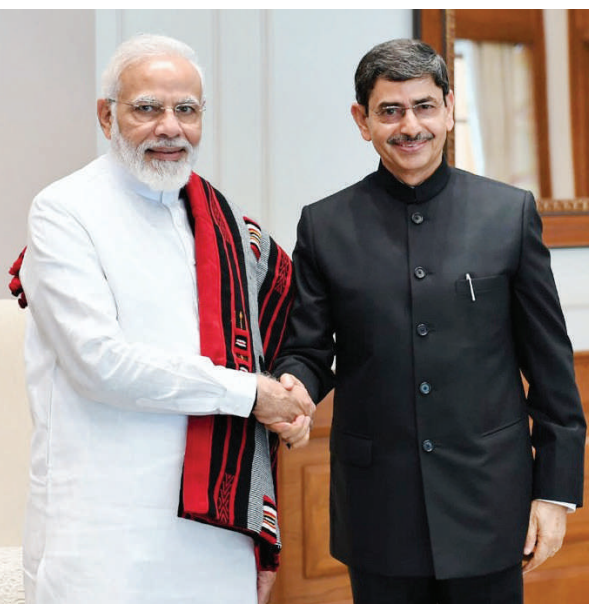
Governor of Nagaland, R.N. Ravi called on the Prime Minister of India, Narendra Modi at 7, Lok Kalyan Marg, New Delhi on 8 th August 2019.