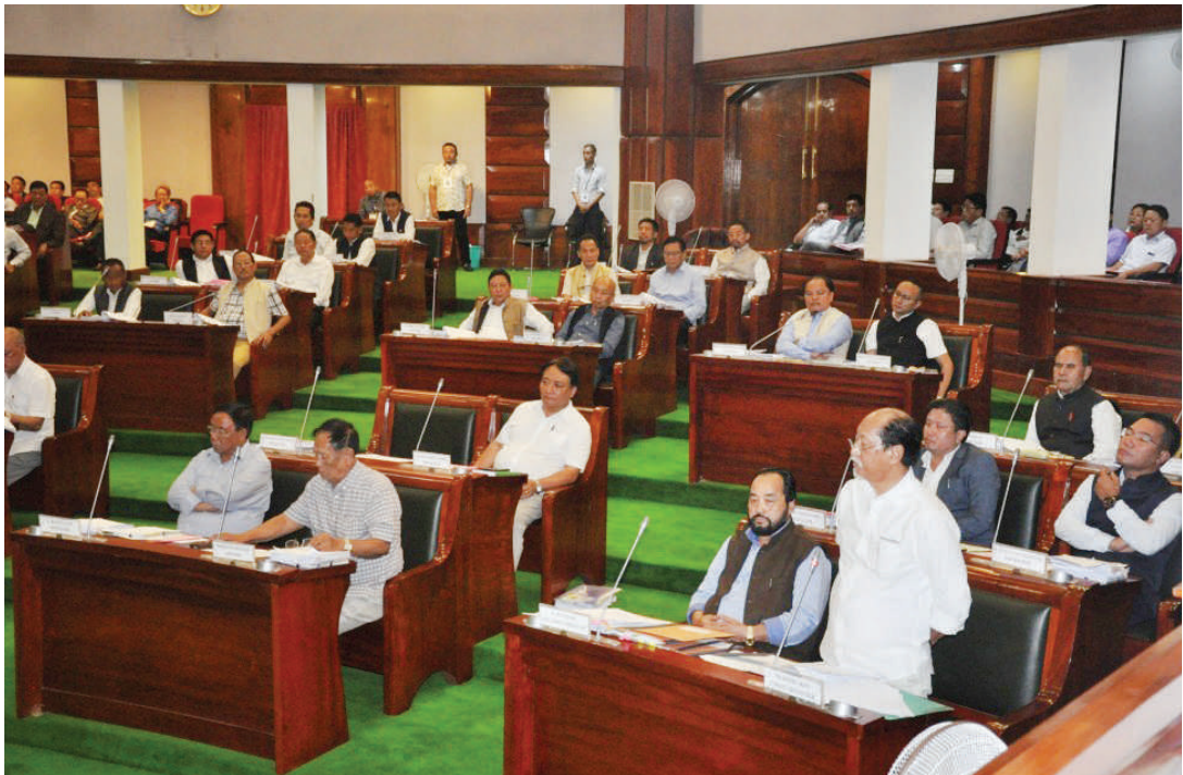
Chief Minister and the Leader of the House, Neiphiu Rio speaking during the Fourth Session of the Thirteenth Nagaland Legislative Assembly at NLA Secretariat, Kohima on 8 th August 2019.