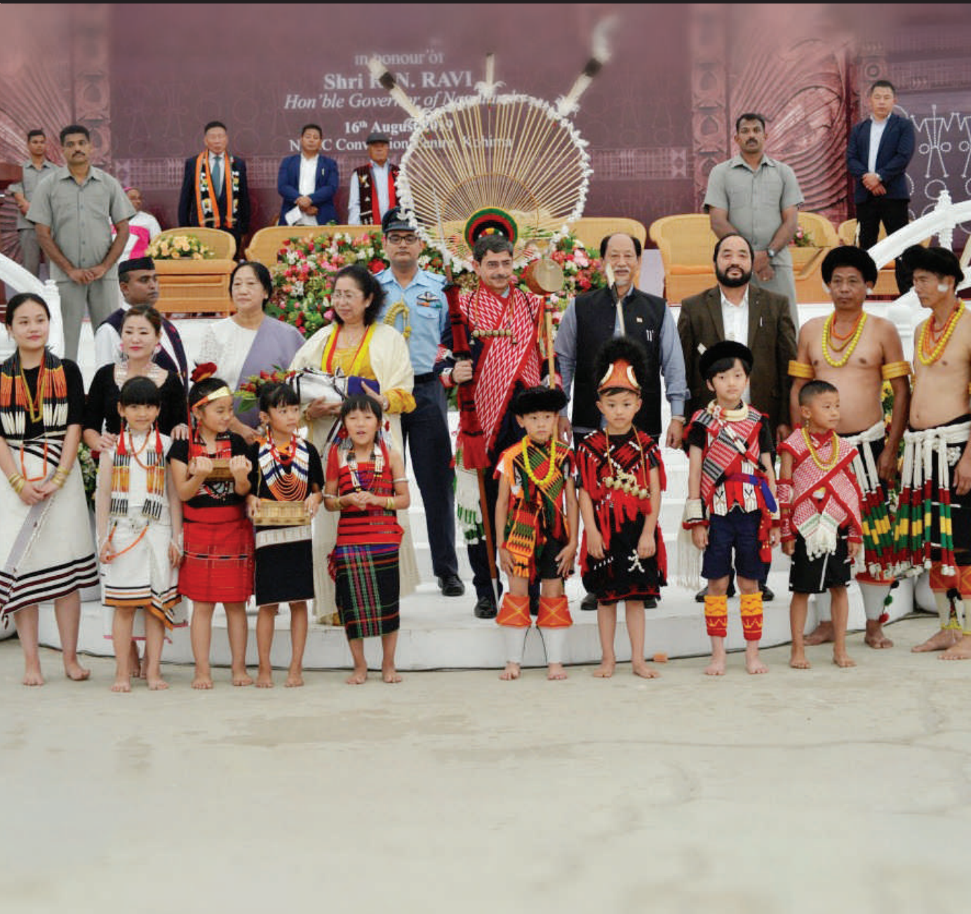
Governor, R. N. Ravi, Chief Minister, Neiphiu Rio, their lady wives and Deputy Chief Minister, Y. Patton during the civic reception honouring the new Governor of Nagaland, R.N. Ravi at NBCC Convention Centre, Kohima on 16 th August 2019.