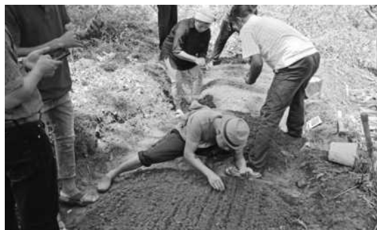
ATMA Longleng Block organized a demonstration programme on packaging practices of winter vegetables at PBCA, Mission Compound, Longleng on 27 th August 2019.