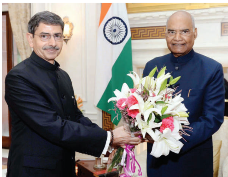
Governor of Nagaland, R.N. Ravi called on the President of India, Ram Nath Kovind at New Delhi on 6 th August 2019.