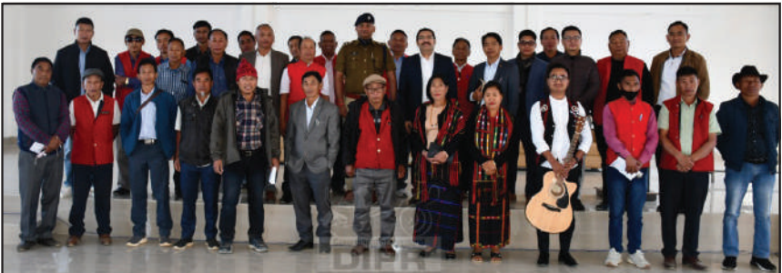
Systematic Voter Education and Electoral Participation campaign on clean electoral roll and clean election was held at General Zuheto Memorial Town Hall Satakha on 10 th December 2022.

Systematic Voter Education and Electoral Participation (SVEEP) campaign on clean electoral roll and clean election was held at General Zuheto Memorial Town Hall Satakha on 10 th December 2022. Along with the Deputy Commissioner and Superintendent of Police, GBs and Village Council Chairman, Colony GBs, and Colony Chairman of Suruhoto town, all unit officials of recognized political parties under 33 AC, various NGOs, and CSOs participated in the programme.