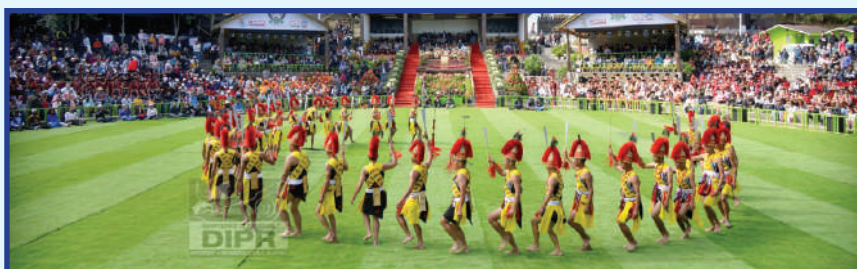
Pochury cultural troupe showcasing a folk dance during the Hornbill Festival, Kisama on 2 nd December 2022.