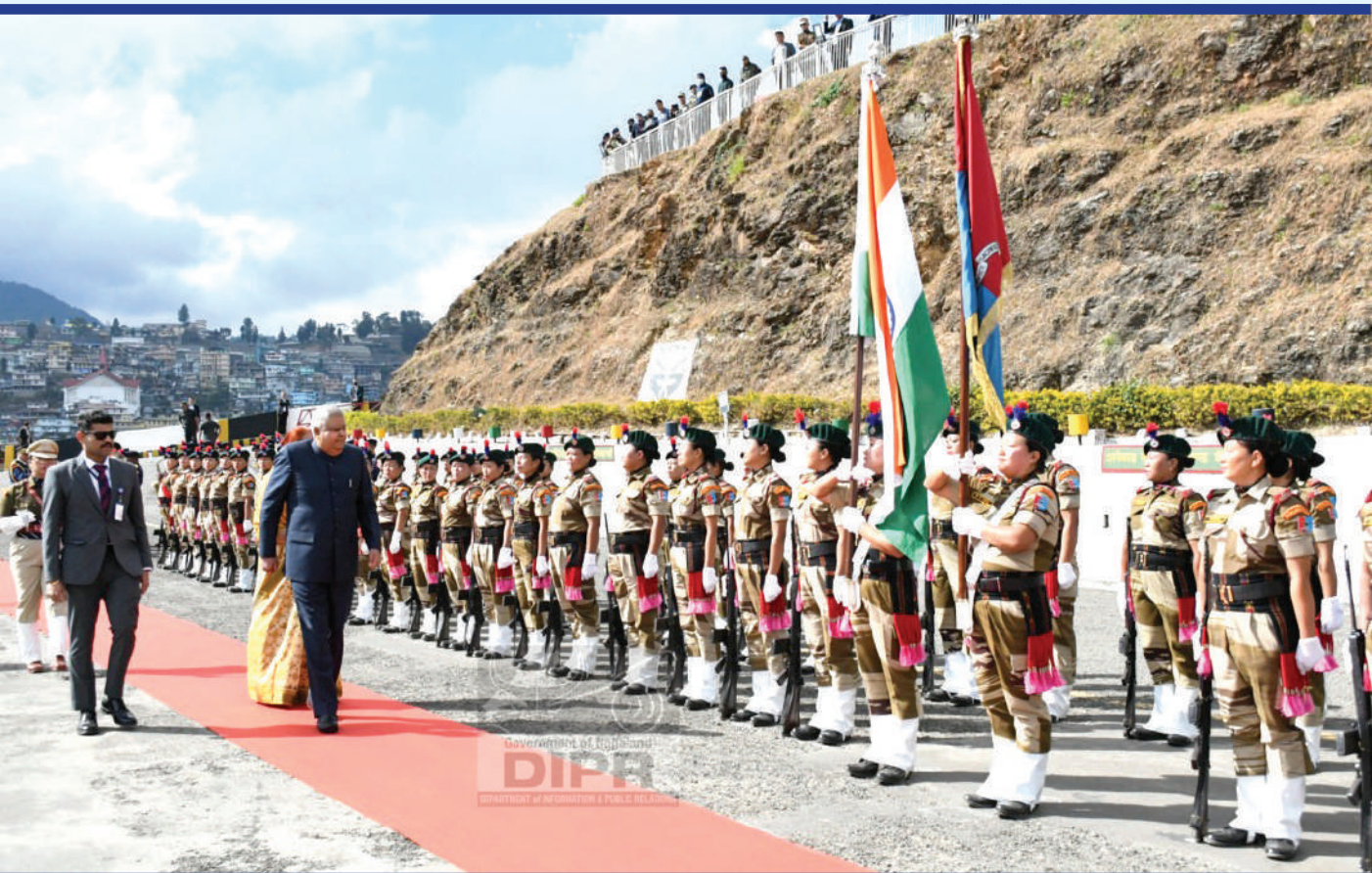
Vice-President of India, Jagdeep Dhankhar being accorded the Guard of Honour during his arrival at Assam Rifles Helipad, Kohima on 1 st December 2022.