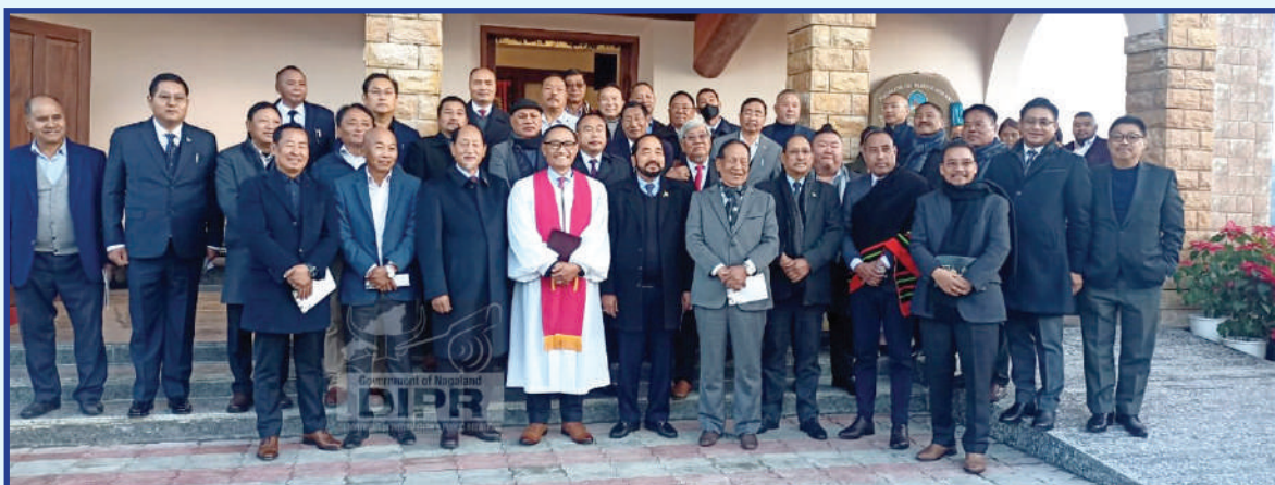
General Secretary, Nagaland Baptist Church Council, Rev. Zelhou Keyho with Chief Minister, Neiphiu Rio and Legislators during the inaugural of Nagaland Legislative Assembly (NLA) Chapel Hall at NLA Secretariat, Kohima on 11 th December 2022.