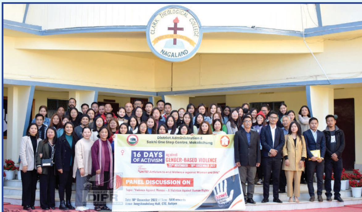
Participants during the culmination of 16-days of activism against gender-based violence under the theme 'Unite! Activism to end violence against women and girls' at Jongshinokdang Hall, CTC Aolichen, Mokokchung on 10 th December 2022.