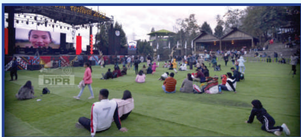
Viewers enjoying a film screened during the Film Fiesta, Open Air Cinema at Naga Heritage Village, Kisama on 2 nd December 2022.