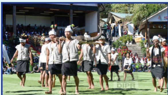
A group of Kuki men carrying the head of a Mithun while performing 'Savailhun,' which is a song and dance, referring to a grand reception of bountiful hunting during the cultural presentation at Naga Heritage Village, Kisama on 4 th Decemeber 2022.