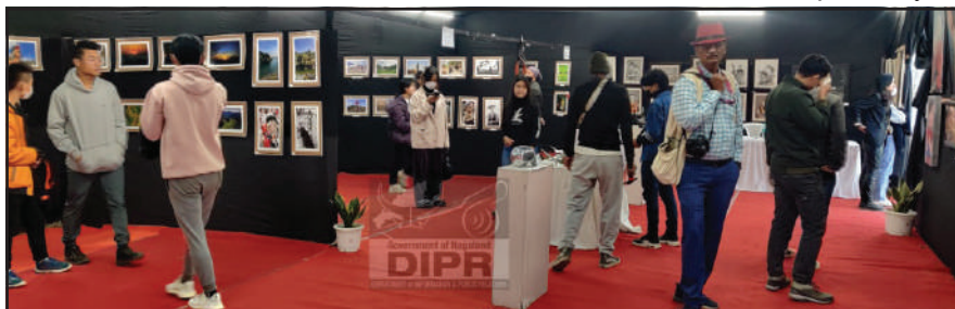
Visitors and tourists viewing the photos at the HIPFEST photo competition-cum-exhibition at Naga Heritage Village, Kisama on 4 th December 2022.

Portrait Enterprise with support from Directorate of Information & Public Relations and Tourism Department organized the Hornbill International Photo Fest (HIPFEST) under the theme, 'Colours of Nagaland' at WW II area, Kisama on 1 st December 2022.