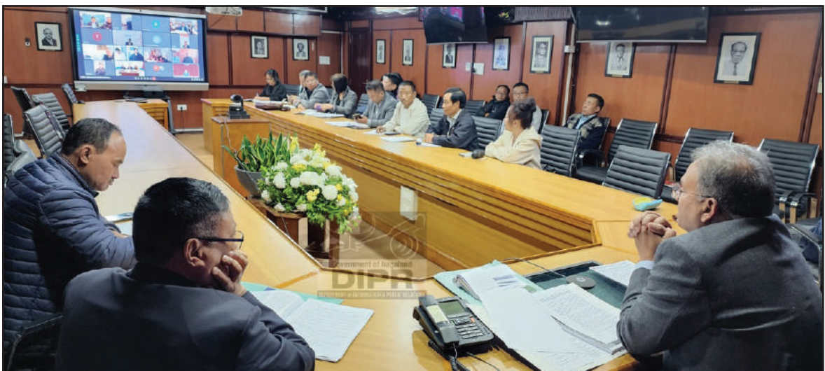
A review meeting of the implementation of the Chief Minister's Micro-Finance Initiative Scheme was held in the Conference Hall of the Chief Secretary on 8 th December 2022.