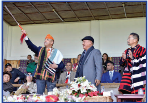
IGAR (North) Major General, Vikas Lakhera being felicitated during the cultural programme held at Naga Heritage Village, Kisama on 8 th December 2022.