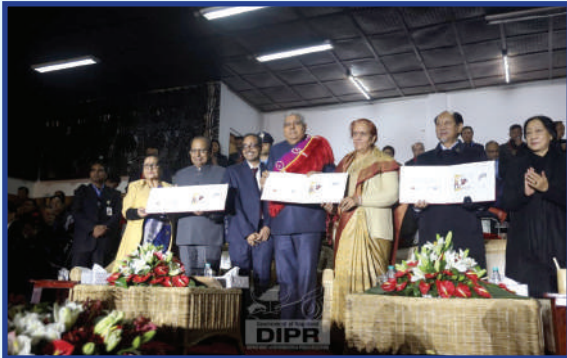
Vice-President of India, Jagdeep Dhankhar releasing the stamp commemorating the 23 rd Hornbill Festival at Naga Heritage Village, Kisama on 1 st December 2022.