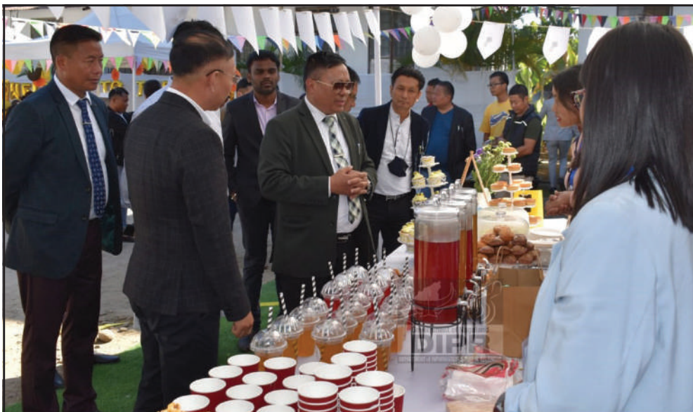
The 4 th Nagaland Honey Bee Day 2022 was held at NBHM, Multi-utility Centre 6 th Mile, Chümoukedima on 5 th December 2022.

The 4 th Nagaland Honey Bee Day 2022 was held on 5 th December, at NBHM, Multi-utility Centre 6 th Mile, Chümoukedima. The event was organized by Nagaland Beekeeping & Honey Mission.