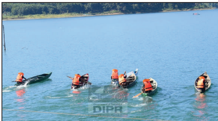
Participants during the 2 nd Canoe Sprint/Boat Race at Falcon Creek, Tsuza Eryu Doyang, Pangti village on 6 th December 2022.