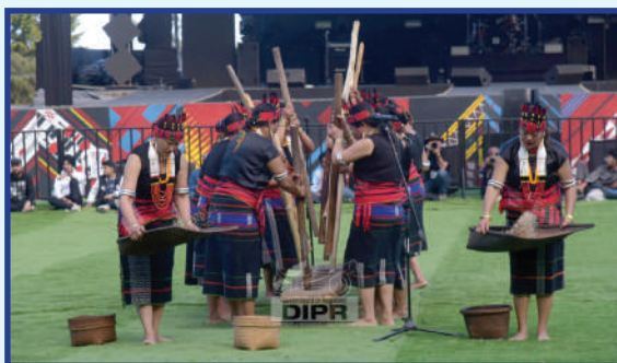
Lotha womenfolk performing during the cultural presentation at Naga Heritage Village, Kisama on 4 th December 2022.