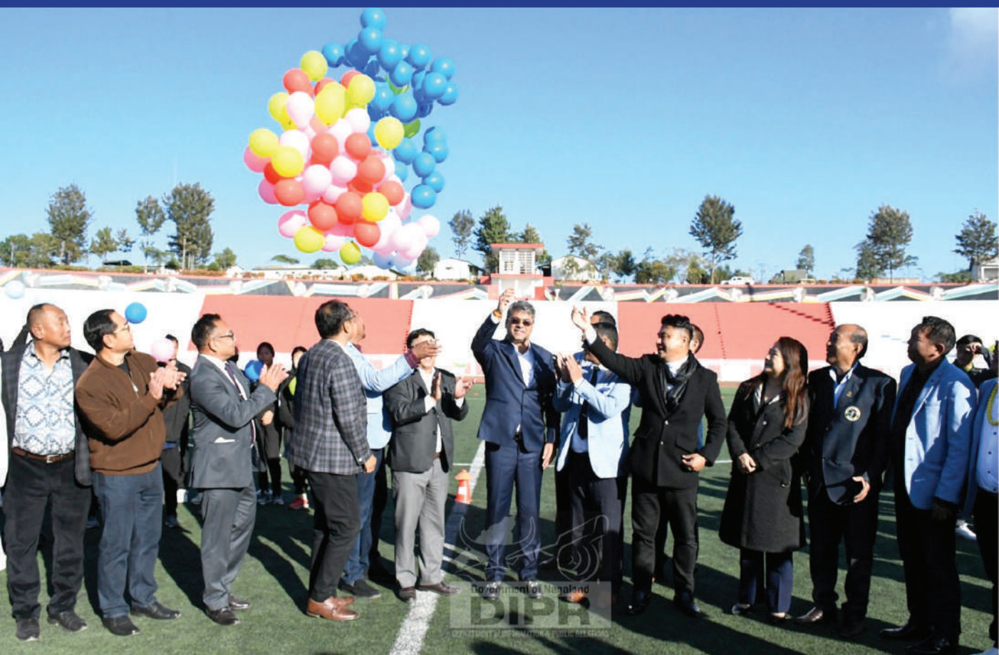
President, All India Football Federation, Kalyan Chaubey launching FIFA Football for Schools at Indira Gandhi Stadium, Kohima on 4 th December 2022.