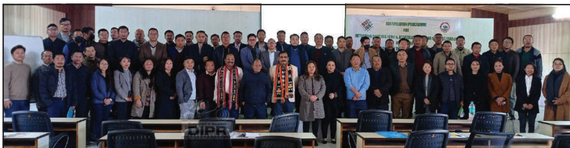
A four-day certification programme for Returning Officers and Assistant Returning Officers was held at the Administrative Training Institute, Kohima from 13 th to 16 th December 2022.

In view of the forthcoming General Election to Nagaland Legislative Assembly, 2023 a four-day Certification Programme for Returning Officers (ROs) & Assistant Returning Officers (AROs) of Nagaland in two simultaneous batches from 13 th