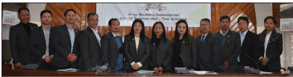
The newly elected members of the Nagaland Secretariat Service Association (NSSA) during the NSSA Triennial Conference at Secretariat Conference Hall on 13 th December 2022.