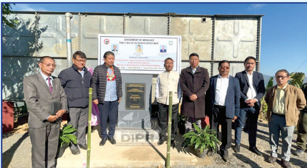
Minister, Public Health Engineering Department, Jacob Zhimomi inaugurated the water supply for Aboi and Longching Headquarters under Non-Lapsable Central Pool Resources project, Ministry of Development of North Eastern Region at Aboi, Mon on 8 th December 2022.