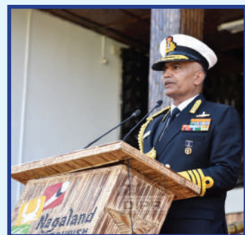
Chief of Naval Staff, Admiral R. Hari Kumar addressing the gathering of the cultural programme held at Naga Heritage Village, Kisama on 7 th December 2022.