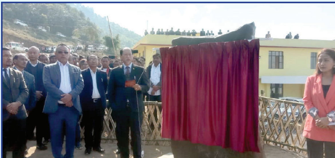
Chief Minister, Neiphiu Rio with Minister, Health & Family Welfare, S. Pangnyu Phom during the inauguration of Polytechnic Hukphang, Longleng on 17 th December 2022.