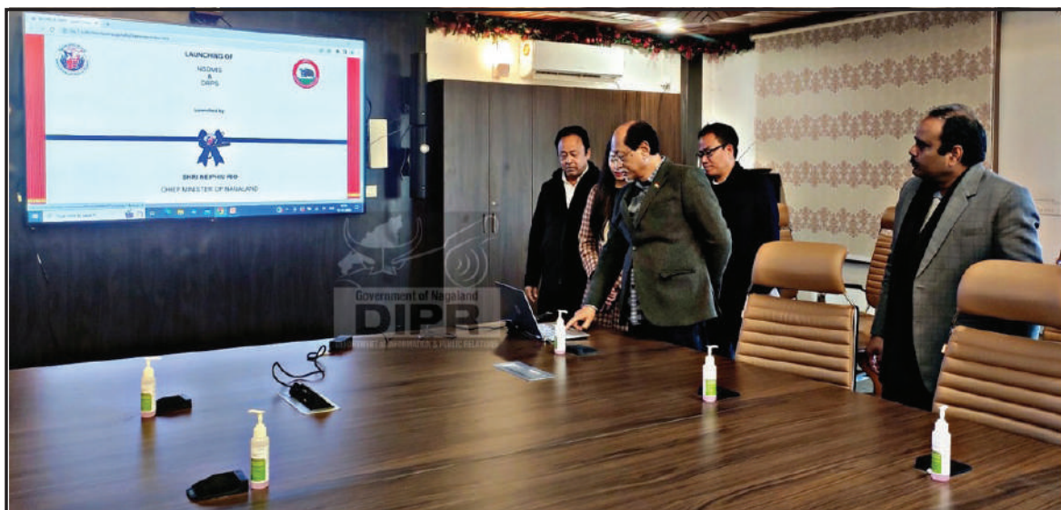
Chief Minister, Neiphiu Rio launched the Nagaland State Disaster Management Information System (NSDMIS) and Decentralized Relief Payout System (DRPS) at Chief Minister's Residential Complex, Kohima on 16 th December 2022.