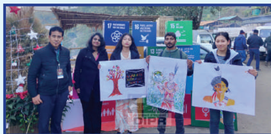
Winners of the SDG painting competition organized by the SDGCC Planning & Coordination Department at Kisama on 3 rd December 2022.