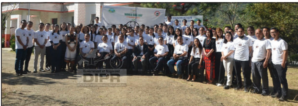
The Department of Soil & Water Conservation celebrated the World Soil Day at Training & Research Centre, Sechü- Zubza on 5 th December 2022.

The Department of Soil & Water Conservation celebrated the World Soil Day under the theme 'Soils, where food begins,' on 5 th December 2022 at Training & Research Centre, Sechü- Zubza. Secretary, Soil & Water Conservation, Geology & Mining, K. Libanthung Lotha, IAS graced the occasion as the special guest.