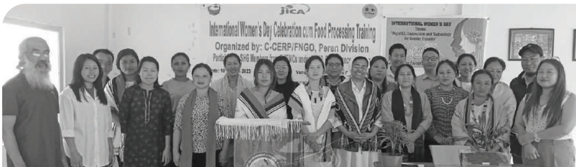
C-CERP organized Food Processing Training on Pickle Making for the Self Help Groups of 7 JFMCs, Batch-I and II, under Peren Division at Forest Resource Center, Jalukie on 10 th March 2023.

C-CERP organized a food processing training on pickle making for the Self Help Groups of 7 JFMCs, Batch - I and II, Nagaland Forest Management Project (NFMP) under Peren Division on 10 th March 2023 at Forest Resource Centre, Jalukie.