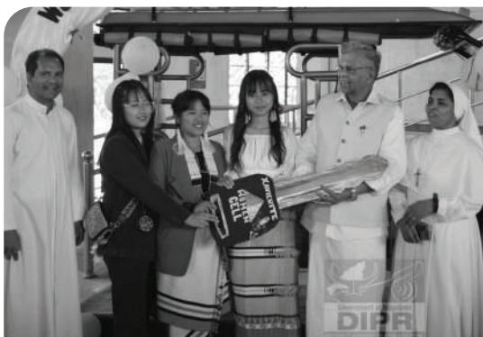
Governor of Nagaland, La. Ganesan launching the E-Rickshaw (Women-Empowerment Initiative) during the Yuva Utsav celebration held at Xavierite Auditorium, St. Xavier College, Jalukie Town on 22 nd March 2022.

Awardees from the President of India, NCC National Campers, and medal winners of Nagaland Olympic, 2022. He also added that he was delighted to know that many of the students have found places in the State team of Cricket, Archery, Football, Athletics, etc. and stated that this shows the college is not only confining itself to the pursuit of academic excellence but in other co-curricular activities as well.