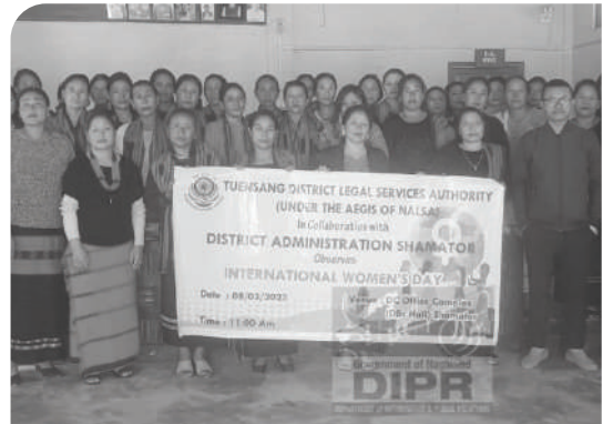
Tuensang District Legal Service Authority in collaboration with District Administration, Shamator observed International Women's Day at DB Hall, DC's Office complex, Shamator on 8 th March 2023.

Tuensang District Legal Service Authority (under the aegis of NALSA) in collaboration with District Administration, Shamator observed International Women's Day at DB Hall, DC's Office complex, Shamator on 8 th March 2023. Judicial Magistrate, First Class-cum-Secretary,