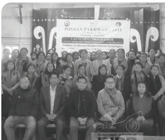
Poshan Pakhwada 2023 was launched by DC Tuensang, Nokchasashi at CKS Hall, Tuensang on 21 st March 2023.

by the School Education Department and Social Welfare Department at Anganwadi Centres, nutritional food are provided for the health of the children. He further said Poshan Pakhwada is a fourteen-day long programme where the Social Welfare Department will be conducting different activities at the district, block and village level. He called upon all the convergent departments and the community leaders to give their cooperation for the successful implementation of the programme at the district. The DC also administered the Poshan Pledge and officially launched Poshan Pakhwada 2023.