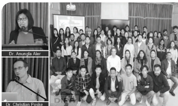
A two-day international workshop on "Ethnographic Fieldwork and Field Recording" was held at Kohima Science College, Jotsoma on 29 th & 30 th March 2023.

The workshop was attended by students, research scholars, and faculties from different colleges and universities across India.