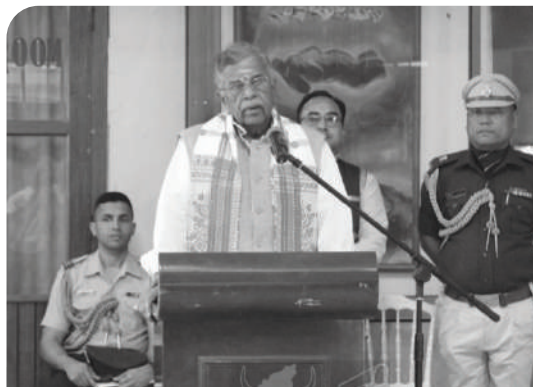
Governor & Chairman, NEZCC, La. Ganesan paid his maiden visit to NEZCC Dimapur on 9 th March 2023.