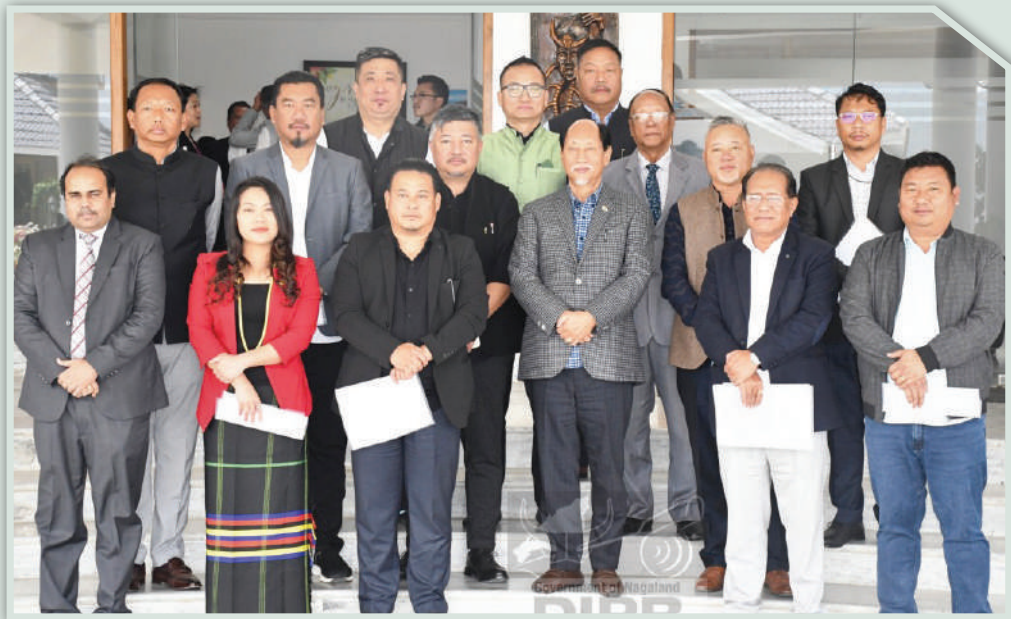
Chief Minister, Neiphiu Rio and senior government officials with the newly appointed Chairmen/ Advisors at the Chief Minister's Office, Kohima on 31 st March 2023.