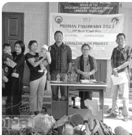
The Department of Social Welfare Longleng, under the celebration of Poshan Pakhwada organised a cooking and baby show competition, under ICDS project, at CDPO Office Longleng on 29 th March 2023.

Speaking at the programme, Sangtam shared on proper nutrition and emphasized on the importance of organic food which are locally available for consumption, and told the gathering to give importance on organic crops available locally.