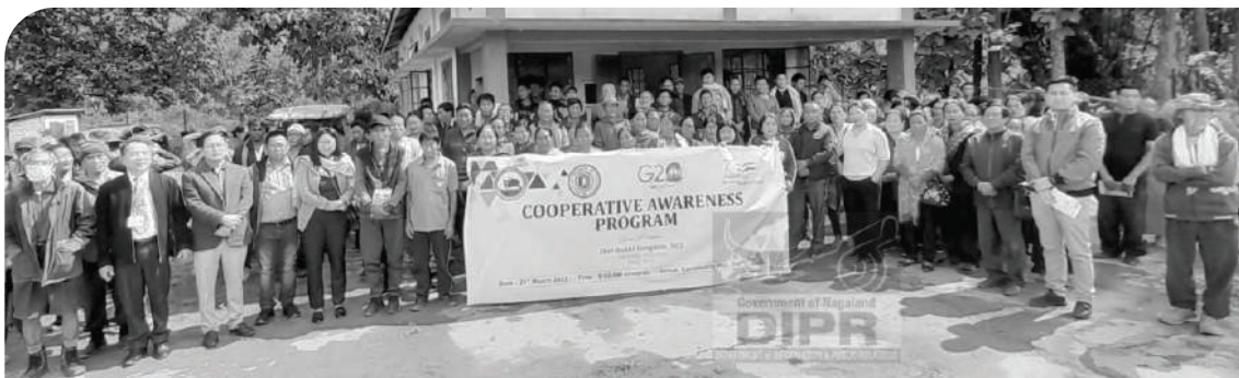
Resource persons with participants during the Cooperative Societies Awareness programme held at the Community Hall, Baghty town, Wokha on 21 st March 2023.

The Cooperative Training Centre Medziphema, Nagaland, Department of Cooperation in collaboration with National Cooperative Union of India (NCUI) and ARCS Office Wokha, held a cooperative awareness programme at the Community Hall, Baghty town on 21 st March 2023.