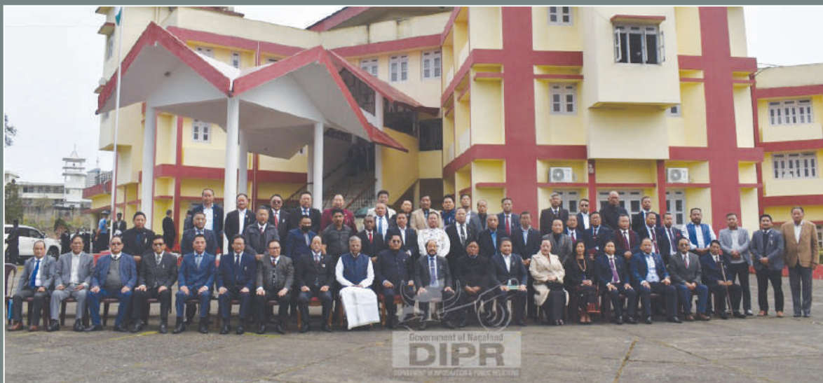
Governor of Nagaland, La. Ganesan with the Legislators of the 14 th Nagaland Legislative Assembly (NLA) at NLA Secretariat, Kohima on 21 st March 2023.