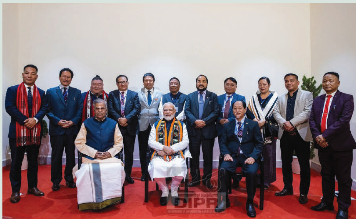
Prime Minister of India, Narendra Modi with the Governor of Nagaland, La. Ganesan and the newly sworn-in Chief Minister of Nagaland, Neiphiu Rio, Deputy Chief Ministers, and the Cabinet Ministers after the swearing-in ceremony held at the Capital Cultural Hall, Kohima on 7 th March 2023.