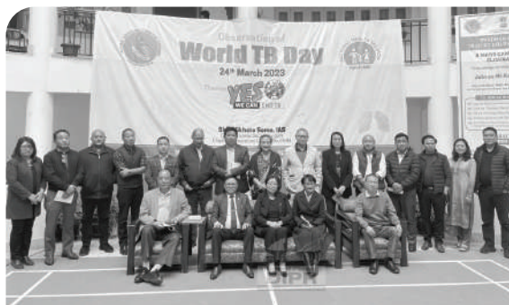
World TB Day was observed at the Directorate of Health & Family Welfare Kohima on 24 th March 2023.