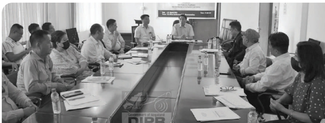
DISHA Chairperson and MP (Lok Sabha), Tokheho Yeptthomi, addressing the departments' officials at the coordination meeting at DC Conference Hall, Chumoukedima on 31 st March 2023.

At the meeting, DISHA Chairperson and Member of Parliament (Lok Sabha), Tokheho Yeptthomi highlighted that Central Government intends to make all the Centrally Sponsored Schemes (CSS) transparent. He said that in the past, many CSS all over the States could not be completed as per the schedule and also failed to give the details of work distribution for which the policy has changed, that any department wherever sanctioned CSS project