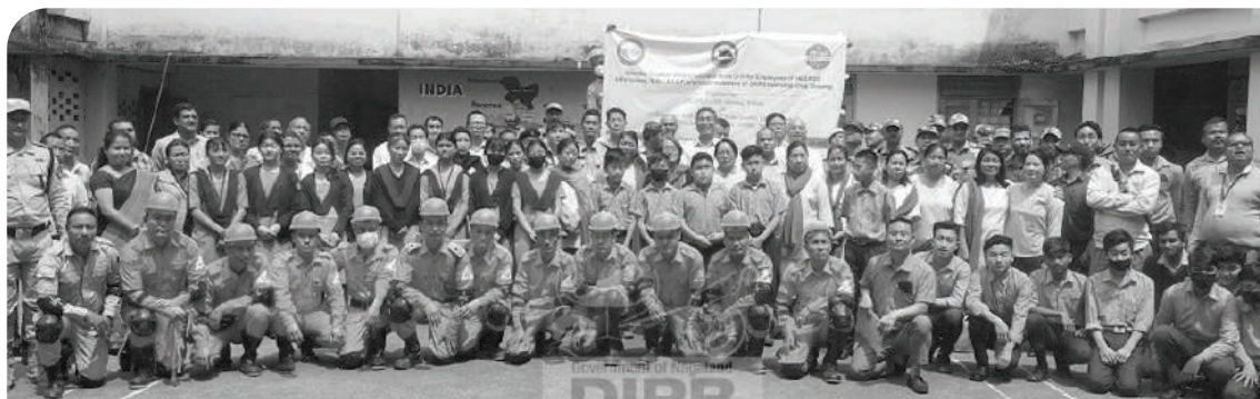
A one-day disaster awareness and mock drill to enhance emergency preparedness at Doyang Hydro Power Station was held at NEEPCO Wokha on 28 th March 2023.

The mock drill was organized by NEEPCO, Doyang in collaboration with Department of Home Guards, Civil Defence & State Disaster Response Force (SDRF), Wokha. The drill simulated a real-life emergency situation to test the readiness and response of the employees, school community and local residents. The drill involved various scenarios, including fire, earthquake, etc.