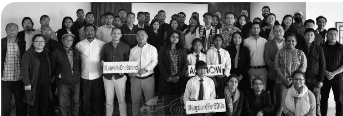
The state-level workshop for technology innovations, TECHNOVATION Nagaland 2023 was held at Hotel Vivor Kohima on 14 th March 2023.

The state-level workshop for technology innovations, Technovation Nagaland 2023 was held at Hotel Vivor Kohima on 14 th March 2023. The host for the event was AIC (Atal Incubation Centre) SELCO Foundation and SDGCC, Planning & Transformation Department.