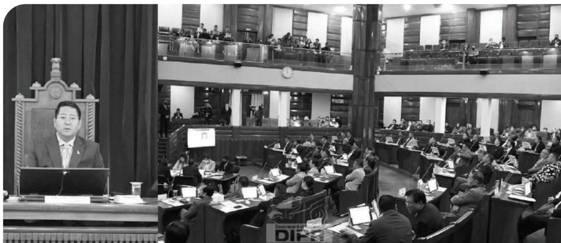
The first session of the 14 th Nagaland Legislative Assembly began at the NLA Secretariat, Kohima on 20 th March 2023.

The first session of the Fourteenth Nagaland Legislative Assembly (NLA) began on 20 th March 2023 at the NLA Secretariat, Kohima.