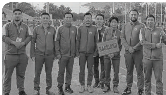
Forest Department, Nagaland participated at the 26 th All India Forest Sports Meet held at Panchkula, Haryana from 10 th -14 th March 2023.

The event features a wide range of athletic competitions including track and field events, archery, rifle shooting, and various other conventional games and sports. A contingent of 10 persons represented Nagaland and actively participated in events like badminton, table tennis, carom, sprint, chess, powerlifting, rifle shooting, and quiz competition.