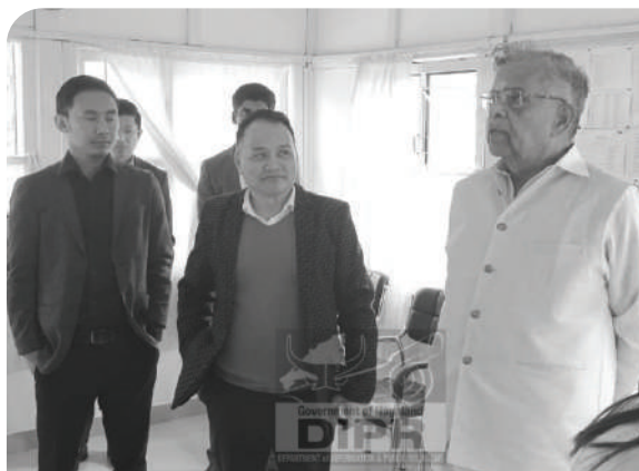
Governor, La. Ganesan visited health wellness centre at Chunlikha on 28 th March 2023 and interacted with the doctors and staff.

The Governor said that the State has come a long way since statehood in terms of education, health, road connectivity, telecommunication, standard of living, etc. but it still has a long way to go before catching up with other states of