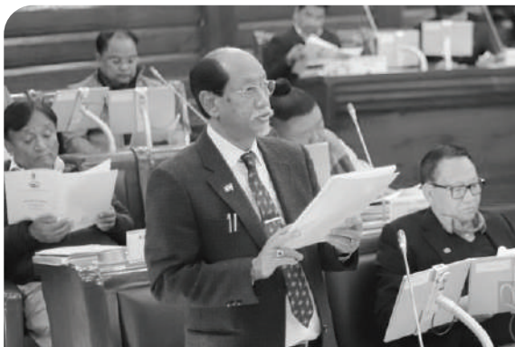
Chief Minister and Minister in-charge of Finance, Neiphiu Rio presenting the Budget for 2023-2024 at the NLA Secretariat, Kohima on 27 th March 2023.

Chief Minister of Nagaland, Neiphiu Rio who is also the Minister in-charge of Finance, presented the first budget of the 14 th Legislative Assembly for the year 2023-2024 on the floor of the house of the Nagaland Legislative Assembly (NLA) on 27 th March 2023. Presenting the budget, Rio said the State Government aims to take Nagaland towards 'A State of Excellence,' and that the citizens must strive to excel in their chosen fields and careers and in doing so, push 'Brand Nagaland' and popularize 'Naga soft power.'