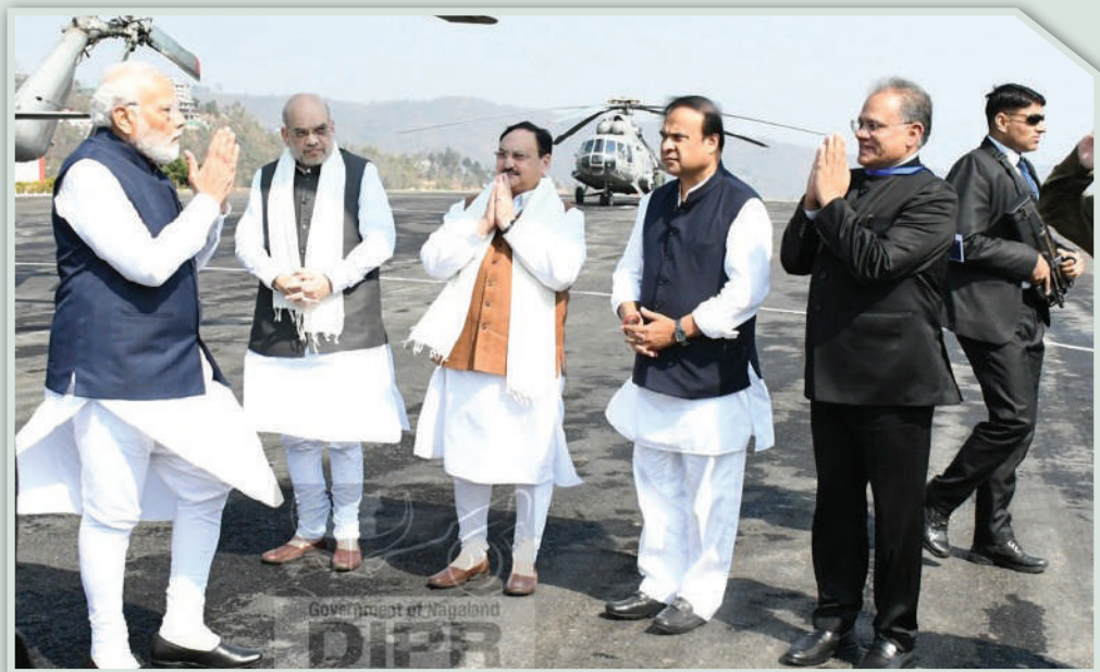
Prime Minister of India, Narendra Modi arriving at the Assam Rifles Helipad, Kohima on 7 th March 2023.