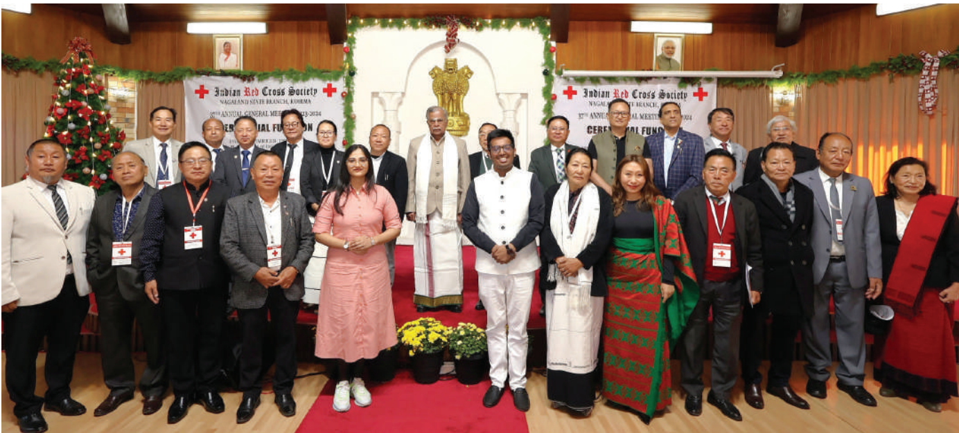
Governor, La Ganesan along with officials during the ceremonial function of the 37 th Annual General Meeting of the Indian Red Cross Society Nagaland State Branch held at Dr. Imkongliba Ao Hall, Raj Bhavan, Kohima on 27 th November 2024.