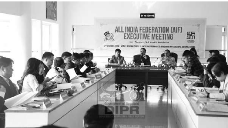
Civil service officers from across the north eastern states gathered for the AIF Executive Meeting at RCEMPA, Jotsoma, Kohima, on 12 th November 2024.

The North East Regional Conference, organized by the All India Federation of State Civil Administrative Service Associations, was inaugurated on 12 th November 2024 at the Regional Centre of Excellence for Music & Performing Arts (RCEMPA) in Jotsoma, Kohima. Hosted by the Nagaland Civil Service Association (NCSA), the event brought together civil service officers from across the northeastern states, marking a significant milestone in regional collaboration and shared governance.