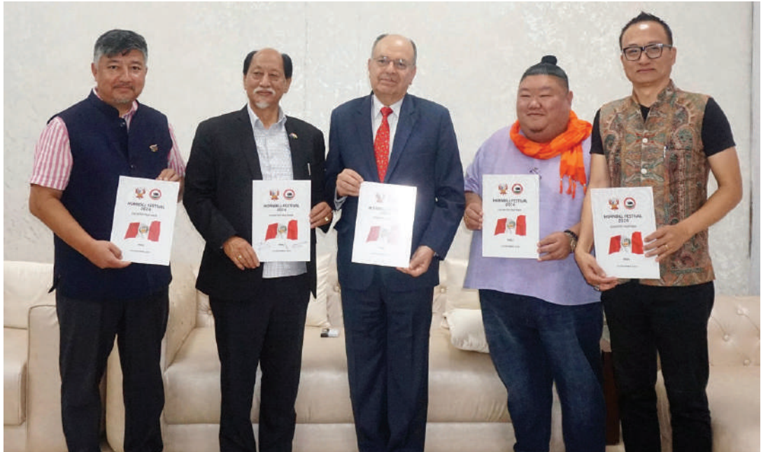
Chief Minister, Neiphiu Rio with Ambassador of Peru to India, Javier Manuel Paulinich Velarde and other dignitaries at the announcement of Peru as a partner country for the 25 th Edition of the Hornbill Festival at New Delhi on 20 th November 2024.