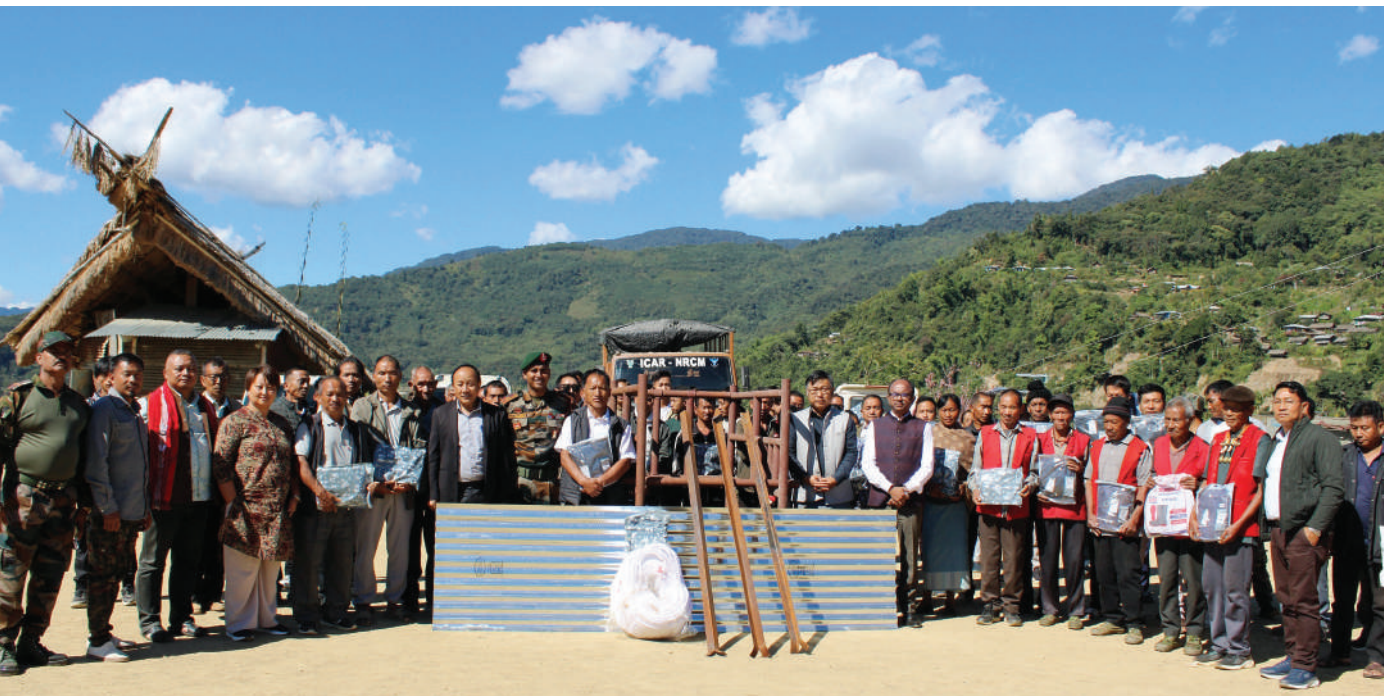
Deputy Commissioner, Noklak, Arikumba with officials and participants during the awareness and training programme on semi-intensive Mithun farming, held at Noklak village on 12 th November 2024.