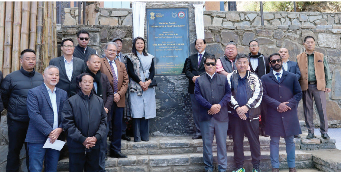
Chief Minister, Neiphiu Rio along with his colleagues after the inauguration of the Marketing Complex of Handloom & Craft Pavilion at Kisama on 26 th November 2024.