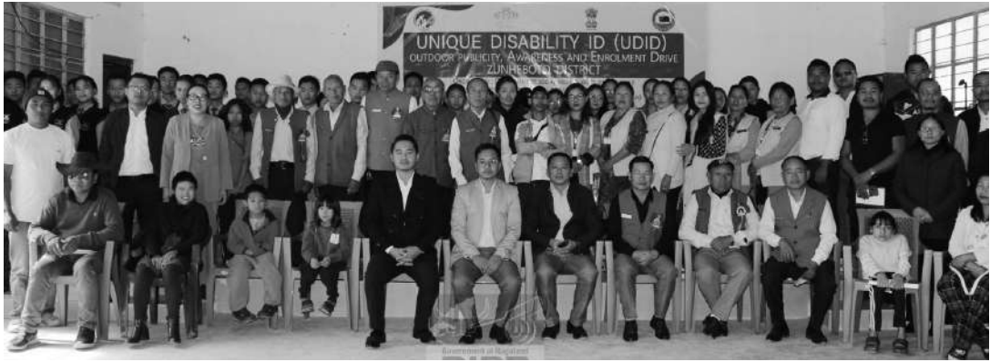
Officials and beneficiaries at the UDID Awareness & Enrolment Drive conducted in Zunheboto district on 9 th November 2024.

services meant for persons with disabilities.