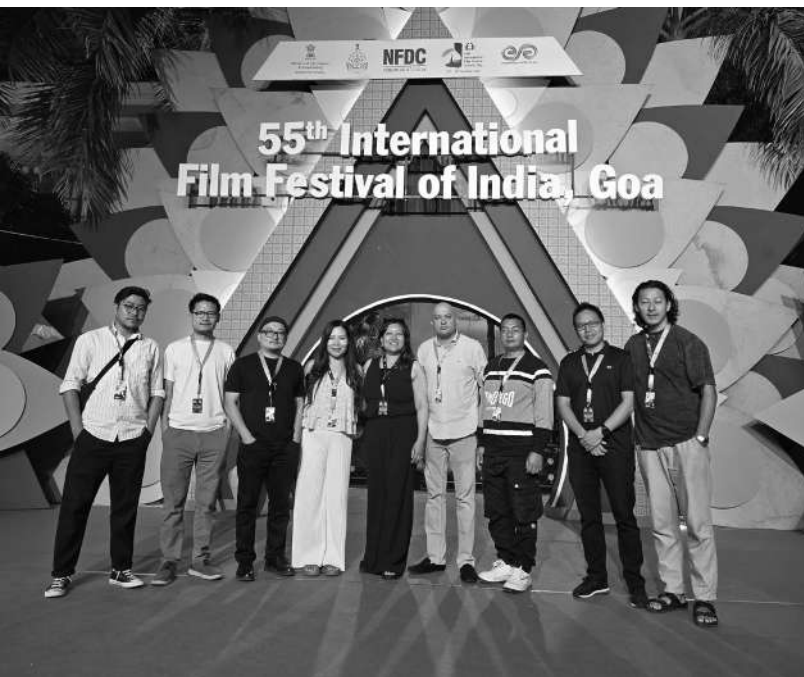
A 10-member team from the State participated in the 55 th IFFI held at Panaji, Goa from 20 th to 28 th November 2024.

IFFI is the only film festival in South Asia that is accredited by International Federation of Film Producers' Associations (FIAPF) of the 44 th international festivals in the Competitive Feature Films Category. Since its inception in 1952, IFFI has been curating spectacular films from all over the world. Its goal is to provide a single platform for ambitious filmmakers, cineastes, and industry professionals to have access to excellent cinema from across the world. Since 2004, IFFI has moved to its permanent venue at Goa, where it is jointly organized each year by National Film Development Corporation (NFDC), Ministry of