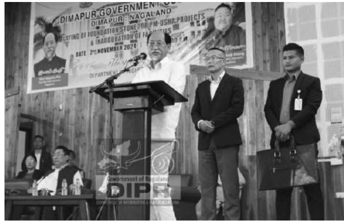
Chief Minister, Neiphiu Rio speaking during the laying of foundation stone programme for PM-USHA Projects and inauguration of various facilities at Dimapur Government College on 2 nd November 2024.

Guest of honour, Temjen Imna Along, Minister of Higher Education and Tourism in his short speech, applauded the DGC, its principal and teaching staff, and asserted that