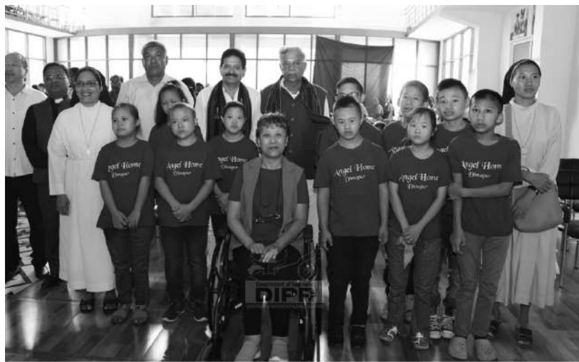
Nagaland Governor, La Ganesan, Commissioner for PwDs, Diethono Nakhro and others during the Inclusive India, Magic Show for Social Inclusion of PwDs held at Chumoukedima, on 2 nd November 2024.

The Governor further said that this campaign of the Different Art Centre Kerala, under the inspiring leadership of Gopinath Muthukad, an extraordinary magician and visionary, powerfully communicates the essence of social inclusion through the mesmerizing language of magic and that for some years now, he has brilliantly harnessed