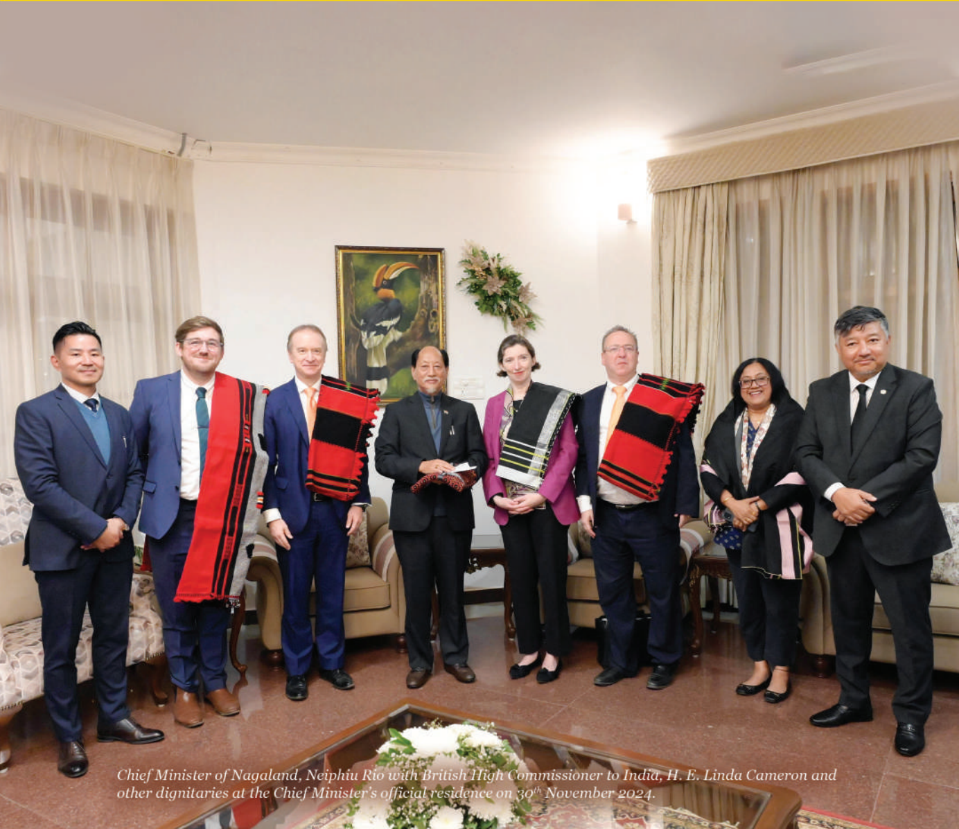
Chief Minister of Nagaland, Neiphiu Rio with British High Commissioner to India, H. E. Linda Cameron and other dignitaries at the Chief Minister's official residence on 30 th November 2024.