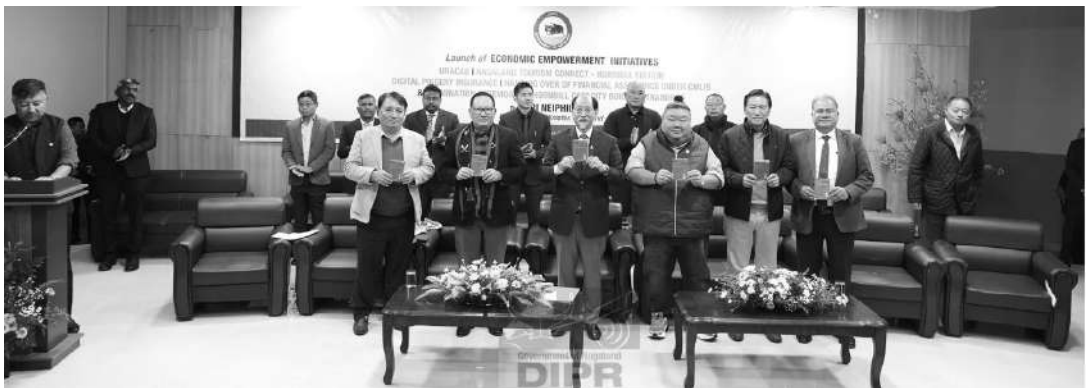
Chief Minister, Neiphui Rio along with his colleagues and other officials at the launch of the Tourism Directory Booklet at IDAN, Capital Convention Centre, Kohima on 27 th November 2024.

The CM applauded the local artisans, workers and everyone involved in it, and who has been working day and night to complete