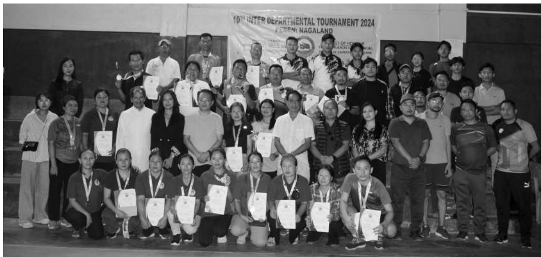
Officials and the winning team of the 10 th Peren Inter-Departmental Tournament 2024 which was held at Indoor Stadium, Jalukie from 7 th to 9 th November 2024.