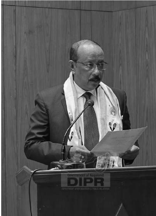
Judge, Gauhati High Court, Kohima Bench, Justice Partivjyoti Saikia speaking during a programme on Constitution Day organized by NSLSA at Kohima on 26 th November 2024.

The Nagaland State Legal Services Authority (NSLSA) organised a programme on Constitution Day at Hotel Japfü, Kohima on 26 th November 2024.