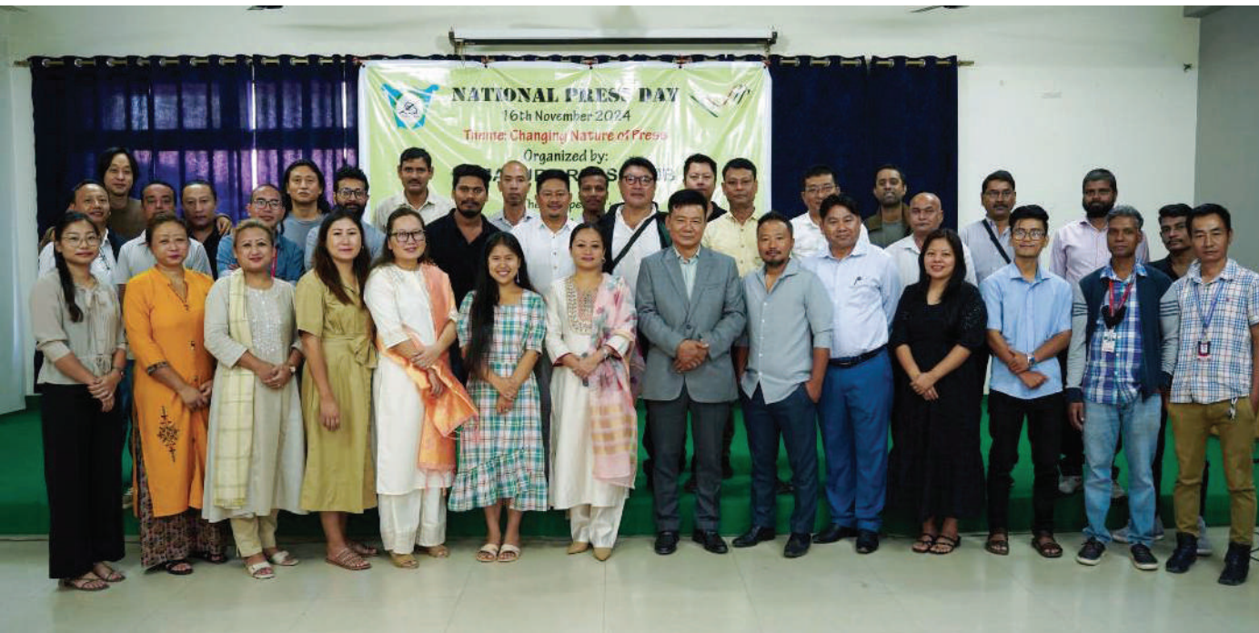
Media fraternity of Dimapur during the National Press Day programme, organised by the Dimapur Press Club, celebrated at DBDIL Hall, Don Bosco School, Dimapur on 16 th November 2024.