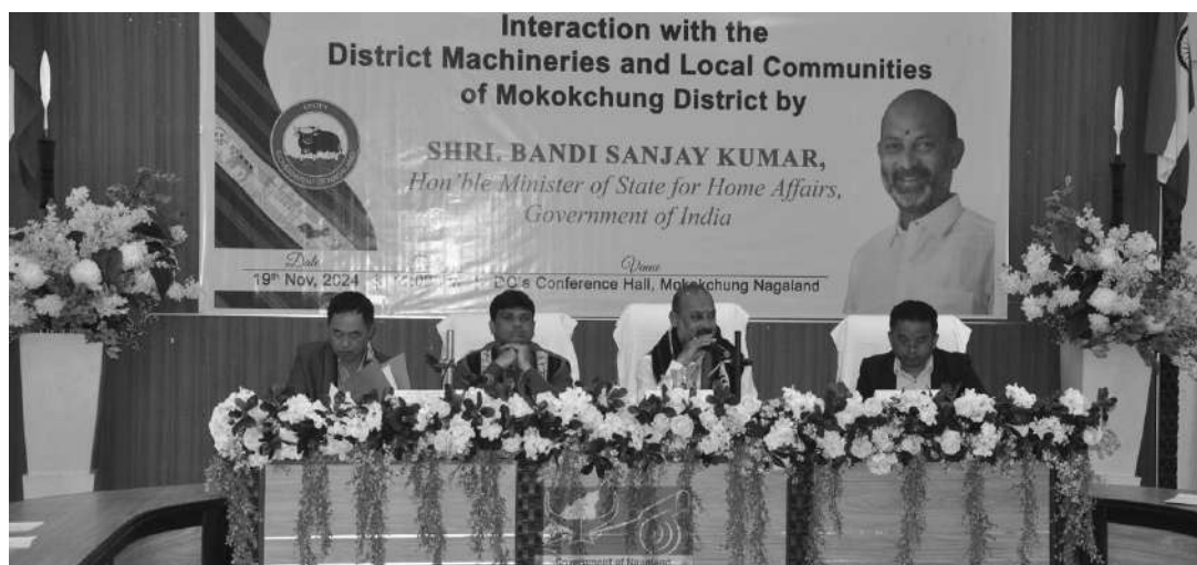
Union Minister for Home Affairs, Bandi Sanjay Kumar addressing the interactive session with District Machinery and Local Communities during his visit to Mokokchung on 19 th November 2024.