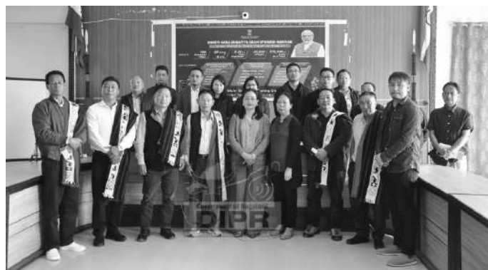
Government officials, Village Council Members from Khensa, Ungma and Mokokchung villages during the launching programme of DA-JGUA at DC's Office, Mokokchung on 15 th November 2024.

The Dharti Aaba Janjatiya Gram Utkarsh Abhiyan (DA-JGUA) was initiated at the ADC's Office complex in Mangkolemba on 16 th of November 2024. The launch of the campaign was overseen by Hotolu Sema, the SDO (C) alongside officials from various departments, Town Councillors, Dobashis, GBs, and representatives from different organizations. Nagaland has been chosen as one of the 30 states and Union Territories to carry out this initiative, benefiting 608 villages within the State.