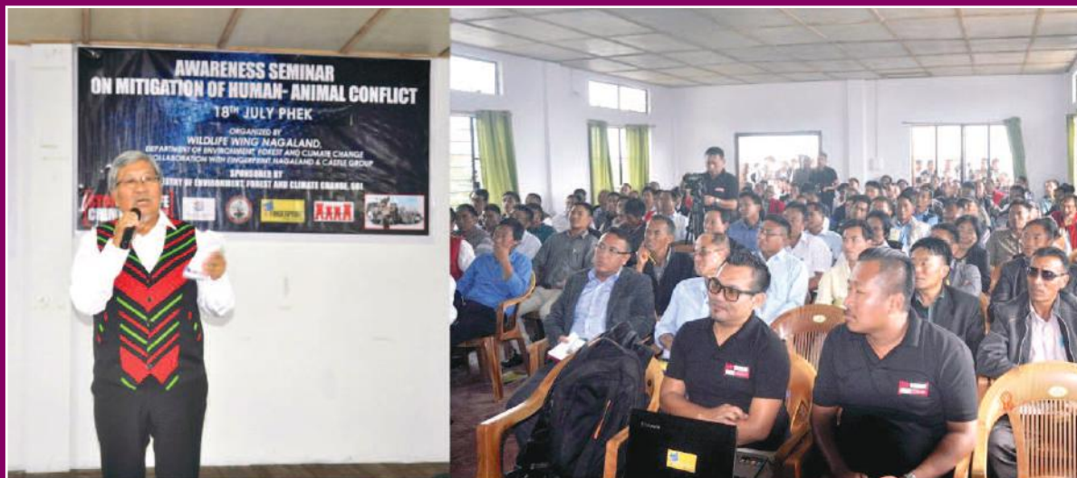
Minister for Environment, Forest & Climate Change, Nicky Kire addressing the gathering during awareness campaign on Human-Animal Conflict Mitigation at Phek on 18th July 2016.