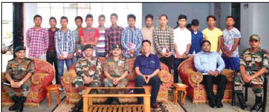
DC, Peren, Zarenthung Ezung with DIG, HQ 6 Sect AR, Brig Brijesh Dhiman and the 14 Naga successful youths from Peren during their felicitation programme.

Felicitation ceremony of all the successful youths was organized at New DC Complex, Peren, which was attended by the