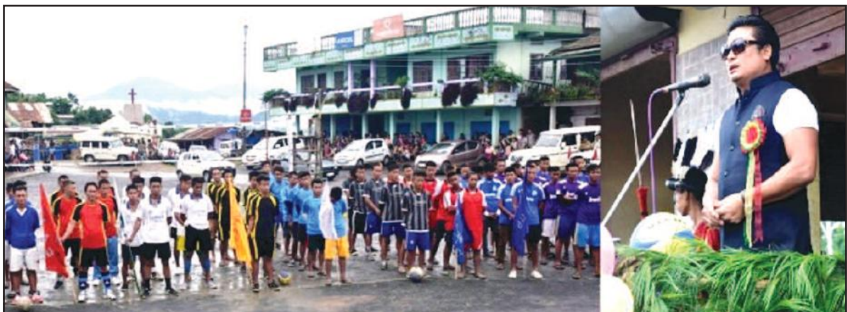
Parliamentary Secretary for IPR, Kekhaho Assumi addressing the players/people during the inaugural function of the 30th Tuluni Volleyball Tournament at V.K. Town under Zunheboto district on 4th July 2016.

In the inaugural match defending champion Dolphin 'A' defeated Sasta Sports Association (SSA) in straight set.