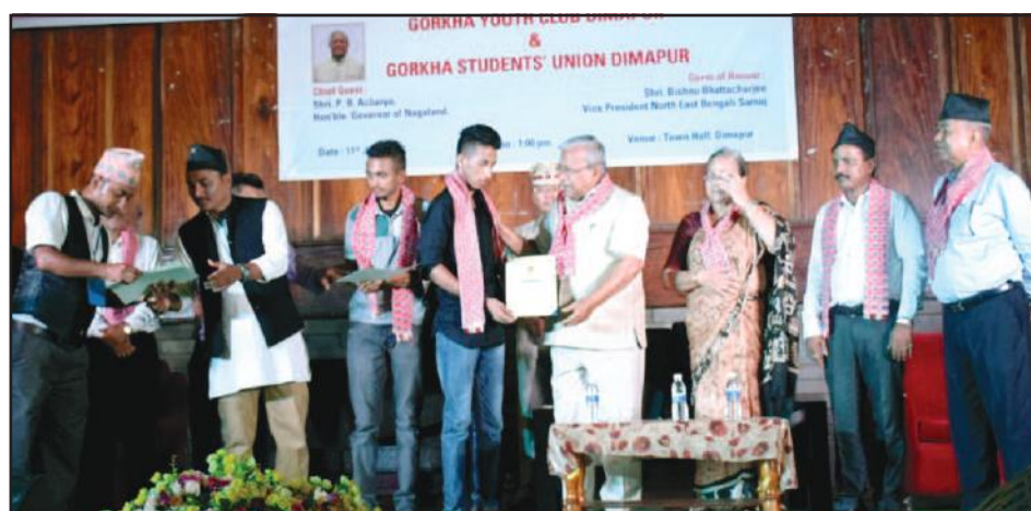
Governor felicitating meritorious students from Gorkha community during Bhanu Jayanti celebration at Dimapur on 11th July 2016.

Governor also stressed on importance of skill development. He said that the people of North East are second to none and are known for its rich cultural traditions. He however felt the need to build image in other fields also. Governor called on the gathering not to have the notion that only people in metro cities can progress. He also reminded