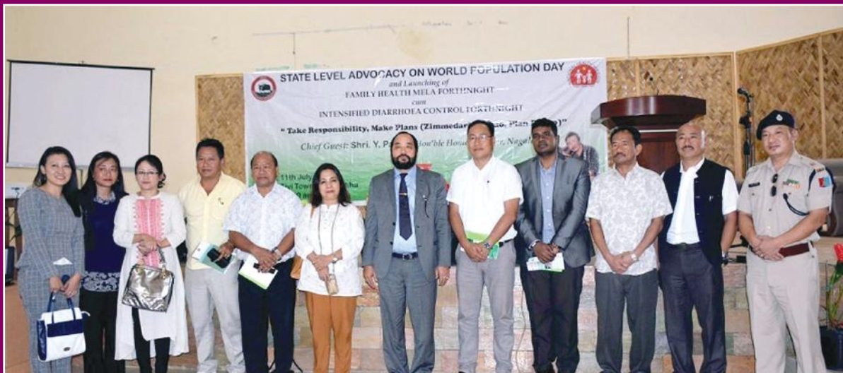
Minister for Home, Y. Patton with officials during the State Level Advocacy on World Population Day at Tiyi Town Hall Wokha on 11th July 2016.