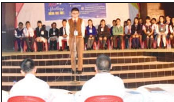
Students participating at the 1st Inter School Ao Spelling Bee Competition at Cosmos Hall, Mokokchung on 29th July 2016.