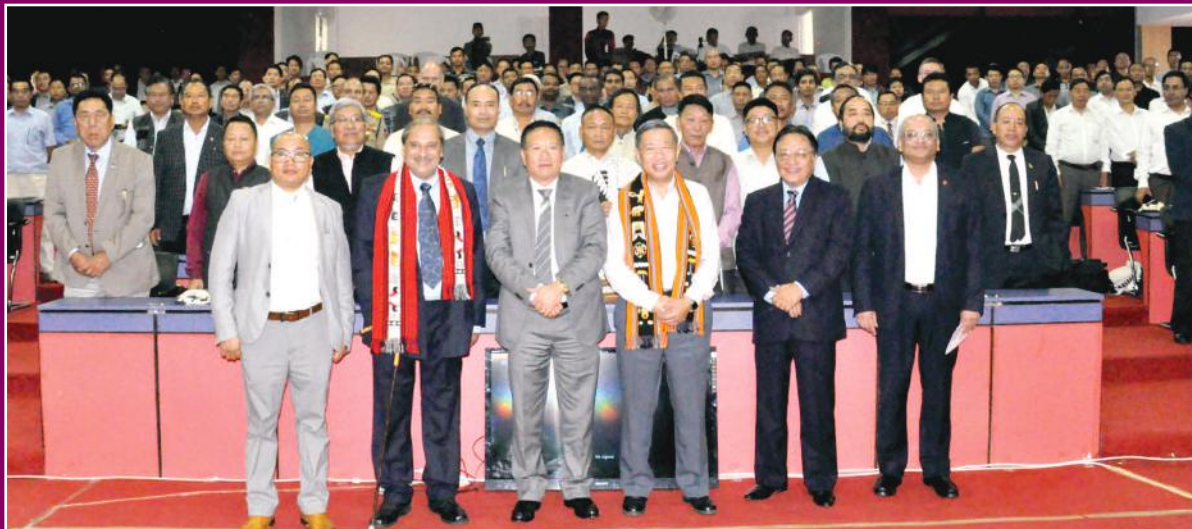
Chief Minister Nagaland T.R. Zeliang along with dignitaries and participants of the workshop on Disaster Risk Reduction in the Context of Climate Change at the Capital Convention Centre on 7th July 2016.