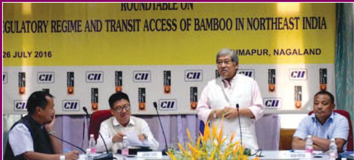
Minister for Forest, Environment & Wildlife of Nagaland Nicky Kire speaking at the 3rd Rountable on Regulatory Regime and Transit Access of Bamboo in Northeast India conference hall of Nagaland Bamboo Resource Centre Dimapur on 26th July 2016.