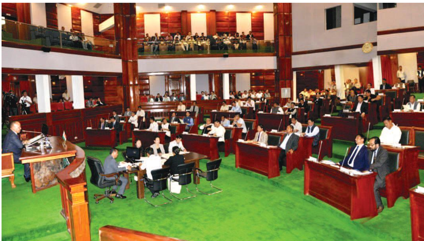
NLA Speaker Chotisuh Sazo presiding over the 12th session of the Twelfth Nagaland Legislative Assembly on 12th July, 2016.