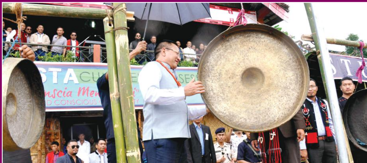
Chief Minister T.R. Zeliang beating the brass gong at the ENSF Fiesta cum General Session at local ground Mon town on 26th July 2016.