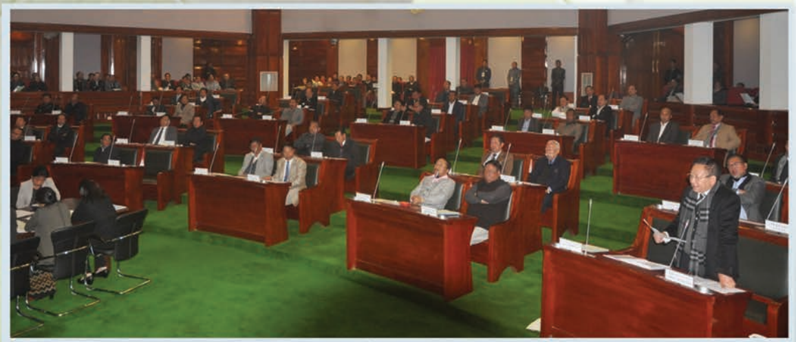
CM, T.R. Zeliang speaking at the 19th session (winter session) of the Twelfth Nagaland Legislative Assembly on 15th December, 2017.