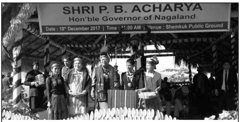
Governor of Nagaland, P.B. Acharya and his lady wife, Kavita Acharya being felicitated during the inauguration of Ametchong village under Longleng district on 18th December, 2017.

special song on the occasion. The vote of thanks was proposed by Deputy Secretary, Government of Nagaland, B. Henok Buchem.