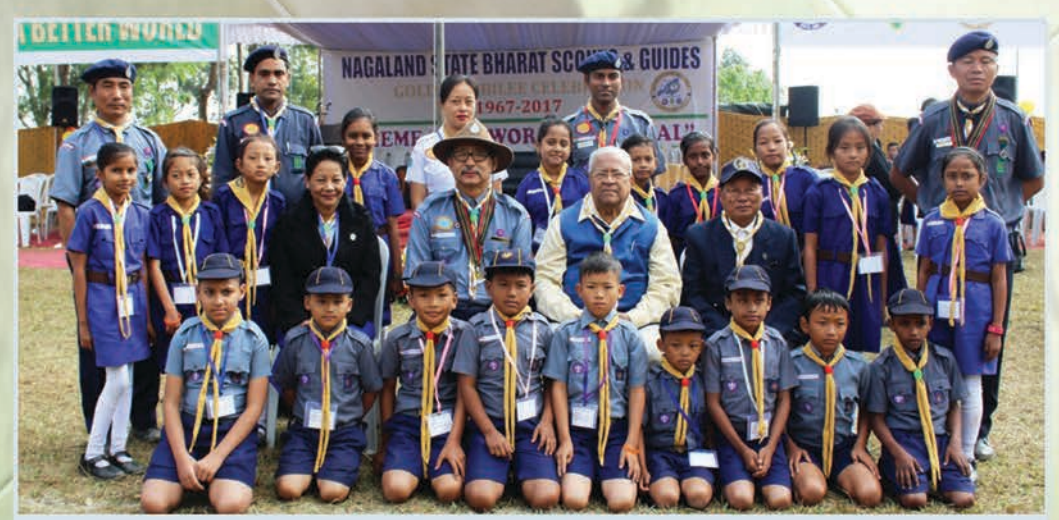
Governor, P. B. Acharya and officials of NSBSG with Cubs & Bulbuls from Dimapur during the NSBSG Golden Jubilee programme on 15th December 2017 at the State Training Centre, Nerhema.