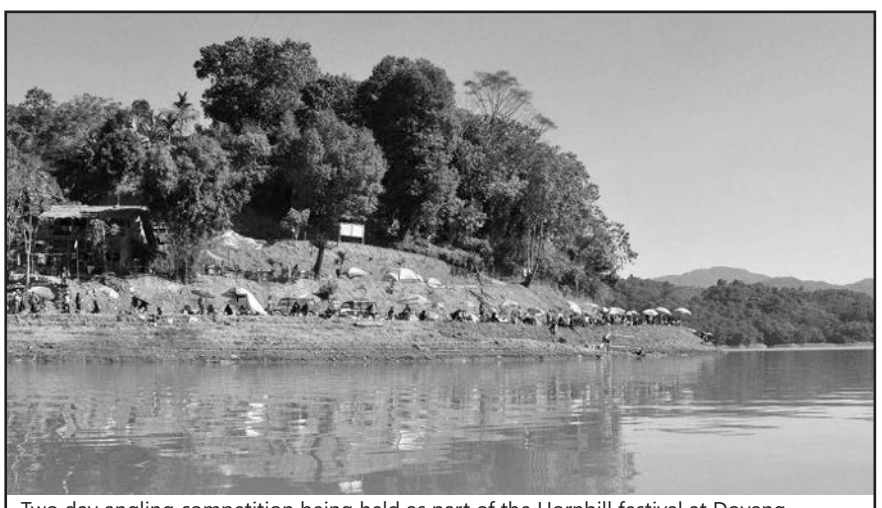
Two day angling competition being held as part of the Hornbill festival at Doyang reservior. Wokha from 4<sup>th</sup> - 5<sup>th</sup> December. 2017.

the most valuable and important sectors of production in the State, the value of fish and its by product has increased considerably among the local populace, and thus has account for immense opportunity to develop the fisheries sector in the State.