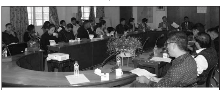
DC, Dimapur, Sushil Kumar Patel, IAS addressing the DPDB meeting at Dimapur on 5^{\text{th}} December, 2017.

In the meeting, the House decided to send the proposal for upgradation of Kuhuboto SDO (C) to ADC HQ to the Government for consideration. With regard to registration of societies, the House recommended the