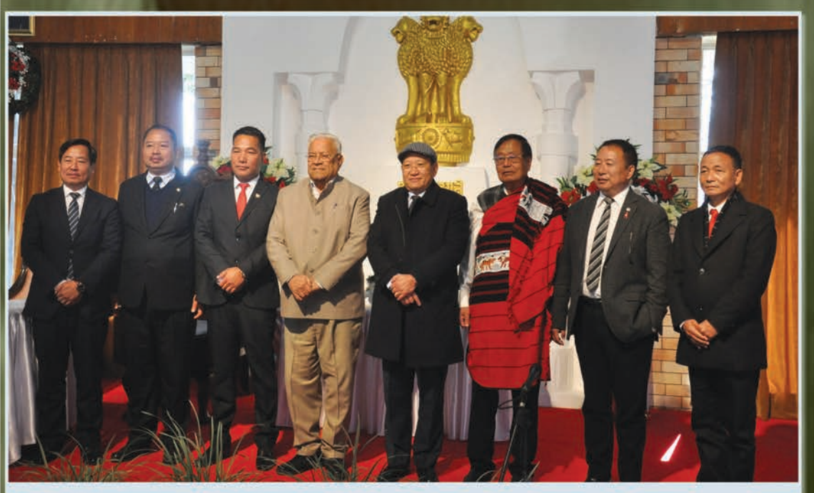
Governor, P.B Acharya and CM, T.R. Zeliang along with the newly inducted Cabinet Ministers at Durbar Hall, Raj Bhavan, Kohima on 16<sup>th</sup> December 2017.