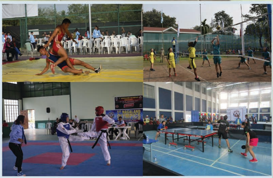
Glimpses of the sports events at the 1st Nagaland Olympics 2017 held at Dimapur.