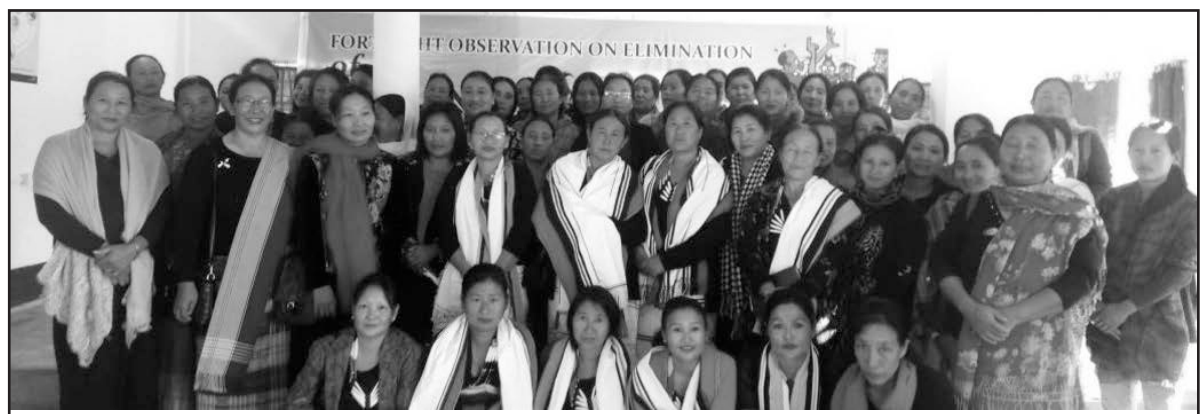
A programme on 'Elimination of Violence against Women' held on the 6<sup>th</sup> of December, 2017 at Peren Town Women Welfare Hall, Peren.

the programme was held at Commissioner Rest House, Mokokchung on 7<sup>th</sup> December, 2017.