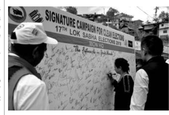
Signature Campaign for Clean Elections 2019 at Mon on 3rd April 2019.

District Administration Mon organised signature campaign in order to have clean election and to cast fair and clean vote. The Campaign was held at the premises of the Aoleana Mini Hornbill festival.