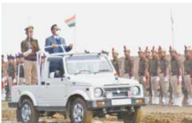
Minister, Health & Family Welfare, S. Pangnyu Phom inspecting the parade contingents on the occasion of the 73 rd Republic Day celebration at Public Ground, Zunheboto on 26 th January 2022.