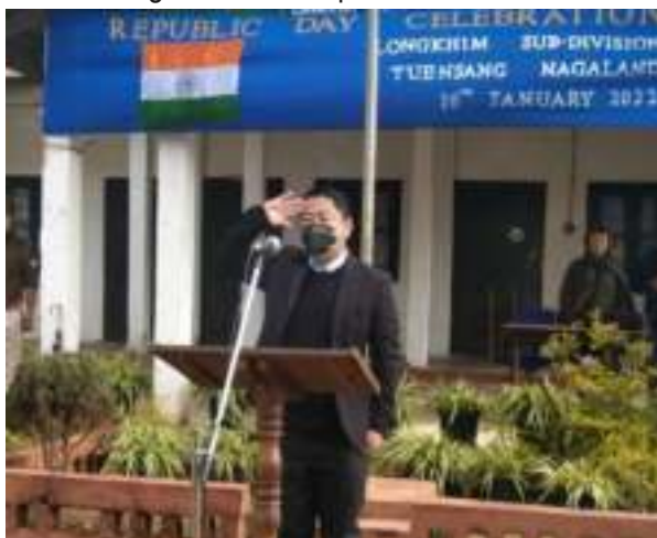
ADC, Longkhim, Chuba Temjen taking the rashtriya salute during the Republic Day celebration at Longkhim on 26 th January 2022.

Longkhim sub-division celebrated the 73 rd Republic Day at ADC's Office, Longkhim town. ADC, Longkhim, Chuba Temjen unfurled the national flag and took the rashtriya salute from Nagaland Police Cadre and read out the Republic Day speech. The function was attended by Heads of Offices and staff from all the government departments.