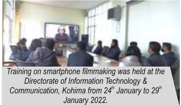
Training on smartphone filmmaking was held at the Directorate of Information Technology & Communication, Kohima from 24 th January to 29 th January 2022.

The training was held at the e-Governance Academy Classroom at the Directorate of Information Technology & Communication, Kohima