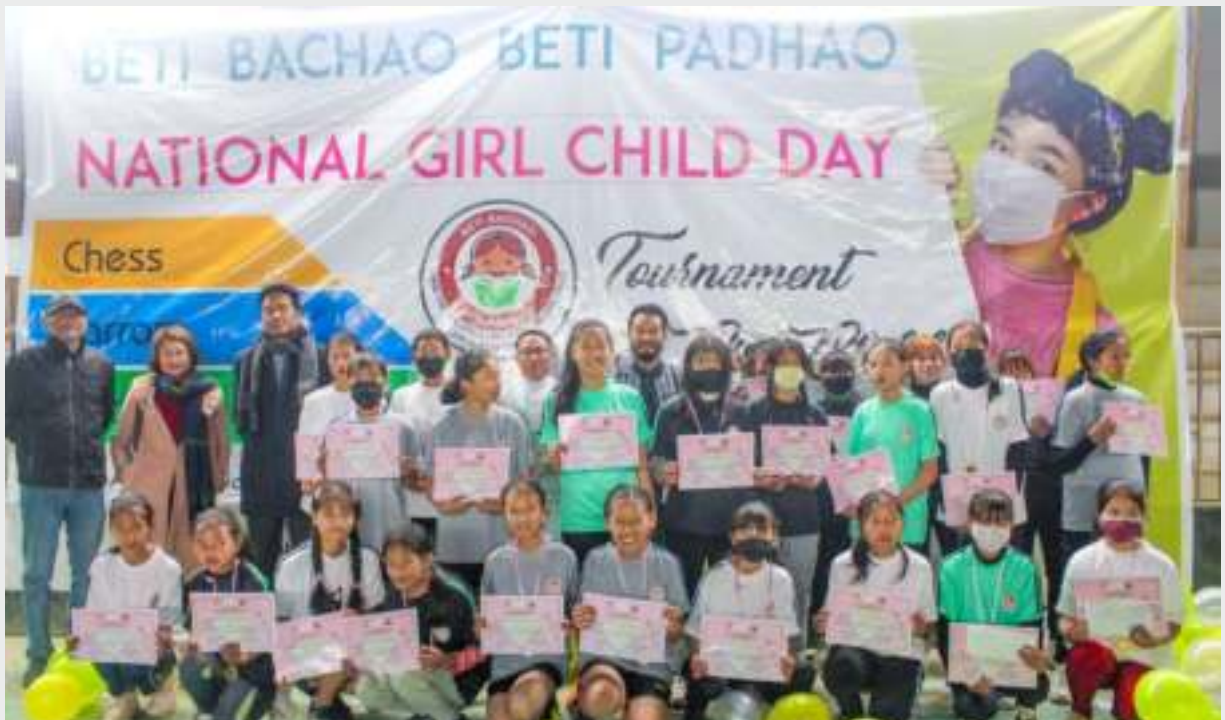
Officials along with participants during the celebration of National Girl Child Day 2022 from 21 st - 26 th January 2022 at Longleng .