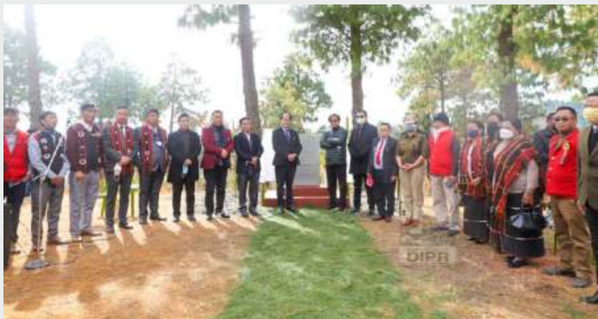
Chief Minister, Neiphiu Rio along with other dignitaries and officials during the foundation laying ceremony of the new Deputy Commissioner's Office, Zunheboto on 20 th January 2022.