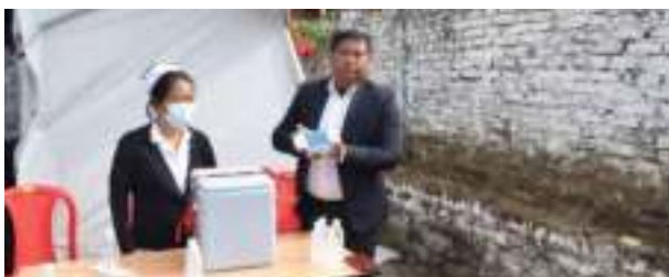
Deputy Commissioner, Wokha, Orenthung Lotha launching the COVID-19 vaccination for 15-18 year olds at Wokha on 11 th January 2022.

Wokha District Task Force (DTF) for COVID-19 launched the COVID-19 vaccination for 15-18 year olds on 11 th January 2022.