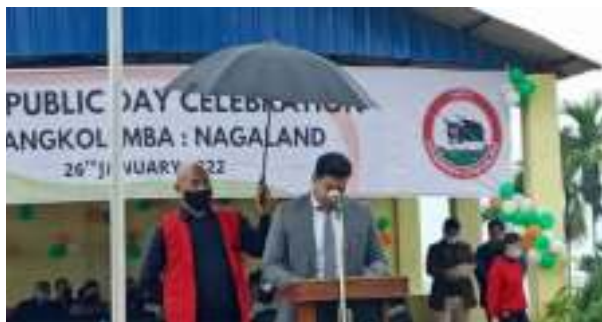
ADC, Mangkolemba, Dharam Raj, IAS delivering the Republic Day speech at Mangkolemba on 26 th January 2022.

The 73 rd Republic Day was celebrated at Public Ground, Mangkolemba. After unfurling the national flag and taking the rashtriya salute, Additional Deputy Commissioner, Mangkolemba, Dharam Raj, IAS delivered the Republic Day speech. The function was attended by all Heads of Offices and a large number of general public.