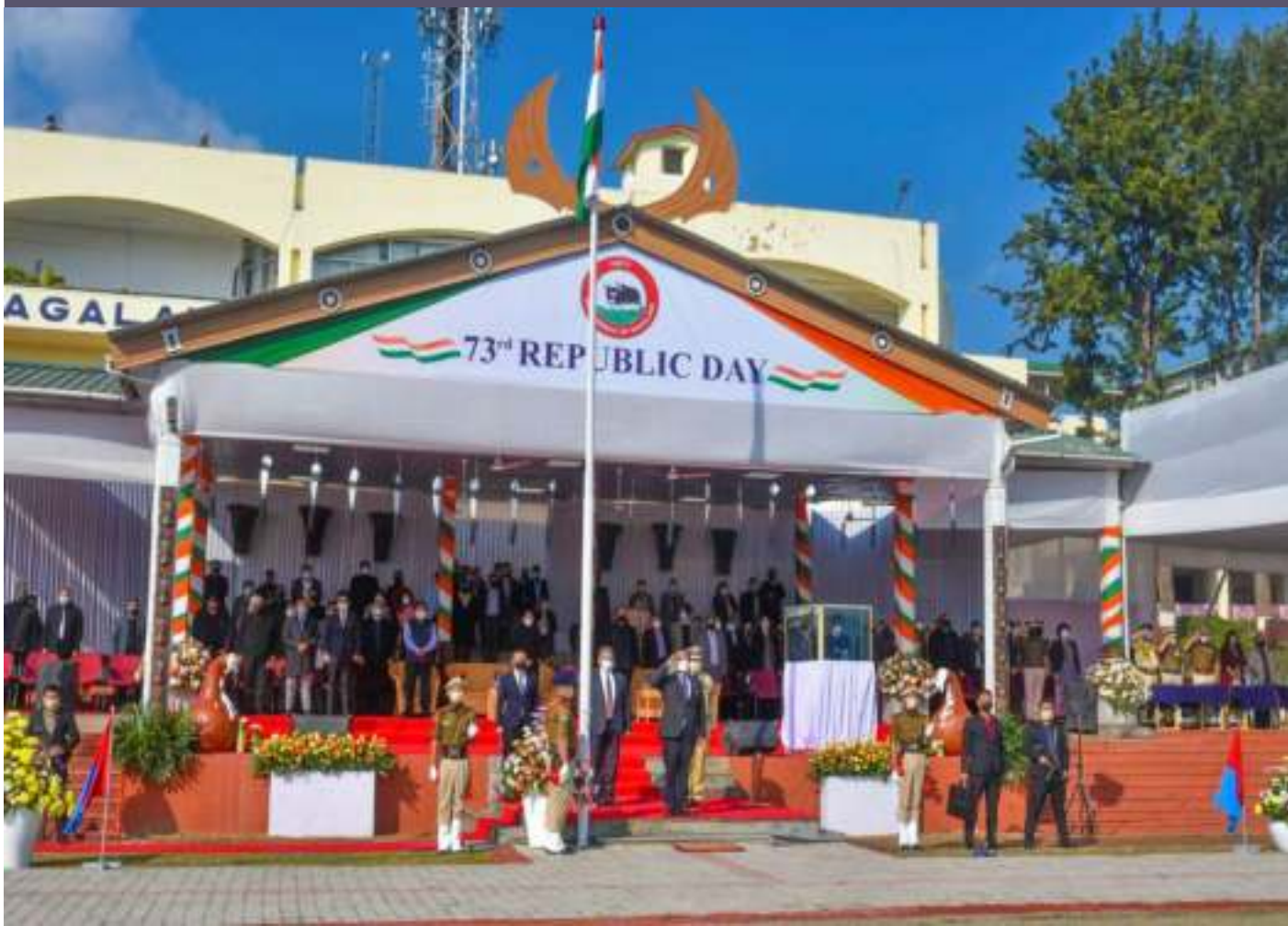
Chief Minister, Neiphiu Rio taking the rashtriya salute on the occasion of the 73 rd Republic Day celebration at Nagaland Civil Secretariat Plaza, Kohima on 26 th January 2022.