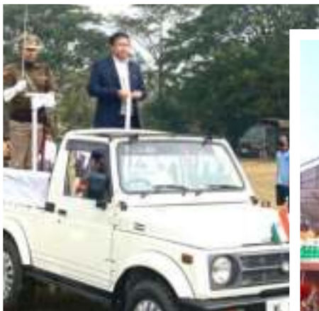
Minister, Public Health Engineering, Jacob Zhimomi inspecting the parade contingents on the occasion of the 73 rd Republic Day celebration at Niuland on 26 th January 2022.