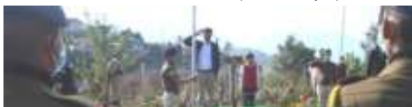
EAC, Tobu, Tsidi taking the rashtriya salute during the Republic Day celebration at Tobu on 26 th January 2022.

The 73 rd Republic Day celebration was observed at Tobu Headquarter. EAC, Tobu, Tsidi unfurled the national flag, took rashtriya salute from DEF Tobu and read out the Republic Day speech.