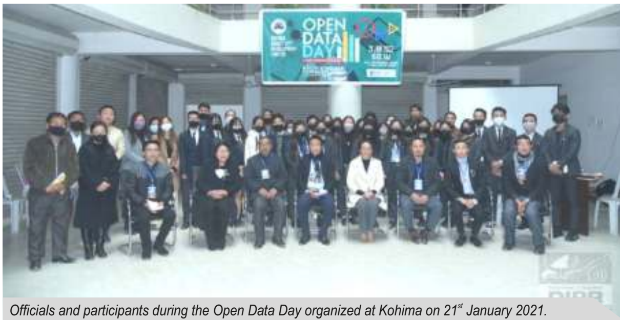
Officials and participants during the Open Data Day organized at Kohima on 21 st January 2021.

importance of providing accurate data as it is used in the policy making and planning of the Government which in turn impacts the development of the State. She also appealed that if a person is a resident of Kohima city they should avail benefits from the city itself and not from their native village, which in turn will help in presenting an accurate data in planning for the city.