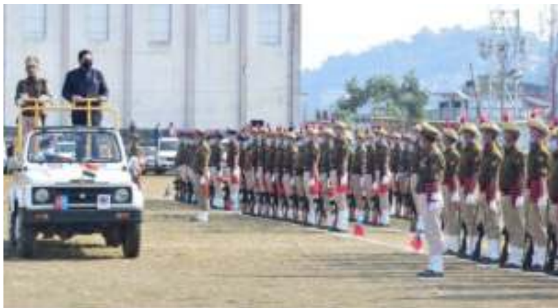
Nagaland Legislative Assembly Speaker, Sharingain Longkumer inspecting the parade contingents during the 73 rd Republic Day celebration at Imkongmeren Sports Complex, Mokochung on 26 th January 2022.