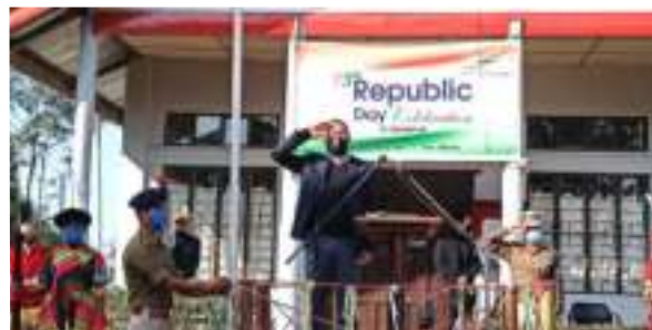
ADC, Chozuba, Theodore Yanthan taking the rashtriya salute during the Republic Day celebration at Chozuba on 26 th January 2022.

The 73 rd Republic Day was celebrated at Chozuba town with Additional Deputy Commissioner, Theodore Yanthan as the special guest. He unfurled the national flag and took rashtriya salute from the 5 th NAP Chetheba. He also highlighted the various achievements, undertakings and challenges of the State Government while reading out the Republic Day speech. All the Heads of Offices and public leaders attended the programme.