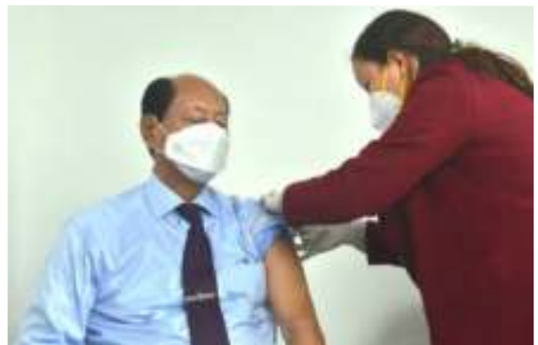
Chief Minister, Neiphiu Rio being administered the COVID-19 booster shot at the First Aid-Cum-Vaccination Centre, Nagaland Civil Secretariat, Kohima on 26 th January 2022.