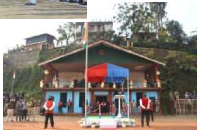
Deputy Commissioner, Mon, Thavaseelan K, IAS delivering the Republic Day Speech at Local Ground, Mon on 26 th January 2022.