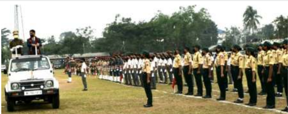
Member of Legislative Assembly, Azheto Zhimomi inspecting the parade contingents on the occasion of the 73 rd Republic Day celebration at Public Ground, Chumoukedima on 26 th January 2022.