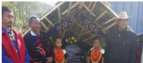
Advisor, Fisheries & Aquatic Resources, Evaluation, Economics & Statistics, Nagaland, L. Khumo inaugurated the Thangoun Village Council Hall, Noklak on 20 th January 2022.

Advisor, Fisheries & Aquatic Resources, Evaluation, Economics & Statistics, Nagaland, L. Khumo inaugurated the Thangoun Village Council Hall, Noklak on 20 th January 2022. He said the Council Hall is constructed for the welfare of the village people which is a long felt need of the village. He also appealed to the Council to be always truthful and do everything unitedly in a peaceful way, and cooperate with the Government.