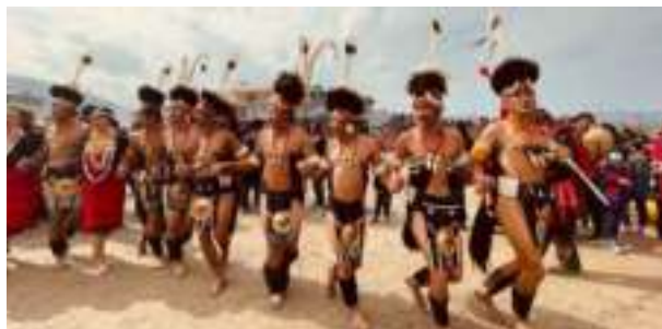
A cultural troupe performing a folk dance during the Poanglum Mini Hornbill Festival at Parade Ground, Tuensang on 15 th January 2022.