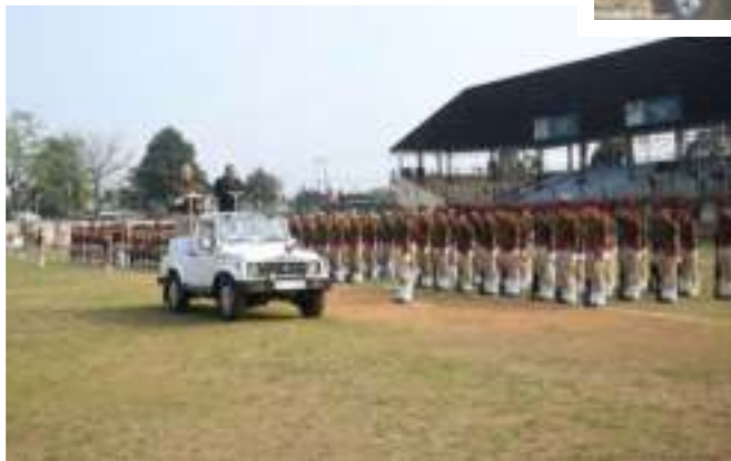
Minister, Planning & Coordination, Land Revenue and Parliamentary Affairs, Neiba Kronu inspecting the parade contingents on the occasion of the 73 rd Republic Day celebration at DDSC Stadium, Dimapur on 26 th January 2022.