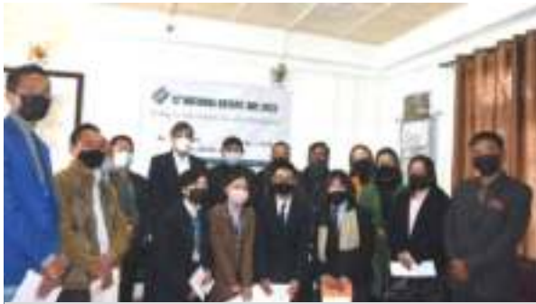
The 12 th National Voters' Day was observed at CEO's Office, Kohima on 25 th January 2022.