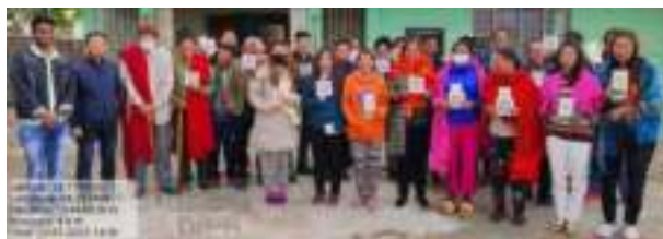
'Beti Bachao Beti Padhao Week - The Daughters of New India' was celebrated at the Village Council Hall, Old Riphyim village, Wokha on 23 rd January 2022.