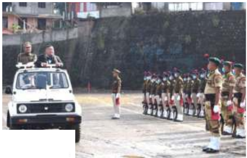
Minister, Higher Education and Tribal Affairs, Temjen Imna Along inspecting the parade contingents on the occasion of the 73 rd Republic Day celebration at Local Ground, Longleng on 26 th January 2022.