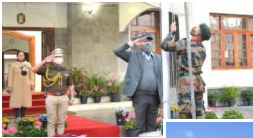
Commissioner & Secretary to Governor, T. Mhabemo Yanthan, IAS taking the rashtriya salute after unfurling the National Flag during the 73 rd Republic Day celebration at Raj Bhavan, Kohima on 26 th January 2022.