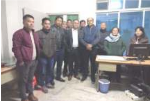
The State Level Special Revenue Team of Power Department held a meeting at Kohima Electrical Division on 20 th January 2022.