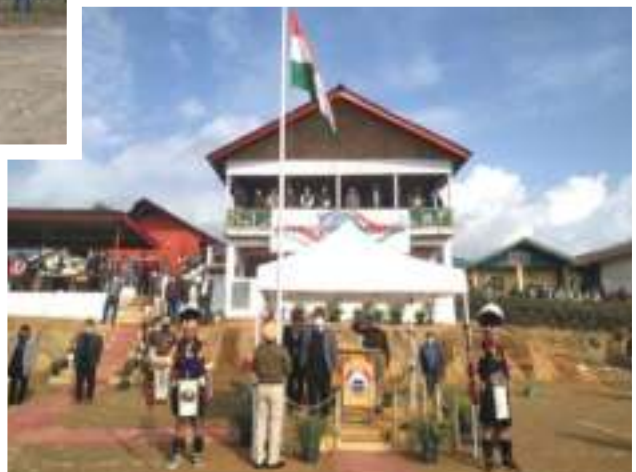
Minister, Public Works Department (Housing and Mechanical), Tongpang Ozukum taking the rashtriya salute during the occasion of the 73 rd Republic Day celebration at Noklak on 26 th January 2022.