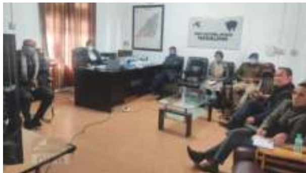
A briefing meeting through video conferencing was organized by the Election Commission of India for General Observers and Police Observers on 14 th January 2022.

Officers from Nagaland cadre to be deployed in General Observers (IAS officers), and Police Observers (IPS officers) duty also attended the video conference at Chief Electoral Officer's office, Nagaland.