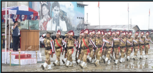
Minister, Rural Development, Metsubo Jamir taking the rashtriya salute on the occasion of the 76 th Independence Day celebration at Mokokchung on 15 th August 2022.