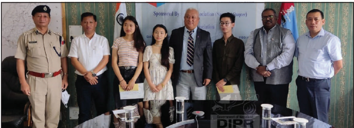
HSLC & HSSLC Toppers 2022 who are children of Police personnel were felicitated at a programme held at Mini Conference Hall, Police Headquarter, Kohima on 18 th August 2022.

The Felicitation-cum-Award programme for HSLC & HSSLC Toppers of 2022 for children of Nagaland Police personnel was held at Mini-Conference Hall, PHQ on 18 th August 2022. DGP Nagaland, Senior Police Officers of PHQ, Unit Commanders and other meritorious students and parents attended the programme through video conference from various parts of Nagaland.