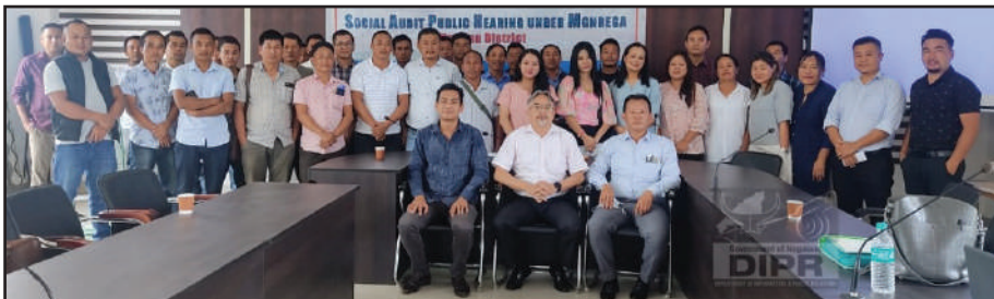
District Level Social Audit Public Hearing under MGNREGA was held at DPDB's Conference Hall, Kohima on 17 th August 2022.

District Level Social Audit Public Hearing under MGNREGA for nine (9) villages, Chedema Model, Dzulakema, Kiruphema Basa, Kiruphema Bawe, Gariphema Basa, Tseimekhuma Basa, Viphoma, Phekerkeima Basa and Thongsunyu under five (5) RD Blocks, Kohima, Sechu-Zubza, Botsa, Chiephobozou and Tseminyu district was convened at DPDB Conference Hall, Kohima on 17 th August 2022.