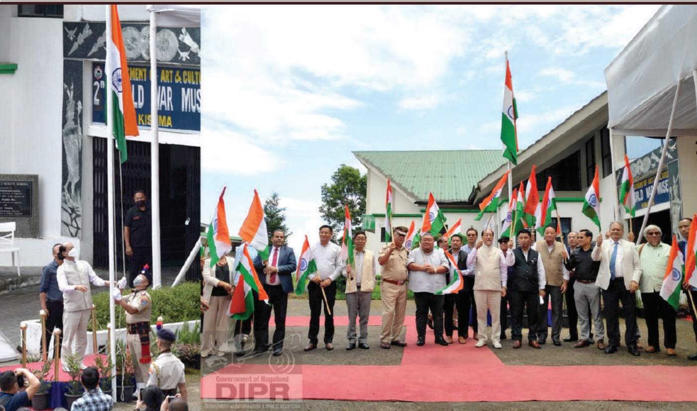
Chief Minister, Neiphiu Rio unfurling the national flag during the Har Ghar Tiranga campaign as part of Azadi Ka Amrit Mahotsav at the World War II Museum, Kisama, Kohima on 12 th August 2022.