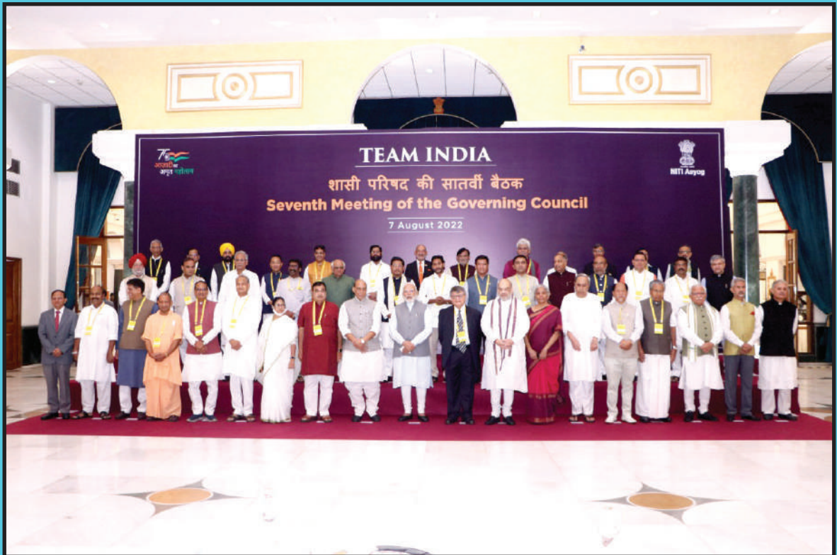
Prime Minister, Narendra Modi along with his Cabinet Ministers and Chief Ministers of States during the seventh meeting of the Governing Council at New Delhi on 7 th August 2022.