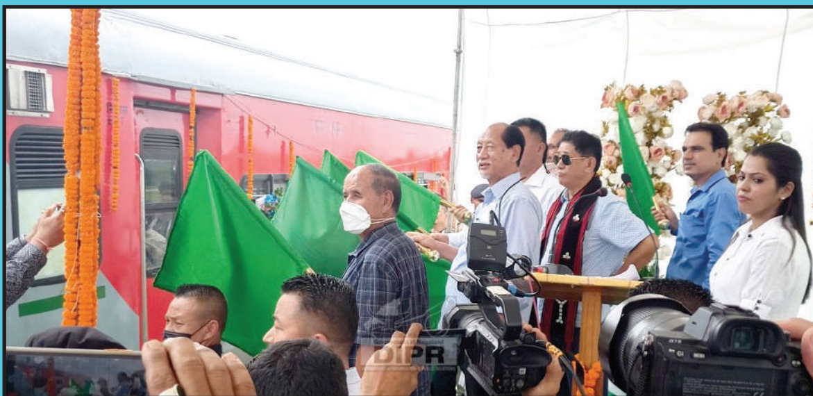
Chief Minister, Neiphiu Rio flagging off the Donyi Polo Express train at Shokhuvi on 26 th August 2022.