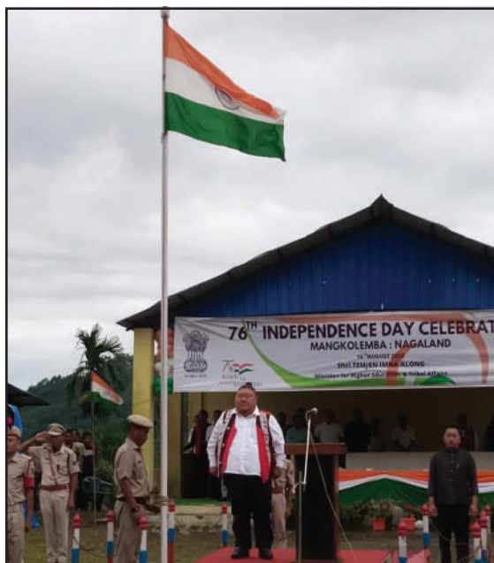
Minister, Higher Education and Tribal Affairs, Temjen Imna Along during the Independence Day celebration at Mangkolemba on 15 th August 2022.

Mangkolemba celebrated the 76 th Independence Day at the Public Ground on 15 th