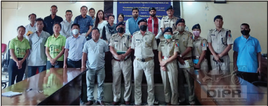
Officials and participants during a sensitization programme on 'Combating Child Trafficking' held at the Conference Hall of the office of DC, Mon on 10 th August 2022.

In Mon, the NCPDR in collaboration with District Administration Mon, organized a