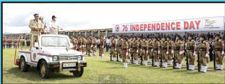
Chief Minister, Neiphiu Rio inspecting the parade contingents during the 76th Independence Day celebration at Nagaland Civil Secretariat Plaza, Kohima on 15 th August 2022.