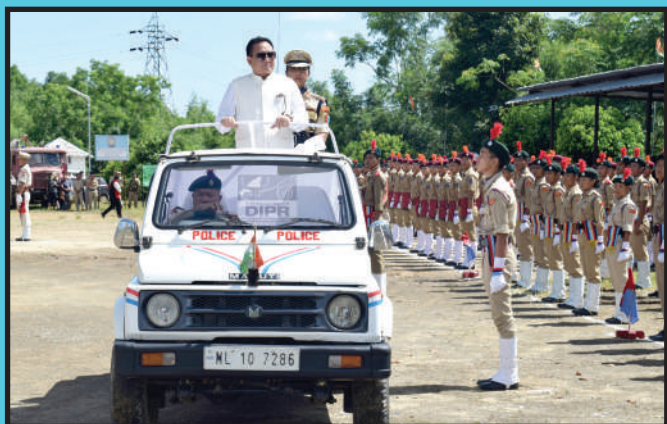
Chairman, United Democratic Alliance, T. R. Zeliang inspecting the parade contingents during the 76 th Independence Day celebration at Peren on 15 th August 2022.