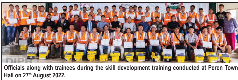
Officials along with trainees during the skill development training conducted at Peren Town Hall on 27 th August 2022.