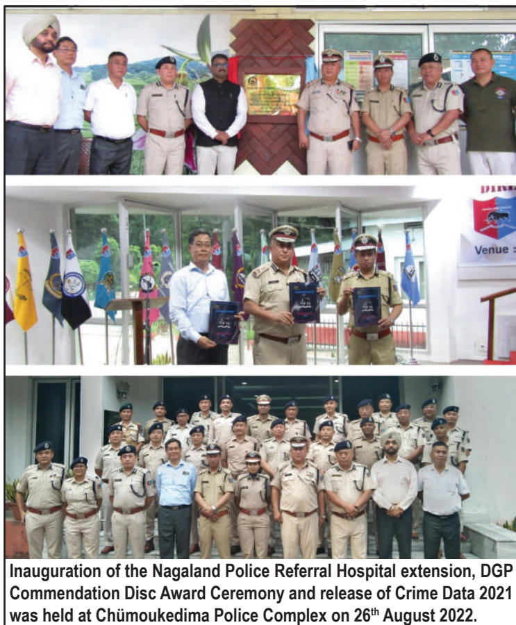
Inauguration of the Nagaland Police Referral Hospital extension, DGP Commendation Disc Award Ceremony and release of Crime Data 2021 was held at Chümoukedima Police Complex on 26 th August 2022.

State continues to be peaceful, and that has been reflected in the denotification of 15 police stations from the purview of AFPSA, which has reimposed faith in the State Police. As per 2021 Crime Data, 1525 cases have been registered out of which, 765 cases have been chargesheeted, and pending investigation is 553, conviction rate is 179 which is on trial case. Total number of persons arrested in 2021 is - Male - 1515 and Female - 71. He stated