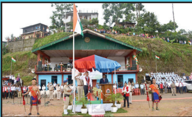
Minister, Transport, Civil Aviation & Railways, P. Paiwang Konyak taking the rashtriya salute on the occasion of the 76 th Independence Day celebration at Mon on 15 th August 2022.