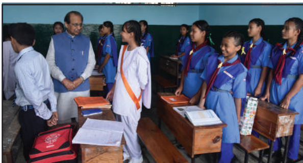
Governor of Nagaland and Assam, Prof. Jagdish Mukhi interacting with students of Jawahar Navodaya Vidyalaya at Yakukie, Kohima on 23 rd August 2022.

premier institution, imparting quality education to students, many of whom are from rural areas. He added that JNV Kohima is fortunate to have good facilities and infrastructure including experienced teachers and staff. He called upon the students to dream big in life and work hard to achieve the goal as there is no shortcut in learning. He suggested the students to take guidance of parents and teachers in deciding the choices in their career ahead, and further advised them to develop the practice of building a strong will power.