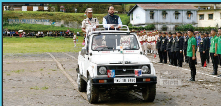
Deputy Chief Minister, Y. Patton inspecting the parade contingents during the 76 th Independence Day celebration at Wokha on 15 th August 2022.