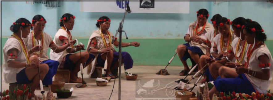
Kiiritsechu Cotton Group of Meluri performing during the Millet Festival celebrated at Meluri Village Council Hall on 31 st August 2022.

2 nd Millet Festival was organised by the Meluri Millet Sisters, in collaboration with Millet Network of India and NEN (Northeast Network) with the theme 'Celebrating common heritage for a shared, resilient future' at Meluri Village Council Hall on 31 st August 2022.