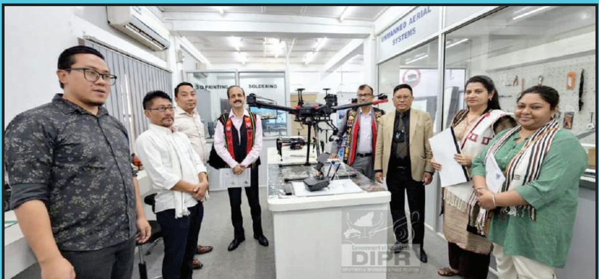
Agriculture Production Commissioner, Nagaland, Y. Kikheto Sema with the team from World Bank, during their visit to the Nagaland GIS and Remote Sensing Centre on 30 th August 2022.