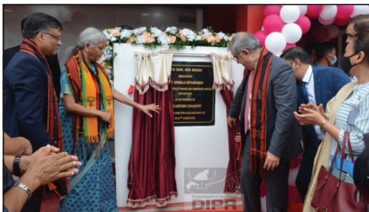
Union Minister of Finance & Corporate Affairs, Nirmala Sitharaman inaugurated Axis Bank, Mon Branch during her visit to Mon on 23 rd August 2022.

to the people to avail the facilities to the fullest and become productive units of the society as job creators.