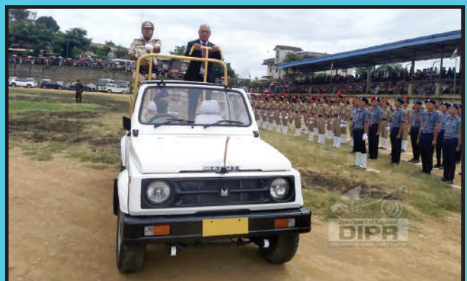
Minister, Soil & Water Conservation, Geology & Mining, V. Kashiho Sangtam inspecting the parade contingents during the 76 th Independence Day celebration at Local Ground, Kiphire on 15 th August 2022.