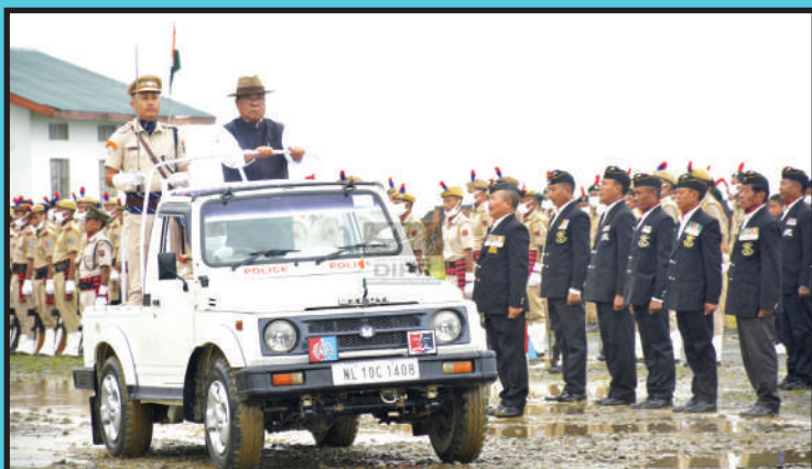
Minister, Agriculture and Cooperation, G. Kaito Aye inspecting the parade contingents during the 76 th Independence Day celebration at Zunheboto on 15 th August 2022.