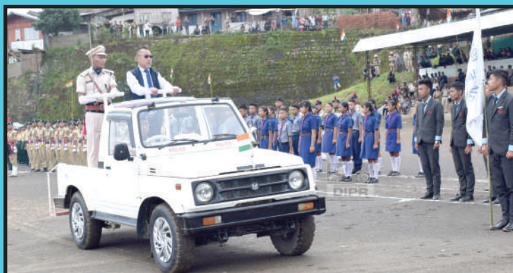
Minister, Health & Family Welfare, S. Pangnyu Phom inspecting the parade contingents during the 76 th Independence Day celebration at Longleng on 15 th August 2022.