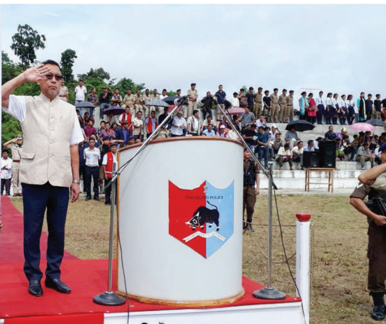
Minister for Health & Family Welfare, S. Pangnyu Phom taking the salute on the occasion of the 72 nd Independence Day celebrations at Peren Hq on 15 th August 2018.