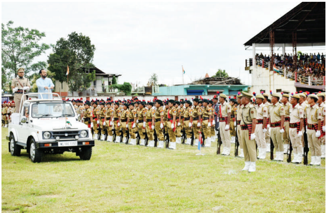
Deputy Chief Minister, Y. Patton inspecting the parade contingents during the Independence Day celebrations at Dimapur Hq on 15 th August 2018.