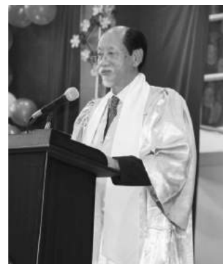
Chief Minister, Neiphiu Rio addressing the graduates and students on the occasion of Graduation Day at St. Joseph's College, Jakhama on 10 th August 2018.

that Naga society is under pressure and terming the economy as 'salary economy,' he stressed on the need for venturing into private sector.