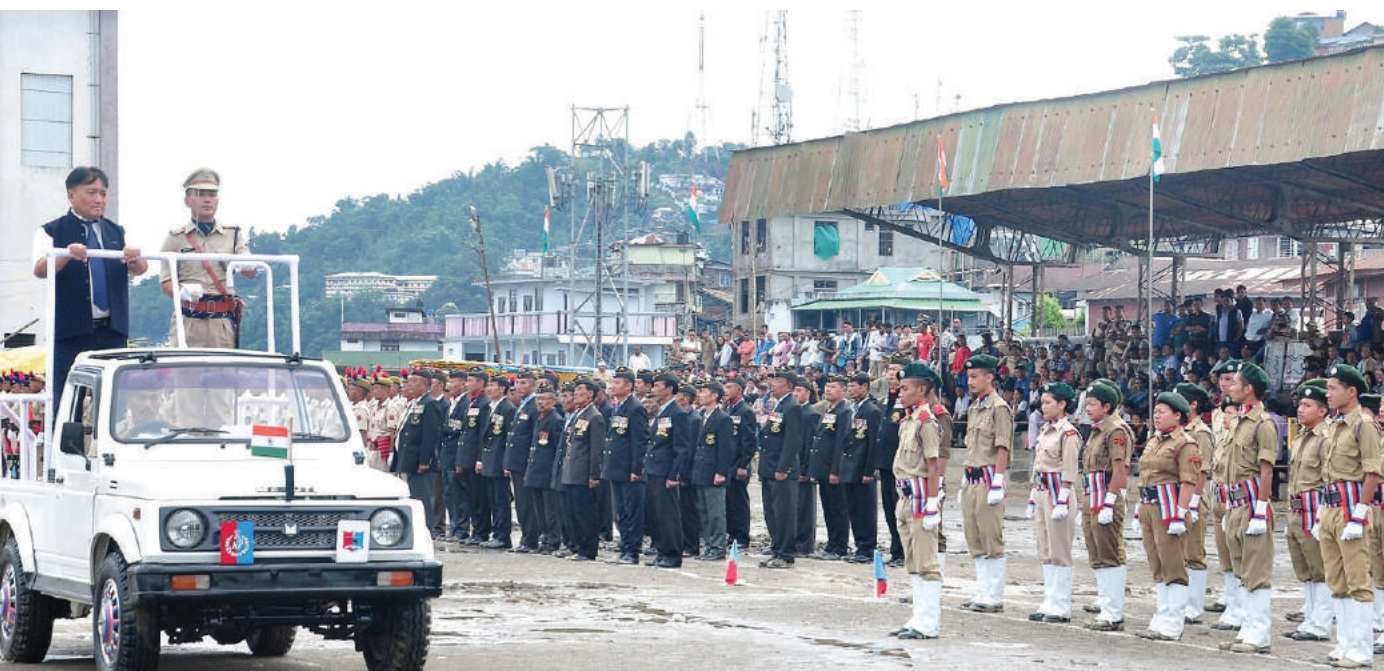
Minister, Urban Development and Municipal Affairs, Metsubo Jamir inspecting the parade contingents on the occasion of the 72 nd Independence Day celebrations at Mokokchung Hq on 15 th August 2018.