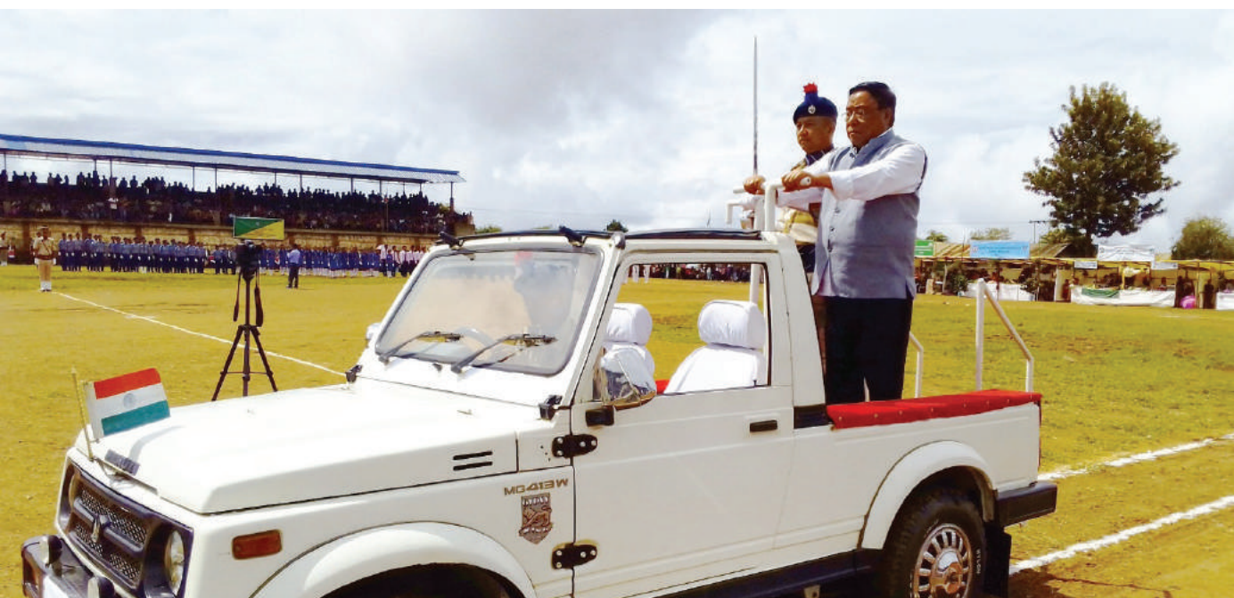
Minister for Agriculture and Cooperation, G. Kaito Aye gracing the 72 nd Independence Day celebrations at Kiphire Hq on 15 th August 2018.