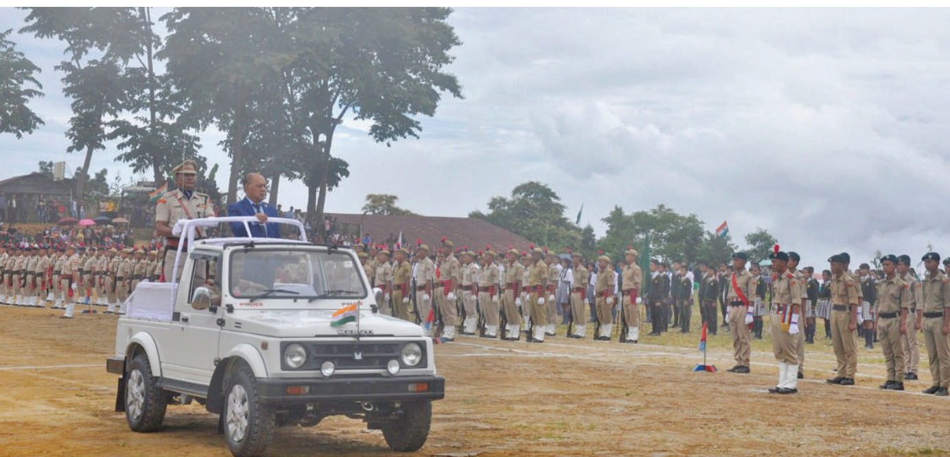
Minister for Soil & Water Conservation and Geology & Mining, Kashiho Sangtam inspecting the parade contingents during the Independence Day celebrations at Phek Hq on 15 th August 2018.