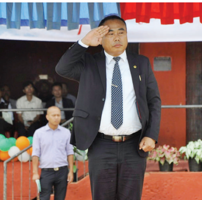
Minister for Planning & Coordination and Land Revenue, Neiba Kronu taking the salute on the occasion of the 72 nd Independence Day celebrations at Wokha Hq on 15 th August 2018.