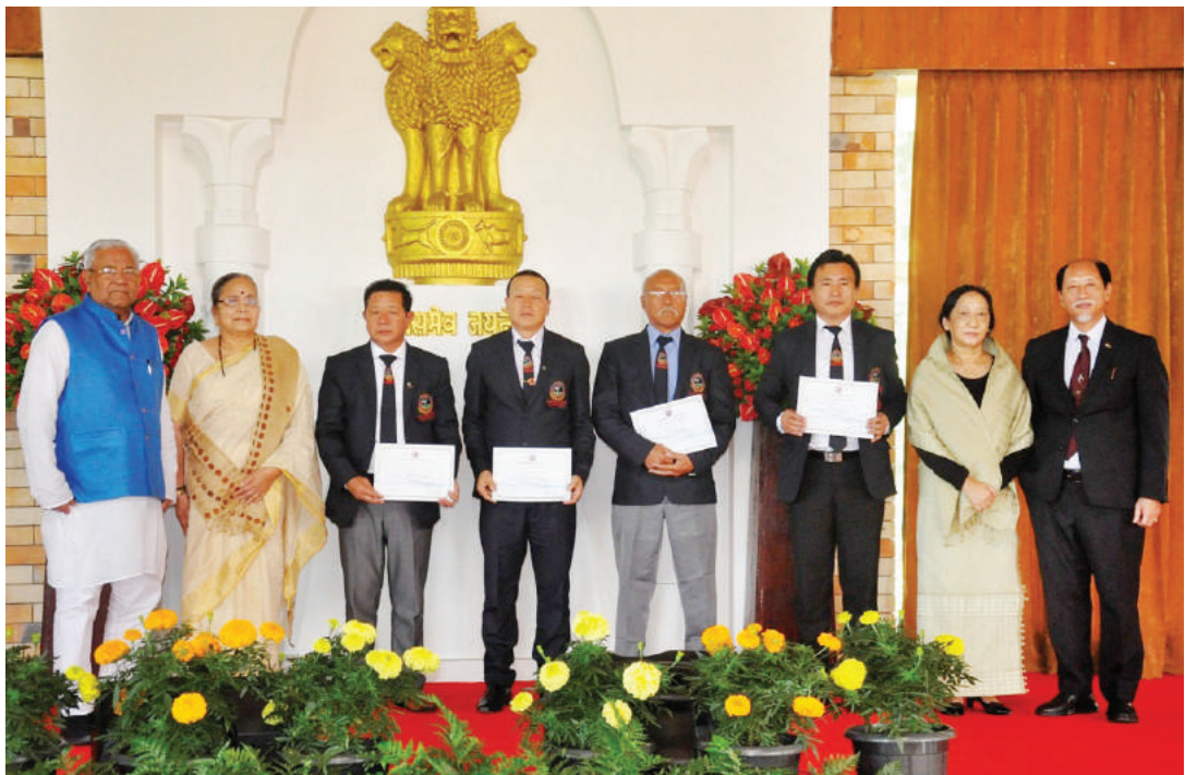
Nagaland Governor, P. B. Acharya and Chief Minister, Neiphiu Rio pictured with the recipients of Dr. T. Ao Sports Award 2018 at Raj Bhavan, Kohima on 15 th August 2018.