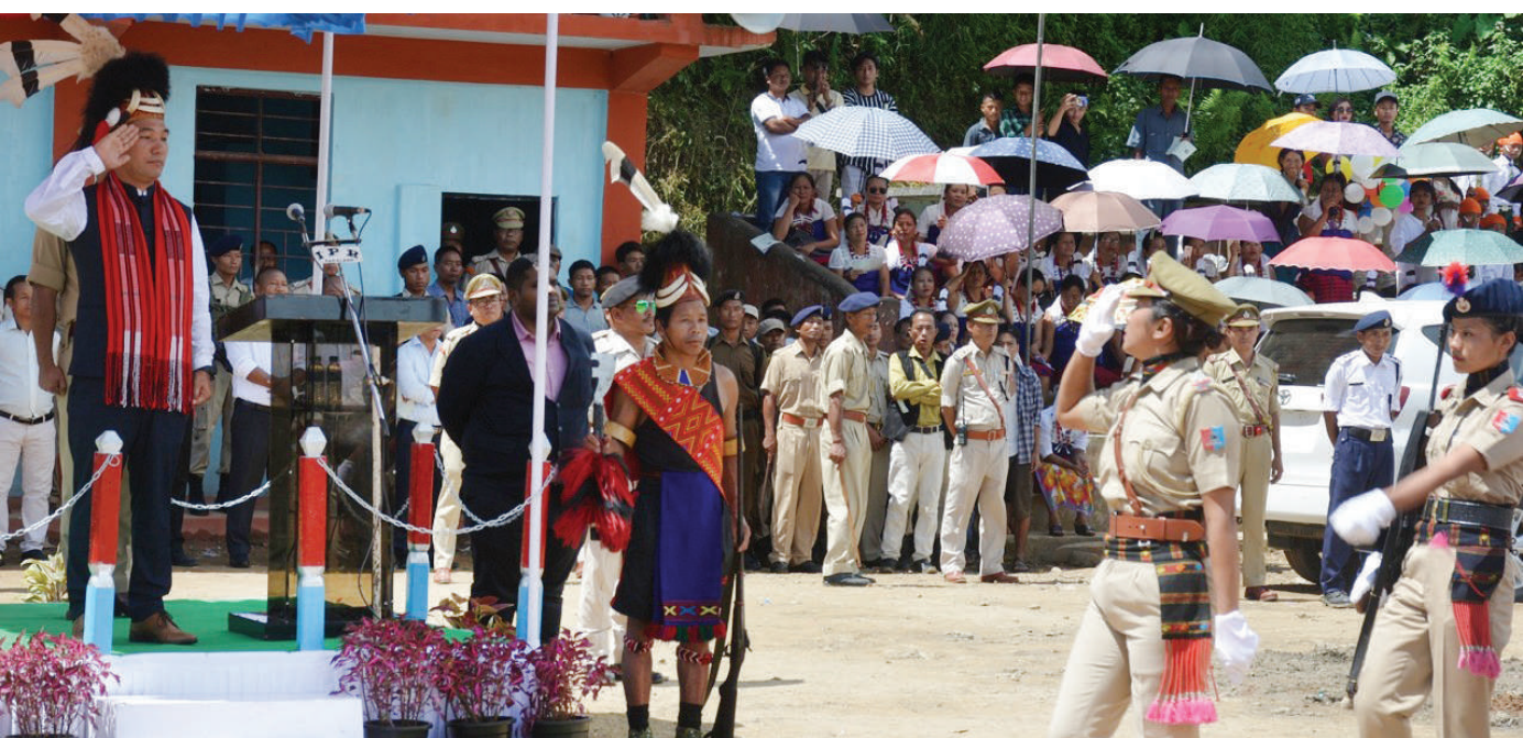
Minister for Transport, Civil Aviation & Railways and Land Resources, Paiwang Konyak taking salute from the parade contingents during the 72 nd Independence Day celebrations at Mon Hq on 15 th August 2018.