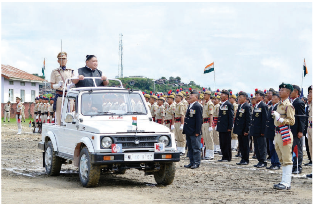
Minister, Higher & Technical Education, Temjen Imna Along inspecting the parade contingents on the occasion of the 72 nd Independence Day celebrations at Zunheboto Hq on 15 th August 2018.