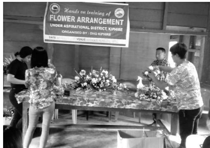
Hands-on training on flower arrangement was organized by Horticulture Department at Hopongkyu Memorial Hall, Kiphire town on 10 th August 2018.

As the Aspirational District (Kiphire), the Horticulture department organised hands-on training in flower arrangement on 10 th August 2018 at Hopongkyu Memorial Hall, Kiphire town.