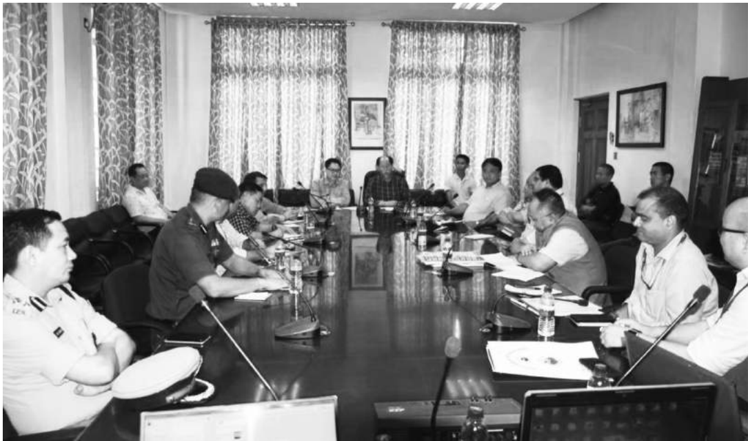
Union Minister of State for Home Affairs, Kiren Rijiju addressing a meeting at Niathu Resort, Dimapur in the presence of the Chief Minister, Neiphiu Rio, his cabinet colleagues and other officials on 5 th August 2018.