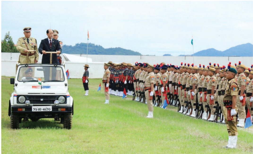
Chief Minister, Neiphiu Rio inspecting the parade contingents on the occasion of the 72 nd Independence Day celebrations at New Secretariat Complex, Kohima on 15 th August 2018.