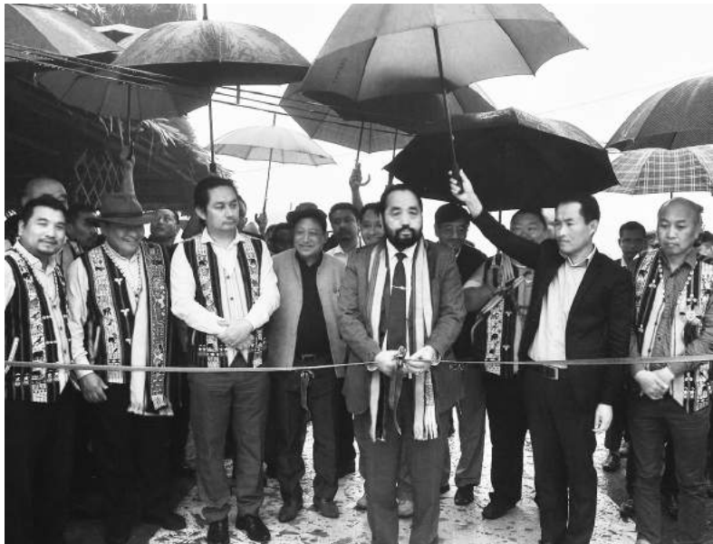
Deputy CM along with other dignitaries inaugurating the stalls being set up by various departments and NGOs on the occasion of Tsungremmong Hornbill Festival 2018 at Imkongmeren Sports Complex, Mokokchung on 1 st August 2018.

The formal programme was followed by presentation of cultural items, tug of war and Under-14 Inter-school Barefoot Football Competition