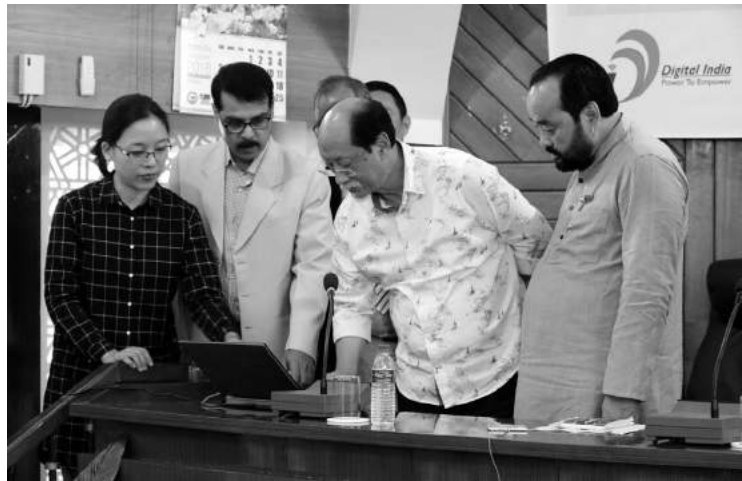
Chief Minister, Neiphiu Rio launching the CM Dashboard & eNPS at Secretariat Conference Hall, Kohima on 13 th August 2018.

Inaugurating the CM Dashboard, Chief Minister, Neiphiu Rio said that Nagaland being a state which is dependent on flagship programmes of the government, this initiative will help in informing the people about the details of the various projects/schemes being implemented in the state. Rio mentioned that as of now, there are 22 schemes of 11 state government departments, and that the other departments will also follow suit. Also, on e-NPS, the CM said that this web system will help the government in effectively maintaining the NPS records and contribute to the welfare of the citizens. As of now, e-NPS is being launched only in Kohima district, and will be covered very soon in the rest of the districts, he added.