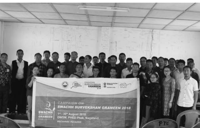
Orientation programme on Swachh Survekshan Grameen 2018 was held at Phek Town Council Hall on 18 th August 2018.

Orientation programme on Swachh Survekshan Grameen 2018 (Clean Survey of Villages)