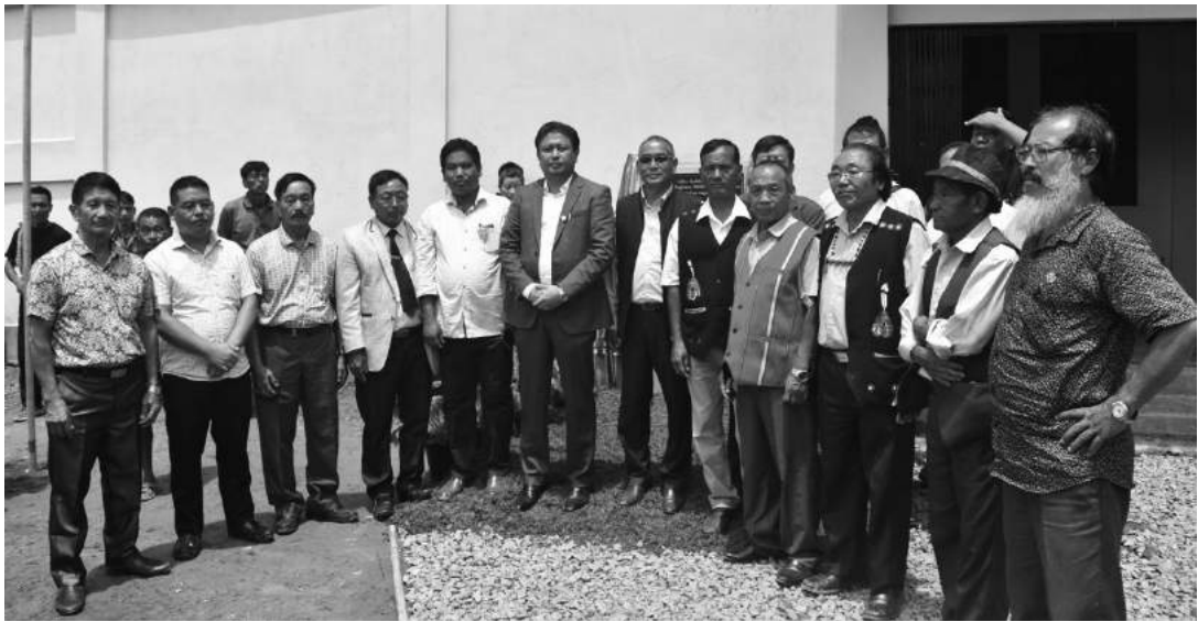
Minister for Public Health Engineering Department (PHED), Jacob Zhimomi and officials at the inaugural of the new office building of Executive Engineer PHED, Longleng on 15 th August 2018.

Tsulise Sangtam asserted that it is a proud moment for the district and the Phom community to have such a beautiful building in Longleng and he was hopeful that it will bear more fruits, render best service and cater to the needs of the people. The DC also apprised the Minister and the Chief Engineer regarding lack of water supply to the district headquarter and the problems faced by the people due to scarcity of water and added that rain water is the only alternative source of water supply for the people of Longleng district.