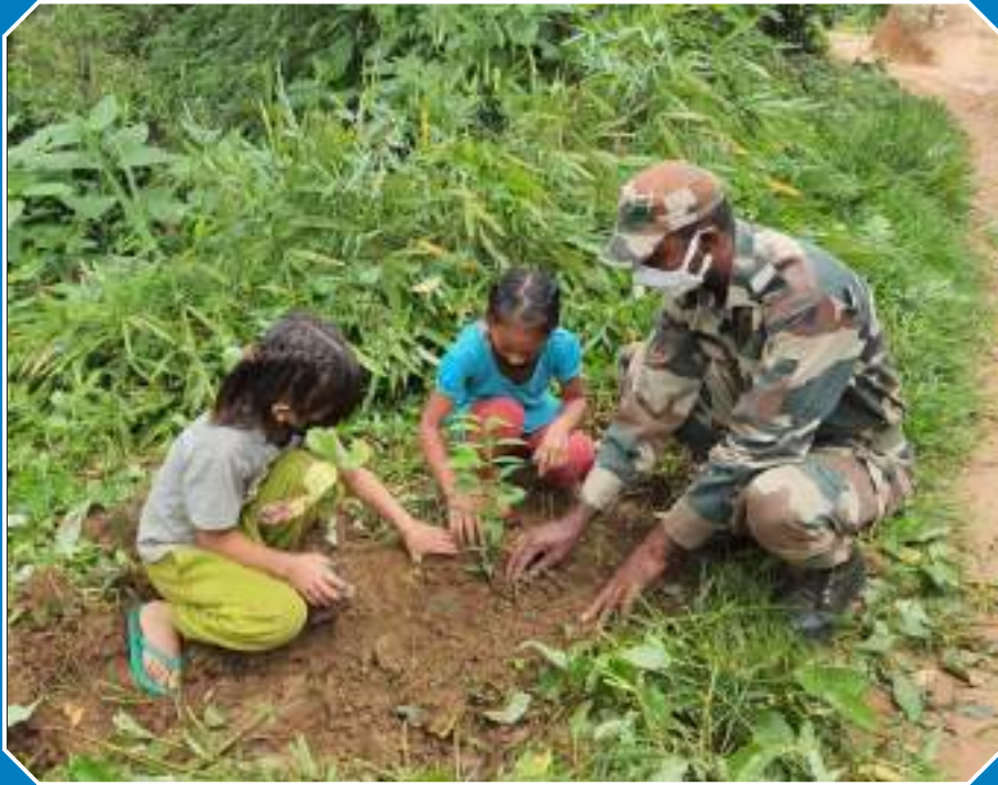
Children with Assam Rifles personnel planting a sapling during a tree plantation drive, on the occasion of World Environment Day organized by the Assam Rifles, Tening at Tening town, Phek on 5 th June 2021.