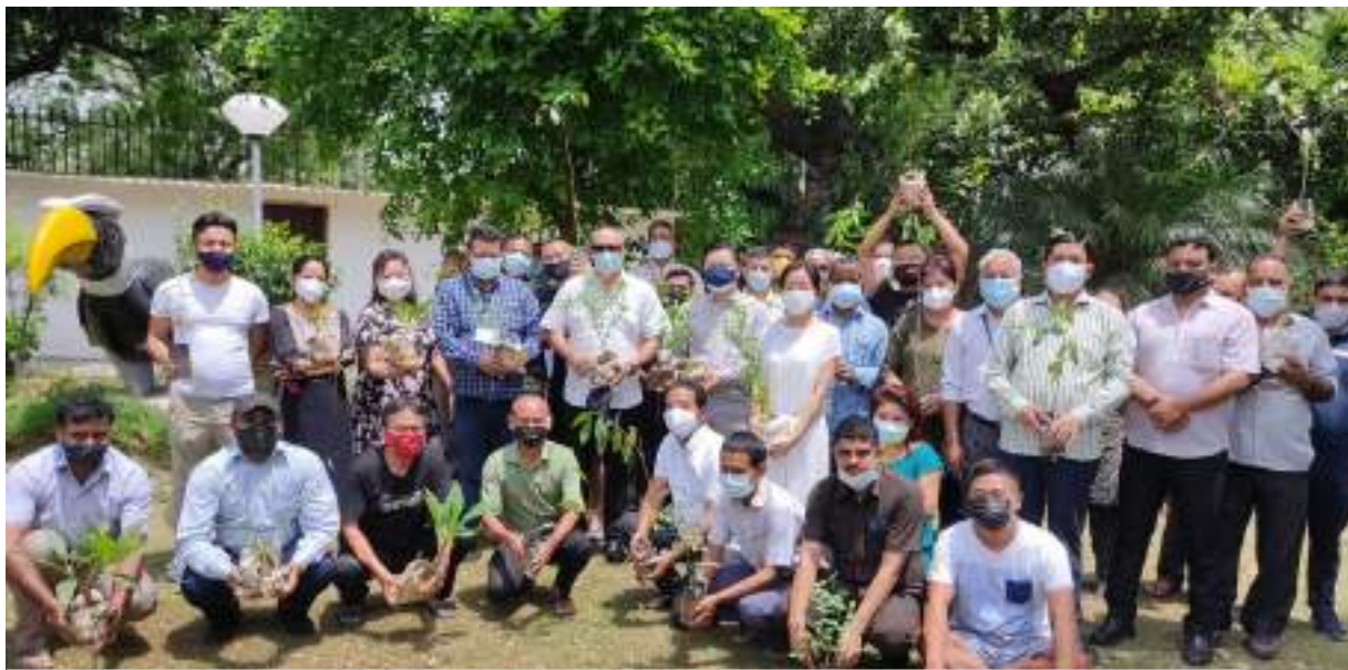
Additional Chief Secretary & Chief Resident Commissioner along with officers and staff of Nagaland House, New Delhi planted around 200 tree saplings of different varieties at Nagaland House, 29 Dr. APJ Abdul Kalam Road, New Delhi on 8 th June 2021.

The ACS & CRC spoke on the importance of World Environment Day and in creating awareness among the people and also restoration of the ecosystems around the world for the benefit of people and nature. All the officers and staff