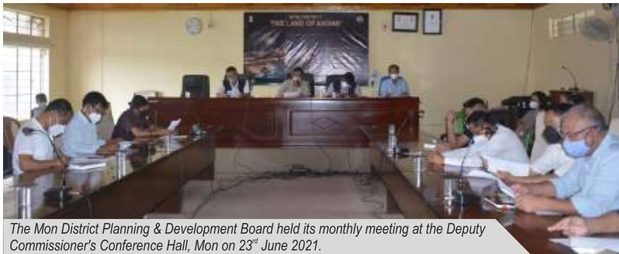
The Mon District Planning & Development Board held its monthly meeting at the Deputy Commissioner's Conference Hall, Mon on 23 rd June 2021.

Rs. 10 lakh allocated for each assembly constituency for COVID-19 activities as per the guidelines issued by the State Government, he added.