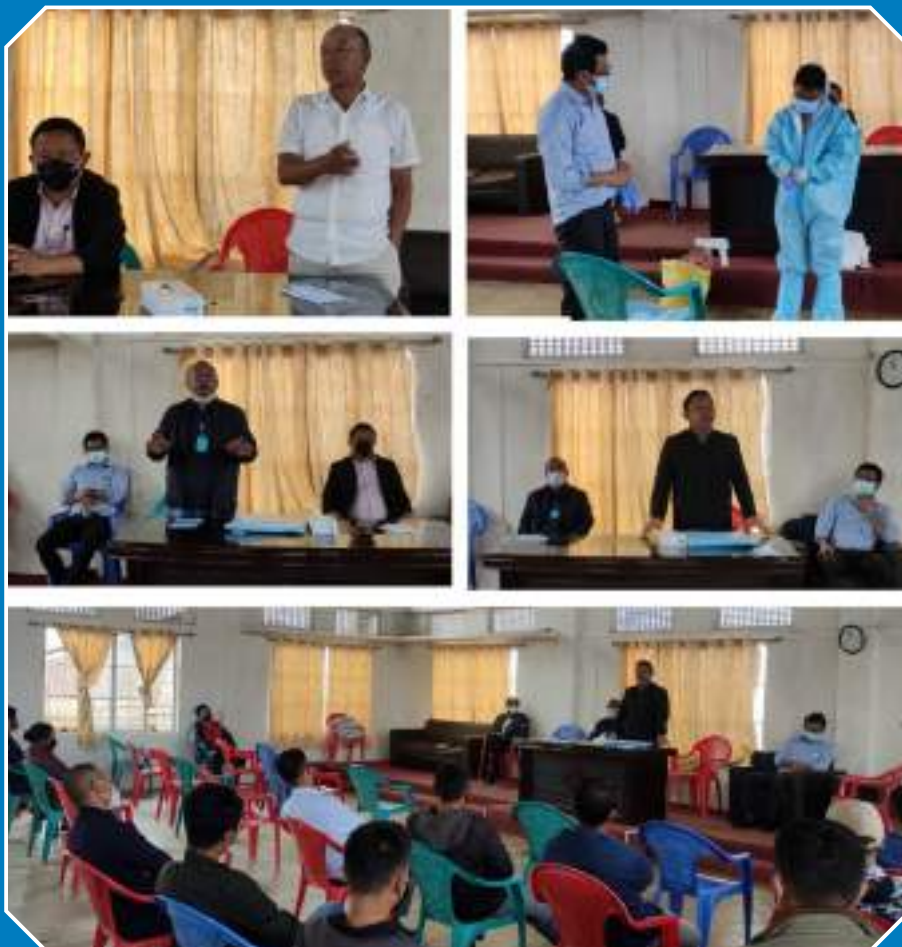
Public Education Campaign on COVID-19 and training on dead body management, use of PPE, lockdown measures, COVID-19 appropriate behaviour for healthcare workers, Village Disaster Management Authority and village authorities was held at Phusachodu village, Phek on 23 rd June 2021.