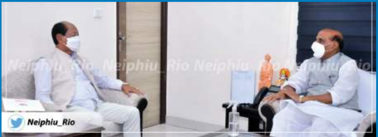
Chief Minister, Neiphiu Rio meeting with Union Defence Minister, Rajnath Singh to discuss issues related to development and welfare of the State at New Delhi on 29 th June 2021.