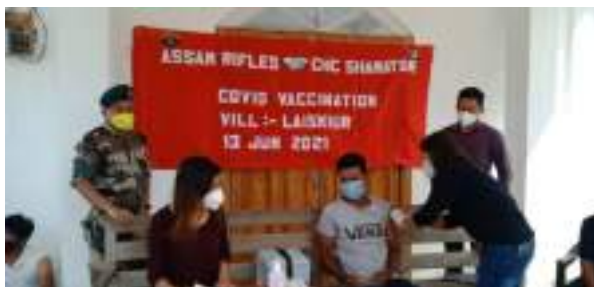
Assam Rifles (AR), Shamator Battalion with the joint effort of Community Health Centre, Shamator conducted a COVID-19 vaccination drive at Lasikiur village on 13 th June 2021.

On 13 th June 2021, Assam Rifles (AR), Shamator Battalion with the joint effort of Community Health Centre, Shamator led by Medical