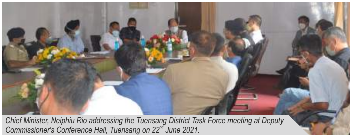
Chief Minister, Neiphiu Rio addressing the Tuensang District Task Force meeting at Deputy Commissioner's Conference Hall, Tuensang on 22 nd June 2021.

Chief Minister (CM), Neiphiu Rio held a meeting with Tuensang District Task Force (DTF) for COVID -19 members at Deputy Commissioner's (DC) Conference Hall, Tuensang on 22 nd June 2021.