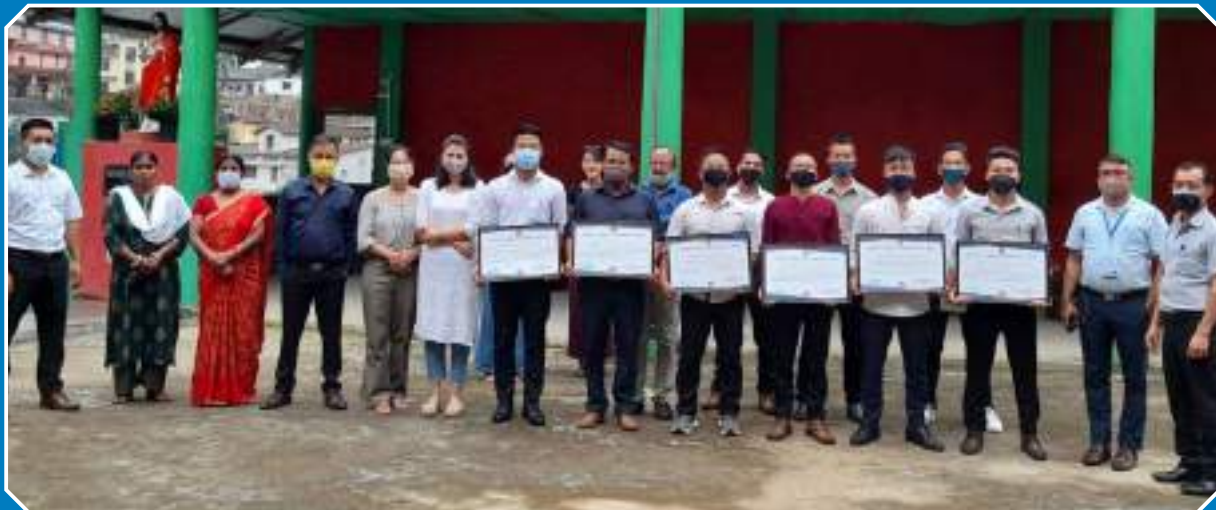
Officials and participants during a training on Tobacco Free Educational Institution (TOFEI), conducted at Sacred Heart School, Mon on 30 th June 2021.