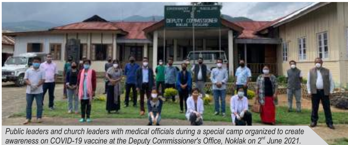
Public leaders and church leaders with medical officials during a special camp organized to create awareness on COVID-19 vaccine at the Deputy Commissioner's Office, Noklak on 2 nd June 2021.