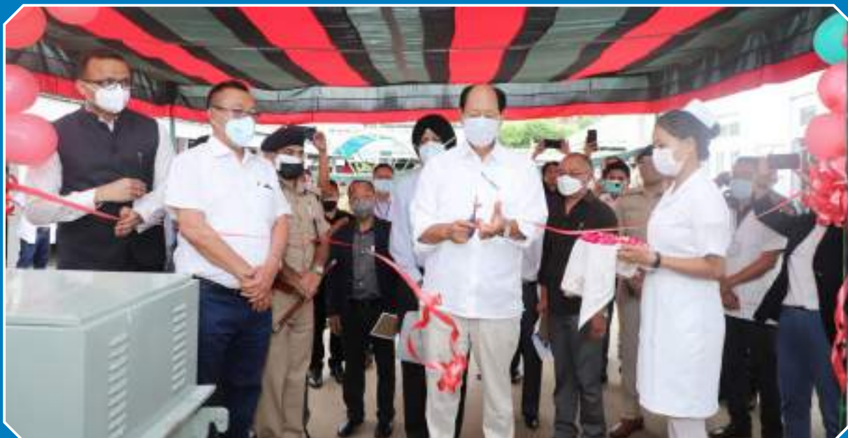
Chief Minister, Neiphiu Rio inaugurating the Oxygen Generator Plant at District Hospital Tuensang on 22 nd June 2021.