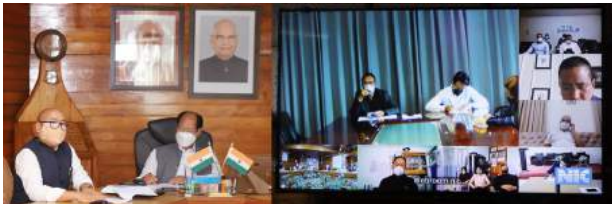
Chief Minister (CM) and Chairman, Nagaland State Disaster Management Authority, Neiphiu Rio and other officials during a meeting on monsoon preparedness, which was held through video conference at CM's Secretariat, Kohima on 2 nd June 2021.

A monsoon preparedness meeting was held through video conference under the chairmanship of Chief Minister (CM) and Chairman Nagaland State Disaster Management Authority (NSDMA), Neiphiu Rio at CM's Secretariat, Kohima on 2 nd June 2021. The meeting was attended by Ministers, Administrative Heads of Departments/ Heads of Departments of the line departments, Deputy Commissioners (DCs) and Chairman, District Disaster Management Authority (DDMA) of all the districts.