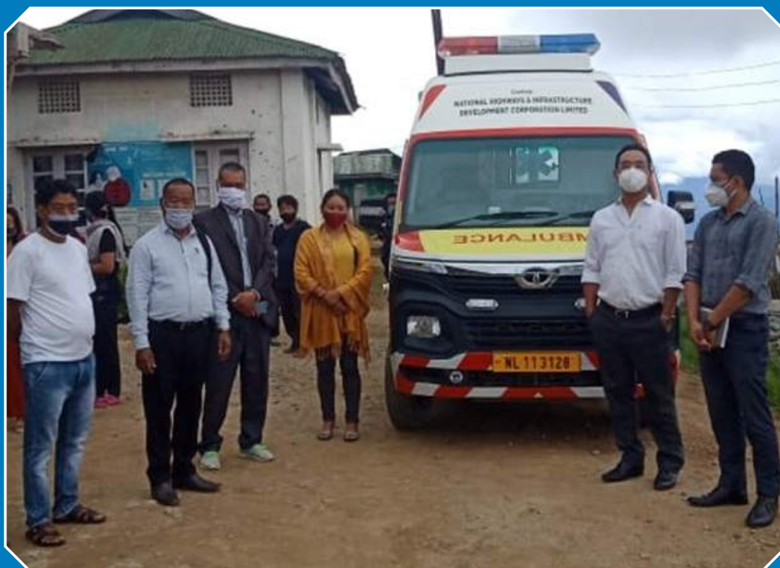
Officials during the dedicatory programme for the launch of a new ambulance at Shamator, Tuensang on 18 th June 2021.