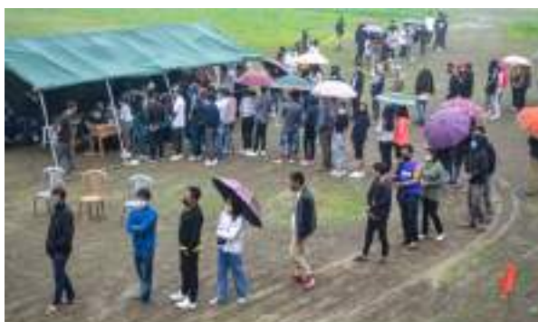
People queue up for vaccination during a special vaccination drive at Pfutsero Town Sports Complex on 13 th June 2021.

A special vaccination drive was organized by the Pfutsero Block Task Force (BTF) on 13 th June 2021 at Pfutsero Town Sports Complex. The vaccination drive was held with an objective to break the chain of COVID-19 transmission. A total of 749 persons were vaccinated in one session.