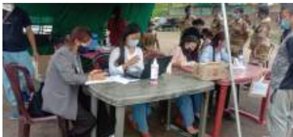
A special vaccination was organised by the Longleng Health & Family Welfare Department in collaboration with the Longleng District Task Force on 24 th June 2021 at Public Ground, Longleng.

A special vaccination drive for shopkeepers, helpers, drivers, coolies and their family members was organised by the Longleng Health & Family Welfare (H&FW) Department in collaboration with the Longleng District Task Force (DTF) on 24 th June 2021 at Public Ground, Longleng.