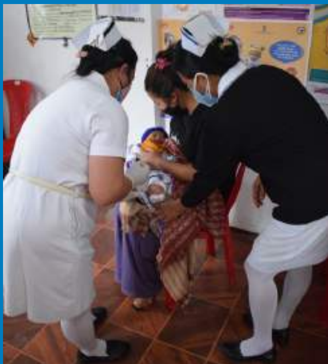
A child being vaccinated with Pneumococcal Conjugate Vaccine during the launch of the vaccine at Dr. Motsuo Memorial District Hospital, Wokha on 11 th June 2021.