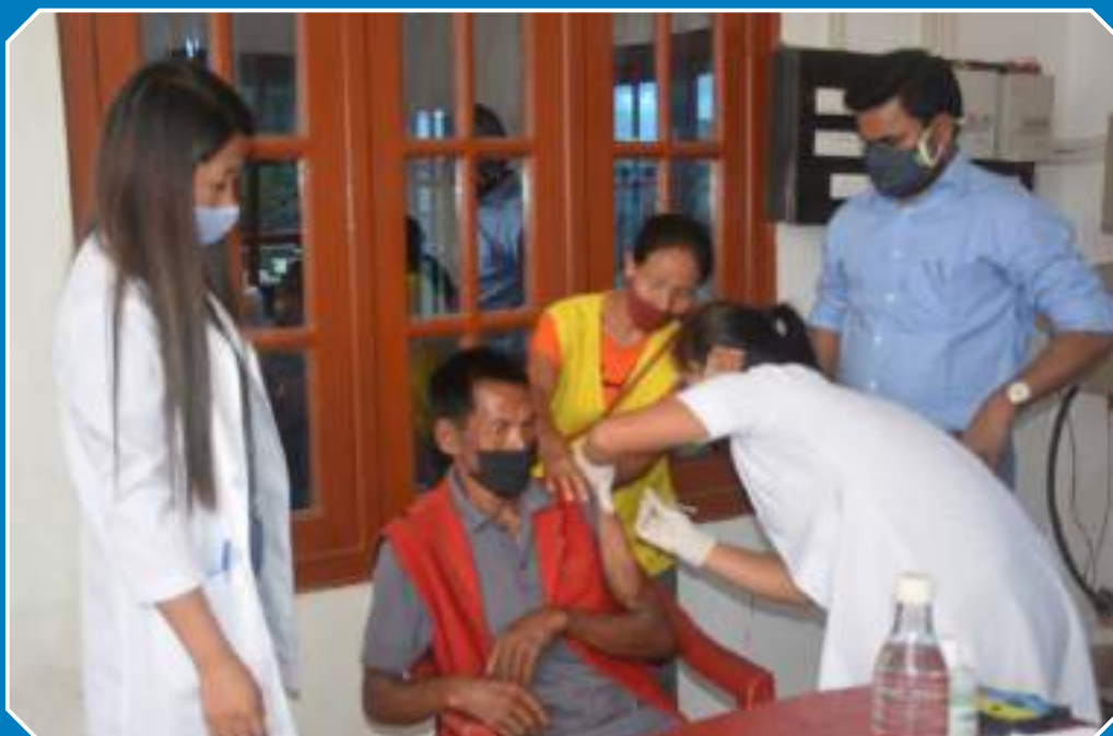
Additional Deputy Commissioner, Tuensang, Ajit Kumar Verma, IAS inspecting the vaccination drive undertaken at Yali village, Tuensang on 13 th June 2021. Yali village came forward to vaccinate all its eligible citizens with the COVID-19 vaccine.