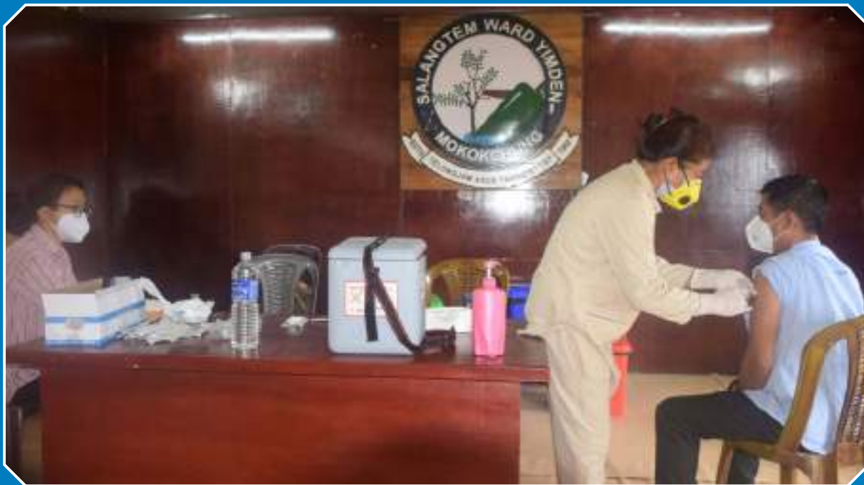
A man getting vaccinated during a special vaccination drive for 45 years & above and for Persons with Disabilities (18 years & above), which was launched at CMO Office, Mokochung on 16 th June 2021.