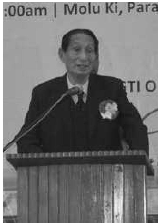
Former Governor of Maharashtra, Goa and Odisha and 5 times Chief Minister of Nagaland, Dr. S.C. Jamir speaking at the Ao Kaketshir Telongjem Kohima Students' Day Celebration at Molu Ki, Kohima on 2 nd October 2019.

Therefore, he called upon the student community not to dwell on past glories but focus on the future to build our state with a righteous mind. Jamir encouraged the students that they should stand on the truth as the older generations have failed to do so. He also said that they need to change their mindset as the Look East Policy is focusing for new market