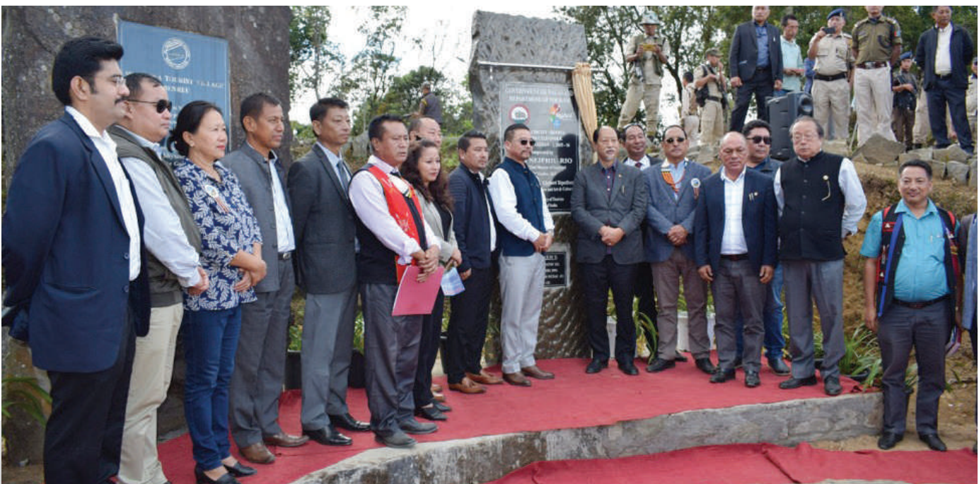
Chief Minister Nagaland, Neiphiu Rio and other dignitaries at the inaugural programme of Tourist Log Hut at Mt. Pauna Tourist Village Benreu, Peren on 31 st October 2019.