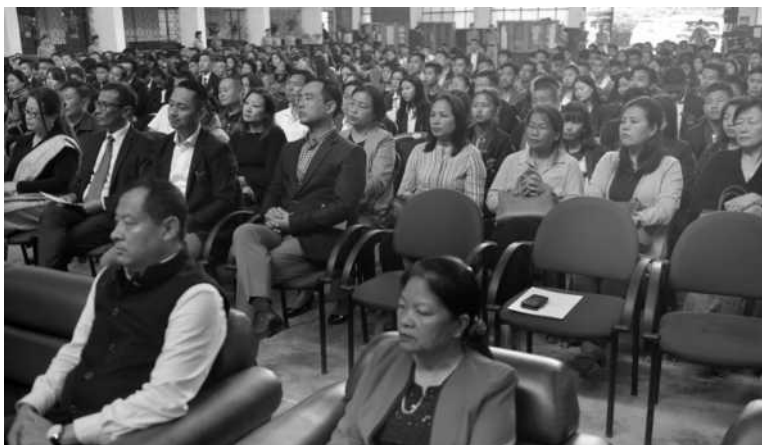
Nagaland Governor, R.N. Ravi launching Jal Shakti Campus & Jal Shakti Gram and Swachh Campus at Kohima College, Kohima on 2 nd October 2019.

on the campuses and in the villages with which the campuses are engaged with in National Service Scheme (NSS), Swachhta Action Plan (SAP) and Unnat Bharat Abhiyan (UBA). Manuals contain Standard Operating Procedures for supporting the task of promoting cleanliness on the campus and promoting a culture of taking responsibility to keep the campus clean through continuous monitoring and practice and to develop a model water conservation plan, water conservation procedures and practices reflecting local water resource needs and water quality as well as quantity in campuses and in villages.