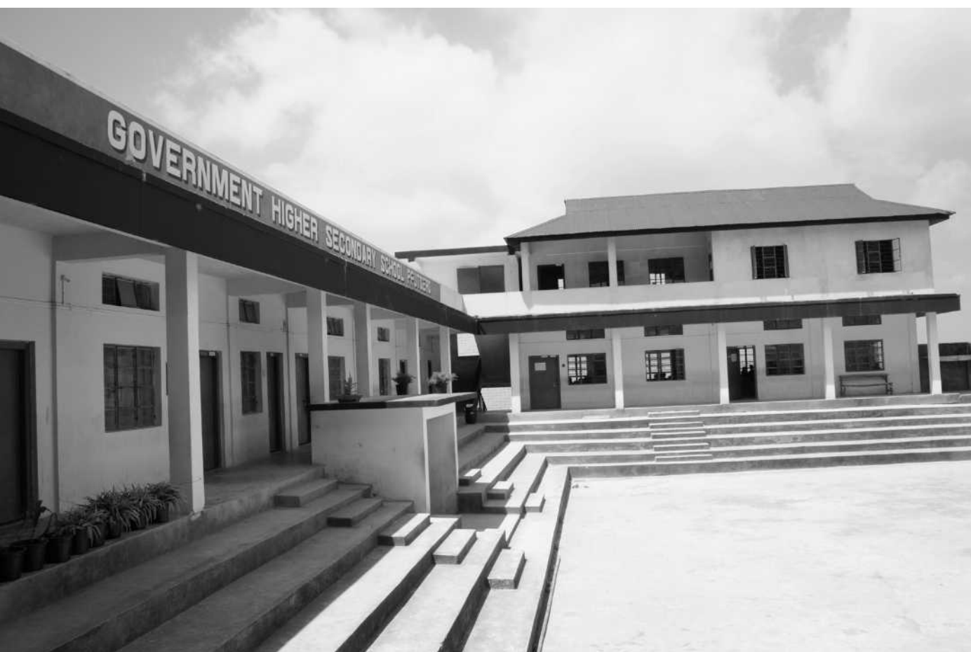
Government Higher Secondary School, Pfutsero