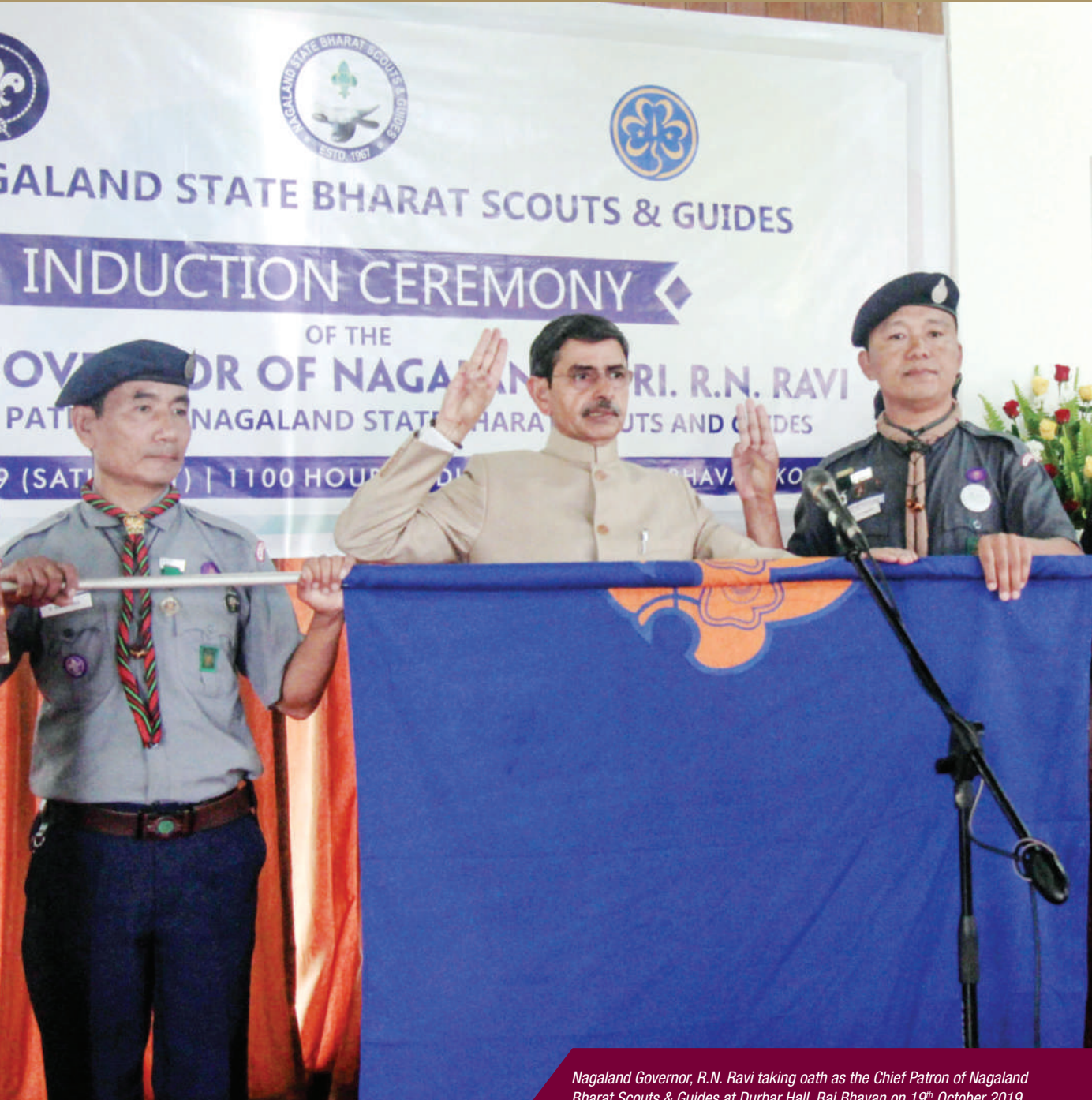
Nagaland Governor, R.N. Ravi taking oath as the Chief Patron of Nagaland Bharat Scouts & Guides at Durbar Hall, Raj Bhavan on 19 th October 2019.