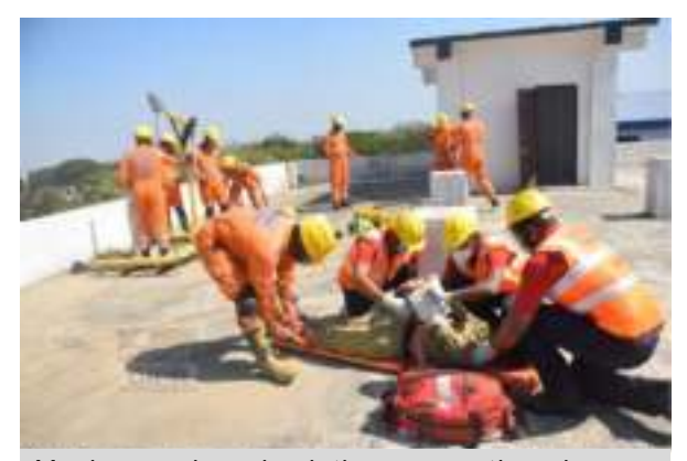
Mock exercise simulating an earthquake was conducted at Dimapur on 15<sup>th</sup> February 2022.

The programme was organized by District Disaster Management Authority, Dimapur in collaboration with Nagaland State Disaster Management Authority, National Disaster Response Force, and State Disaster Response Force.