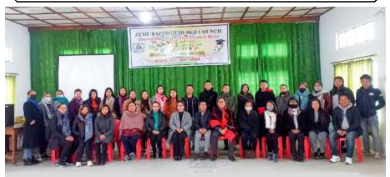
Teachers and resource persons during the two-day teachers' training conducted at Peren on 28<sup>th</sup> and 29<sup>th</sup> January 2022.

TEACHERS' TRAINING CONDUCTED BY ZEME BAPTIST CHURCH COUNCIL, PEREN