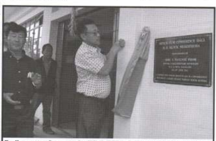
Parliamentary Secretary for RD & REPA, S. Pangnyu Phom inaugurating the office building cum Conference Hall of RD Block Medziphema on 29th june 2012.

Parliamentary Secretary RD & REPA, S. Pangnyu Phom inaugu-