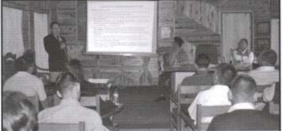
Toshitsungba, IPS, DIG (Range/NAP) Kohima giving a power point presentation during the seminar cum worshop on community policing held at DC's Conference Hall Phek 0n 6th June 2012.

Ceminar Ocum workshop on community policing organized by DEF Zunheboto and 8th NAP, Naltoga was held on 7th June 2012 at town Zunhehall boto. The pro-