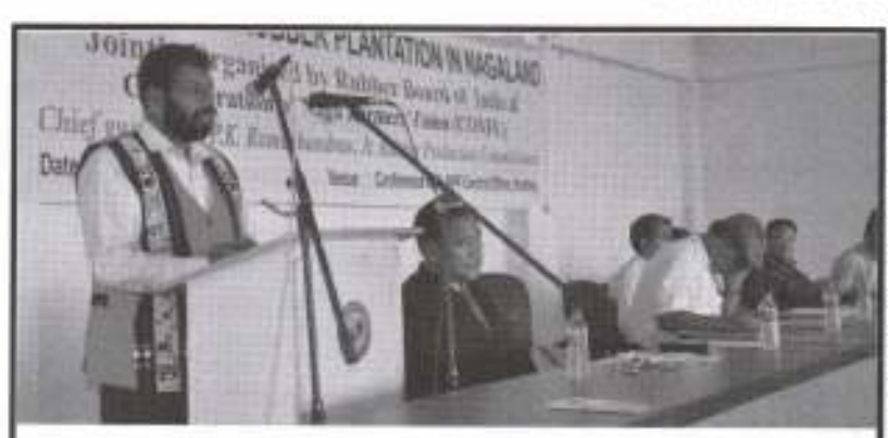
Chief Guest Joint Rubber Production Commissioner P.K. Ramachandran speaking at the awareness programme on Rubber Plantation in Nagaland Kohima on 14th June 2012.

Awareness programme on Rubber Plantation in Nagaland, jointly organised by the Rubber Board of India and Confederation of Nagaland Farmers Union (CONFU) was held on 14th June 2012 at Conference Hall of NPF Central office Kohima with Joint Rubber Production Commissioner, P.K. Ramachandran as the chief guest.