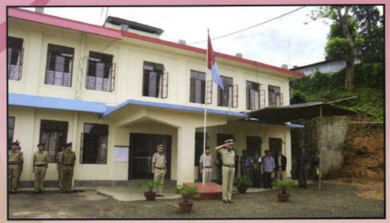
DGP Nagaland O. Alem IPS receives Guard of Honour at the inaugural function of SP (NPTO) New Office building, Mokokchung on 21st June 2012.