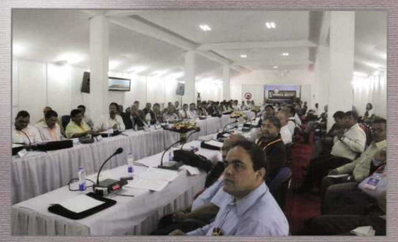
Indian Road Congress 197th mid term Council Meeting at NBCC Convention Centre, Kohima on 1st June 2012.