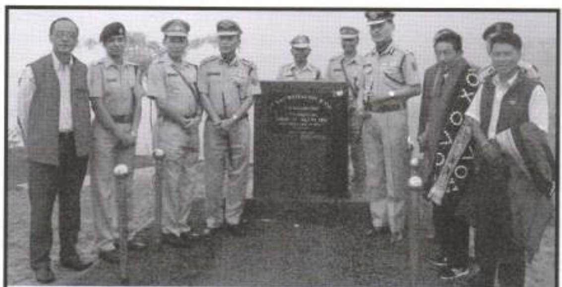
DGP Nagaland, O Alem, IPS poses with senior Police officers and Village Council Chairmen of Mangmetong, Longkhum and Setsu Village at the inauguration of 'D' Coy Hq, 2nd NAP near Mangmetong village on 22nd June 2012.

Addressing police officers and jawans after inaugurating 'D' Compa-