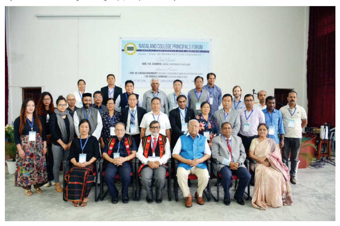
Governor, P. B. Acharya with Principals of various colleges in Nagaland during the Annual Conference-cum-Seminar of the Nagaland College Principals Forum (NCPF) at Sazolie College, Jotsoma on 13<sup>th</sup> July 2018.