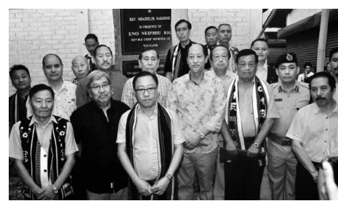
CM, Neiphiu Rio with Ministers, Advisors and other officials at the dedication programme of the Tenyimia Market Complex in Dimapur on 21st July 2018.

Other highlights of the programme included cultural dance by Rongmei Hoho Dimapur, folk song by Western Chakhesang Hoho, special number by