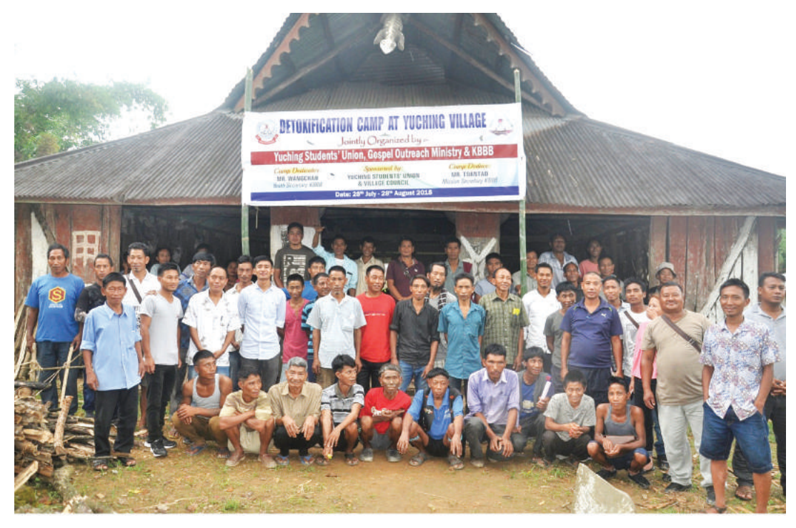
One month detoxification camp at Yuching village under Mon district started on 28th July 2018.