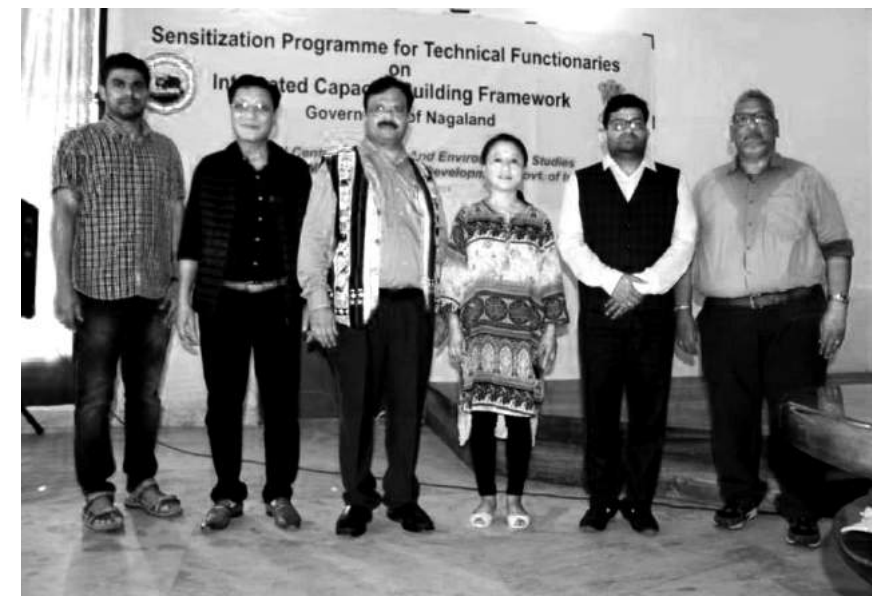
Ministry of Urban Development, Gol conducted a sensitization programme at the Directorate of Urban Development, Kohima, from 4<sup>th</sup> to 6<sup>th</sup> July 2018.

On the second day i.e. 5<sup>th</sup> July 2018, an overview of DAY- NULM, Social Mobilization and Institution Development(SM&ID): Improving livelihood, employment through skill training and placement, self employment programme, support to street vendors and MIS overview on SEP and EST&P and overview of