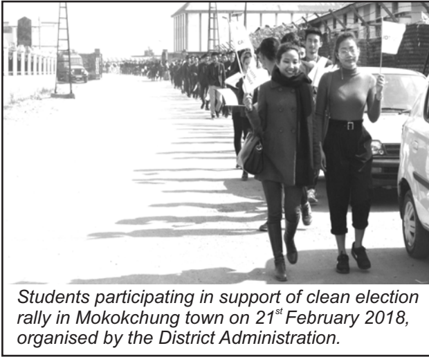
Students participating in support of clean election rally in Mokokchung town on 21 st February 2018, organised by the District Administration.

credible and corruption free election through active participation of students in the election process, organised by the District Administration.