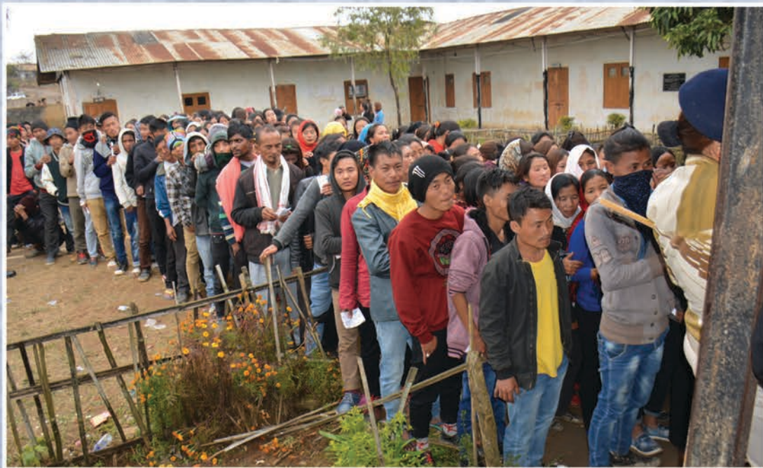
Voters lined up to cast their votes at Kiphire on polling day (27 th February 2018)