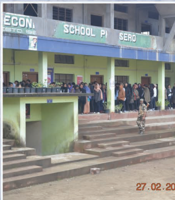
Pic 1: Voters lined up at St.John School Sector A, Tuensang on polling day (27 th February 2018)