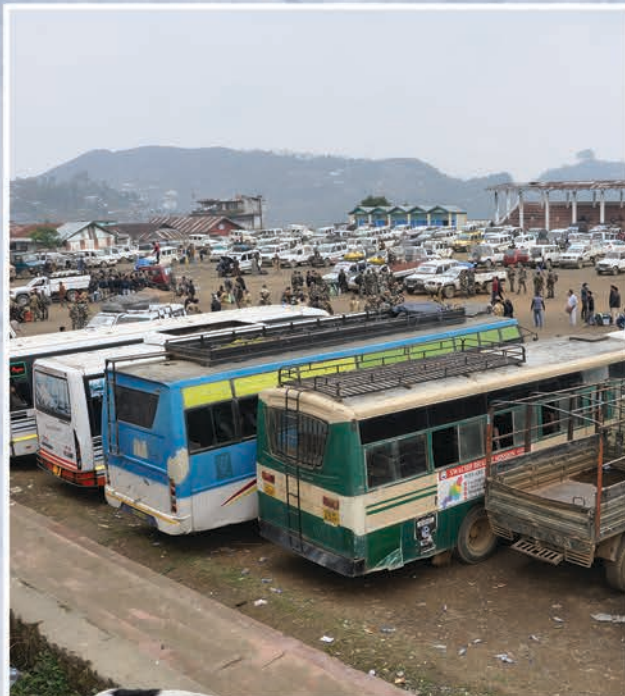
Pic 1: Vehicles requisitioned for polling at Longleng.