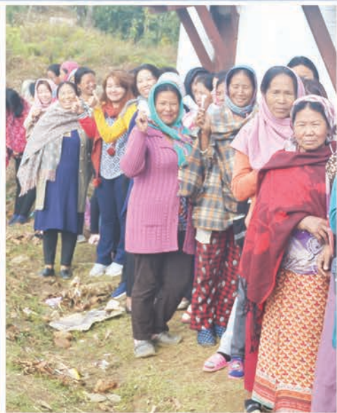
Pic 2: Women voters in the queue line to franchise their votes at Mishilimi 'Y' under Zunheboto district on 27 th February 2018.