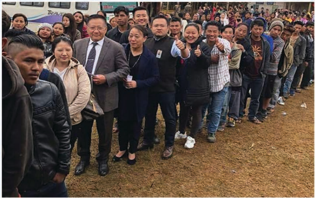
Chief Minister, Nagaland, T. R. Zeliang with his family standing in queue to cast their votes at Jalukie on 27 th February 2018.