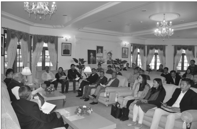
Governor of Nagaland, P. B. Acharya holding a meeting with various bank officials from Kohima and Dimapur at Raj Bhavan, Kohima on 9 th February 2018