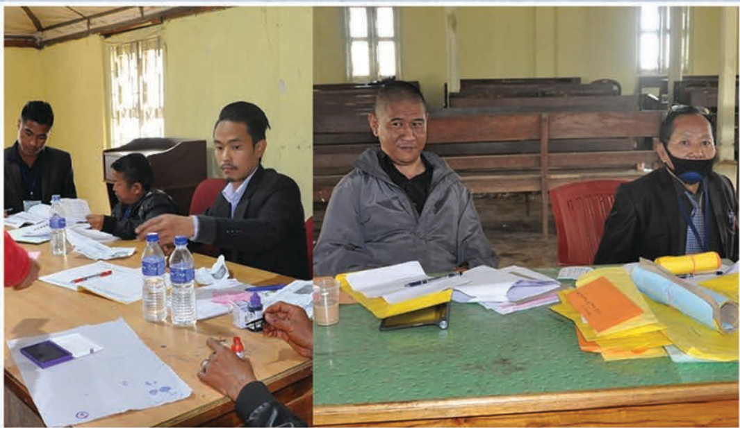
Differently abled polling officials on election duty at Wokha on 27 th February 2018.