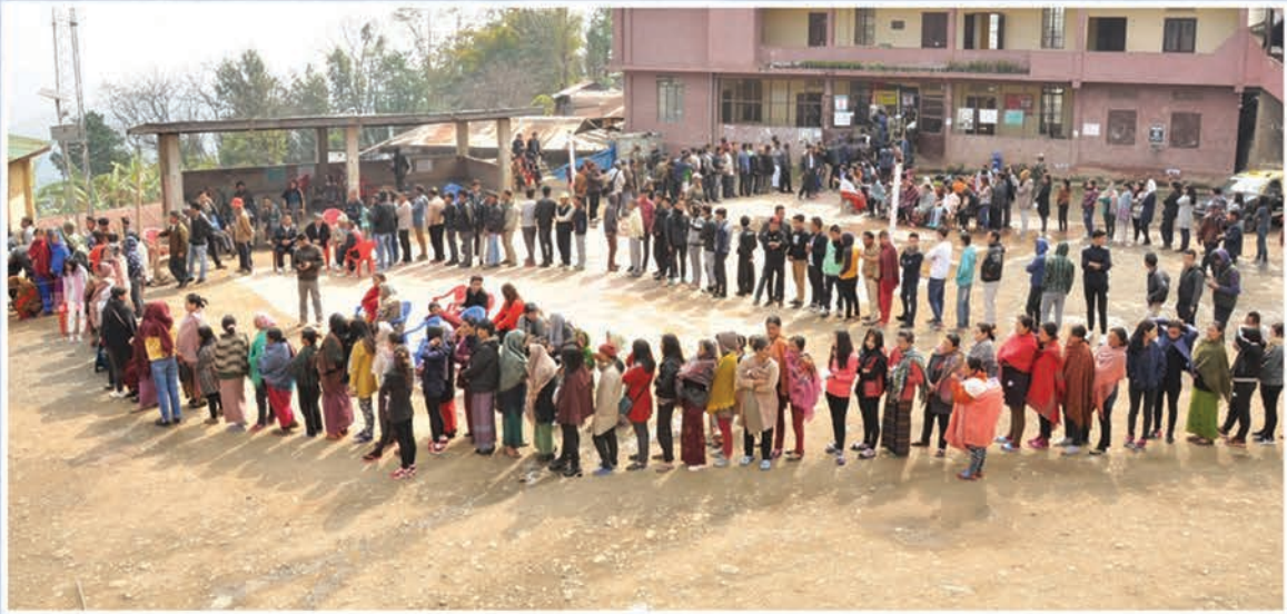
Voters queuing up to cast their votes at Phesama, Kohima district on polling day (27 th February 2018)