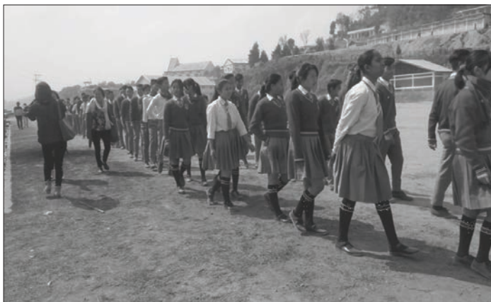
School children of Peren taking part at the clean election campaign march on 19 th February 2018 at Peren Town.

said the walk will bring changes to the general election and thanked the school children, government officials, church leaders and others for participating in the walk. Theme music on clean election was played during the Walkathon with the banner reading 'Clean election is our priority.'