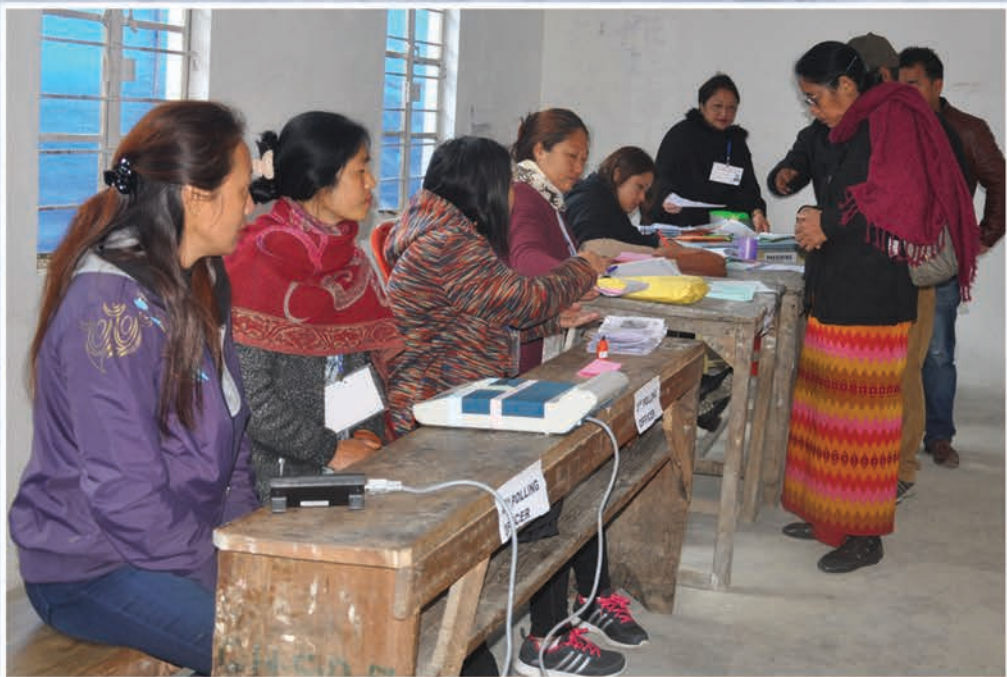
An all women manned polling station (Dillong Ward Polling Booth-II), in Mokokchung town during polling day (27 th February 2018). The polling station falls under 26 Aolendeng Assembly Constituency.