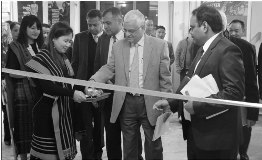
Chief Election Commissioner, O. P. Rawat inaugurating the SVEEP photo exhibition on 14 th February 2018 at Hotel Japfü, Kohima.

To ensure free and fair elections, web-casting will be done in all those sensitive polling stations where internet connection is feasible and rest will be covered by videography by fixed cameras and micro observers, the CEC stated. Providing the figures for the aforementioned, he said webcasting will be done at 555 polling stations, videography at 1601 polling stations and Micro Observers at 1010 polling stations.