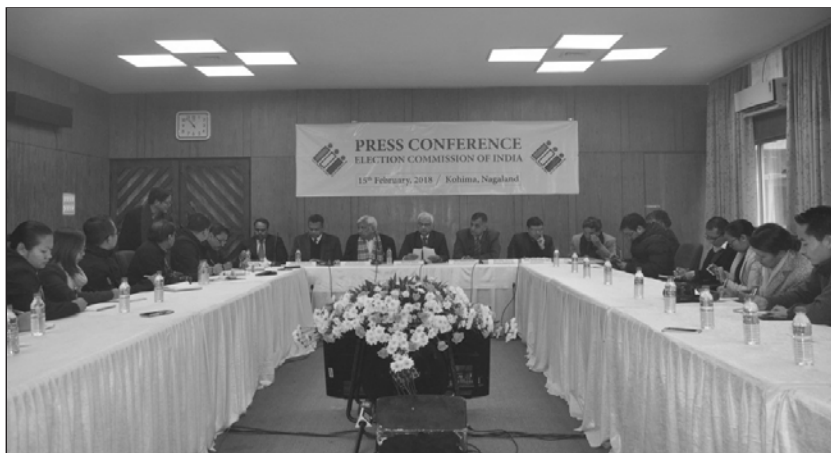
The ECI held a press conference at Hotel Japfü, Kohima on 15 th February 2018.

operationalized to check movement of cash liquor, drugs and other freebies in Nagaland. The vehicles used by flying squads has been fitted with GPS to track their movement and prompt action. 29 check posts of Excise Department has been working in the State to check the movement of liquor. Movement of money through banking channels is monitored and fool-proof arrangements