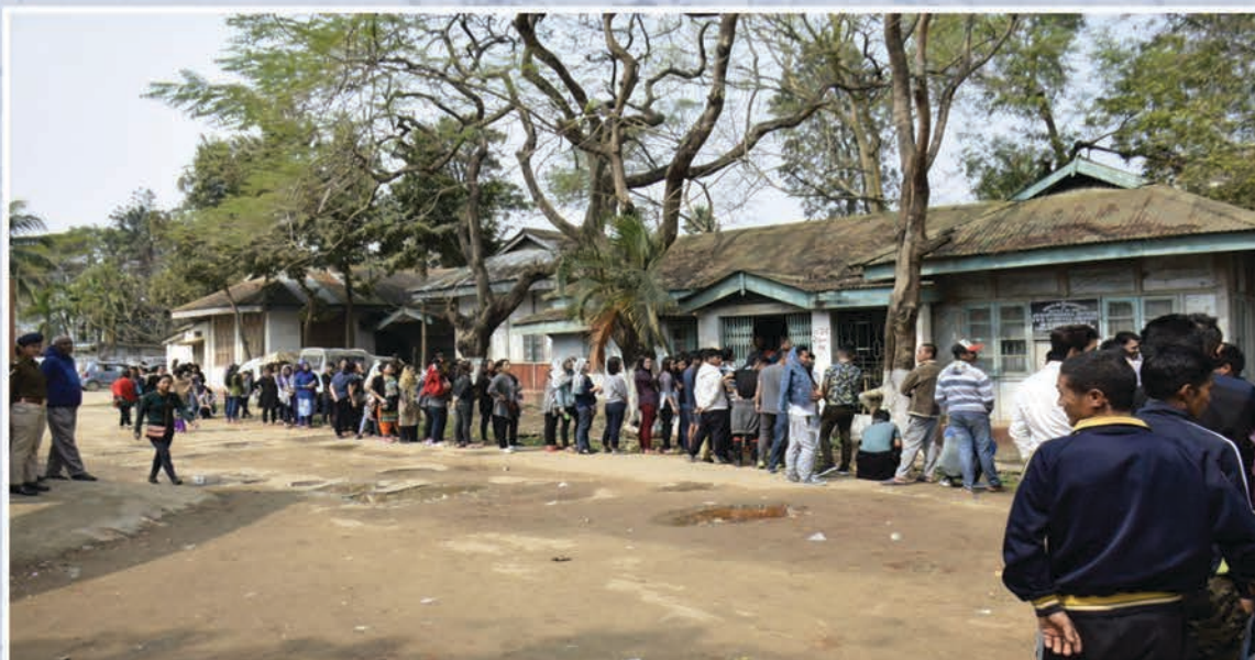
Voters queuing up to cast their votes at Dimapur on polling day (27 th February 2018)