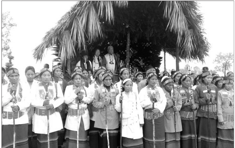
Governor of Nagaland, P. B. Acharya gracing the 15 th Session Pongvin Mozu Moyong (Festival) of Minority Indigenous Community as the Chief Guest at Mount Langshai campus, near Wangti village under Mon district on 1 st February 2018.

Calling it a historic day, the Governor congratulated the department and those involved in the publishing of the text books which aims to include study of the rich Naga culture and heritage into the formal system of education. He said that we are losing the legacy of our heritage not only in Nagaland but all over the country and described the Nagaland Heritage Studies Text Books as the