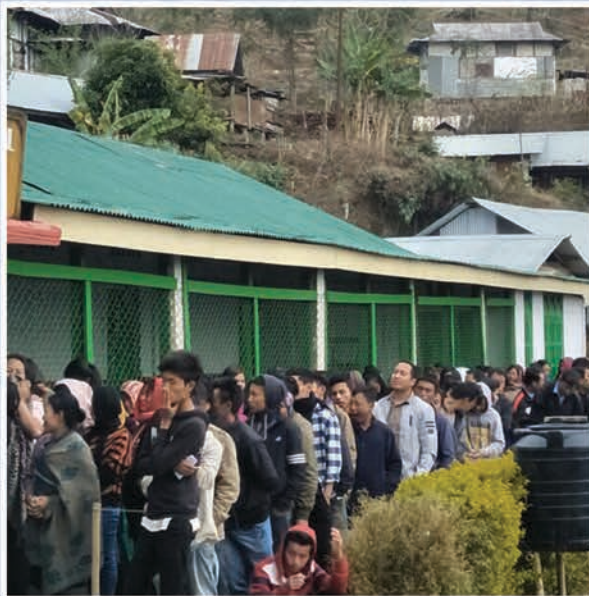
Pic 1: Polling in progress at Tseminyu, Kohima district on 27 th February 2018.