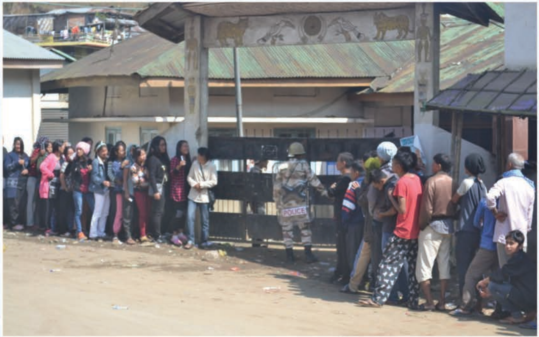
Polling underway at Mon on 27 th February 2018.