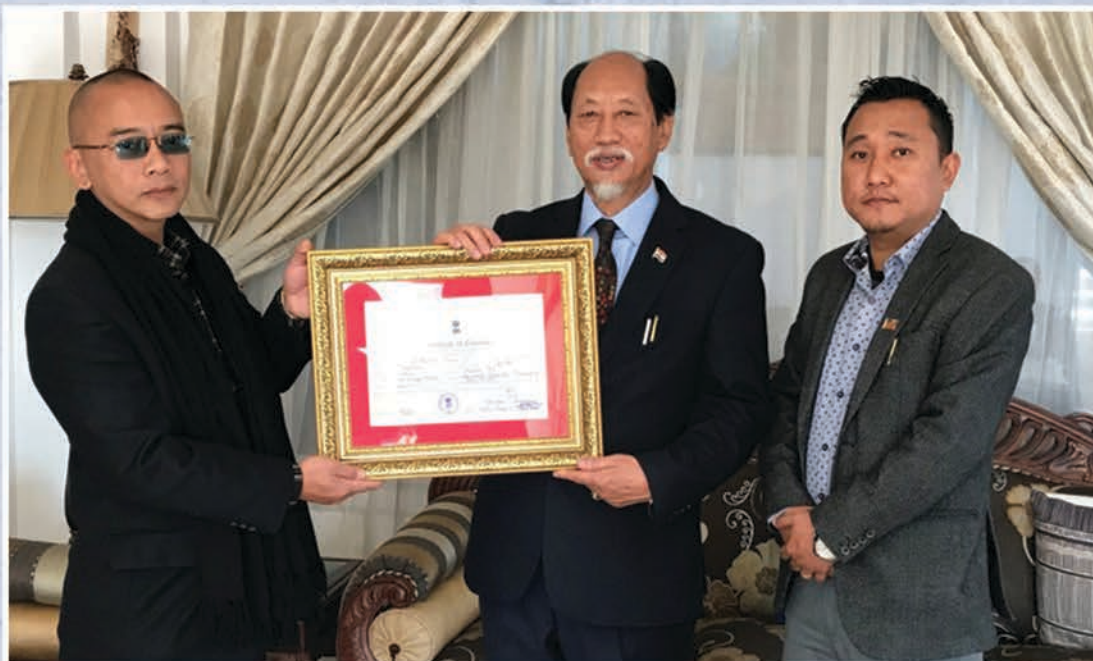
Neiphiu Rio, NDPP candidate from 11 Northern Angami II Assembly Constituency receiving the Certificate of Election from the Returning Officer and ADC, Chiaphobozou on 17 th February 2018. Neiphiu Rio was declared uncontested.