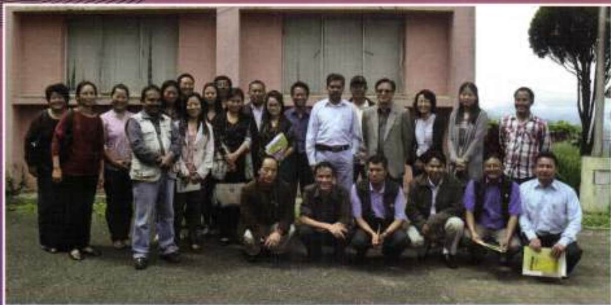
IPR officials with officers of DDK Kohima during their field visit to the DDK at Jotsoma Kohima on 25th July 2012.