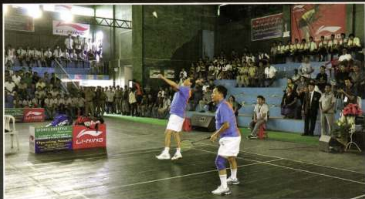
State Chief Minister Neiphiu Rio and K. Kire IPS (Rtd.) in action during the exhibition match between Dimapur and Kohima districts on 17th July 2012.