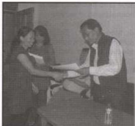
DC Kohima Bei-u Angami giving away certificates during the e-Literacy training programme at VC Studio, DC's office Kohima on 27th July 2012.

Deputy Commissioner, Kohima, Bei-u Angami on 27th July 2012 exhorted the participants of the training on e-Literacy Programme conducted at National Informatics Centre,