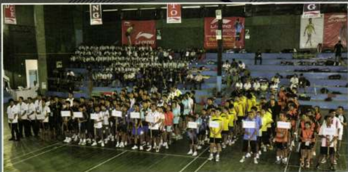
Players from 11 districts and Nagaland Police team at the 36th Inter District & State Open Badminton Championship at Dimapur.

Published by: The Directorate of Information & Public Relations, IPR Citadel, New Capital Complex, Kohima : Nagaland