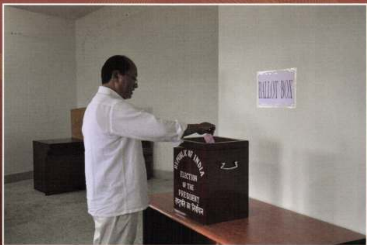
Chief Minister of Nagaland Neiphiu Rio casting his vote during the India Presidential Election at Nagaland Assembly Secretariat Kohima on 19th July 2012.