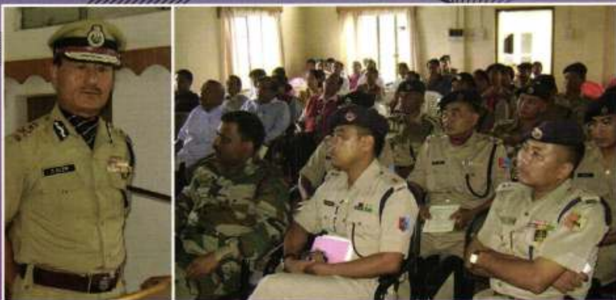
DGP Nagaland O. Alem IPS addressing the gathering during the seminar cum workshop on community policing at DC's Conference Hall, Wokha on 30th June 2012.