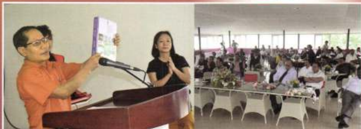
Chief Secretary Lalthara IAS releasing a book on Housing Tables, Census 2011 during the census 2011 book release function at Kohima on 6th July 2012.