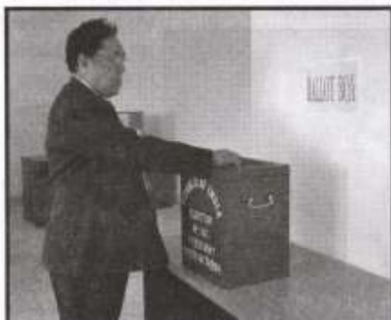
Nagaland Legislative Assembly Speaker, Kiyaniilie casting his vote during the Presidential Election of India on 19th July 2012.

He emphasised on the urgent need for a coordinated effort of all the agencies and organisations to reach out to rural masses at the village levels. The action plan of awareness creation by production and translation into local dialects, broadcasting by AIR, screening by IEC teams and IPR, health camps by composite teams at villages etc were discussed for implementation by August 2012 on a routine schedule.