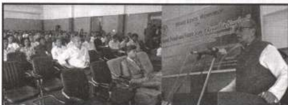
Nagaland Governor Nikhil Kumar speaking at the two day State level Workshop on Present Trends and Future Scope of Research in Nagaland at NIELIT Auditorium on 5th July 2012.

sources and appealed the young Naga scientists and researchers to study on how to substitute this. Stating that 70% of Naga population are