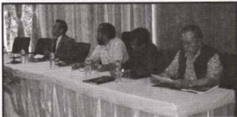
(L) Minister for Planning & Coordination, Vety & A.H, T.R. Zeliang speaking at the Consultative Meet on Petroleum & Natural Gas at Kohima on 13th July 2012.

A consultative meeting of the Cabinet sub-committee on Petroleum and Natural Gas with Tribal Hohos and civil societies of Nagaland, hosted by Cabinet Sub-Committee (CSC) was held at Kohima on 13th July 2012.