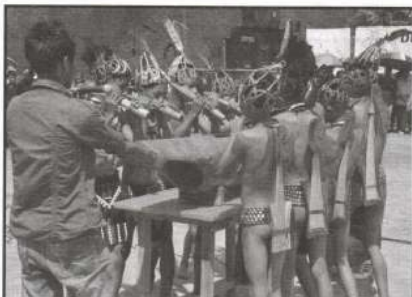
Young boys beating the traditional log drum during the celebration of Nakyulum festival cum Youth Expo at Tuensang on 30th July 2012.

Phom as the guest of honour talked about peace and said that without peace no development will progress in the land and called upon the people to work hand in hand to bring progress in the society. Parliamentary Secretary for IPR, Economics & Statistics, R. Tohanba who also spoke on the occasion called upon the youth to regenerate the traditional prac-