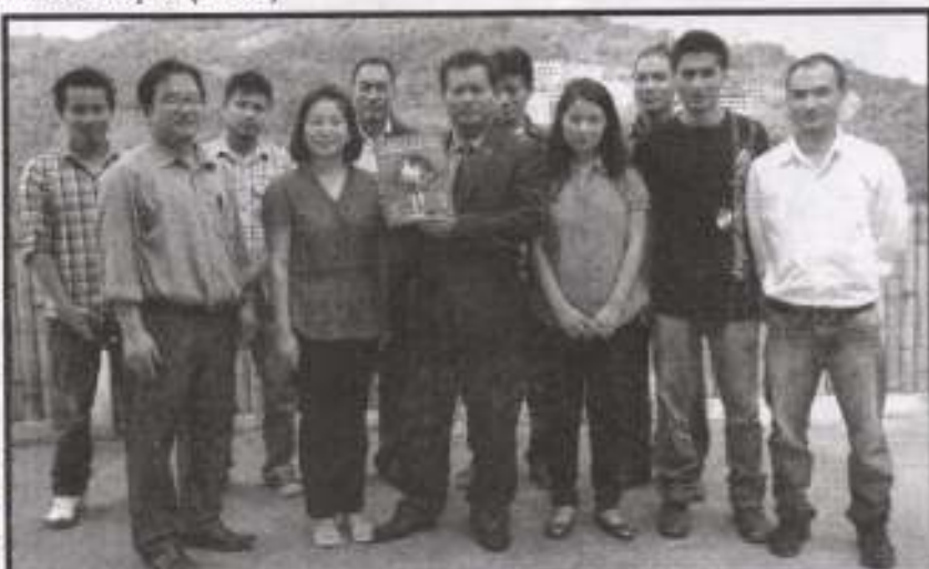
Additional Developmental Commissioner Nagaland Temsuwati (c) with student leaders releasing the Annual Magazine 'SHISAYIN' published by Longkhum Students Union at Kohima on 26th July 2012.

The Additional Development Commissioner of Nagaland, Temsuwati has formally released the Annual Magazine 'SHISAYIN' published by the Longkhum Students Union in the pres-