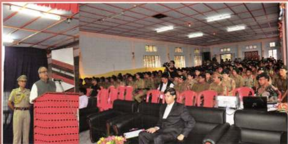
Nagaland Governor Nikhil Kumar addressing the cadets at the Special National Integration Camp on 6th July 2012 at St. Joseph College Jakhama.