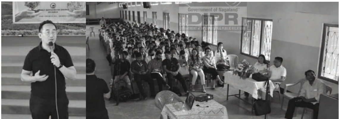
Scientist 'B' Nagaland Pollution Control Board, Yanathung Kithan addressing at the National Air Clean Programme held at Conference Hall, Don Bosco School, Dimapur on 10 th April 2023.

a PowerPoint where he highlighted various sources of air pollution and its effects on people. He mentioned that under the National Air Monitoring Programme, Nagaland has 11 manual monitoring stations and one (1) CAAQMS station – seven (7) manual stations at Dimapur in Bank Colony, NPCB Office, Viola Colony, Tenyiphe-II Chümoukedima, Burma Camp,