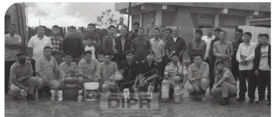
Fire & Emergency Services Tuensang along with the participants during Mock Drill at Tuensang village on 23 rd April 2023.