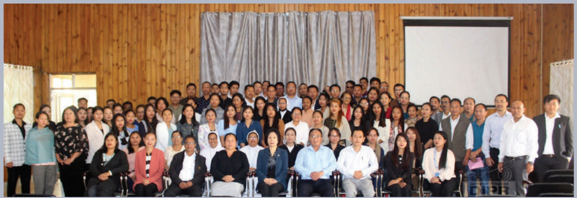
A meeting with new heads of institutions was organized by Nagaland Board of School Education at Platinum Hall, NBCC, Kohima on 28 th April 2023.