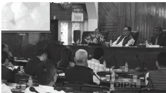
Deputy Chief Minister, Planning & Transformation, T.R. Zeliang speaking at the meeting of officers of P&T Department at Secretariat Conference Hall, Kohima on 12 th April 2023.

was necessitated due to the many changes that have come about in the development and planning domain during the past years. He said, 'With the change of Coordination to Transformation, I am hopeful that each one of us will re-orient ourselves and act on our respective responsibilities to transform not only in the Department but the State in general.'