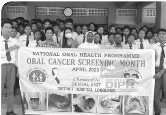
An awareness programme on the "Ill effects of tobacco" was held at St. Joseph School Longleng on 12 th April 2023.