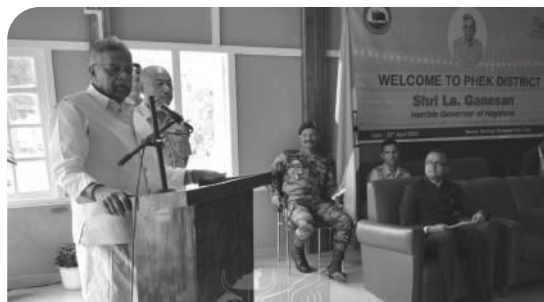
Governor La. Ganesan held an interaction meeting with the CSOs and HoDs of Phek district at Heritage Banquet Hall, DC's Residence on 20 th April 2023.

The Governor mentioned that Phek district has achieved the two most successful community based programmes in the State such as the Village Development