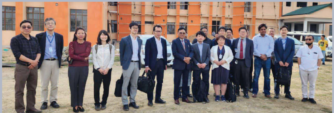
Officials from the Health & Family Welfare Department with the Japan International Cooperation Agency team, during their visit to the site of Nagaland Institute of Medical Sciences and Research, Kohima on 26 th April 2023.