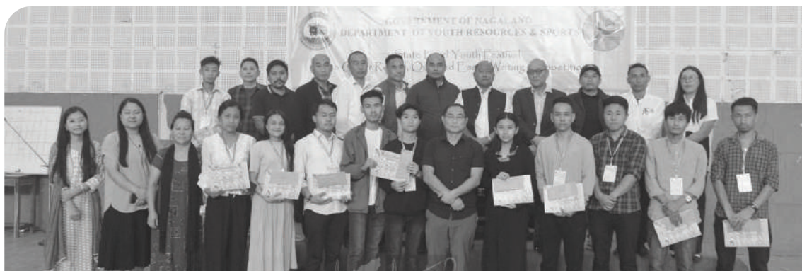
State Level Youth Festival in Guitar Recital, Quiz and Essay Writing competition was held at Indira Gandhi Stadium, Kohima on 21 st April 2023.