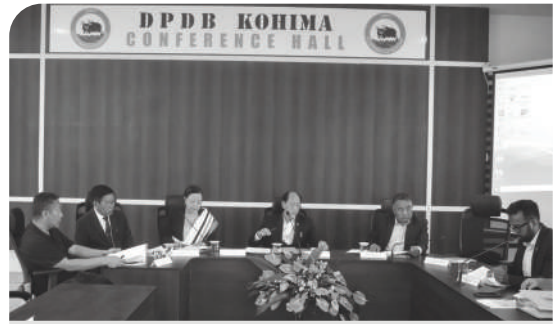
Kohima DPDB felicitated the newly elected legislators of Kohima district during the DPDB meeting held on 15 th April 2023.

that the Government tried its best to bring more opportunities to the citizens, but many negative impacts and social unrest had been faced due to it, and therefore, not to face a similar situation like in 2017, the Government had repealed Nagaland Municipal Act 2001 in toto, and said that discussion with stakeholders will take place, where he hoped that concrete decisions will be made.