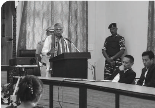
Governor, La. Ganesan interacting with Government officials and representatives from the civil societies at the DC's Conference Hall, Mokokchung on 13 th April 2023.

for the huge turnout of voters during the recently concluded General Election and maintained that there can be rule of law only with the active participation of the people. He reminded the people not to undermine the election process and the electorates if the society is to move forward.