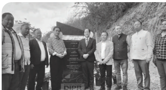
Chief Minister Neiphiu Rio and dignitaries during the Bailey Bridge inauguration at Zinki River, Kiphire on 28 th April 2023.

Representative for Longmatra Area GBs Association apprised on the need for upgradation of EAC to SDO Civil