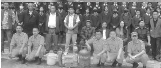
Fire & Emergency Services Pfutsero organized a demonstration programme on fire extinguishers at Sports Complex Ground Pfutsero on 18 th April 2023.

demonstration programme on fire extinguishers at Sports Complex Ground Pfutsero on 18 th April 2023. Hundreds of students from Nazareth School, Government Higher Secondary School and Baptist Mission School took part in the programme. The programme was attended by Town Council members, public leaders, dobashis, etc.