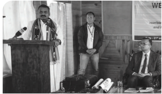
Union Minister of State, Dr. L. Murugan addressing the Heads of Offices and CSOs of Phek district during the interaction meeting at the DPDB Hall, Phek on 21 st April 2023.

an interaction meeting with the Heads of Offices and CSOs of Phek district at the DPDB Hall on 21 st April 2023. The Minister said the Central Government's vision is to develop the North East Region with railways and highway connectivity, communication network, and DTH connectivity, which is being undertaken in the State. He expressed happiness to the people of the district over the implementation of technology in fish farming and integrated farming and called upon the start-up companies and farmers to come forward to avail the facilities of PMMSY as it provides farmers with seeds, feeds, processing units, hygienic markets, cold storages, and National Livestock Mission schemes as it provides subsidies to farmers engaged in poultry, piggeries, integrated farming. He asked the officers to take up these schemes to the ground level to the farmers. He also informed that the Central Government has announced the allotment of Mobile Veterinary Vans for animal assistance to all the states since