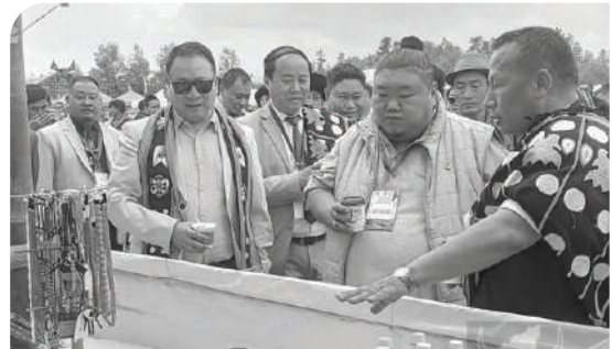
Minister of Higher Education and Tourism, Temjen Imna Along visiting stalls during Tsukhenyie festival in Pfutsero on 24 th April 2023.

Imna Along, in his speech, thanked the CPO and Pfutseromi village and said that Chakhesang people are regarded for their hospitality, honesty, and hard-working community. He said the Festival is a time to celebrate and enjoy and called upon the people present to learn about the culture and take back the sweet memories to their respective places and states.