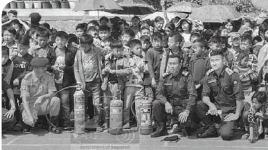
Fire Station, Khuzama observed National Fire Service week at Sacred Heart High School, Khuzama on 14 th April 2023.

and safety, rescue technique bandages and operation of fire extinguishers. He advised the public not to panic during fire incidents but to inform the fire station immediately.