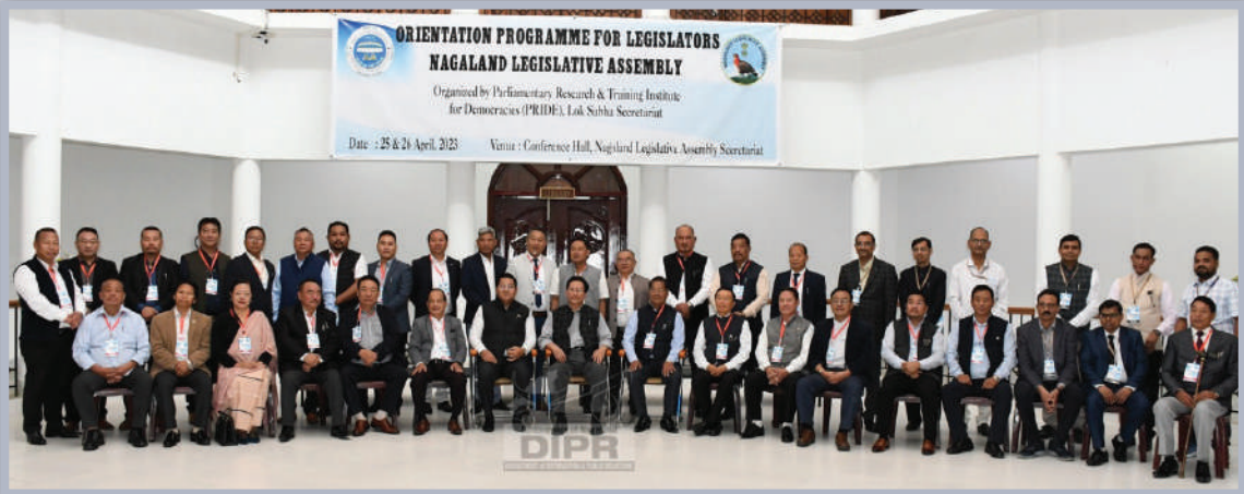
Legislators of Nagaland Legislative Assembly during the two-day orientation programme for legislators held at Conference Hall, NLA Secretariat, Kohima on 26 th April 2023.