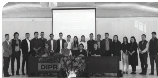
NCS (P) 2023 batch with the resource person and other officials at ATI, Kohima on 11 th April 2023.

The inaugural function of the six weeks special induction training for NCS (P) 2023 batch was held at Administrative Training Institute, Kohima on 11 th April