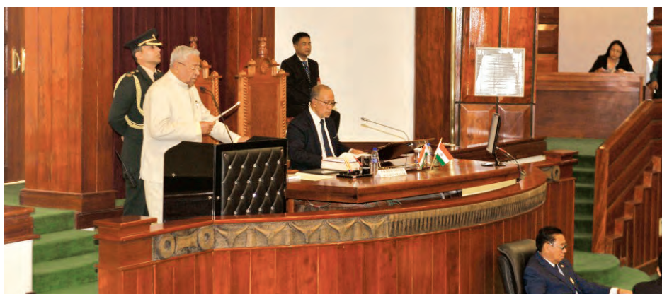
Governor of Nagaland, P. B. Acharya addressing the First Session of the 13 th Nagaland Legislative Assembly on 22 nd March 2018.