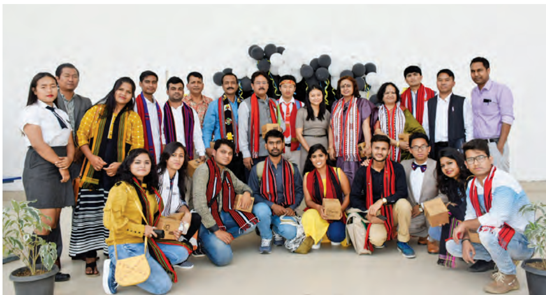
Ek Bharat Shreshtha Bharat Team from Madhya Pradesh along with students and teachers of Tetso College, Dimapur during the farewell-cum-interaction cultural exchange programme at Tetso College, Dimapur on 20 th March 2018