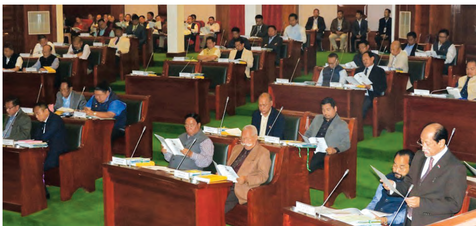
Chief Minister and Minister in-charge of Finance, Neiphiu Rio presenting the budget for the Financial Year 2018-2019 during the session of the 13 th Nagaland Legislative Assembly on 23 rd March 2018.