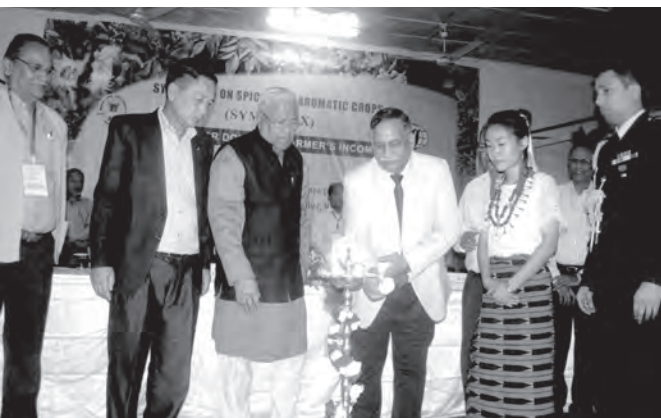
Governor, P.B. Acharya inaugurating the three day Symposium on Spices and Aromatic Crops at SASRD auditorium, Medziphema on 15 th March 2018.