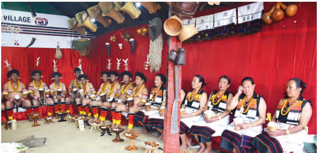
Commemorating Peli No. 11 Golden Jubilee celebration and Sekrenyi festival, a two day celebration hosted by Peli No. 11, P. Khel, Kohima village was held at Kohima village on 16 th & 17 th March 2018 under the theme 'Kiahe Rütso.'