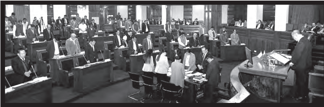
Members of the 13 th NLA observing two minutes silence to pay homage to the three departed former members of the NLA at the Nagaland Legislative Assembly, Kohima on 22 nd March 2018.