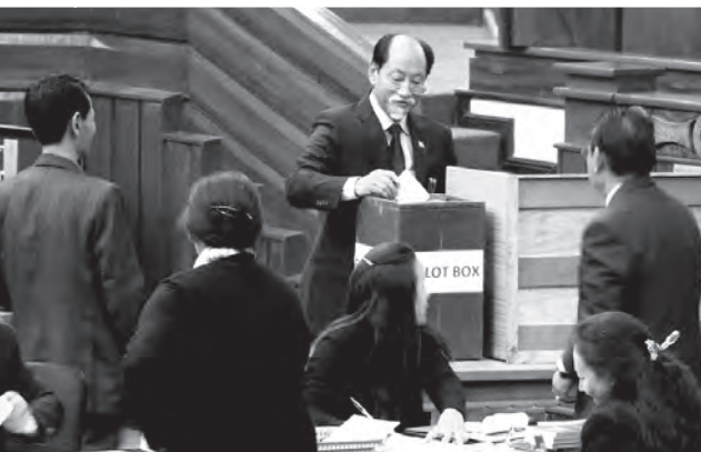
Chief Minister, Neiphiu Rio casting his ballot during the election of the Speaker for the 13 th NLA at NLA, Kohima on 13 th March 2018.