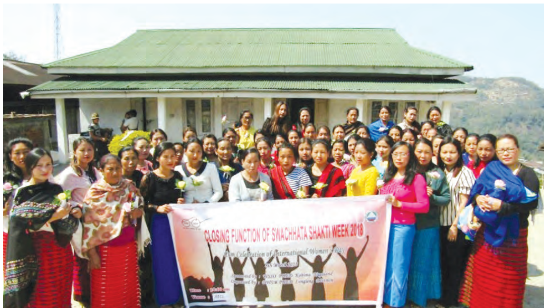
Women participants at Swachh Shakti Week-cum-celebration of International Women's Day 2018, at Longleng on 8 th March 2018.