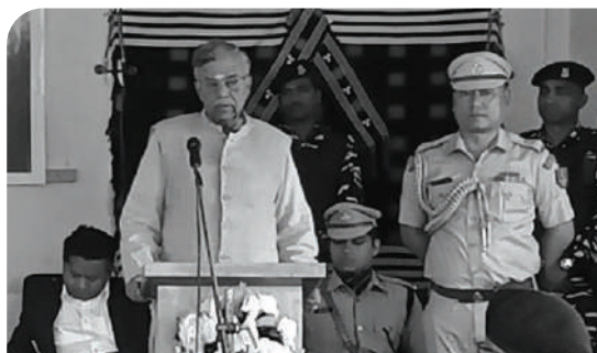
Governor of Nagaland, La. Ganesan addressing Government Officials and Civil Society Organizations at a meeting held at District DB's Customary Court during his visit to Shamator district on 10 th May 2023.

Addressing the gathering, the Governor said inspite of many challenges like financial implications, Shamator district was created for the people of Yimkhiung and Tikhir tribes to bring governance and administration closer to the people of Shamator for peace and development. He urged the two communities of Yimkhiung and Tikhir tribes to forget and forgive past issues and conflicts because peace is required for growth and progress of the society, and said that there should be equitable share in all the development