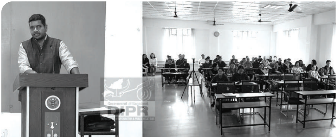
A one-month School Leadership Development Programme for Heads of Government Schools started at SIEMAT Hall, SCERT in Kohima on 2 nd May 2023.

project aims to train three batches of approximately 150 School Heads by June 2023. By the end of the project period in June 2026, the project aims to support SLA in training all the government school heads in the State.