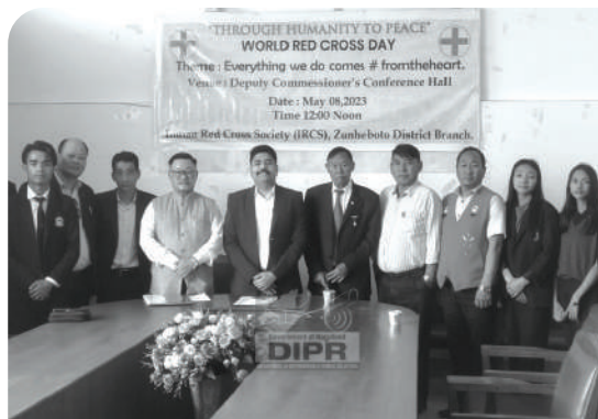
Indian Red Cross Society Zunheboto district branch celebrated World Red Cross Day at DC's Office on 8 th May 2023.

Indian Red Cross Society (IRCS) Zunheboto district branch celebrated World Red Cross Day under the theme,