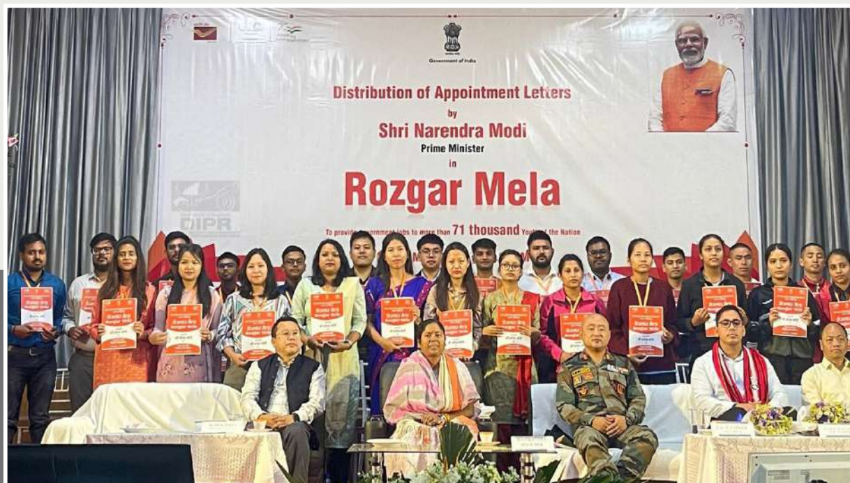
Minister of State for Social Justice and Empowerment, Pratima Bhoomik with officials and recipients of Appointment Letters during Rozgar Mela held at Dimapur on 16 th May 2023.