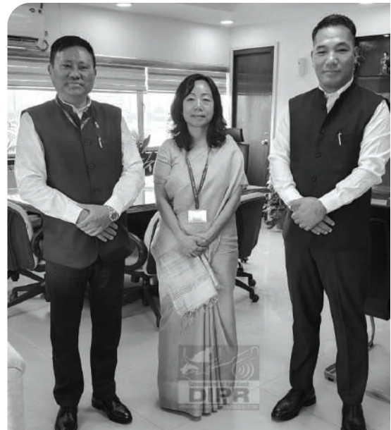
Minister P. Paiwang Konyak met V. Hekali Zhimomi, Additional Secretary and Director General, NACO MoH&FW in Delhi on 24 th May 2023.

Health System Strengthening Project (NHSSP) is mainly to fill the gaps in the infrastructures of the Health Centers, Quarters for health workers, etc. The desire of the State Government to provide affordable, accessible healthcare to its citizen cannot be fulfilled without good infrastructure facilities. Sema requested the World Bank to support the new project and stated that the partnership between the