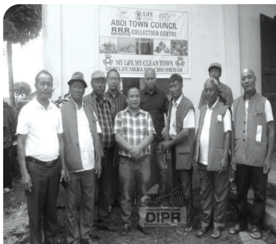
The Reduce, Reuse, and Recycle (RRR) Centre was inaugurated at Aboi on 20 th May 2023.

Reduce, Reuse, and Recycle (RRR) Centre was inaugurated at Aboi on 20 th May 2023. ADC and Administrator, Aboi Town