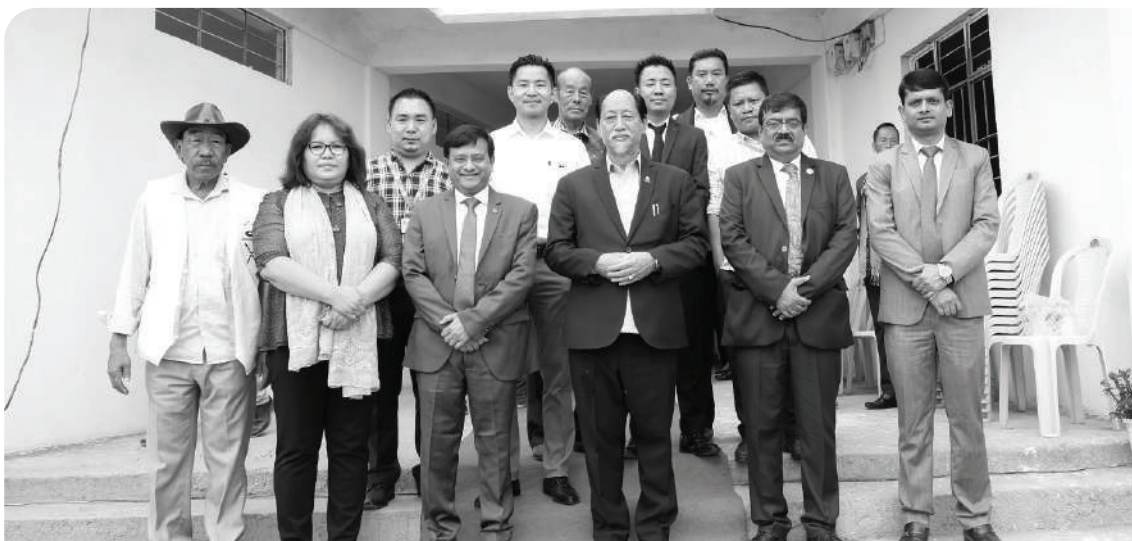
CM, Neiphiu Rio with other officials during the inauguration of Botsa Branch, Bank of Baroda on 13 th May 2023.

now 14 branches in the State and requested the Bank to reach all the blocks and extend their services to the needy people and also to extend the Chief Minister's programme for the benefit of the area people. Rio further called upon the villages to give full cooperation to the Bank and also assured to give support to the Bank from the