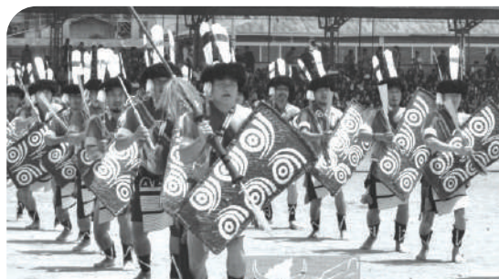
A cultural troupe presenting a folk dance during the Moatsu celebration at Imkongmeren Sports Complex, Mokokchung on 2 nd May 2023.

Rio maintained that impact of modernization can be felt in every walk of life and there is a need to preserve the unique identity through the traditional