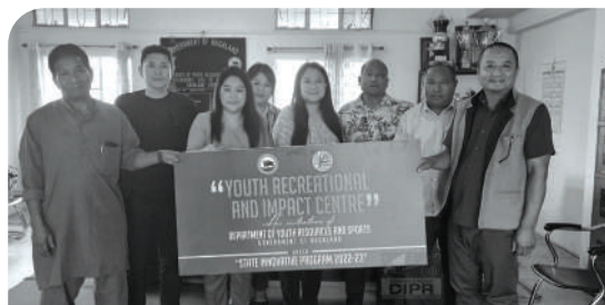
Director, Youth Resources & Sports with officials during the launch of 'Youth Recreational and Impact Centre' under the State Innovative Programme at Kohima on 22 nd May 2023.

With a well-run community center, it can serve as a thriving hub of activities