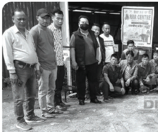
Longleng Town Council organized a launching event of RRR, (Reduce, Reuse, Recycle) Centre at the Longleng Town Council Office premises on 20 th May 2023.

Longleng Town Council organized a launching event of Reduce, Reuse, Recycle