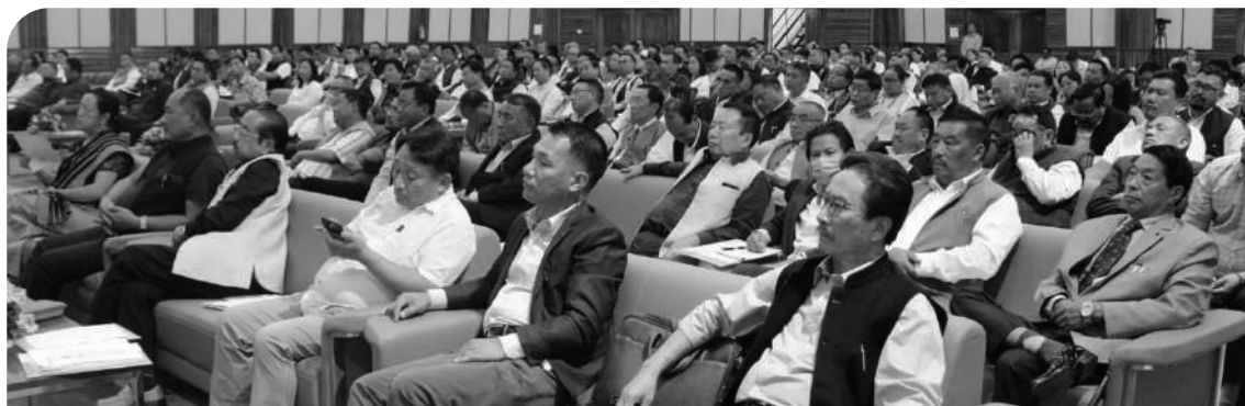
A consultative meeting with Tribal Hohos and CSOs was held at the State Banquet Hall, CMRC, Kohima on 9 th May 2023.

to Oil and Gas Exploration and Production, Registration of Indigenous Inhabitants of Nagaland (RIIN) and the Nagaland Village and Tribal Councils Act, 1978. They said that the Government welcome the constructive opinions and suggestions of the people pertaining to the matters stated above. They further explained in detail various issues surrounding the early implementation of RIIN and also informed on the stand of the Government with regard to oil and gas exploration and production in the Disturbed Area Belt (DAB), and further reassured that no Memorandum of Understanding has so far been signed with any agency or State