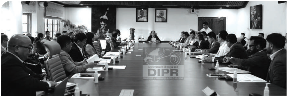
Chief Minister, Neiphiu Rio, dignitaries and officials during the monsoon preparedness meeting held at the CM Residential Complex, Kohima on 4 th May 2023.