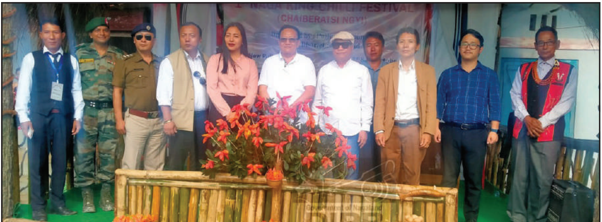
Former Chief Minister, T. R. Zeliang and other officials during the 1 st Naga King Chilli Festival held at Pulwa New village, Peren on 7 th October 2022.

Organized by PulwaLui Council the 1 st ever Naga King Chilli Festival (Chaiberatsi Ngyi) was held at Pulwa New Village, Peren on 7 th October 2022 with United Democratic Alliance, Chairman and former Chief Minister of Nagaland, T. R. Zeliang as the special guest.