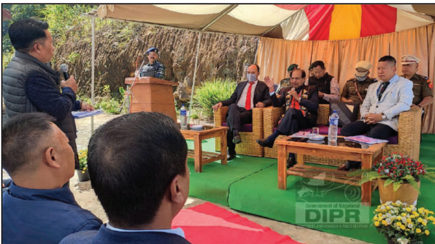
Governor of Assam and Nagaland, Prof. Jagdish Mukhi during an interactive meeting with district officers from various departments, NGOs/Hohos of Pochuri tribe at Avankhung on 29 th October 2022.

Governor of Assam and Nagaland, Prof. Jagdish Mukhi visited Avankhung village, under Meluri sub-division of Phek district on 29 th October 2022, and conducted series of interactive meetings with the district officers from various departments, NGOs/Hohos of Pochury tribe.