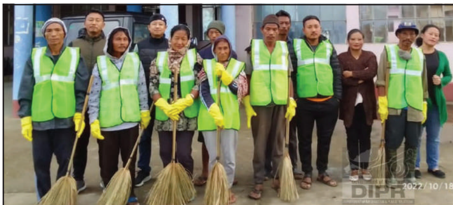
In order to promote cleanliness and hygiene, the Longleng Town Council launched the second phase of cleanliness & hygiene campaign at Longleng on 18 th October 2022.

continue its efforts by focusing on large scale public participation by sensitizing the society about the importance of community participation and working together towards making the town a better place to reside in.