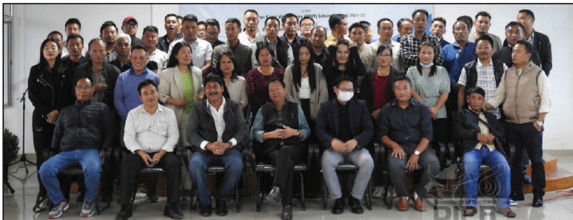
Department of Fisheries & Aquatic Resources (F&AR) conducted a State Level Training of Trainers (ToT) on 'Recent advances in fisheries technology & soft skill development' on 19 th and 20 th October 2022 at the Directorate, F&AR, Kohima.

Scientist & Head Division of Animal & Fisheries Science, ICAR, Research Complex, NEH Region, Meghalaya highlighted topics on Recent Advances on Aquaculture & Fisheries with special reference to hilly states, fish nutrition, and feed technology and recent advances in post-harvest technology.