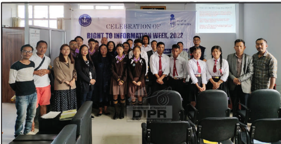
Tseminyu District RTI Week was observed at the Deputy Commissioner's official chamber, Tseminyu on 12 th October 2022.

Various public leaders, GBs, Village Council members, and officials from the