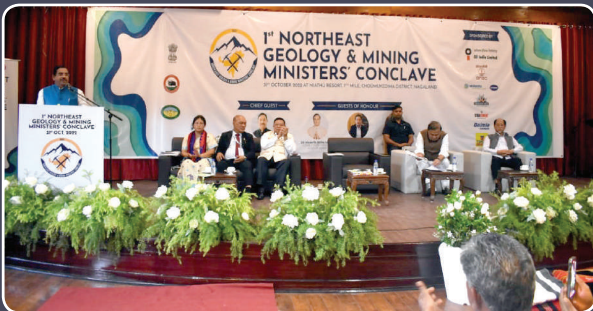
Union Minister of Mines, Coal and Parliamentary Affairs, Government of India, Pralhad Joshi addressing the gathering during the 1 st ever North-East Geology & Mining Ministers' Conclave held at Niathu Resort, Chümoukedima on 31 st October 2022.