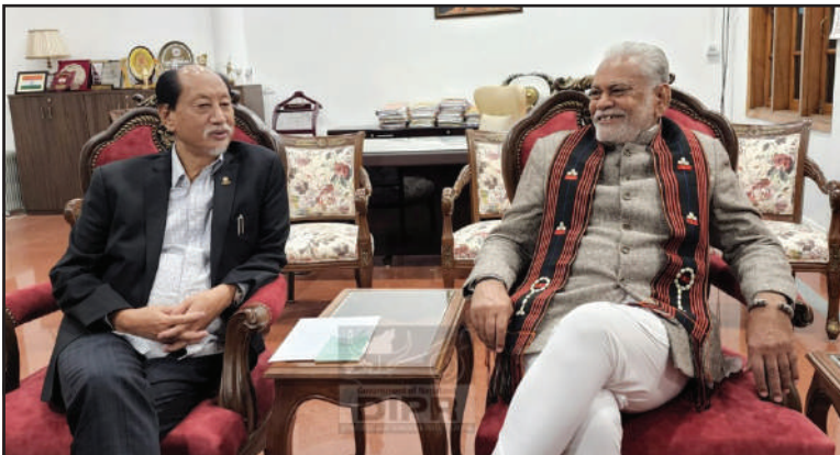
Union Minister, Parshottam Rupala called on the Chief Minister of Nagaland, Neiphiu Rio at his official residence on 20 th October 2022.

Officials to use modern and scientific technology for the welfare of the people through various