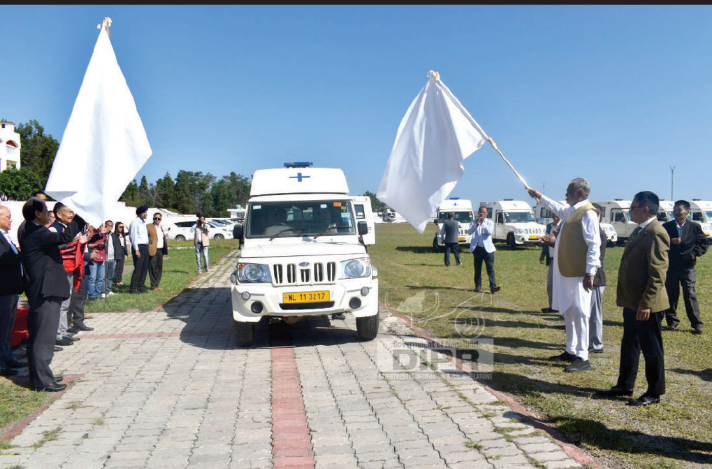
Union Minister, Fisheries, Animal Husbandry & Dairying, Parshottam Rupala and Chief Minister, Neiphiu Rio flagging off the Mobile Veterinary Unit at Secretariat Plaza, Nagaland Civil Secretariat, Kohima on 21 st October 2022.