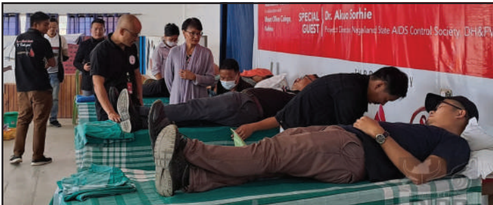
The National Voluntary Blood Donation Day was celebrated at Mount Olive College, Kohima on 1 st October 2022, organized by Voluntary Blood Donors Association Kohima.

The National Voluntary Blood Donation Day which falls on 1 st October 2022 every year, was celebrated at Mount Olive College Kohima with the theme 'Donating blood is an act of solidarity, join the effort to save lives,' organized by Voluntary Blood Donors Association Kohima.