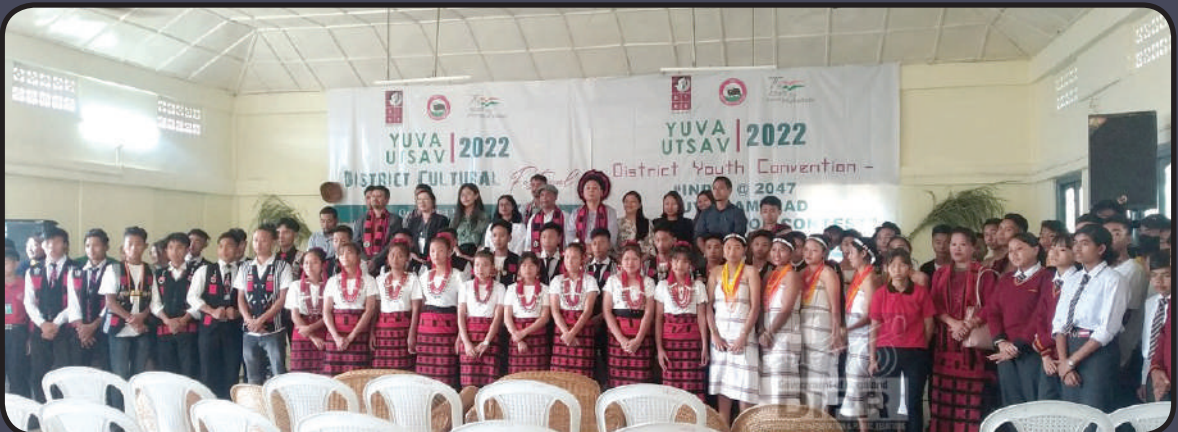
Nehru Yuva Kendra Sangathan, Kiphire conducted District Youth Convention under the theme 'Sense of duty among citizens' at Hopongkhyu Memorial Hall, Kiphire on 15 th October 2022.