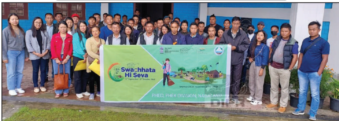
Public Health Engineering Department, Phek division observed Swachhata Hi Seva campaign on the theme 'Visual Cleanliness' from 15 th September to 2 nd October 2022.

Public Health Engineering Department, Phek division observed Swachhata Hi Seva campaign on the theme 'Visual Cleanliness' from 15 th September to 2 nd October 2022, aiming to generate greater community participation and reinforce the concept of 'Sanitation as everyone's business.' To kick off the campaign, Gram Sabha meeting on Open Defecation Free Plus elements and Swachhata Hi Seva was conducted in all four (4) blocks-Phek, Chozuba, Meluri, and Pfutsero under Phek district. The participants include Swachhagrahis and WATSANs from every village, also known as foot soldiers of the Swachh Bharat Mission.