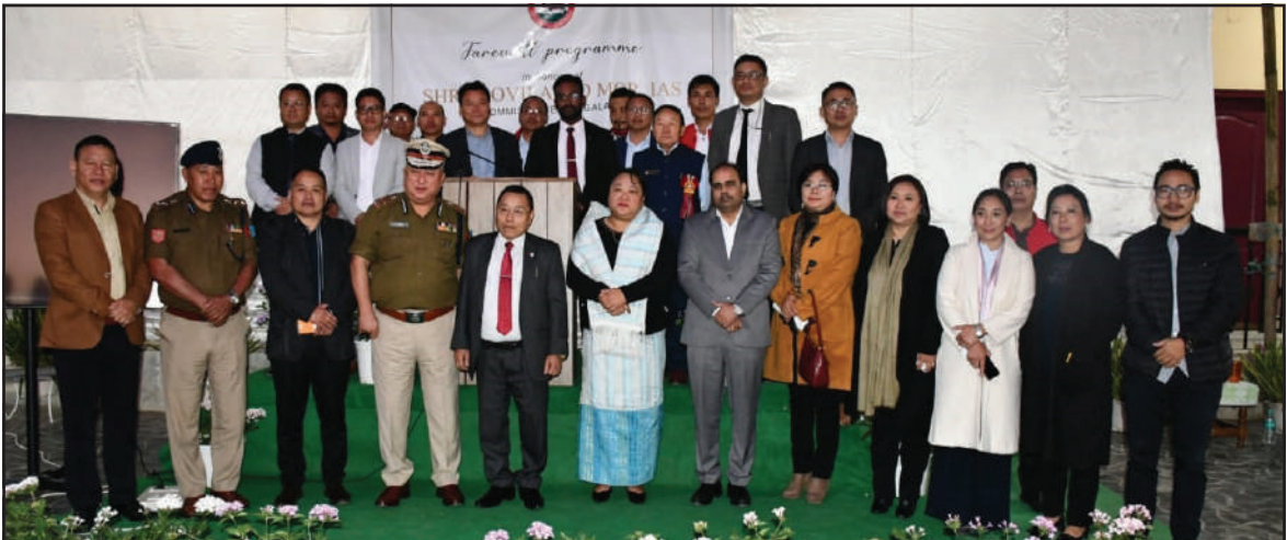
A farewell programme was held for the outgoing Commissioner, Nagaland, Rovilatuo Mor IAS on 31 st October 2022 at Commissioner's Office, Kohima.

The Commissioner's Office organized a farewell programme for the outgoing Commissioner, Nagaland, Rovilatuo Mor IAS on 31 st October 2022 at Commissioner's Office, Kohima.