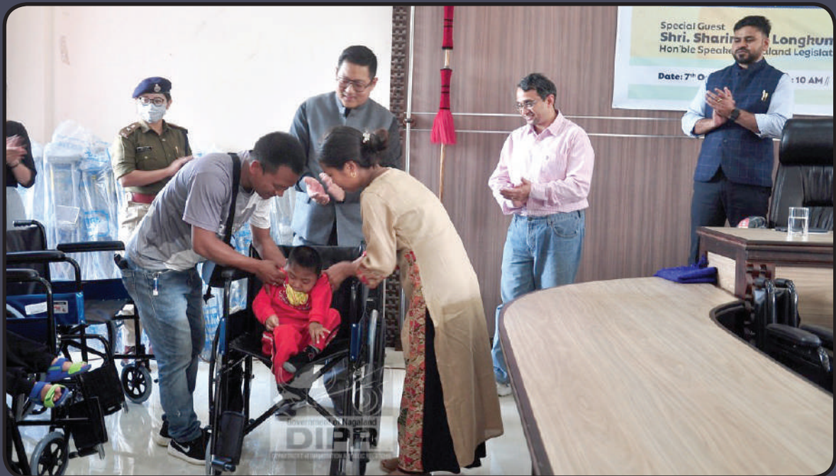
Assistive aids being distributed to differently abled persons in the presence of Speaker, Nagaland Legislative Assembly, Sharingain Longkumer at Deputy Commissioner's Conference Hall, Mokokchung on 7 th October 2022.