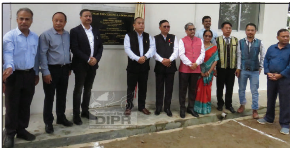
The 35 th Foundation Day celebration and Stakeholders Meet was held at ICAR-National Research Centre on Mithun at Medziphema on 15 th October 2022.

The 35 th Foundation Day celebration and stakeholders meet was held at ICAR-National Research Centre on Mithun at Medziphema on 15 th October 2022, with Neiba Kronu, Minister for Planning & Coordination, Land Revenue