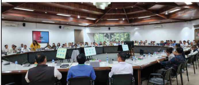
APC, Kikheto Sema IAS addressing the one-day workshop to promote entrepreneurship culture in Nagaland, conducted at Rhododendron Hall, Police Complex, Chumoukedima on 7 th October 2022.

Organized by Agri & Allied Departments and sponsored by the Ministry of MSME, Gol, a one-day workshop was conducted to promote entrepreneurship culture in Nagaland at Rhododendron Hall, Police Complex, Chumoukedima on 7 th October 2022.