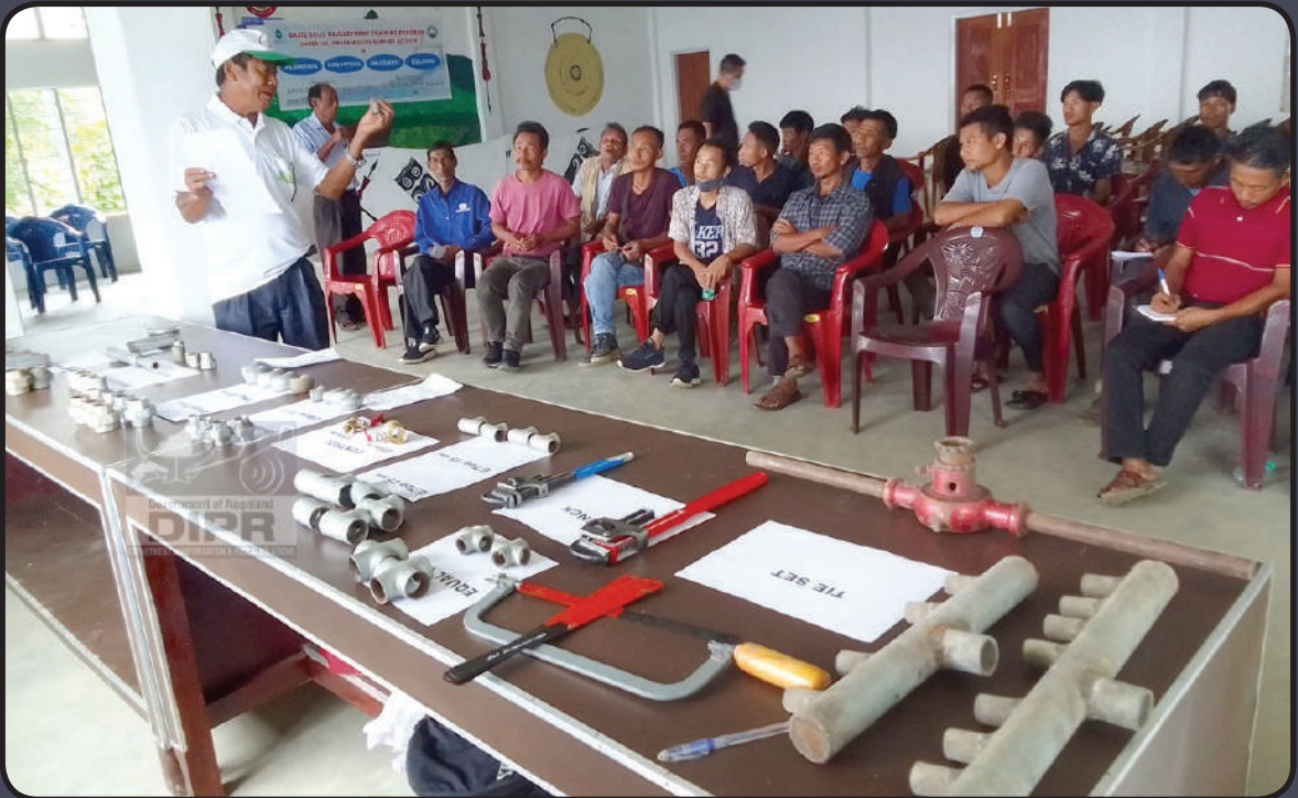
A community-level skill development training under Jal Jeevan Mission support activity was organized by Public Health Engineering Department, Longleng Division at VCC & VDB Conference Hall, Longleng on 8 th October 2022.