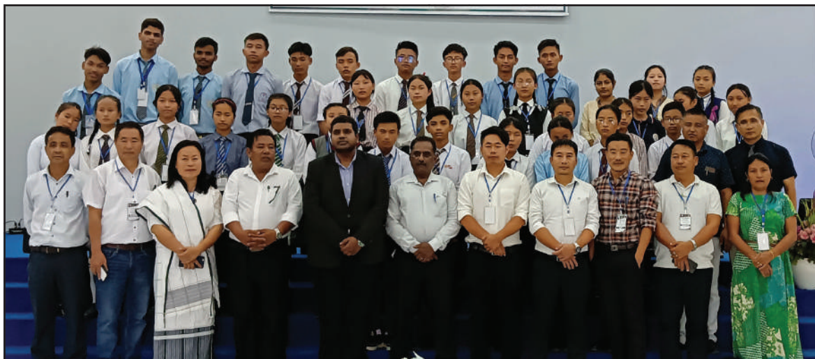
State Level Science Fair 2022, organized by the Directorate of School Education, Nagaland was held on 7 th October 2022 at Bethesda Higher Secondary School, Dimapur.