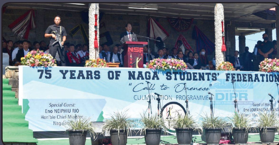
Chief Minister, Neiphiu Rio addressing the gathering during the celebration of 75 years of Naga Students' Federation at Naga Solidarity Park, Kohima on 29 th October 2022.