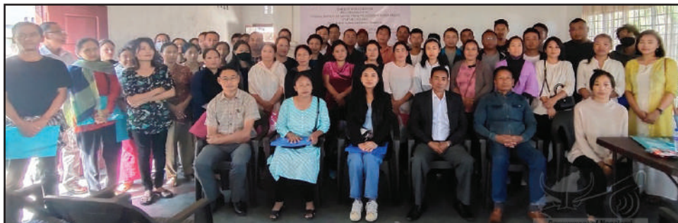
Officials and participants during the workshop on Pradhan Mantri Formalization of Micro Food Processing Enterprises (PM-FME) scheme held at Tseminyu town on 28 th October 2022.

One day workshop on Pradhan Mantri Formalization of Micro Food Processing Enterprises (PM-FME) scheme under the Ministry of Food Processing Industries (MoFPI) was organized by the Sub-District Industries Centre, Tseminyu under the Directorate of Industries & Commerce on 28 th October 2022 at the Conference Hall of Rengma Hoho Office, Tseminyu town.