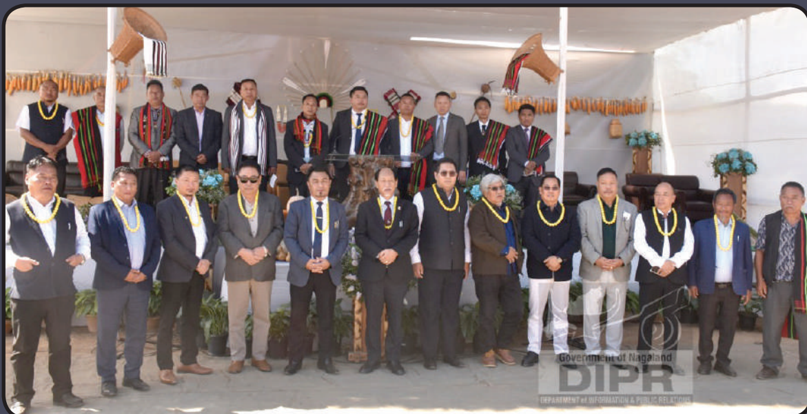
Chief Minister, Neiphiu Rio and other dignitaries during the inauguration of Kezoma Urban Station, Kohima on 28 th October 2022.