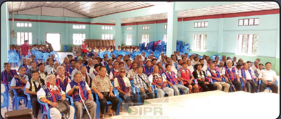
International Day of Older Persons was observed under the theme 'The resilience and contributions of older women' at Meluri, Phek on 1 st October 2022.