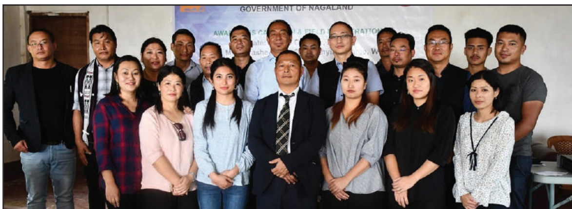
Nagaland Building & Other Construction Workers' Welfare Board organized awareness campaign and field registration at Old Riphim village, Wokha from 13 th - 15 th October 2022.

Nagaland Building & Other Construction Workers' Welfare Board (NBOCWVB) organized a three-day awareness campaign and field registration at Old Riphim Village, Wokha from 13 th - 15 th October 2022 at Mt. Morashen Hall. The programme was organized by Old Riphim Village Gazetted Officers Forum (ORGOF).