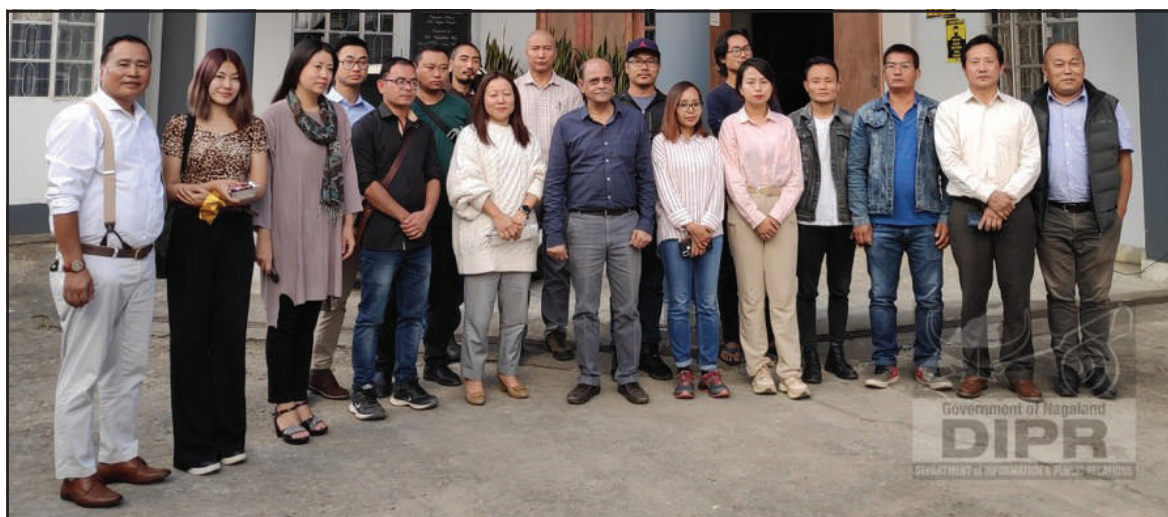
Valedictory programme of the five-day training on Smartphone Film was held at the Conference Hall of the Directorate of Information & Public Relations, Kohima on 21 st October 2022.