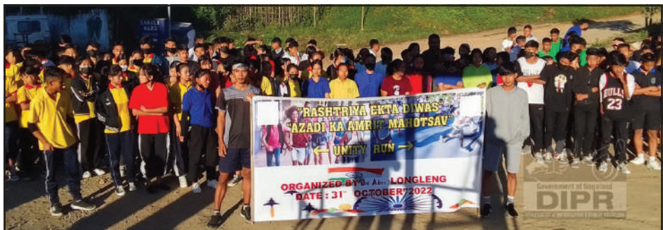
District Administration Longleng organised Unity Run on the eve of Rashtriya Ekta Diwas (National Unity Day) on 31 st October 2022 at Longleng.

Niuland District Administration organized the 'Run for Unity' to commemorate the birth anniversary of Sardar Vallabhbhai Patel at Niuland town on 31 st October 2022. Administrative staff, Police personnel, Dobashis, students, and public leaders started the Unity Run at the DC's Office, which culminated at GHSS.