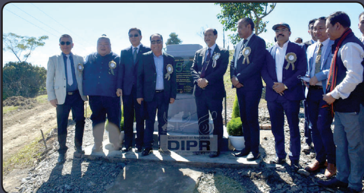
Khelhoshe Polytechnic Atoizu celebrated its 50 th year of establishment with Chief Minister, Neiphiu Rio as the special guest at Multipurpose Hall, Khelhoshe Polytechnic Atoizu, Zunheboto on 29 th October 2022.