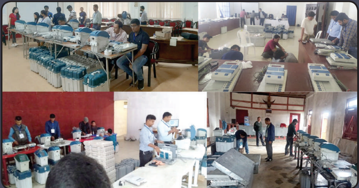
In view of the general election to Nagaland Legislative Assembly 2023, the first level checking of Electronic Voting Machine (EVM) and Voter Verifiable Paper Audit Trail (VVPAT) started in Nagaland on 11 th October 2022.