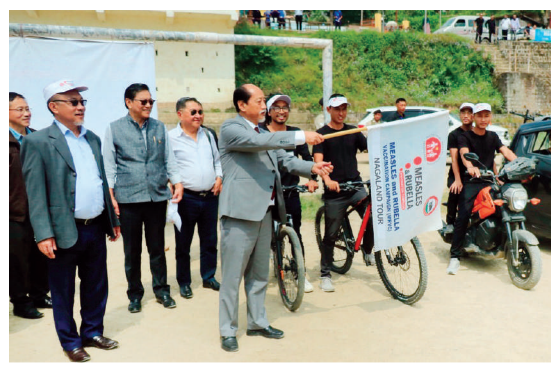
Chief Minister, Neiphiu Rio flagging off the Measles-Rubella rally at Seikhazou local ground during the MR launching programme at Neilhouzhu Kire GHSS, Kohima on 3^{rd} October 2018.