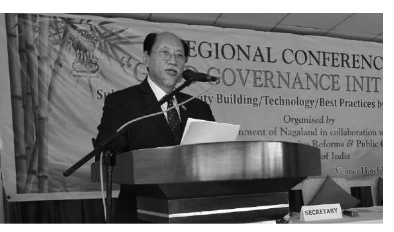
CM, Neiphiu Rio addressing the inaugural session of Regional conference on 'Good Governance Initiatives' at Hotel Vivor, Kohima on 10th October 2018.

sub-theme of the conference was "capacity building/ technology/ best practices by Aspirational Districts"