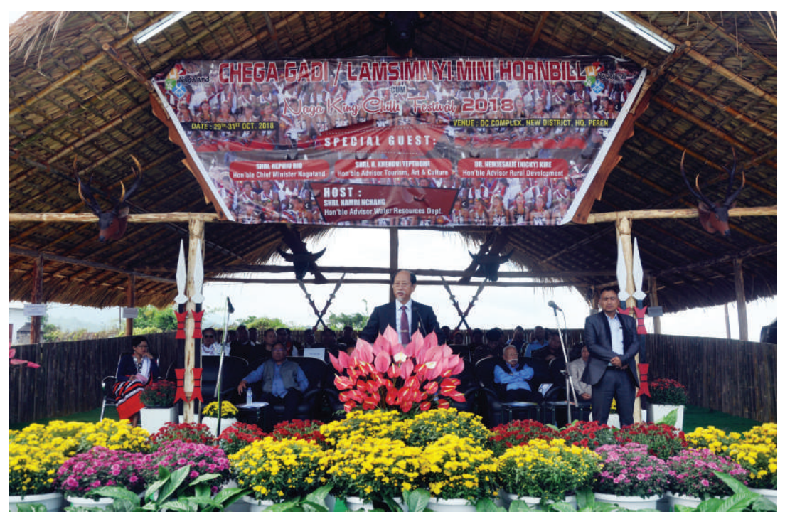
Chief Minister, Neiphiu Rio addressing the Chega Gadi Lamsimngi Mini Hornbill-cum-Naga King Chilly festival at New DC Office Complex, Peren on 29th, October, 2018.