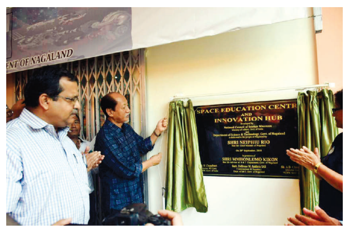
Chief Minister, Neiphiu Rio inaugurating the Space Education Centerand Innovation Hubat Nagaland Science Center, Dimapur on 28th September 2018.