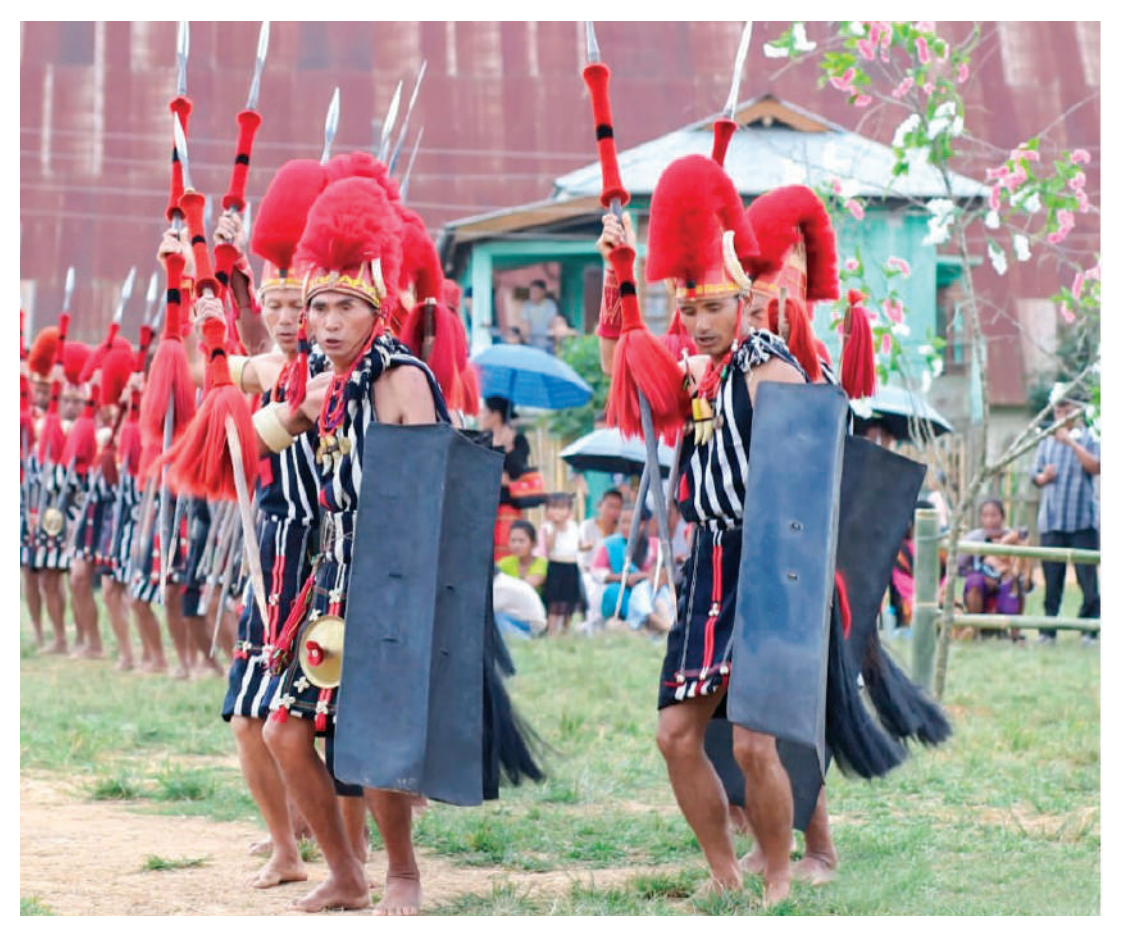
A cultural troupe performing traditional dance during Yemshe Mini Hornbill celebration at Meluri on 4th October 2018.