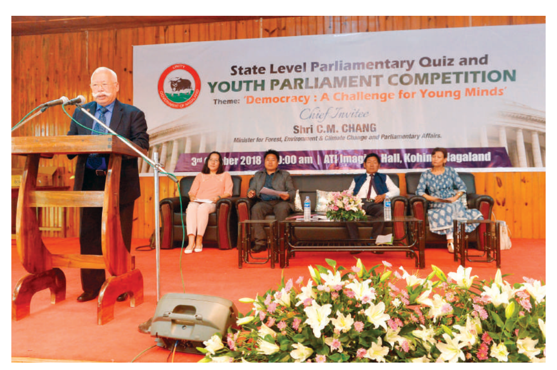
Minister, C.M. Chang addressing the State Level Parliamentary Quiz and Youth Parliament competition at ATI on 3<sup>rd</sup> October 2018.