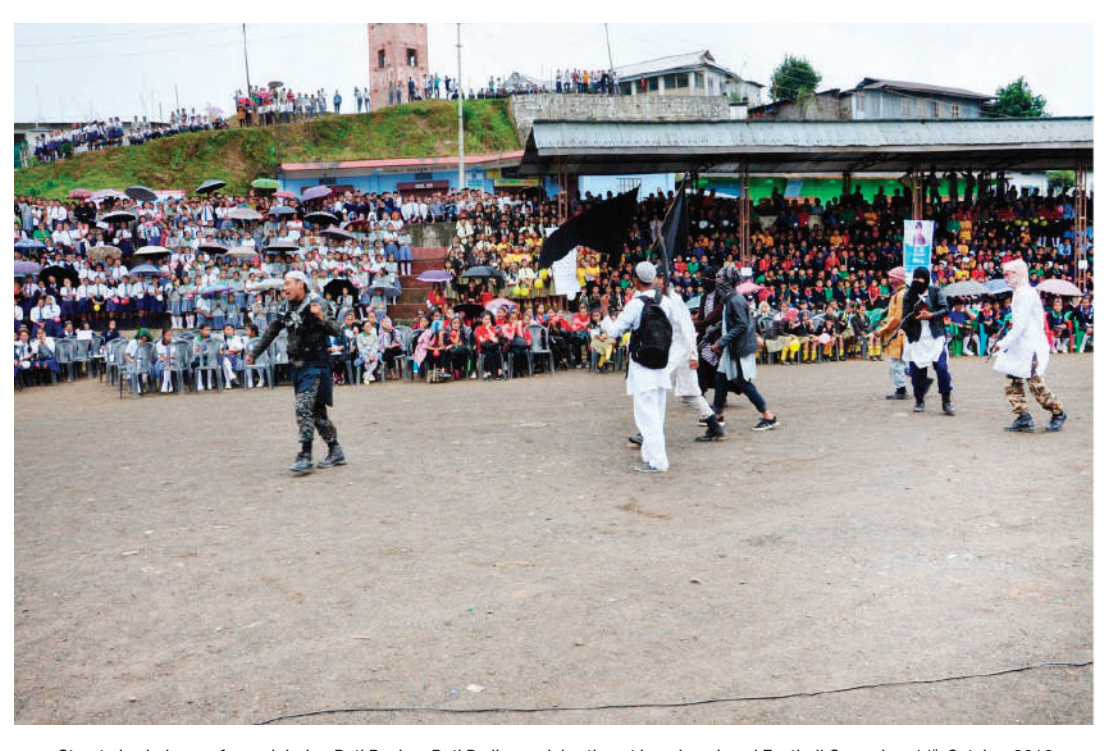
Street play being performed during Beti Bachao Beti Padhao celebration at Longleng Local Football Ground on 11th October 2018.