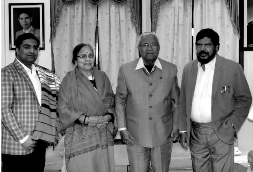
Governor, P. B. Acharya with Union Minister of State for Social Justice & Empowerment, Ramdas Athawale (right) at Raj Bhavan, Kohima on 18 th February 2019.

The Minister was scheduled to visit Mon for distribution of appliances for empowerment of Persons with Disabilities (PwDs) under the RVY scheme, however, bad weather prevented his chopper from landing