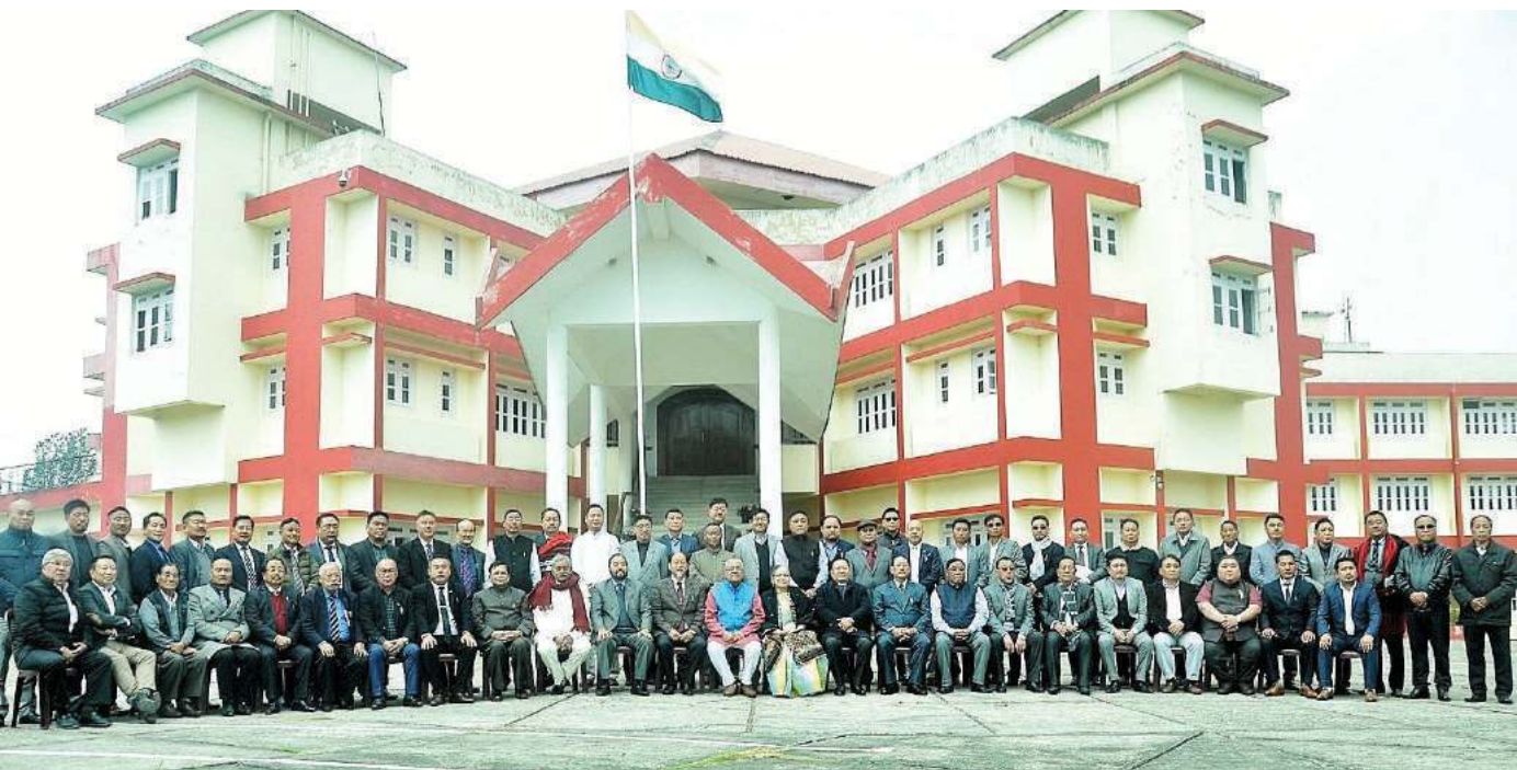
Chief Minister, Council of Ministers and other Members of the NLA with Governor P. B. Acharya and his wife during the 3 rd Session of the 13 th NLA at the 13 th NLA Secretariat, Kohima on 23 rd February 2019.