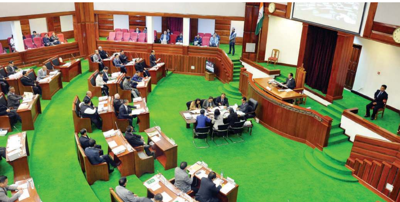
A scene from the 3 rd Session of the 13 th NLA on 22 nd February 2019.