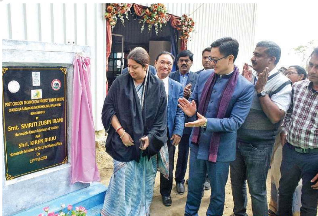
Union Minister of Textiles, Smriti Zubin Irani in the presence of Kiren Rijju, Minister of State for Home Affairs inaugurating the Post Cocoon Technology Project under North East Region Textile Promotion Scheme (NERTPS) at Sabangya, Chungtia, Mokokchung on 22 nd February 2019.