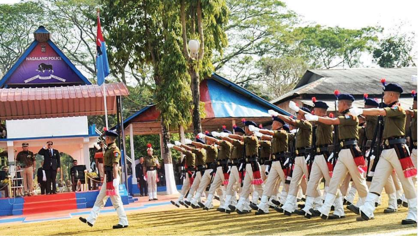
CM, Neiphiu Rio taking salute during the Ceremonial Attestation Parade of the 65 th batch Recruit Constables of DEF/PHQ/INT/NPTO and 15 th Mahila Battalion held at NPTS Parade Ground, Chumukedima on 16 th February 2019.