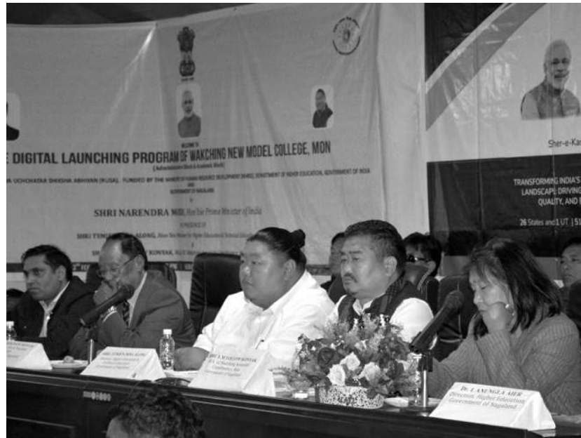
Prime Minister, Narendra Modi digitally inaugurating the new administrative and academic blocks of Wakching New Model College, Mon from Srinagar on 3 rd February 2019.