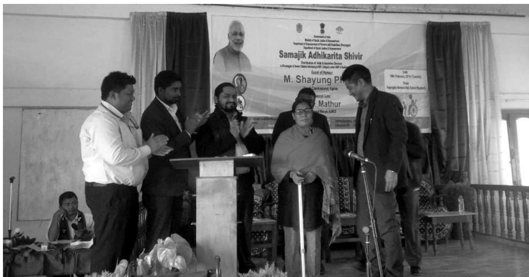
Disability and Assistive Devices distribution camp was held at Kiphire on 19 th February 2019.